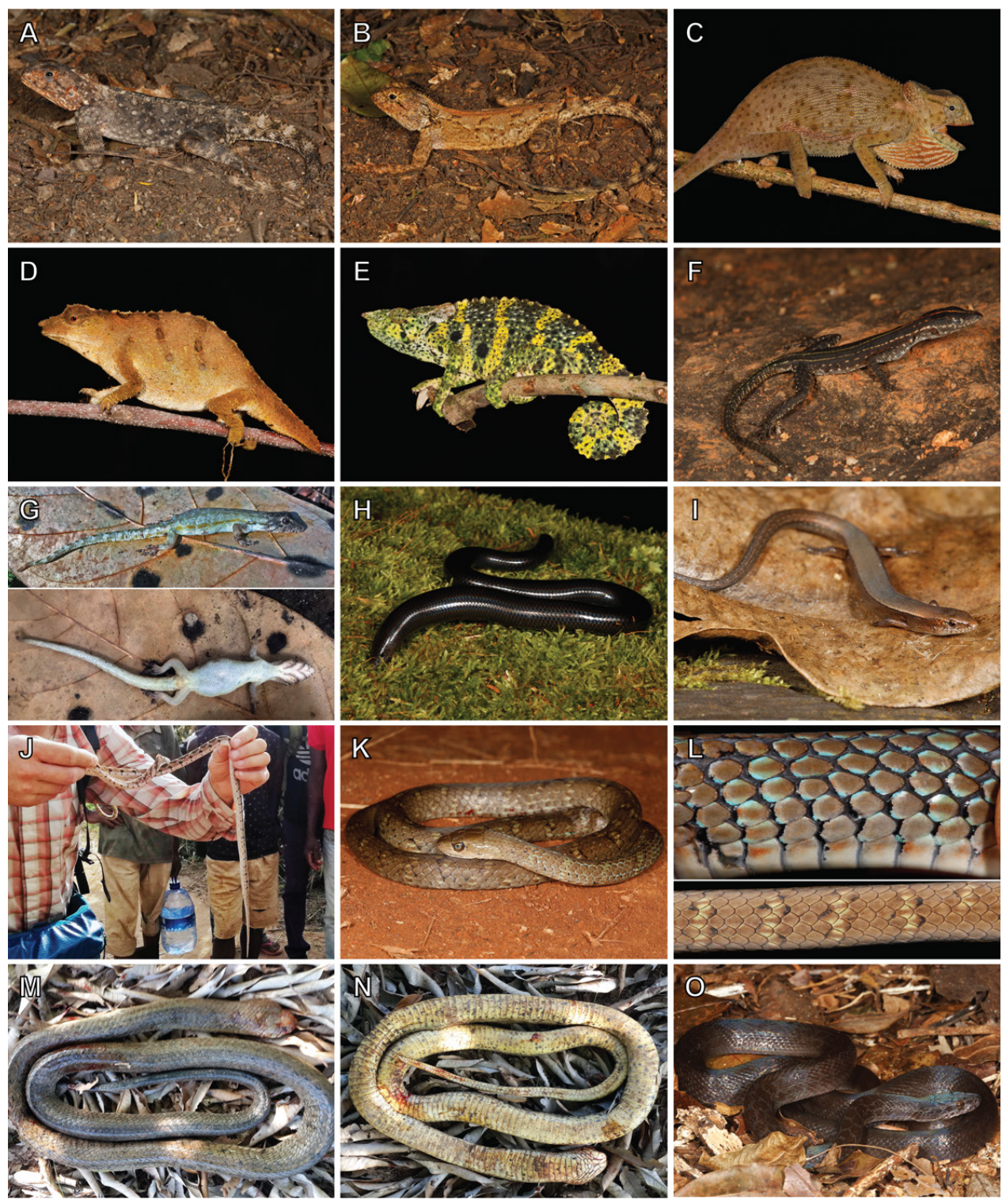
Fig. 4. Reptiles from Mount Lico and Mount Socone, northern Mozambique. (A) Agama kirkii ; (B) A. mossambica ; (C) Chamaeleo dilepis ; (D) Rhampholeon tilburyi ; (E) Trioceros melleri ; (F) Platysaurus maculatus ; (G) Lygodactylus sp.; (H) Melanoseps ater ; (I) Panaspis aff. maculicollis ; (J) Dasypeltis scabra ; (K–L) Philothamnus macrops ; (M–N) Naja subfulva ; (O) Boaedon fuliginosus .

these specimens (Fig. 4F) should belong to the nominal subspecies (Broadley 1965). These specimens also conform morphologically to P. m. maculatus in having six sublabials, the supranasals in broad contact, and the occipital absent. Comments. Specimens (only juveniles) were found on the granitic slopes of Mount Lico in