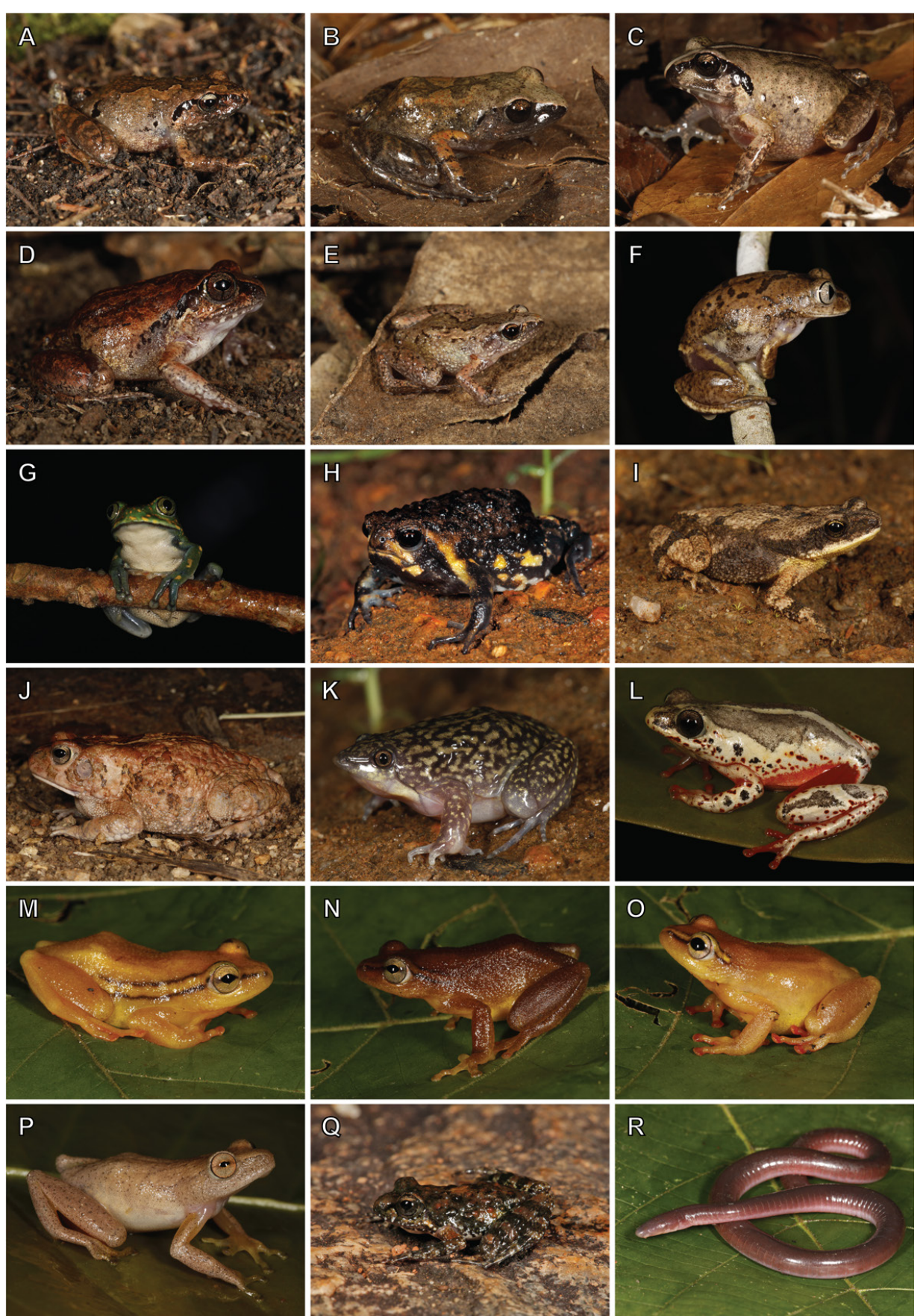
Fig. 3. Amphibians from Mount Lico and Mount Socone, northern Mozambique. (A) Arthroleptis aff. francei ; (B) Arthroleptis sp.; (C) A. stenodactylus (mountain form); (D) A. stenodactylus (lowland form); (E) A. xenodactyloides ; (F) Leptopelis broadleyi ; (G) L. flavomaculatus ; (H) Breviceps sp.; (I) Mertensophryne cf. loveridgei ; (J) Sclerophrys gutturalis ; (K) Hemisus marmoratus ; (L) Hyperolius marmoratus albofasciatus ; (M–O) H. substriatus ; (P) H. tuberilinguis ; (Q) Nothophryne sp.; (R) Scolecomorphus kirkii .