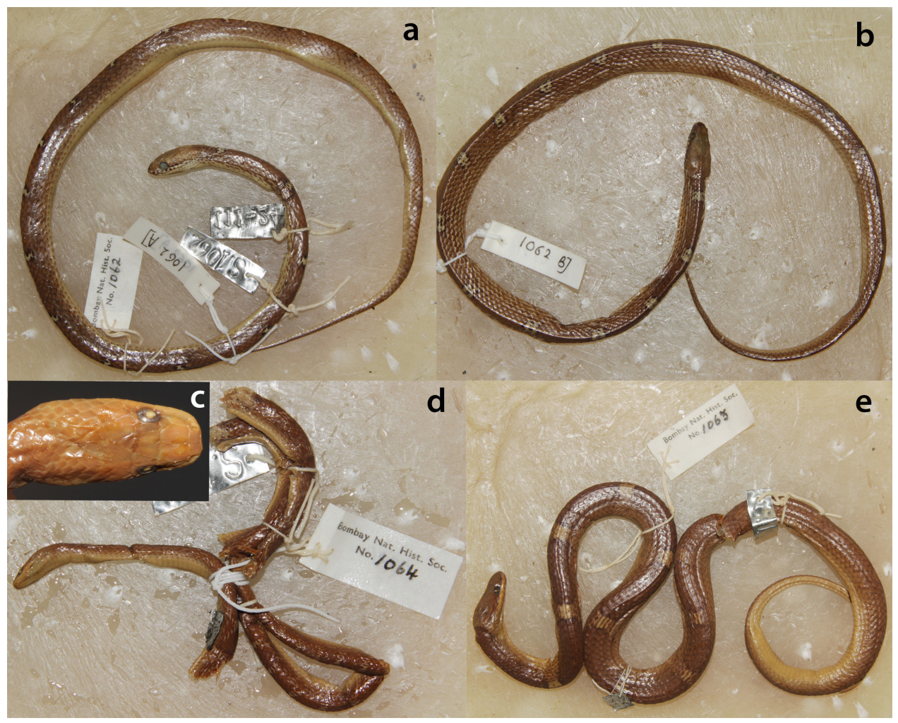
Fig. 4. Extralimital records re-identified as (a–b) Lycodon anamallensis (BNHS 1602a and b) and (c–e) Lycodon cf. aulicus (BNHS 1603 and 1604).

Like most members of the genus, this species is usually nocturnal, as the four active individuals were sighted at night during fieldwork. At least the juveniles are semiarboreal, and have been seen twice climbing trees and building walls, similar to the habits of some Lycodon species and especially Dryocalamus species (Smith 1943). Potential prey species (pers. obs. in other Lycodon species) recorded in the vicinity of these snakes are: Cnemaspis graniticola in Horsley Hills that were sleeping on the same building wall; and Hemiphyllodactylus jnana in Melagiri Hills, that were seen on plants near roadsides (also see Agarwal et al. 2019, 2020).