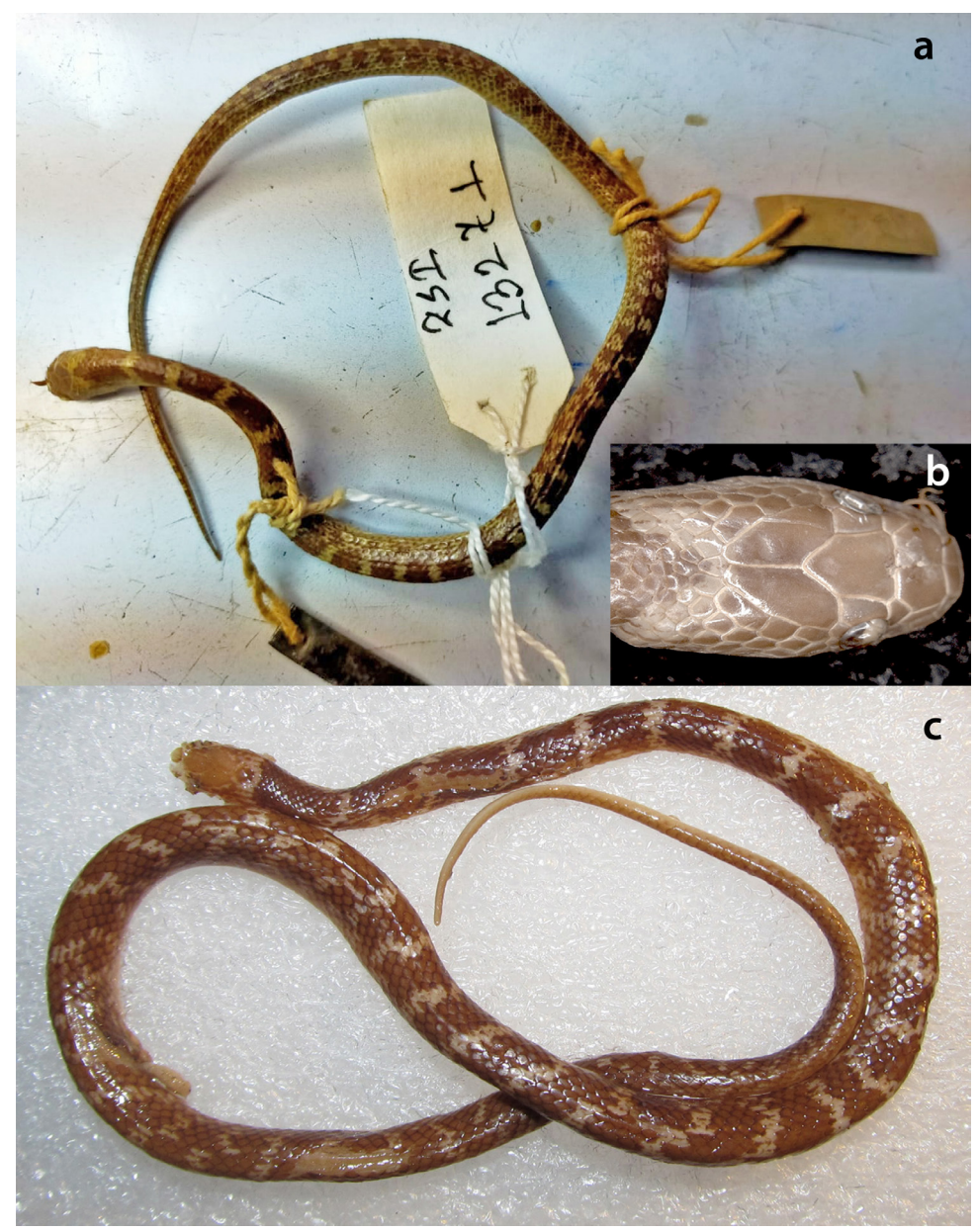
Fig. 2. Lycodon deccanensis sp. nov. in preservative: (a–b) entire and head closeup (inset) of Paratype ZSI 13271; (c) entire view of SACON/VR-93.

frontal (preocular separating frontal, prefrontal, and supraocular in one case); dorsum brown in adults and black in juveniles, with white cross bars.