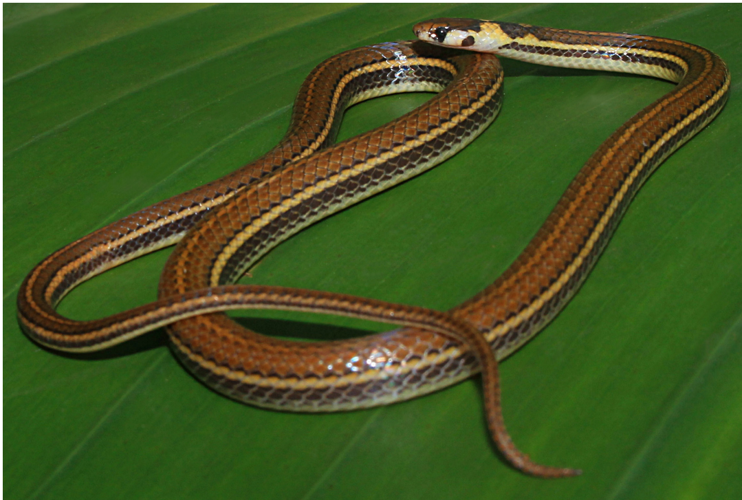
Fig. 1. Dorsolateral view of the holotype of Tantilla lydia sp. nov. (UVS-V 1189) in life.

The description of the hemipenis follows the descriptions of T. psittaca (McCranie 2011b), T. olympia (Townsend et al. 2013), and T. hendersoni (Hofmann et al. 2017).