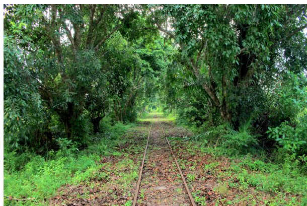
Fig. 4. Type locality and surrounding habitat for Tantilla lydia sp. nov. showing the train tracks where the holotype was collected, Comunidad de Salado Barra, La Unión, Departamento de Atlántida, Honduras.