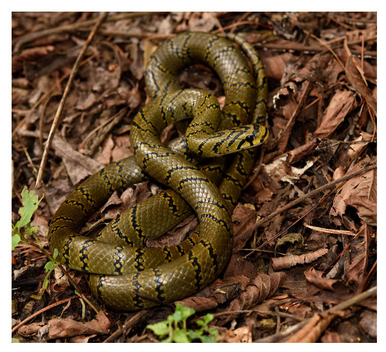
Fig. 2. Dorsal view of Euprepiophis perlaceus captured in Foping County, Hanzhong Prefecture, Shaanxi Province, China.