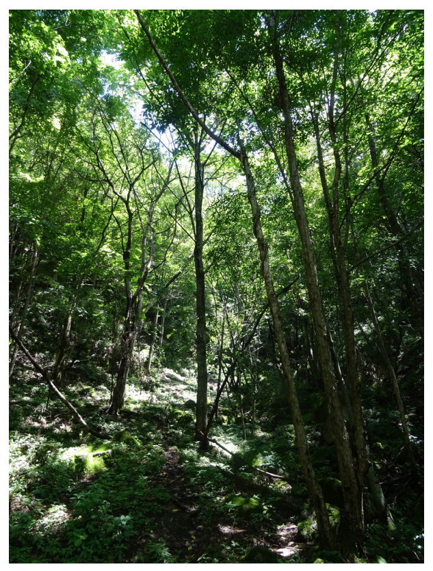
Fig. 3. View of the Euprepiophis perlaceus habitat in Foping, Shaanxi Province, China.