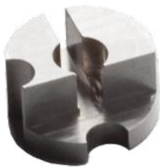
AutoGrid Alignment Tool