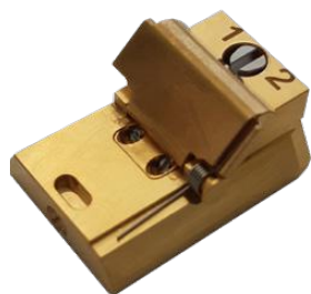
Cryo-FIB AutoGrid Shuttle