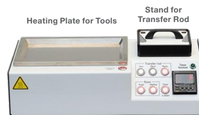
Preparation Station Controller (pumping, venting, heating operations)

Find out more at thermofisher.com/EM-Sales