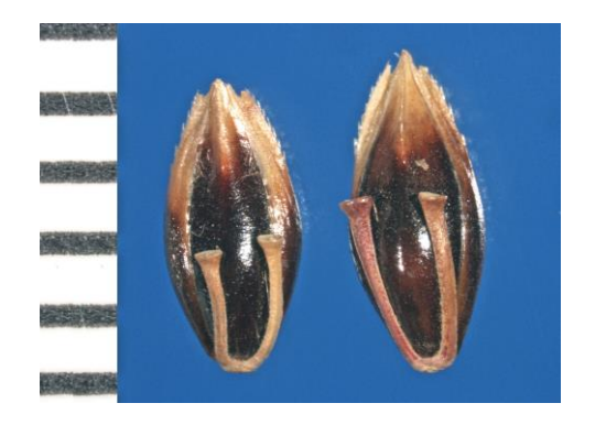
Figure 11. Johnsongrass spikelets with disarticulating inflorescence branches that have cup-shaped tips on their pedicel and rame segments.

Johnsongrass, S. halepense is listed as a noxious weed in some states (USDA, 2010) and as a restricted noxious weed seed in the California Seed Law (CCR 3855). It is a perennial grass native to the Mediterranean area, purposefully introduced into the United Stated as a once desirable pasture and hay crop. The plant spreads by seeds (spikelets, caryopses) and creeping underground stems (rhizomes) (figures 11-12). The seeds can remain viable in the ground for over two years making eradication of the plants extremely difficult. The plant's rhizomes are thick and fleshy with many scars where the leaves would be attached (nodes). These rhizomes present a special problem in that routine cultivation practices chop up the rhizomes into many reproductive units each with the capability of producing a new plant. The spikelets are 3.8-6.5 mm long and 1.5-2.3 mm wide readily disarticulating usually below the sessile spikelets and sometimes below the pedicellate spikelets. Caryopses are not exposed at maturity (Barkworth, 2003).