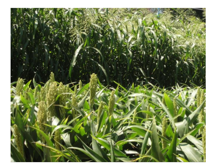
Figure 2. Difference in growth habit of grain sorghum (foreground) and sudangrass (background).

The inflorescence in sorghum consists of a spikelet pair and a rame internode that extends from the sessile spikelet to the next most distal sessile spikelet (Barkworth, et al. 2003). The inflorescence branch (rame) usually disarticulates between sets of spikelet pairs at the rame nodes (figure 3). Within the spikelet pair the sessile spikelet contains one sterile or staminate and one bisexual floret, while the pedicellate spikelet consists of a pedicel and a rudimentary spikelet. The sessile spikelet is dorsally compressed and has two firm glumes, the lower is larger than the upper and together conceal the florets. Within the sessile spikelet the lemma of the sterile floret and the lemma and palea of the fertile floret are hyaline and the fertile lemma may be awned (figure 4).