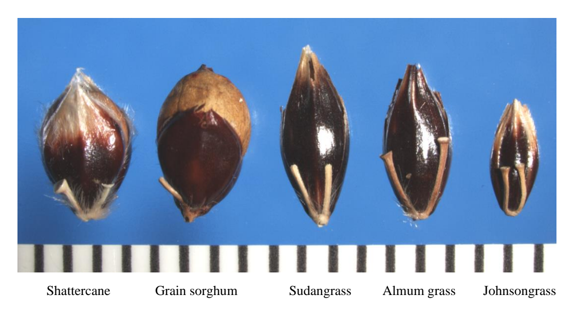
Figure 14. Size comparison of fertile spikelets of shattercane, grain sorghum, sudangrass, almum grass, and johnsongrass.

Figure 14 is a comparison of the spikelets of the different sorghum types discussed here. Note the variation of shape, exposure of the caryopsis and tips of the inflorescence branches