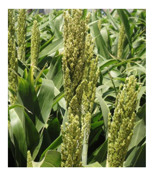
Figure 1. Grain sorghum with dense inflorescence.

The sorghums are annual or perennial plants belonging to the portion of the grass family in which species are canelike resembling corn. The flowers are wind-pollinated and eventually develop hard dry fruits (caryopses) enclosed within the persistent glossy glumes. There are approximately 25 species of Sorghum , none of which are native to the United States; however, Sorghum bicolor (L.) Moench and Sorghum halepense (L.) Pers. have been introduced (Barkworth, 2003). The cultivation of sorghum started in Africa between 3000 and 4000 B.C. in the Ethiopian highlands (Doggett, 1976). Sorghum was brought to the United States in the 1800s where it was first grown along the Atlantic coast and then moved westward into areas that were too dry for corn. Since its introduction the crop has greatly changed, the changes resulting from natural mutation and plant breeding. Sorghums grown in the United States are classified according to their use. Plants used for grain are classified as sorgos, plants used for brushes and brooms are classified as broomcorns and plants used for hay and pasture are classified as grass sorghums (Poehlman, 1959). Figure 1 shows the dense inflorescence of grain sorghum, while figure 2 shows the contrast in growth habit between grain sorghum and sudangrass.