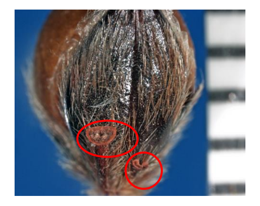
Figure 8. Shattercane spikelets disarticulate at maturity, as evidenced by the cup-shaped tip of the pedicel and rame segment.

Sudangrass, S. bicolor nothosubsp. drummondii is an annual plant used for hay. The plant and its spikelets are similar in appearance to johnsongrass and almum grass but it does not produce rhizomes. The spikelets are 5-6 mm long and usually tardily disarticulate from the inflorescence branches. Unlike grain sorghum the caryopses are completely enclosed by the glumes at maturity (Barkworth, 2003) (figures 9-10).