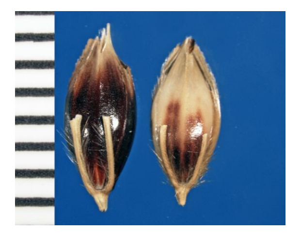
Figure 9. Sudangrass spikelets non-disarticulating inflorescence branches commonly observed in harvested product.

Sudangrass, S. bicolor nothosubsp. drummondii is an annual plant used for hay. The plant and its spikelets are similar in appearance to johnsongrass and almum grass but it does not produce rhizomes. The spikelets are 5-6 mm long and usually tardily disarticulate from the inflorescence branches. Unlike grain sorghum the caryopses are completely enclosed by the glumes at maturity (Barkworth, 2003) (figures 9-10).