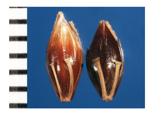
Figure 13. Almum grass spikelets with disarticulating inflorescence branches; note the cup-shaped tips of the pedicel and rame segments as in johnsongrass figure 11.

Almum grass, Sorghum × almum Parodi is listed as a noxious weed in several states (USDA, 2010) and as a restricted noxious weed seed in the California Seed Law (CCR 3855). Parodi first described the plant in 1936 as a hybrid between johnsongrass that has at least 55 morphologically distinct vegetative types in this country alone (Duke, 1998) and cultivated sorghum with its numerous cultivars. The hybrid produced is a perennial plant with short curving rhizomes and erect culms. In the 1950's this hybrid was grown as a forage crop in the Midwest (Eberlein, 1988). There are many derivatives produced from this hybridization and S . × almum is just one (Barkworth 2003). In warmer areas of this country almum grass can be a short lived perennial with rhizomes that can create control problems, however, the main problem with controlling this grass is the shattering of its inflorescence at maturity. As shown in figure 13, the spikelets are slightly larger than johnsongrass (Duke, 1998) and readily disarticulate at maturity. The caryopses are not exposed as in grain sorghum (Barkworth, 2003).