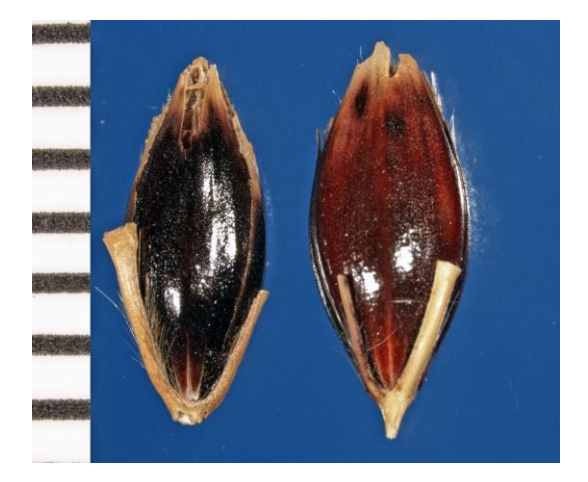
Figure 10. Sudangrass spikelets after full maturity start disarticulating.