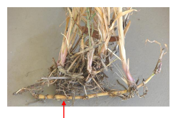
Figure 12. Johnsongrass rhizome with roots and culms.

Almum grass, Sorghum × almum Parodi is listed as a noxious weed in several states (USDA, 2010) and as a restricted noxious weed seed in the California Seed Law (CCR 3855). Parodi first described the plant in 1936 as a hybrid between johnsongrass that has at least 55 morphologically distinct vegetative types in this country alone (Duke, 1998) and cultivated sorghum with its numerous cultivars. The hybrid produced is a perennial plant with short curving rhizomes and erect culms. In the 1950's this hybrid was grown as a forage crop in the Midwest (Eberlein, 1988). There are many derivatives produced from this hybridization and S . × almum is just one (Barkworth 2003). In warmer areas of this country almum grass can be a short lived perennial with rhizomes that can create control problems, however, the main problem with controlling this grass is the shattering of its inflorescence at maturity. As shown in figure 13, the spikelets are slightly larger than johnsongrass (Duke, 1998) and readily disarticulate at maturity. The caryopses are not exposed as in grain sorghum (Barkworth, 2003).