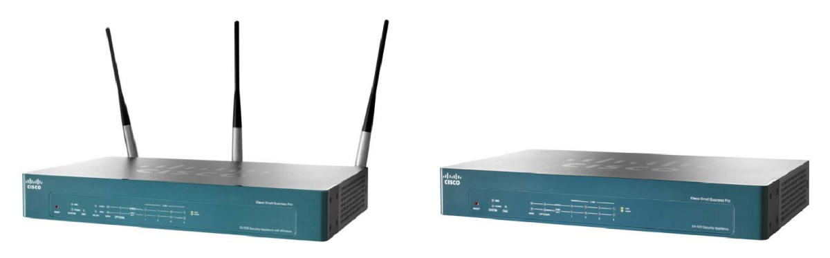
Figure 3. Cisco SA 500 Series Security Appliances, the SA 520W and the SA 520

Figure 3 shows the Cisco SA 500 Series Security Appliance with and without wireless connectivity.