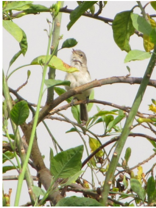
1. Least Bell's Vireo Vireo bellii pusillus [E] (resident songbird) nesting