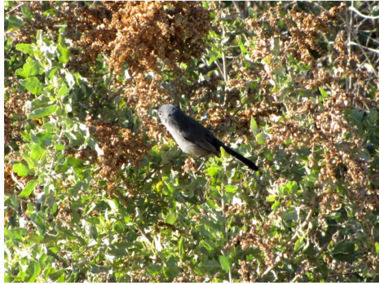
2. Coastal California Gnatcatcher Polioptila californica californica [T] (migratory songbird) nesting at nearby Playa del Rey Dunes at LAX