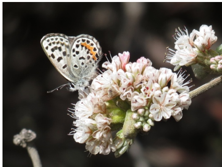
3. El Segundo Blue Butterfly Euphilotes battoides allyni [E] reproducing in dunes at BWER; also reproducing in PDR Dunes at LAX