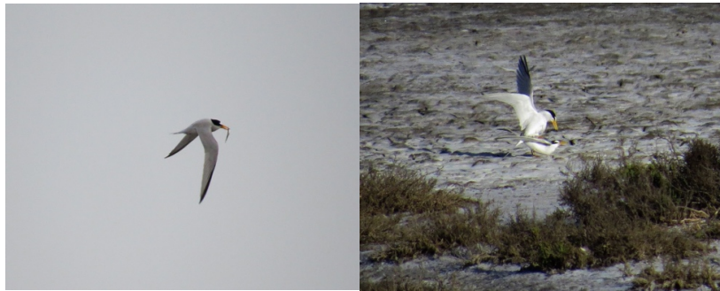
4. California Least Tern Sterna antillarum browni [E] (migratory shorebird – migrates from Guatemala and southern Mexico; nests on nearby Venice Beach in specially fenced preserve; feeds on fish in the shallow water sloughs and in Ballona Creek; mating documented on salt pannes)