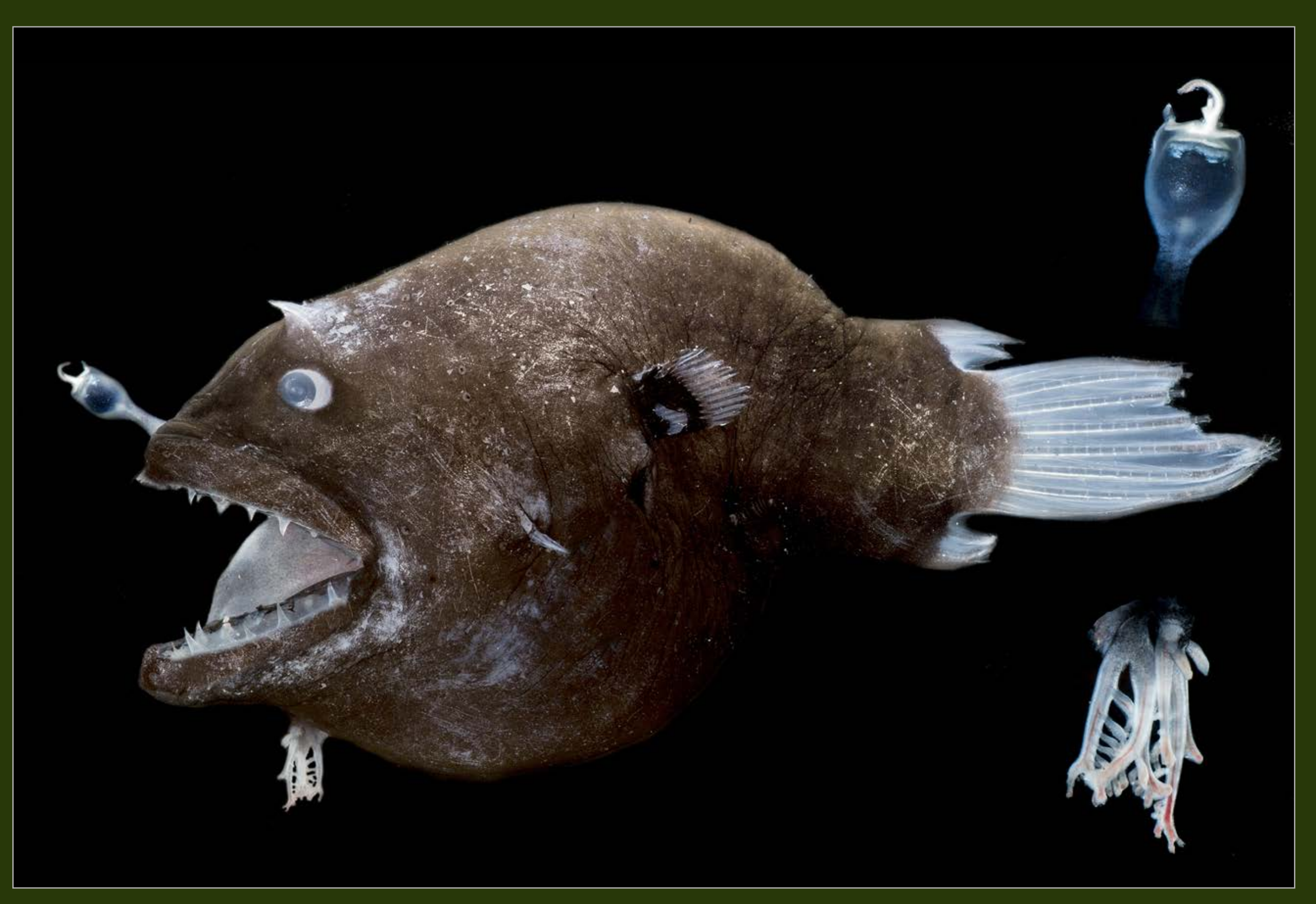
A profile shot of a Bearded Seadevil, Linophryne sp. B, trawled from between 1,500 meters depth and the surface, with a close-up of the esca in the upper right hand corner and a close-up of the "beard" in the lower right hand corner.