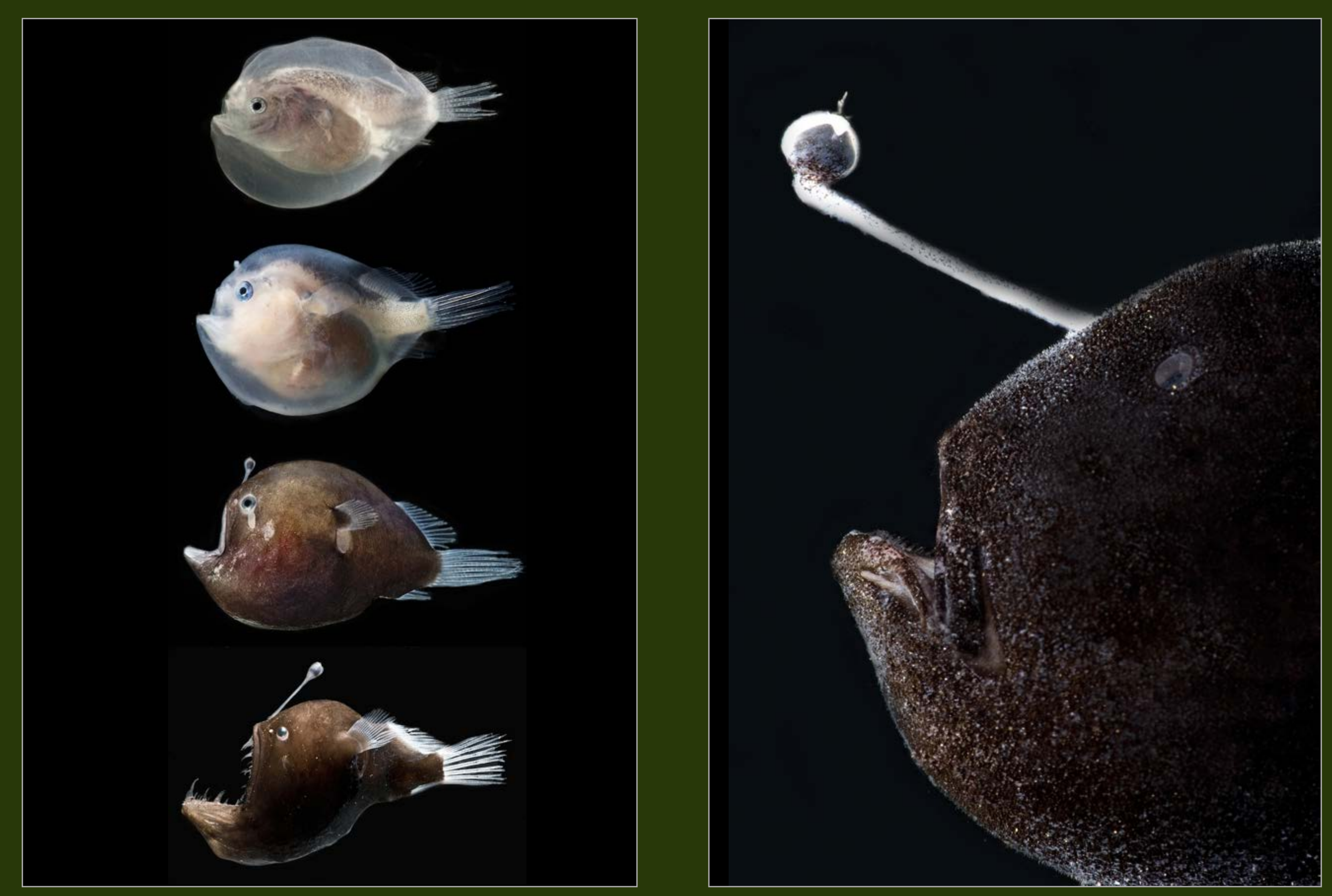
Left, development of the Black Seadevils, Melanocetus sp., from the Gulf of Mexico. Early stages of the illicium and esca in the top three fishes and mature female fish at the bottom. Right, the Triplewart Seadevil, Cryptopsaras couseii , from 1,000 meters depth, has a blueberry shaped esca sitting stop a moderate length illicium .