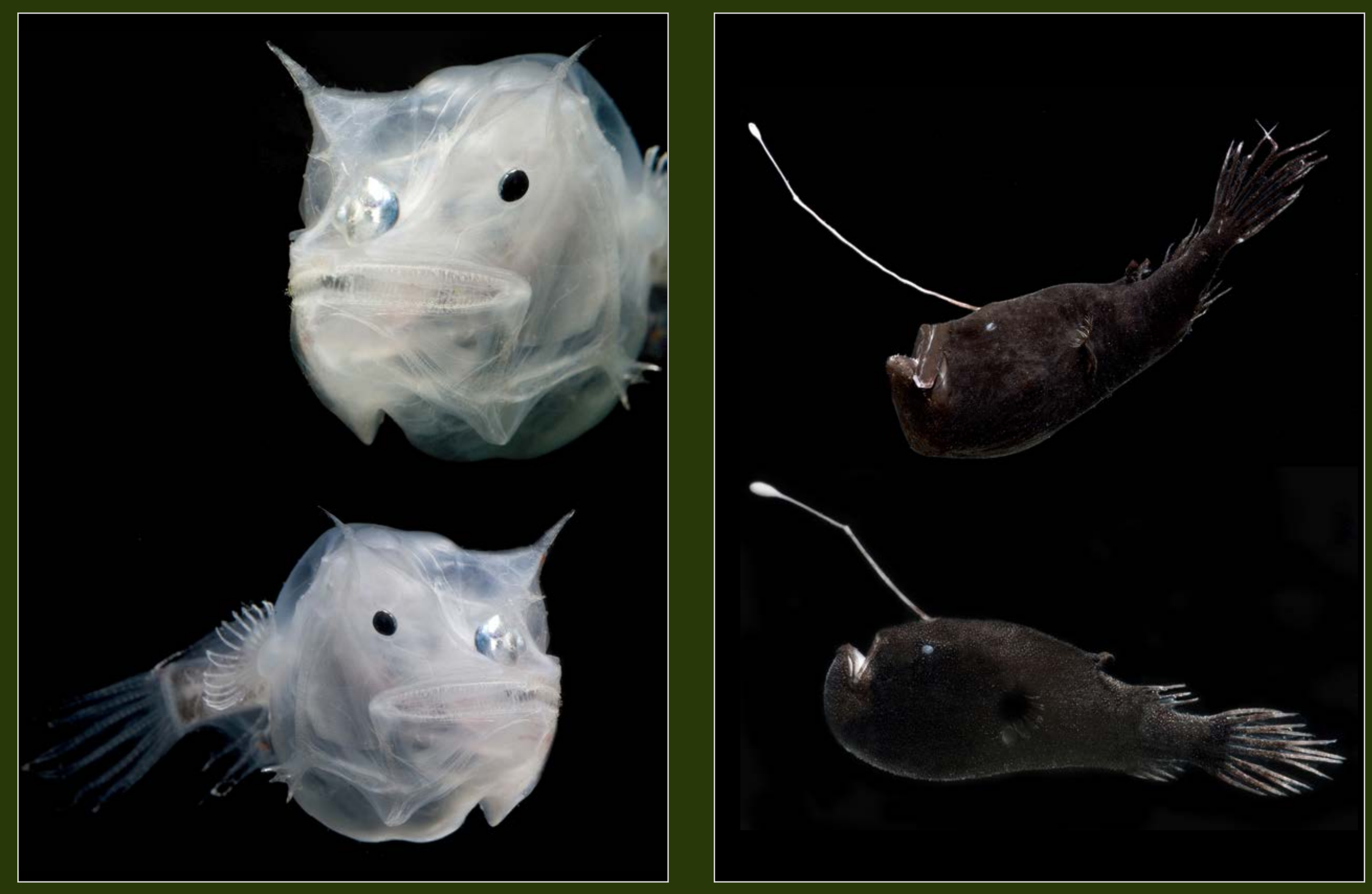
Left, Ghostly Seadevil Haplophryne mollis trawled from 1,200 meters depth, taken on research cruise organized by Dr. J. Torres; right, two adult female Doublewart Seadevils Ceratias sp. The top one was trawled from between 1,000 and 600 meters depth. The bottom one was trawled from between 600 and 200 meters depth.