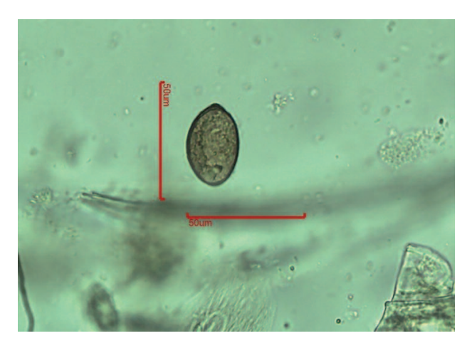
Fig. 5. Trematoda egg from Tiliqua gigas