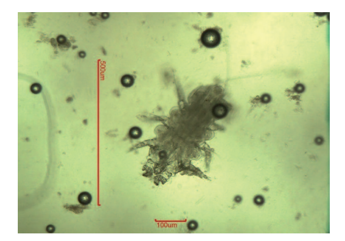
Fig. 7. Myobia musculi (Acari) from Lampropeltis polyzona

specimen of Pituophis catenifer (Fig. 7). All of the pseudoparasites were derived from the crickets and rodents eaten by the reptiles.