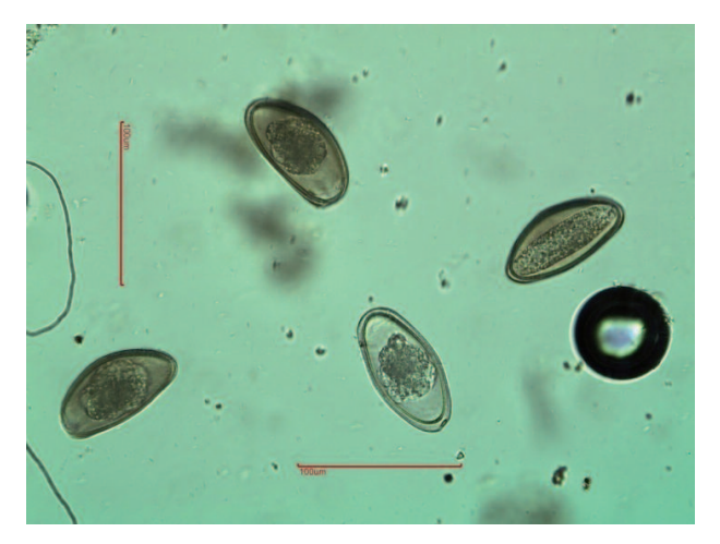
Fig. 3. Pharyngodonidae (Oxyurida) eggs from Pogona vitticeps

tortoises from the Zoological Garden. Rhabditoidea eggs were found in 7.7% of samples (Fig. 4). Larvae were present in the fecal samples from one specimen of Python regius , obtained from a pet shop.