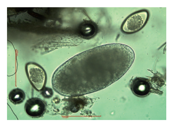
Fig. 6. Mesostigmata (Acari) egg from Eublepharis macularius

Trematoda eggs were detected in the faeces of two specimens of Tiliqua gigas from a private owner (Fig. 5). The intensity was found to be 90 EPG.