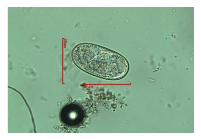
Fig. 4. Rhabditoidea egg from Chamaeleo calyptratus

Only one of the 91 examined specimens, an Iguana iguana , was infected by the Ascarididae family. The intensity of infection was 20 EPG.