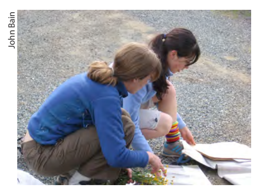
Collecting plants at Josephine County in Oregon.