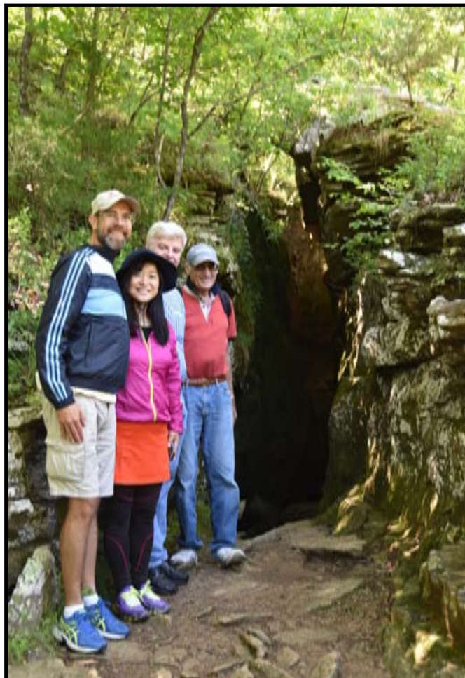
Hikers at crevice area of Devil's Den State Park.

Devil's Den State Park includes caves and crevices associated with a unique sandstone crevice area that is the