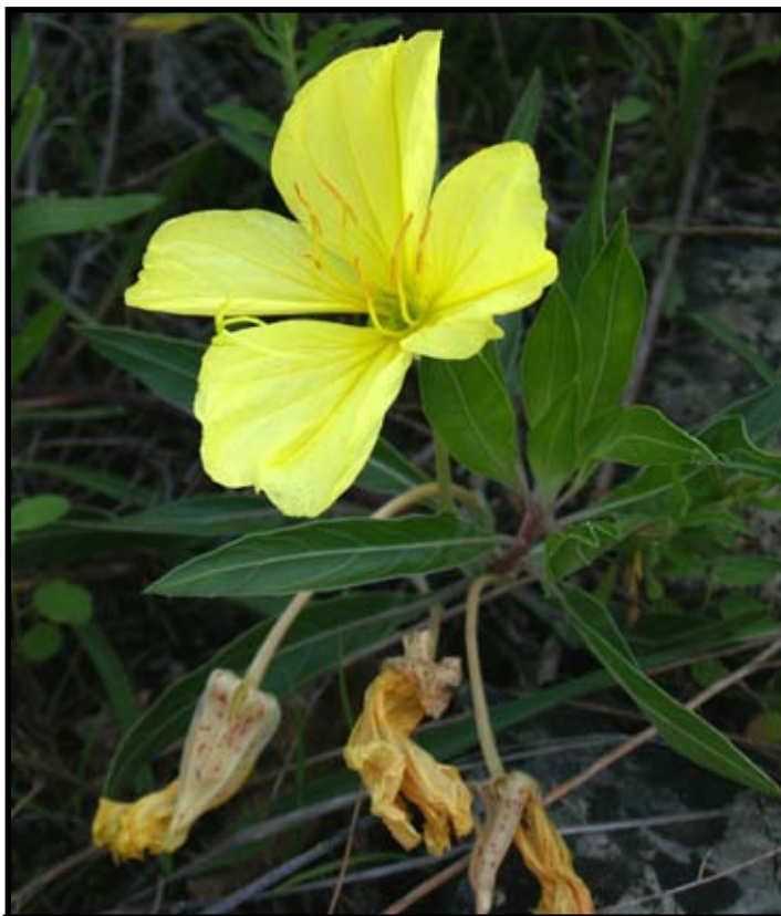
Oenothera macrocarpa (Missouri Evening Primrose) is a species that indicates ecological complexity and intact stability on calcareous glade communities.

floods, droughts, fire, or spikes in predation. They may also come through the processes of relocation via feet, wing or seed. Ecologists call events that induce these evolved responses "stress". And while stress may have temporarily negative effects on a population at any given place at any given time, over long periods of time, species are able to endure or relocate. In a fascinating twist of fate, it is from the very processes of stress, that any given natural system stabilizes, accumulates a wealth of species, and ultimately resonates with ecological complexity. A typical Ozark fen, for example, simultaneously harbors species remnants from the last glacial maximum, coastal plain species that were relocated during