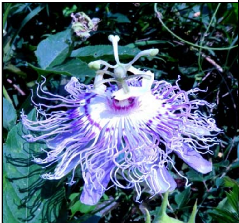
Maypops ( Passiflora incarnate )