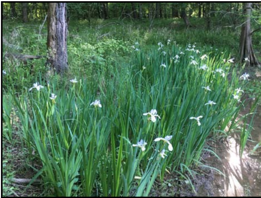
A stand of blue flags ( Iris virginica ) along the edge of the Little Maumelle River.

cup oak ( Q. lyrata ) but there are also some uncommon species like bur oak ( Q. macrocarpa ), pin oak ( Q. palustris ), and, in slightly elevated areas, cherrybark oak ( Q. pagoda ). Nutmeg hickory is uncommon in Arkansas but is locally common in these flatwoods. The reigning state champion (largest) nutmeg hickory is found along a trail in Burns Park near the covered bridge, but we saw two on our walk through Ranch North Woods that I bet are larger than that one. Other hickories are abundant there as well, with shagbark ( Carya ovata ), pecan ( C. illinoensis ), and mockernut ( Carya alba ). In the wettest depressions we even saw a few water hickories ( C. aquatica ).