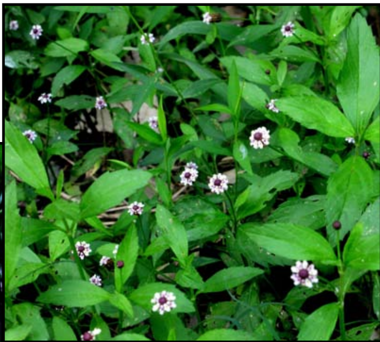
Fog Fruit ( Phyla lanceolata )