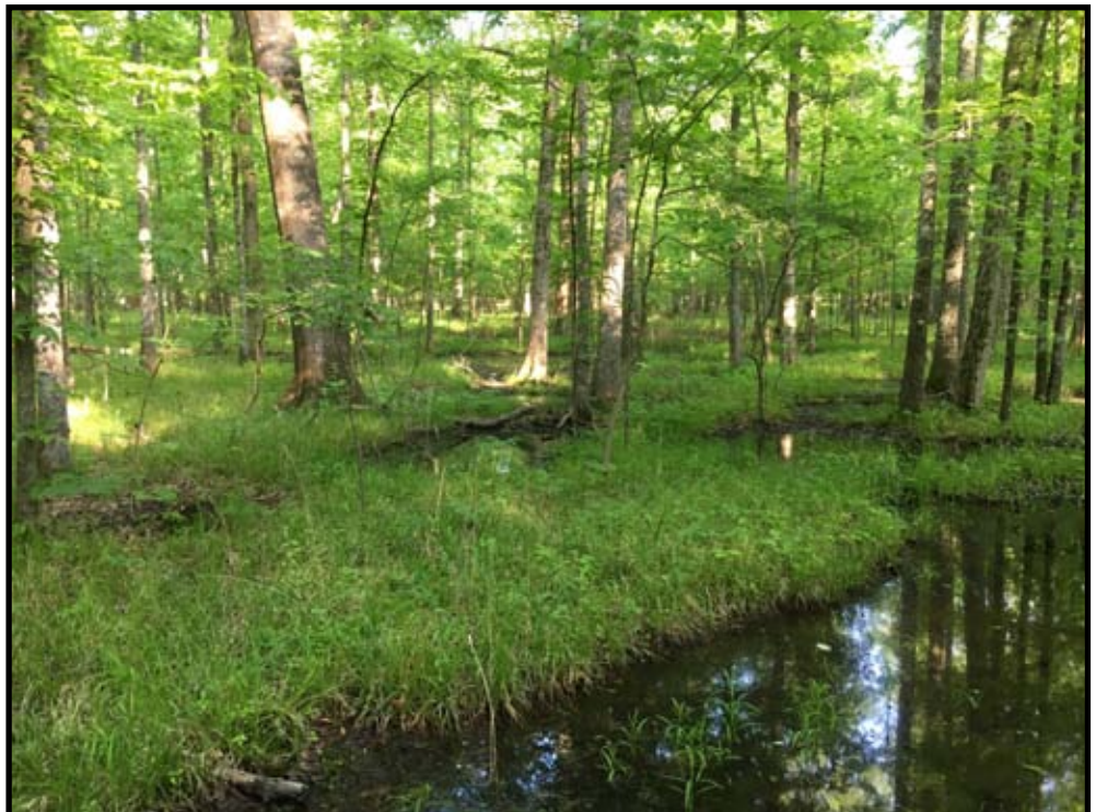
The Ranch North Woods Preserve on the Little Maumelle River boasts high quality hardwood flatwoods and cypress swamp forest.

Perhaps the most impressive thing about the site is its diversity of trees. The particular flatwoods community located there may actually be an undescribed type. I would describe it as a nutmeg hickory-mixed oak community and I've only seen it at a few places in central Arkansas, on larger streams that flow into the Arkansas River. This same community is also found in Burns Park, along White Oak Bayou near Maumelle, and along Fourche Creek south of Little Rock. It is often dominated by nutmeg hickory ( Carya myristiciformis ) but is also characterized by a good diversity of oaks. There are the common flatwoods species like willow oak ( Quercus phellos ), water oak ( Q. nigra ), and, in the wettest areas, over-