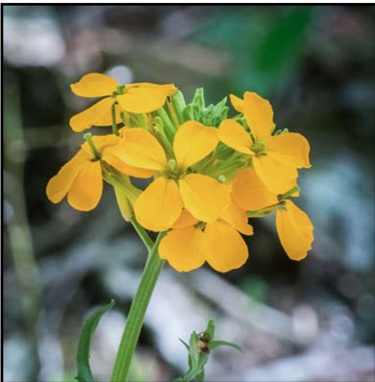
Top left: Celestial Lily ( Nemastylis geminiflora ) Bottom left: Western Wallflower ( Erysimum capitatum ) Top right: Bradbury's Beebalm, ( Monarda bradburiana )

Most of the folks attending the walk had not visited this natural area before. We all agreed that it's a wonderful place to view beautiful and rare native plants. Highly recommended!