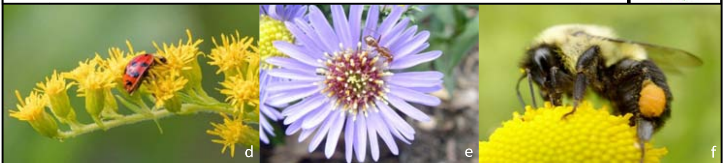
d) A ladybug pollinates goldenrod ( Solidago sp.). e) An ant pollinates an aster. f) This bumblebee, with a full pollen basket, will deliver its nutritious harvest to larvae in the hive.