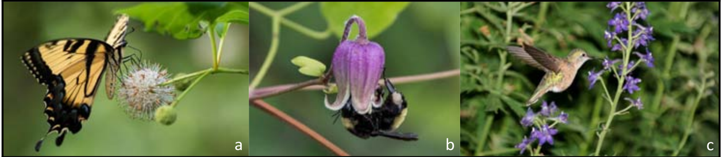
a) Butterflies like this Eastern Tiger Swallowtail ( Papilio glaucus ) choose bright, clustered flowers like buttonbush ( Cephalanthus occidentalis ). b) Bumblebees prefer yellow and blue hues, like this one pollinating a leather-flower ( Clematis sp.). c) Hummingbirds feed on nectar from tubular flowers like this larkspur ( Delphinium sp.).

There are many root causes of pollinator decline that must be addressed, such as habitat loss, industrial agriculture, and climate change. However, one easy way to support pollinators is to propagate the plants that they depend on. While some pollinators have generalist diets, feeding on multiple species that may include non-natives, many rely on specific native plants that they have co-evolved with. As an intern with the Chicago Botanic Garden working with the Forest Service in Hot Springs, Arkansas, the main focus of my internship has been pollinator conservation through native seed sav-