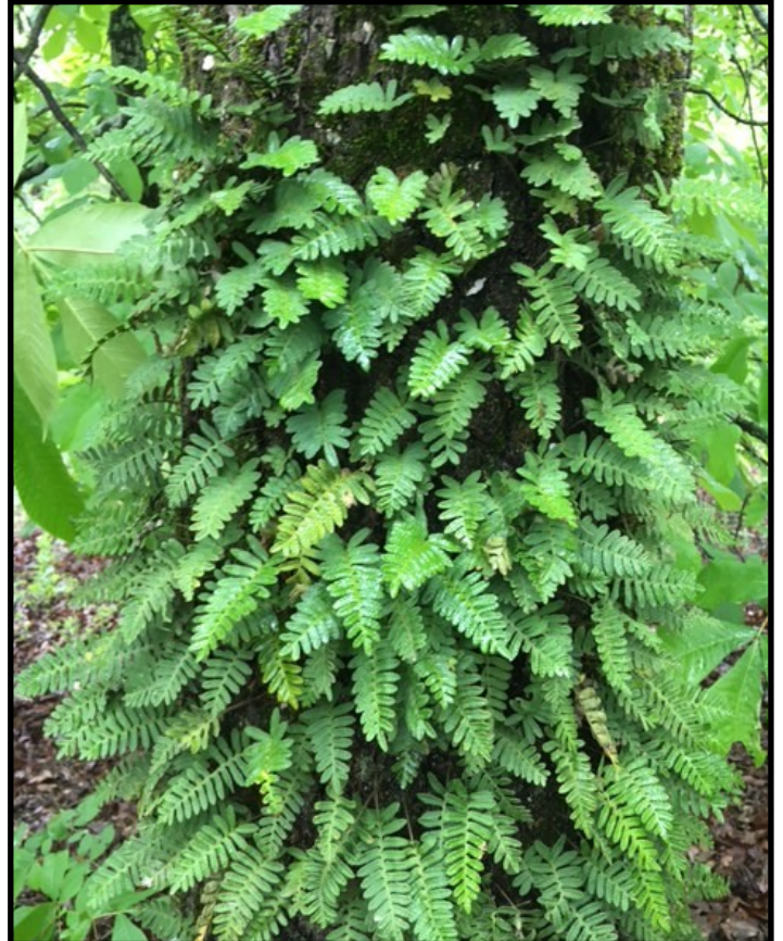
Pleopeltis polypodioides , resurrection fern, can survive long periods of drought by curling up its fronds and appearing desiccated, grey-brown and dead.

Its resistance to scratching and breaking and its improved thermal endurance makes it valuable to use in making glass (used as a flux to lower the melting temperature, gives increased curability), ceramics (used as a flux to lower the melting temperature), roofing granules, rock-wool insulation, building stone and in making toilet bowls and sinks."