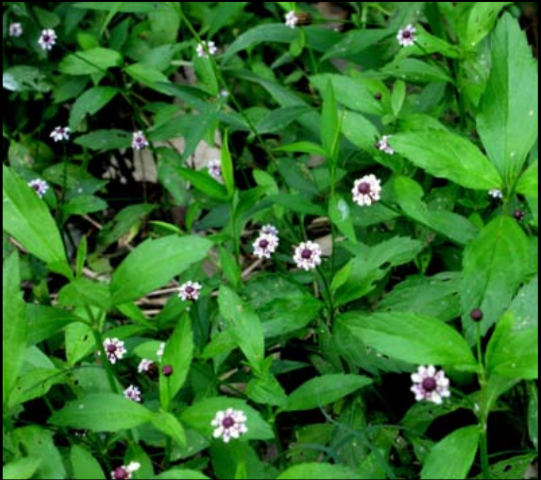
Fog Fruit (Phyla lanceolate)