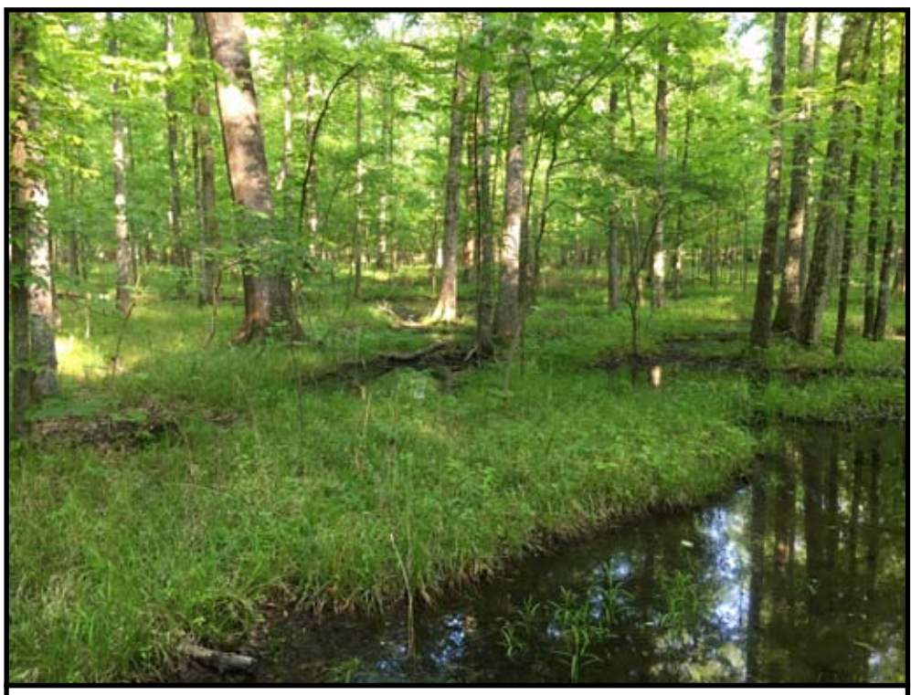
The Ranch North Woods Preserve on the Little Maumelle River boasts high quality hardwood flatwoods and cypress swamp forest.

Perhaps the most impressive thing about the site is its diversity of trees. The particular flatwoods community located there may actually be an undescribed type. I would describe it as a nutmeg hickory-mixed oak community and I've only seen it at a few places in central Arkansas, on larger streams that flow into the Arkansas River. This same community is also found in Burns Park, along White Oak Bayou near Maumelle, and along Fourche Creek south of Little Rock. It is often dominated by nutmeg hickory ( Carya myristiciformis ) but is also characterized by a good diversity of oaks. There are the common flatwoods species like willow oak ( Quercus phellos ), water oak ( Q. nigra ), and, in the wettest areas, over-