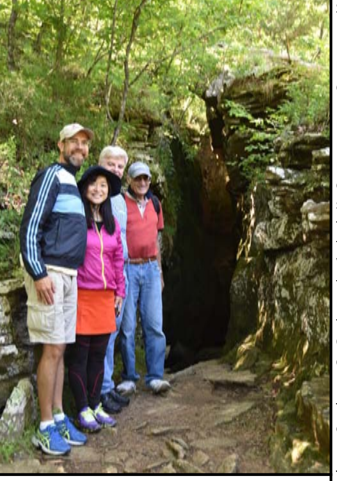
Hikers at crevice area of Devil's Den State Park.

Wild Ginger; Trillium recurvatum , Purple Trillium and Arisaema triphyllum , Jack-in-the-Pulpit (with not much Jack) hence, the preacher-less preacher in the haiku example above.