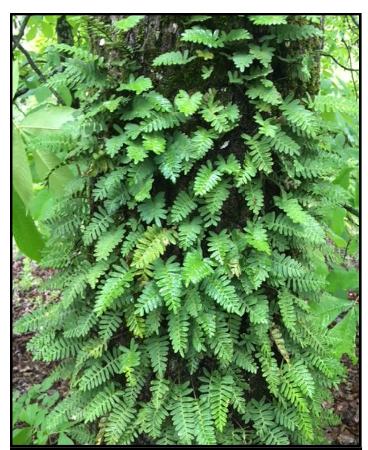
Pleopeltis polypodioides , resurrection fern, can survive long periods of drought by curling up its fronds and appearing desiccated, grey-brown and dead.

Its resistance to scratching and breaking and its improved thermal endurance makes it valuable to use in making glass (used as a flux to lower the melting temperature, gives increased curability), ceramics (used as a flux to lower the melting temperature), roofing granules, rock-wool insulation, building stone and in making toilet bowls and sinks."