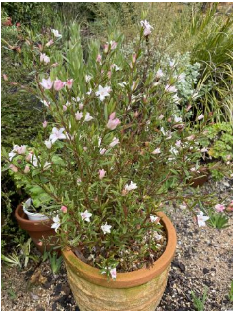
Left: Crowea 'Excel' Brilliant display of flowers