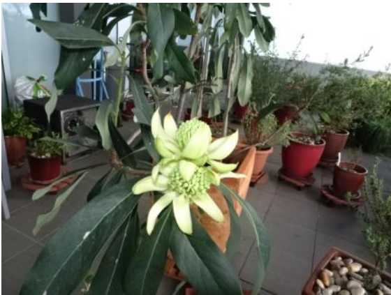
Left: Telopea speciosissima x oreades