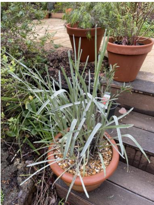
Left: Billy Buttons - repotted and missed flowering. Behind Billy Buttons is Acacia 'Mini Cog' and a Pimelia .