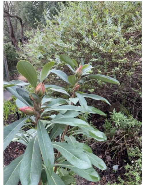
Right: Waratah 'Shady Lady' getting ready for spring flowering