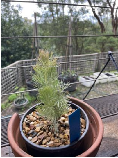
Left: Adenanthos sericea - saw tube stock and couldn't resist.