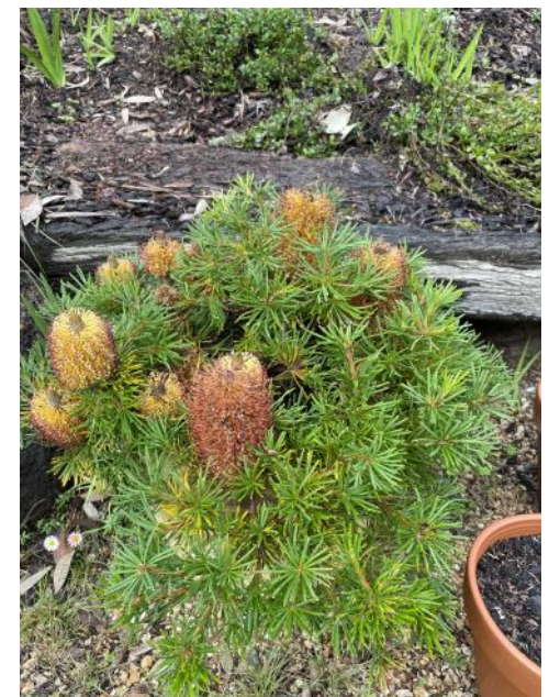
Right: Banksia 'Birthday Candles' - first real flowering this year.