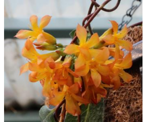
Above: Rhodanthe 'Oxley Cascade'

We planted three of these compact perennials, which produce many white paper-like flowers, in hanging baskets in April 2021. This long flowering cascading cultivar prefers morning sun and adequate moisture and was developed by the Australian National Botanic Garden. These plants flower abundantly for us in August and September.