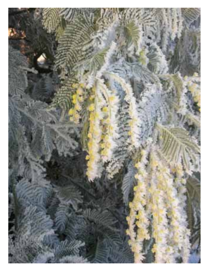
Acacia dealbata ssp. subalpina, flowers and frost Photo Liesbeth Uijtewaal-de Vries, taken in The Netherlands

Propagation is quite easy from seed immersed in boiling water to break seed dormancy and then sown into containers. Usually two seeds per container to thin out later and good success is even found in direct seeding.