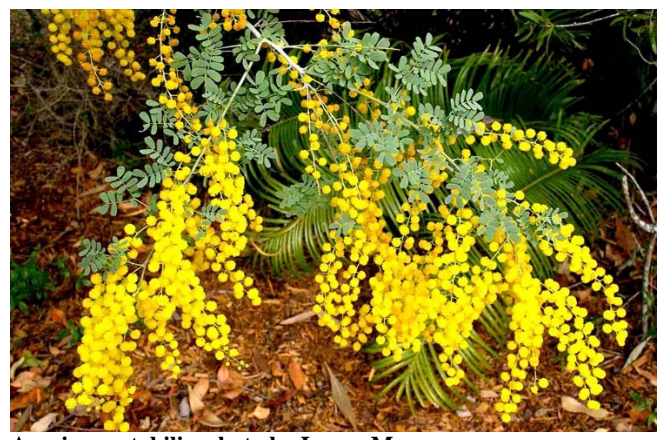
Acacia spectabilis

The above newsletter article immediately reminded me of several other acacias from the same area that have grow very well in Brisbane, in spite of the much higher humidity here. Another one from Auburn Road north of Chinchilla and other nearby areas is Acacia chinchillensis . A plant of this acacia flourished for over 10 years in my garden and produced seed prolifically so that I was able to give some to our Seed Curator regularly. It is a most attractive species with the dainty bipinnate leaves, even when not in flower.