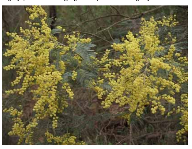
Acacia dealbata ssp. dealbata

The name dealbata indirectly refers to the whitish appearance of the branchlets and foliage. The leaves are mostly bluish grey green or silvery with young foliage being a soft velvety cream to golden colour. The flowers are highly perfumed ranging from yellow to bright yellow.