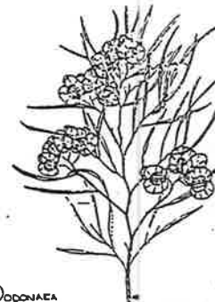
DODONAEA VISCOSA SSP. ANGUSTISSIMA

176 Summerleas Road KINGSTON, 7050 Tasmania Australia Phone (002) 291710