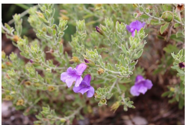
There is a further regional form collected from the Hale River crossing form (below and next column, photo Ken Warnes).