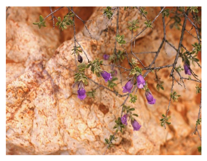
<sup>1</sup> Buirchell, B and Brown, A (2016): New species of Eremophila (Scrophulariacae): thirteen geographically restricted species from Western Australia, Nuytsia 27:253-267

E. ballythunnensis (below) is a low-growing, open shrub 10cm-40cm wide and 25cm-60cm wide. It has purple flowers and is found in the upper Murchison between Ballythunna Homestead (after which the species is named) to near Bilung Pool on the Mullewa-Carnarvon Road. It is related to E. yinnetharrensis and E. muelleriana and in relation to the latter has smaller leaves, smaller sepals and a different coloured flower.