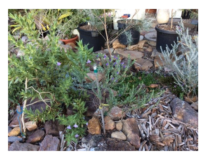
E. exilifolia x spathulata in Charles' garden (below). Charles also has a new Eremophila garden and E. desertii in fruit.