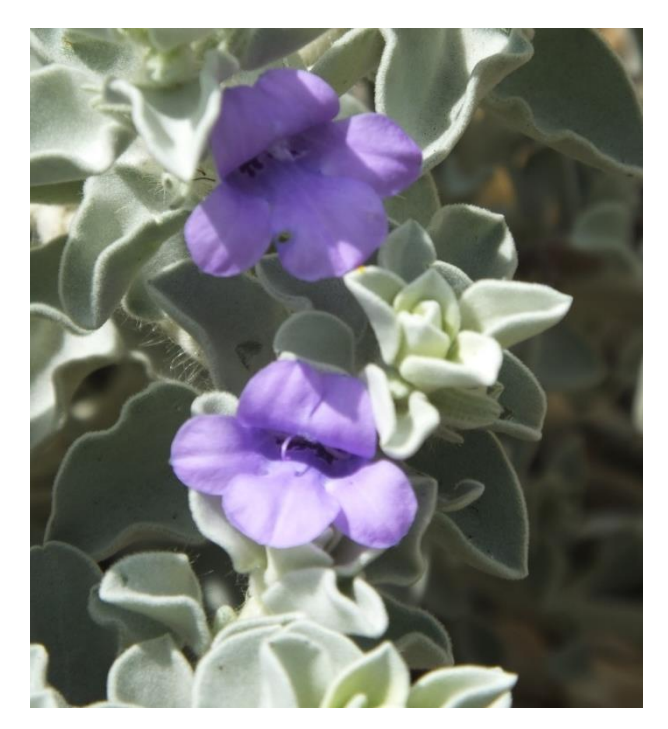
Charles Farrugia (NSW) has sent various photos from his garden. Below – E. battii, E. acrida Bushy Park Station, E. resinosa, E. glabra Roseworthy, E. nivea Beryl Blue. E. stenophylla at the end and mauve flowers at the base of it belong to E. mackinlayi (at present growing as a prostrate); large black pots contain E. bignoniiflora x polyclada (blue), E. nivea and E. arbuscula.