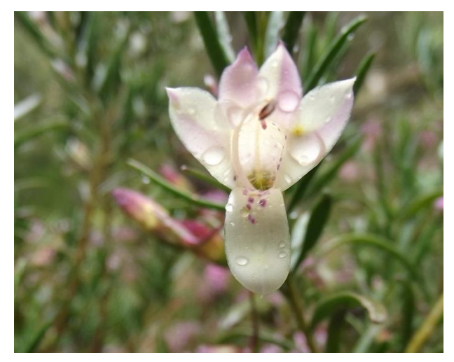
Tim Kolaczyk (SA) sent some interesting photos of 2^{nd} generation E. longifolia x scoparia hybrids. The original plant is shown below...