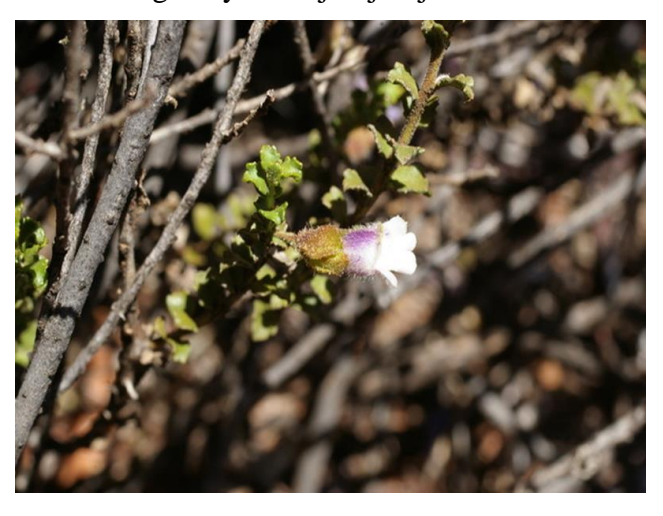
E. yinnetharrensis (below) is an upright, wispy shrub 1.5m-3m high and 1.5m-4m wide. It has

E. victoriae (below) is a small shrub 40cm-50cm high and 40cm-75cm wide. It has purple flowers which turn white with age. It is found in the Great Victoria Desert between the Anne Beadell Highway and Tjuntjuntjarra.