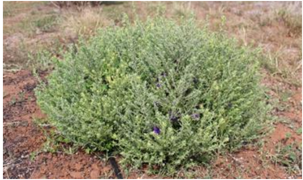
Ken reports first collecting E. macdonnellii Simpson Desert form in 1974 on a visit to Atula Station which is on the northern edge of