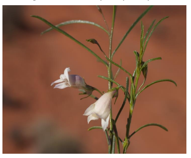
E. laccata (flower and fruit below) is a low-

hughesii and E. pendulina. While all have tall wispy habits, the new species has a single flower per axil and eglandular hairs on the inner sepals and a densely hairy ovary.