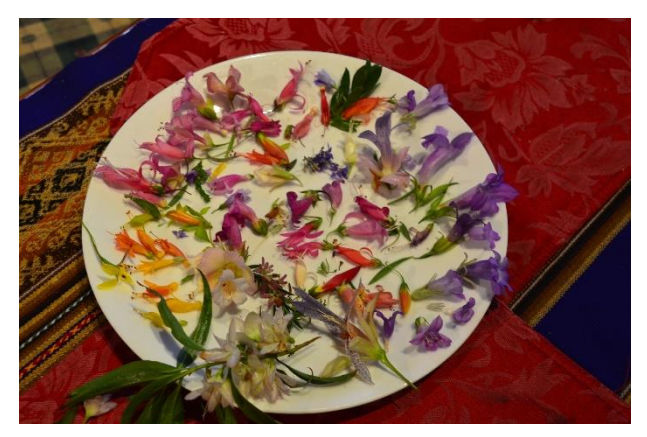
Our place was also hit by the wind storm that struck Canberra on 13 January and we lost our largest Eucalytpus tree, which fell from outside the fence into the front yard, squashing a brick

of the tank stand but missing the tank itself. Like a set of dominos, large pieces of 4 other trees came down at the same time (in total a swathe of around 40m in length), leaving a vast tract of light-filled land which we will turn into Eremophila gardens once we clean up the mess!!