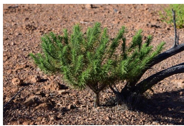
Also near the same location were three hybrids between E. cordatisepala and E. latrobei and one that looked quite interesting.

It is a low shrub that is mostly wider than high and was very consistent in leaf shape (shrub below). Most bushes only had a small amount of growth on them even though it was a wet year up there.