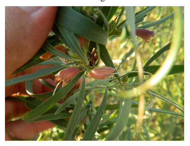
Lyndal Thorburn (NSW): November is Eremophila month at our place – see all our flowers!

...and below is the seedling coming up in the Arid Lands Botanic Gardens next to the original plants – clearly closer to the original E. longifolia parent. The second generation bush is also denser than the original cross.