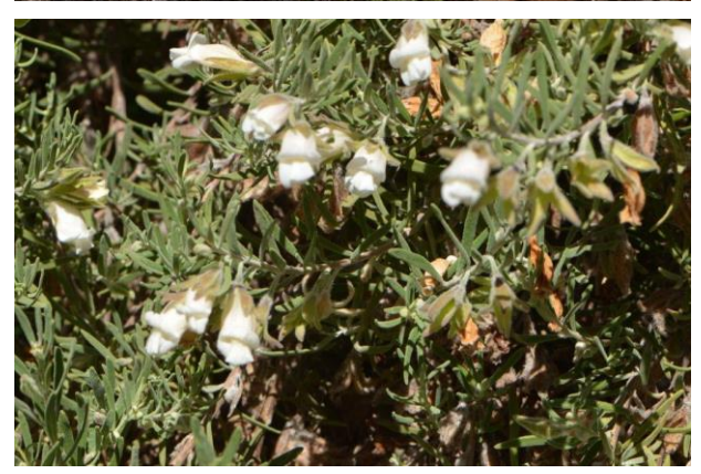
Two of these forms are compared below.