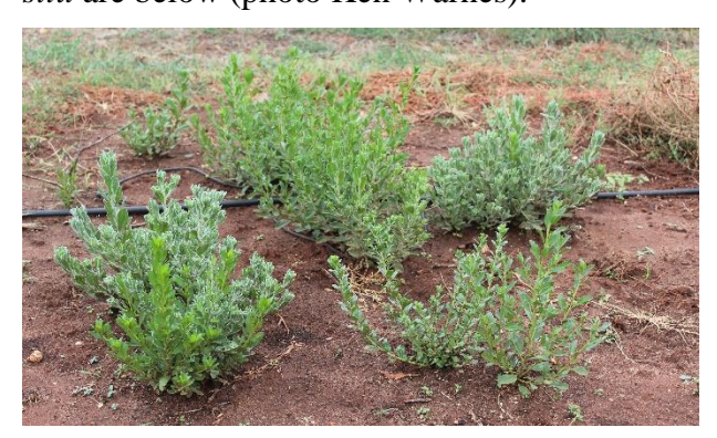
Bill Handke (ACT) Went to our place down near Tathra in September after being away 11 weeks and were disappointed to discover quite a few Eremophilas have carked it: all of the E .

My plantation is a source of on-going frustration with large numbers of losses from both new and older plants from the very wet Spring plus numerous plants either rooted out or smashed up in the gales that we are having at regular intervals. Plus the jungle of weeds from the continuing rains and now a mass hatching of winglesss grass-hoppers which will wreak havoc if not controlled. E. glabra seedlings of a WA form (of some sort) left in situ are below.