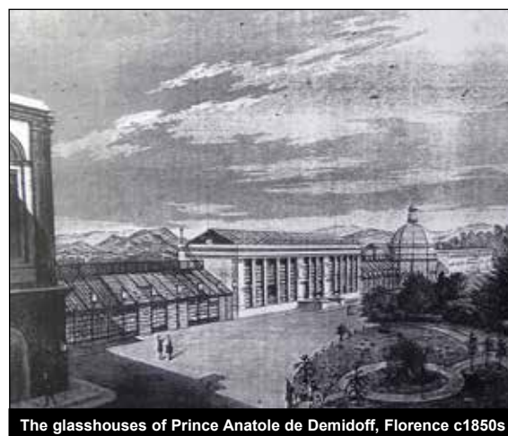
The glasshouses of Prince Anatole de Demidoff, Florence c1850s