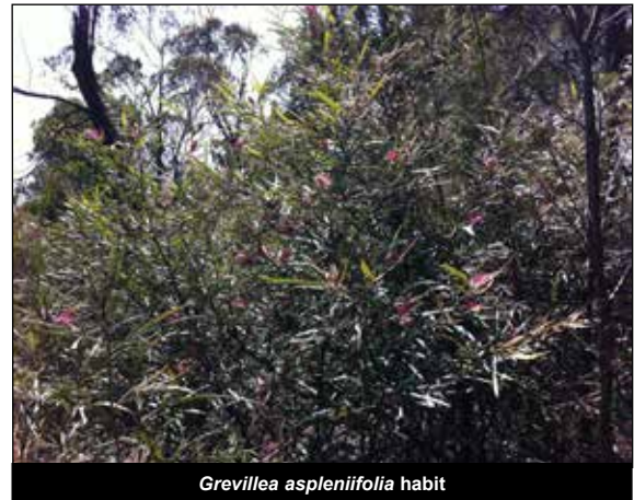
Grevillea aspleniifolia habit

G. aspleniifolia is a hardy plant in cultivation surviving extended, dry periods and tolerating frost. It prefers a well drained acidic sand or loam in full sun. Prune regularly to maintain a tidy, dense shape and encourage attractive pinkish new growth.