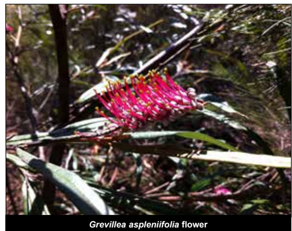
Grevillea aspleniifolia flower