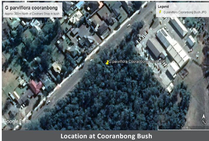
Location at Cooranbong Bush

There was much discussion about technical stuff on the day which Peter will probably elaborate on at some stage. As many of you know it is no small thing to spend time in the bush with Peter, so I'll look forward to the next possible visit and I'll try and hone my location skills as well as I can with my aging eyes. For reference I have included some images of the plants we found and location maps.