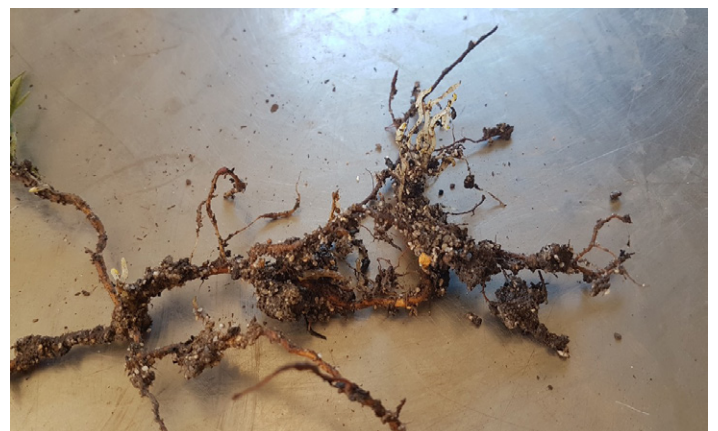
Root-suckering Grevillea linearifolia