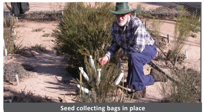
Seed collecting bags in place