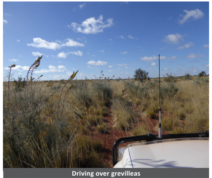
Driving over grevilleas

Yet it was the fields of G. eriostachya which summed up the trip. All around us were grevilleas scattered as far as the eye could see poking up through waist-high grasses (mostly Triodia schinzii ), their arrow shaped, terminal flower heads just turning from green buds to gold. Having to drive over perfectly good grevilleas growing in the track was less painful than it might have otherwise been because none were actually in flower, and there were so many that