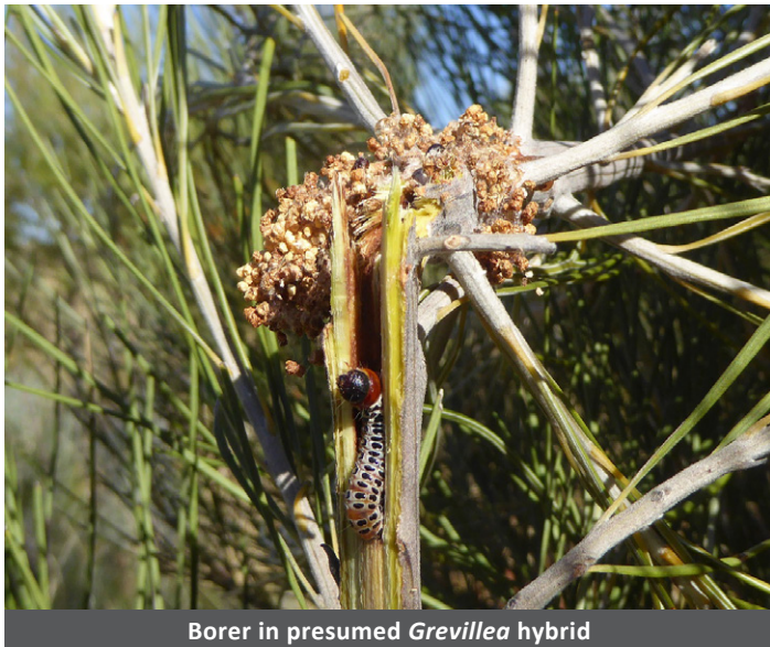
Borer in presumed Grevillea hybrid

We often spend time botanising in arid Australia, especially the deserts of WA, but Proteaceae ( Grevillea and Hakea ) rarely dominate. However, this time the grevilleas were a real highlight of our 2018 desert trip.