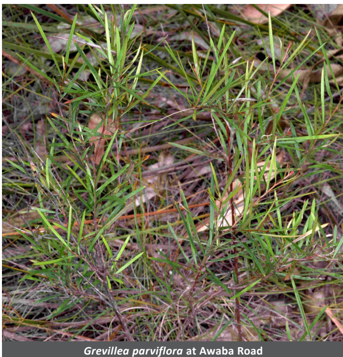
Grevillea parviflora at Awaba Road