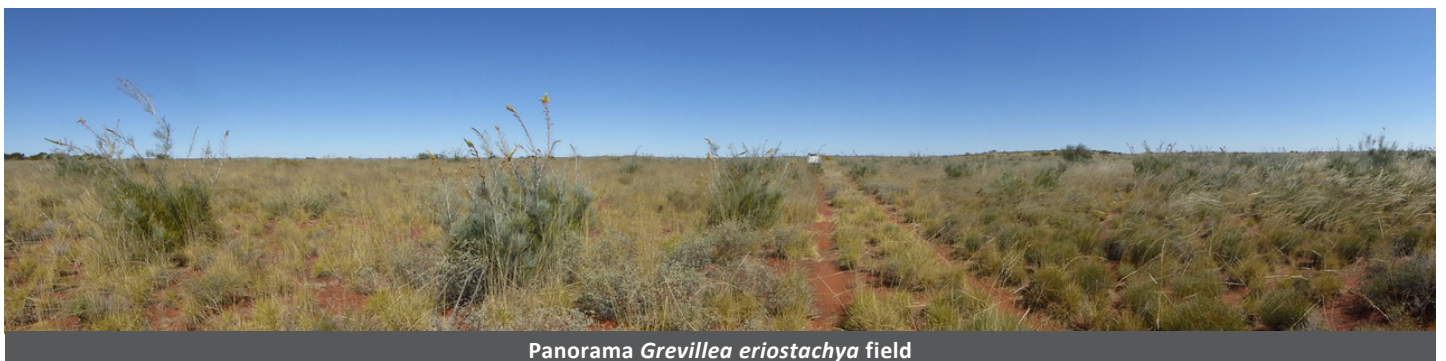
Panorama Grevillea eriostachya field