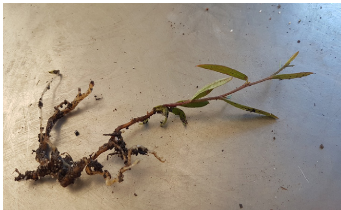
Root-suckering Grevillea linearifolia