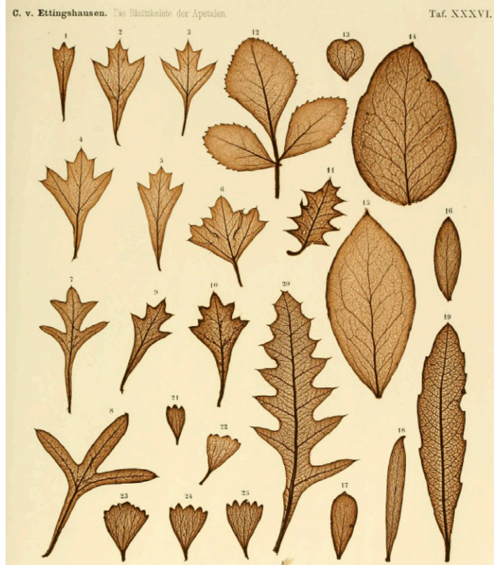
Fig. 1—5. Manglesia trilobata Hort. Fig. 6. Manglesia cuneata Endl. Fig. 7 u. 8. Anadenia heterophylla R. Brown. Fig. 9 u. 10. Anadenia illicifolia R. Brown. Fig. 11. Grevillea Aquifolium Lindl. Fig. 12. Grevillea Avelana Mol. Fig. 13. Adenanthos obovata Labill. Fig. 14. Persoonia ferruginea Smith. Fig. 15. Persoonia sp. Nov. Holl. Fig. 16. Persoonia myrtilloides Sieb. Fig. 17. Persoonia laurina Smith. Fig. 18. Persoonia sp. Nov. Holl. Fig. 19. Brabejum stellatifolium L. Fig. 20. Grevillea illicifolia R. Brown. Fig. 21—25. Adenanthos cuneata Labill.

Cunningham collected his plant in 1819 and apparently sent seed back to Kew. There is an interesting commentary on plants sent back by Cunningham following his explorations with P.P. King. Hooker (1836) wrote 'During the surveys of Capt. King just noticed, the seeds of no less than twelve species of Proteaceous plants, (and chiefly of Mr. Brown's last section of the genus Grevillea ) were received at Kew. Plants of each were readily raised, which afterwards, with the treatment they received, grew to the stature of large shrubs, and some eventually flowered, to the admiration of all visitors.' The species included by Brown in his last section of Grevillea include G. heliosperma , G. refracta , G. parallela , G. striata , G. mimosoides , G. lorea (now Hakea lorea ), G. glauca . It seems likely that all or most of these species were in cultivation at Kew prior to 1836.