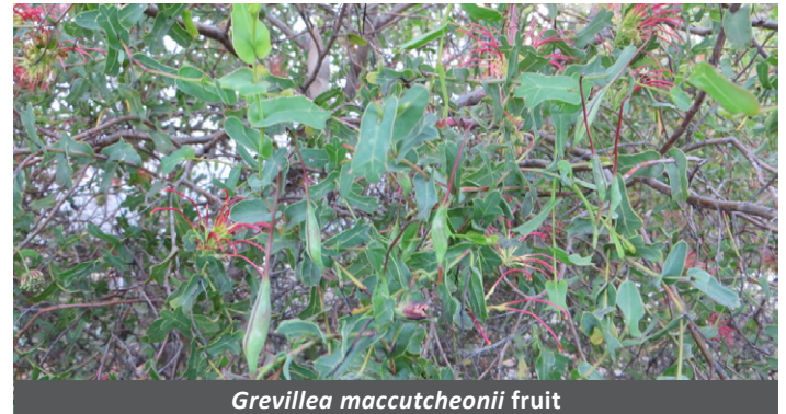
Grevillea maccutcheonii fruit