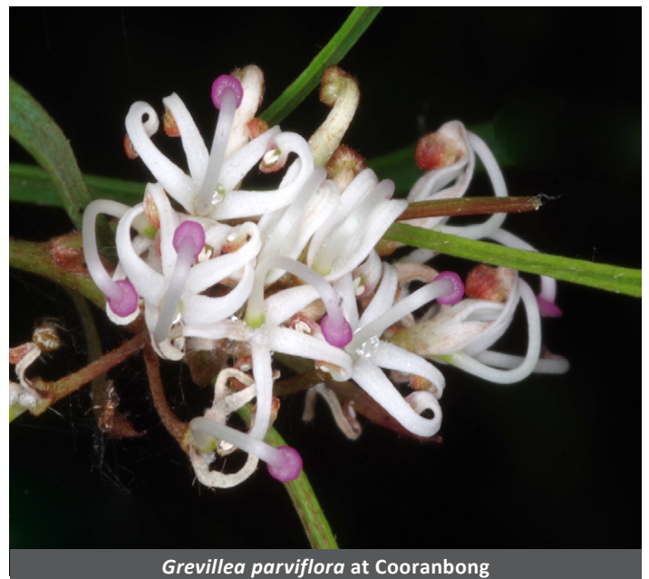
Grevillea parviflora at Cooranbong

We then travelled to the town of Cooranbong, near Morisset at the southern end of Lake Macquarie, and after entering a fenced area of bushland and braving the rusty barbed wire we found more of the plant. This time there were several flowers and a seed pod which pleased Peter no end. On exiting the bushland via the hazardous fence again we looked along the path and here was more G. parviflora sticking out of the fence right next to a concrete pathway. I'm not certain of the status of this small area of bushland but I've been assured it will not be cleared even though it is in the middle of the town and would be prime real estate.