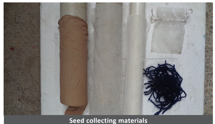
Seed collecting materials