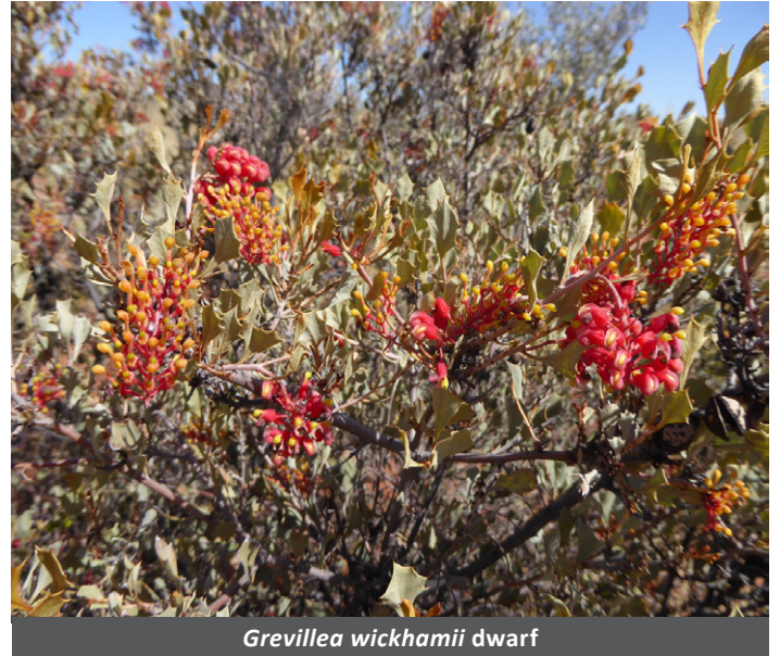
Grevillea wickhamii dwarf

it hardly mattered. The road, an extremely rudimentary track, was rarely travelled so once our convoy of four-wheel drives departed the hardy grevilleas would be able to spring back to their best. Whether this will always be the case is an interesting question with the area set to experience increased visitation due to the likely building of a uranium mine near Wiluna.