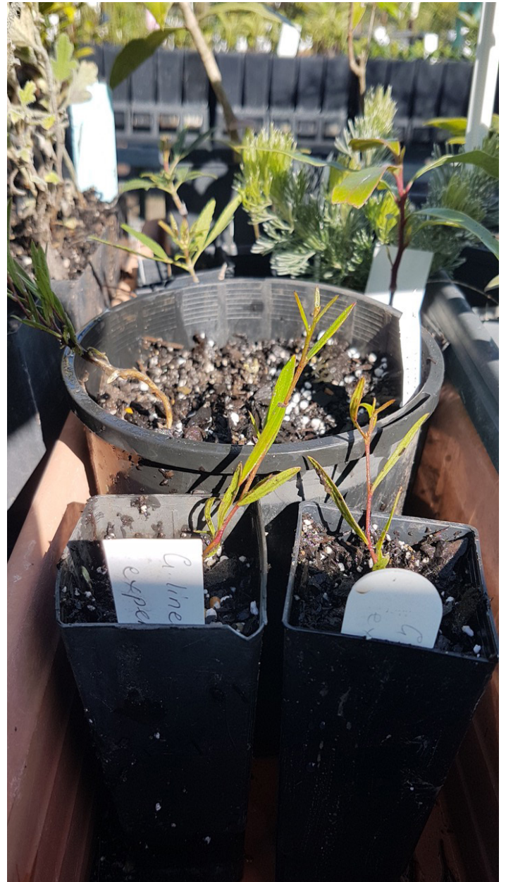
Root-suckering Grevillea linearifolia