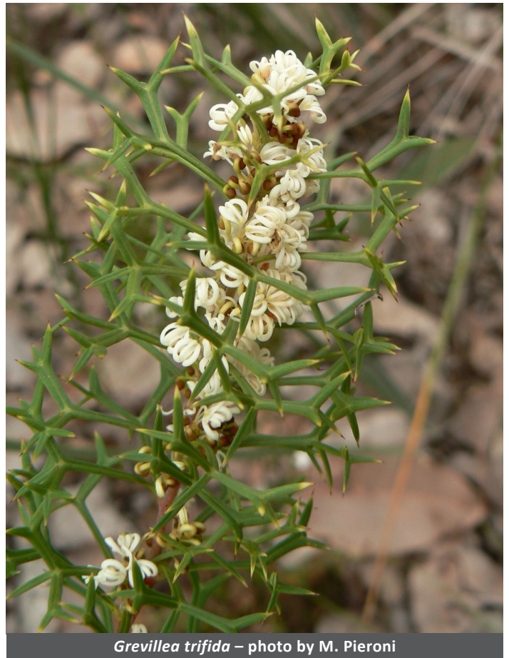
Grevillea trifida