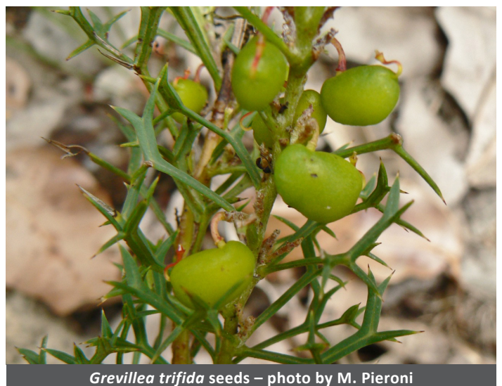
Grevillea trifida seeds

In June, this year, I sowed some seeds of G. trifida but they failed to germinate. I'm hoping they might be one of the species with seeds that take 12 months to germinate so I am leaving the seed tray alone. Meanwhile, I recently put in some cuttings of new growth after the flowering and I will collect some more seeds when they ripen. After I have sown them, I will burn some dry eucalypt leaves over the seed tray which is what I often did for as long as I have been growing Australian plants from seed.