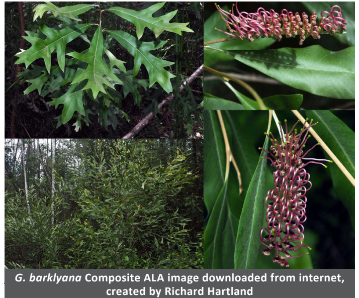
G. barklyana