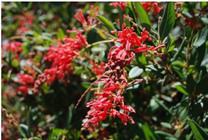
Grevillea rhyolitica 'Deua Flame'