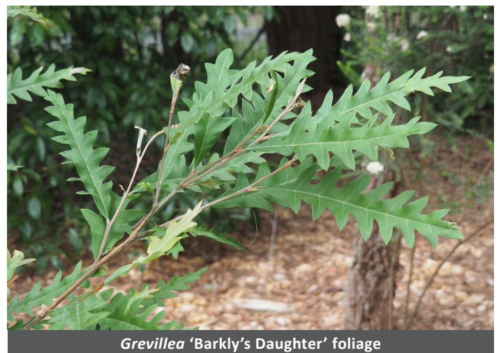
Grevillea 'Barkly's Daughter' foliage

Here are some of the differences which together distinguish the species from the hybrid.