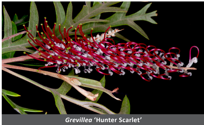
Grevillea ‘Hunter Scarlet’

G. ‘Barkly’s Daughter’ is very similar to G. ‘Poorinda Anticipation’ and G. ‘Hunter Scarlet’ . G. ‘Poorinda Anticipation’ has flowers with pink styles. G. ‘Hunter Scarlet’ , a new cultivar from Hunter Region Botanic Garden with similar red flowers has leaves with a velutinous (like velvet) undersurface.