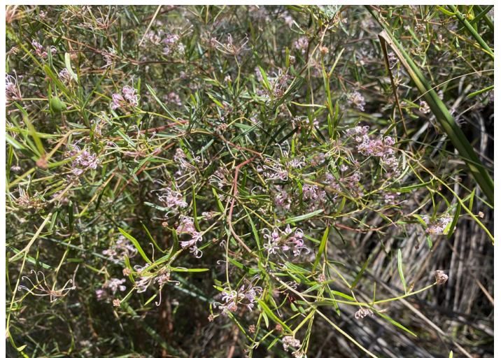
Grevillea gariwerdensis Mt Zero Rd, nth of Plantation Picnic Ground - pale pink form

The largest population of Grevillea gariwerdensis occurs along the Mt Zero Rd, just north of Plantation Picnic Ground, but sadly two thirds of this population was burnt out several years ago during an out of control “control burn”!! The great surprise for us was the abundant evidence of seedling recruitment over the several hectares of this population, which is very important because this population contains plants that range in flower colour from pure white, through beautiful shades of pink, to a deep pinky-mauve. Material from all perimeters of the population was collected to ensure as wide a genetic diversity as possible.