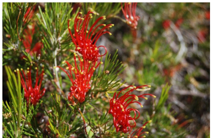
Grevillea beardiana – Peak Charles form Neil Marriott

This beautiful small shrub comes from the southern wheatbelt region of Western Australia. In cultivation it grows to around 1m tall and 1.5m wide, with fine soft green leaves and masses of very showy toothbrush flowers from autumn right through to spring. Flowers can be bright scarlet or showy orange in colour and are very popular with our honeyeating birds. Sadly it is not very common in cultivation at present, but can be occasionally available, usually as grafted plants at specialist native nurseries.