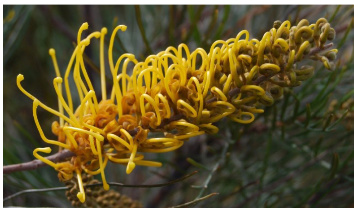
Grevillea 'Bush Lemons'