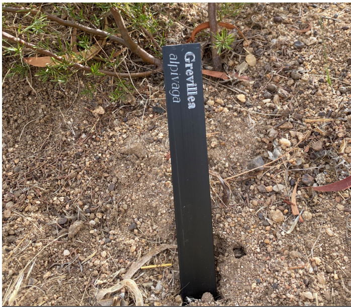
Grevillea alpvivaga label