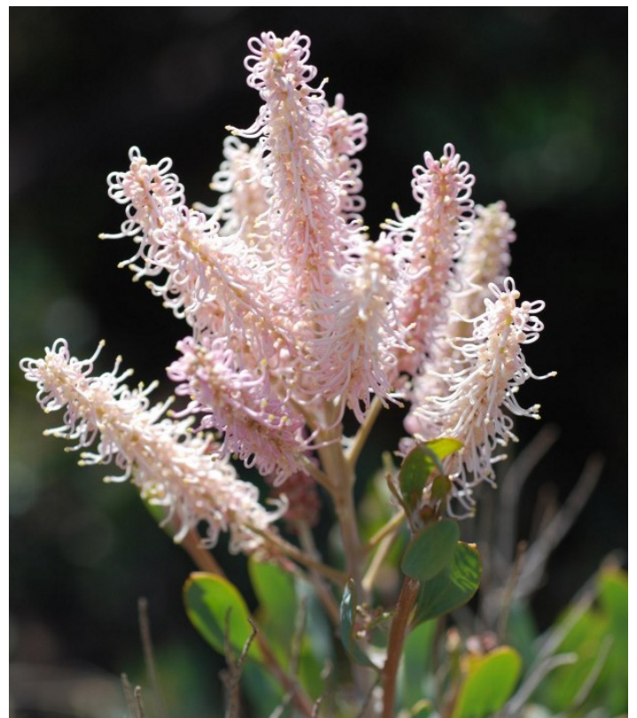
Grevillea polybotrya (Caramel Grevillea)

Normally flowering during the months of summer, Grevillea polybotrya will often flower beautifully right into the autumn months, particularly when summers are cooler and mild. The massed flowers are typically cream, however rarely plants can be found in the wild that have beautiful pale to deep pink buds, opening to soft pink flowers. Peter and I found several lovely pink forms with attractive ash-grey foliage, on a trip to the West and sent material back to members in the East –the struck plants are the original forebears of nearly all plants now in cultivation. These have the most amazing caramel perfume that fills the garden on warm sunny days with truly delicious caramel perfume. Plants can be propagated by seed or cuttings that strike quite easily, or by grafting on a suitable rootstock. It is not compatible with G robusta .