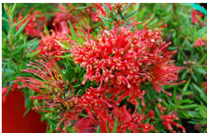
Grevillea 'New Blood'