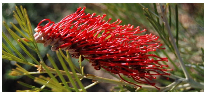
Grevillea nivea or 'Scarlet King'

A very large and most beautiful Grevillea from limited coastal areas near Bremer Bay on the south coast of WA. This is a wonderful plant for large gardens where it can be allowed to spread to several metres tall and up to 3-4m wide. It flowers for many months of the year, almost continuously when there is sufficient subsoil moisture available. Can be readily pruned to a smaller size if desired. Often available at nurseries.