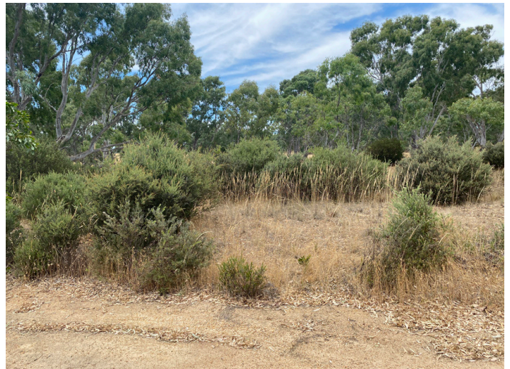
Grevillea arenaria ssp canescens population on Moyston Rd

None of these populations were from planted sources, they have just gone feral, one from nearby garden, the other who knows, but I am a member of the Landcare group for that area and they definitely haven't been planted.