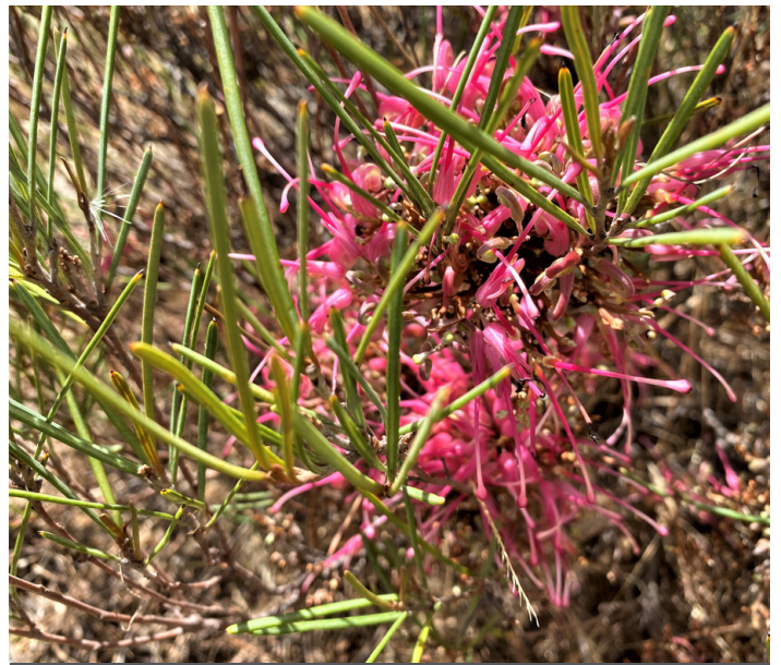
Grevillea oncogyne – dwarf form