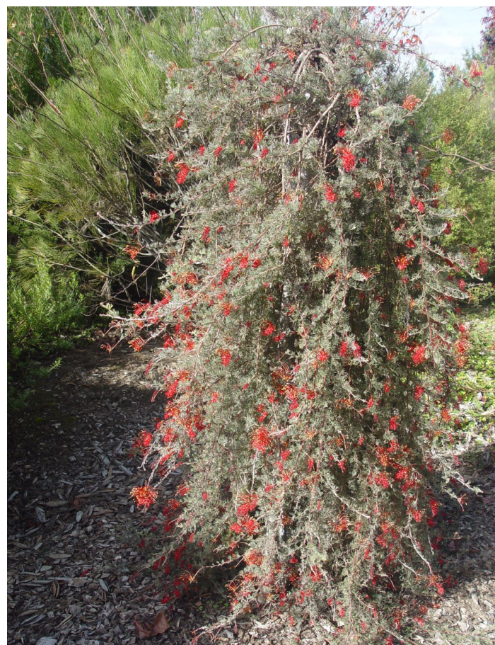
Grevillea humifusa Standard

Your trials with G. triloba as a rootstock should prove most interesting.