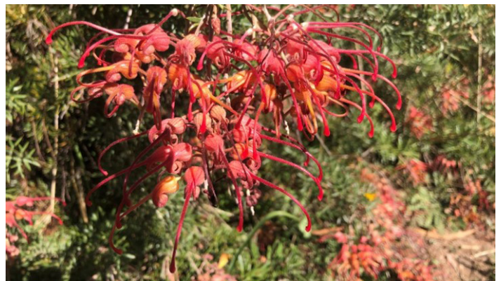
Grevillea 'Katydid'