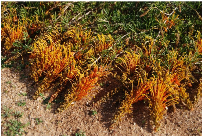
Grevillea tenuiloba 'Golden Glory'

This is one of the real gems of the West where it is sadly now a listed rare and endangered species. We discovered a small colony of this beauty at Canna north of Perth on a Birdwing wildflower tour a number of years ago and everyone was thrilled to see them. The plants were only 0.3-0.5m tall and around 1m wide and covered in spectacular pendant golden toothbrush flowers. Plants are extremely hardy once established in a sunny well drained site, but have proven to be a bit difficult to propagate from cuttings. We have a couple of spectacular plants in our Pomonal Hall garden, and Neville and Helen Collier have several as grafted standards in their wonderful garden. Often available at specialist native nurseries, occasionally as a long flowering standard.