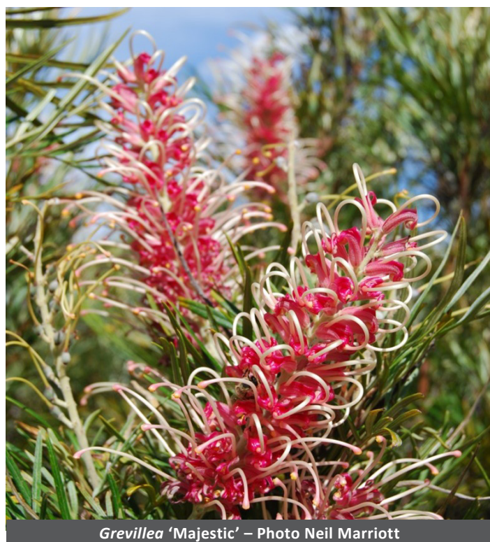
Grevillea 'Majestic'

A most beautiful fern leaved 'tropical' Grevillea with lovely soft deep green leaves and masses of majestic pinky-red and cream bottlebrush flowers. These adorn the plant for many months of the year, flowering beautifully well into autumn so long as there is sufficient moisture in the soil. Plants can get to a fairly large size of around 3-4m tall and wide, making it a wonderful showy screen plant or large feature plant for the garden. Coming from the tropics it prefers a warm sunny site protected from heavy frosts, particularly when young. Occasionally available in nurseries particularly in NSW and Queensland.