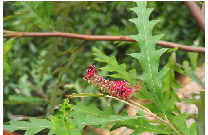
Grevillea 'Barkly's Daughter'

The earliest reference to Grevillea barklyana in horticultural catalogues is a Boddy's Eastern Park Nursery list dated 1960–61. On P.25 they list for sale G. Barklyana 'Large-leaf Grevillea' and it must be presumed that this was the true species. The hybrid, for which I here suggest the name 'Barkly's Daughter', has largely replaced the species in catalogues from c. 1990. Norwood catalogue list from 1981 suggests a label for the true species was still in demand, though no reference specimen is available. What then the origin of G. barklyana hybrid which has persisted in horticulture to the present. Where did it come from and who introduced it. Unfortunately, I have not been able to trace its source.