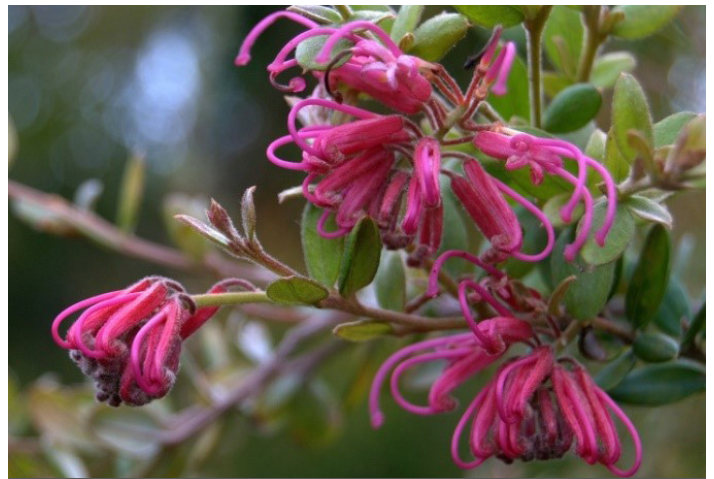
Grevillea 'Collaroy Plateau'

Grevillea 'Collaroy Plateau' grows best in a dappled shade location, and coming from Sydney, it prefers an occasional drink over our long hot summers. This also ensures a continual show of its lovely flowers while there is still some moisture in the soil. It propagates readily by cuttings, and is often available at both specialist and general nurseries, or you can easily strike some cuttings yourself!