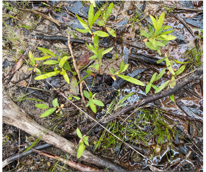
Grevillea gariwerdensis seedlings at the Type location

Cranbourne will also now contact Parks Victoria in an attempt to ensure this site is not burnt again for many years, thus allowing this rare and beautiful Grevillea to recover, flower and set copious seed to secure it against any future wildfires.