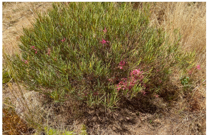
Grevillea oncogyne – dwarf form

Following the wettest year ever recorded for the region, our Grevilleas have mostly thrived with the soaking rains. Now at the height of summer, numerous species are flowering superbly due to the good subsoil moisture levels. Our huge stand of self-seeding Grevillea magnifica have been flowering heavily right through winter, spring and still continue into summer. Other notable species in flower now are Grevillea oncogyne – a distinct dwarf race that Wendy and I discovered in 2003 on Nindilbillup Rd, NE of Ravensthorpe, WA. Peter and I suspect that this warrants recognition as a new species. It appears to be root suckering.