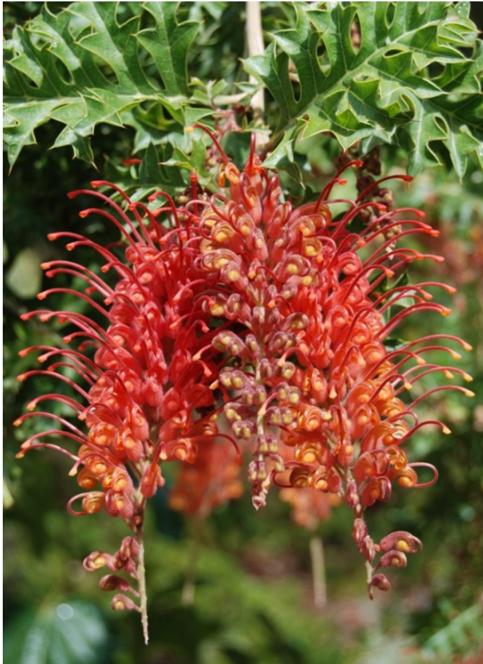
Grevillea bipinnatifida – Chattering Valley form