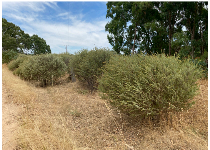
Grevillea arenaria ssp canescens population on Roxborough Rd