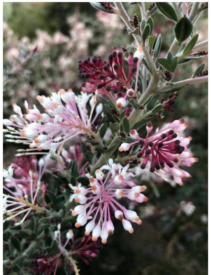
Grevillea vestita 'Mulberry Midnight'

An absolutely spectacular Grevillea that normally flowers in early summer, but can also flower during autumn in good years. Grevillea vestita normally has white flowers, however this selection has the most amazing deep mulberry-black flower buds opening to soft pink flowers. It was discovered by a nursery friend Nancy Scade in a coastal suburb of Perth, and thank goodness, she took some cuttings and struck it, as it was then totally wiped out by property developers! It grows to around 1-1.5m x 1.5m with lovely ash-grey simple to toothed leaves. Cuttings strike well, as long as they are not allowed to get too wet. At present it is not readily available at nurseries, but deserves to be far more widely grown.