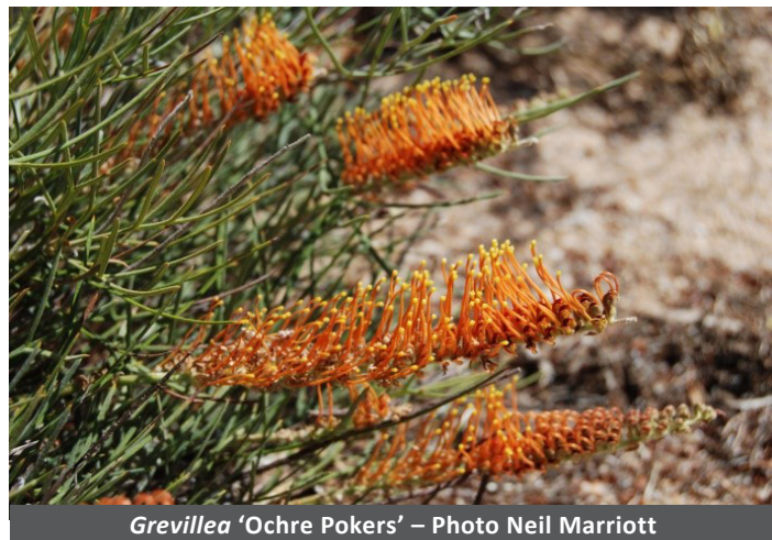
Grevillea 'Ochre Pokers'

is best grown as a grafted plant (not directly on G. robusta ). Occasionally available at specialist nurseries, particularly in Victoria. Makes a spectacular standard when grafted on G. robusta with an interstock.