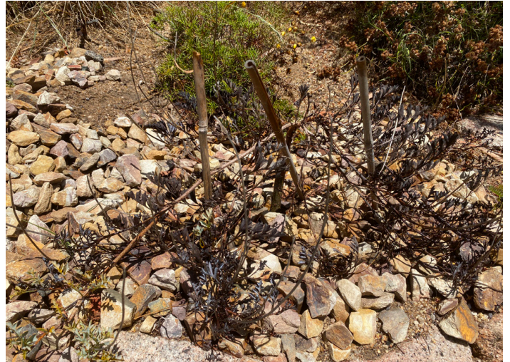
Grevillea scapigera showing mostly black diseased leaves

For many years now we have been cultivating the critically endangered Grevillea scapigera , a species that is very close to extinct in the wild around Corrigin in WA. Nearly all of our plants are being grown on G. robusta rootstocks with an interstock of G. flexuosa . Here in Victoria, we have had many plants of G. scapigera growing most successfully. However, nearly all have now died out, with all being afflicted with what appears to be a fungal disease. One by one the leaves turn black and die, rendering the plant weak and soon dying, when conditions appear to be perfect. This is a most disappointing problem, and talking with a few other Grevillea growers they have had similar problems. I wonder if this is one of the problems with the plants in the wild, as most of them, growing in remnant bushland on roadsides, have now mostly died out. This is something that clearly requires closer examination. Have you experienced this with your Grevillea scapigera ? Speaking with fellow Study Group member Jeremy Tscharke in East Gippsland, he tells me that he has lost his beautiful large grafted specimen, however another, that is grafted as a standard, and is therefore up off the soil surface is thriving! Further indication that fungal attack may be the problem.