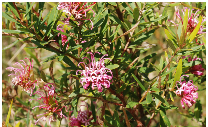
Grevillea sericea ssp sericea growing on Western Highway, Stawell, Vic.

Late last year I stopped on the Western Highway near the caravan park at our turnoff and discovered a fairly large population of Grevillea sericea ssp sericea . This site had been scalped of its original native vegetation, which includes lovely low plants of the local Grevillea alpina . I was amazed to find, in the stony clay subsoil a mass of established plants and many seedlings of both G. sericea and G. alpina , not root suckers. It is probable that the G. sericea arose from garden plants growing in the adjoining caravan park. The G. alpina seedlings from adjoining indigenous plants. There are also numerous plants of Gastrolobium celsianum Swan River Pea, a WA species also planted in the caravan park. This clearly shows the colonising ability of many of our Grevillea species.