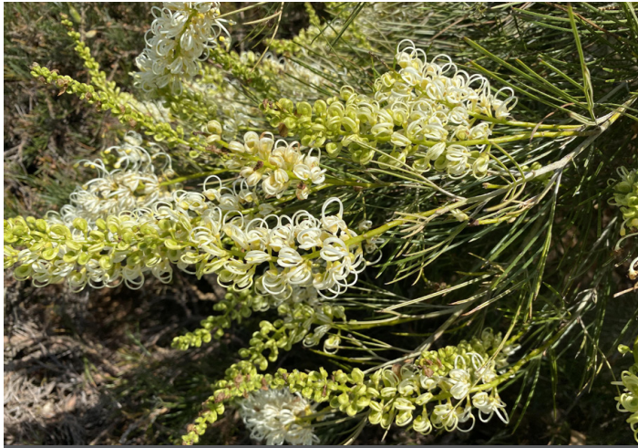
Grevillea candicans flowering in Simon Gilliland's garden

Simon has a large property at Cape Patterson, with a beautiful natural wetland and a lovely sandy loam rise, ideal for growing a large collection of Grevilleas and Hakeas. Notable when we visited was a lovely grafted Grevillea candicans in full flower as well as a wonderful range of other Grevilleas.