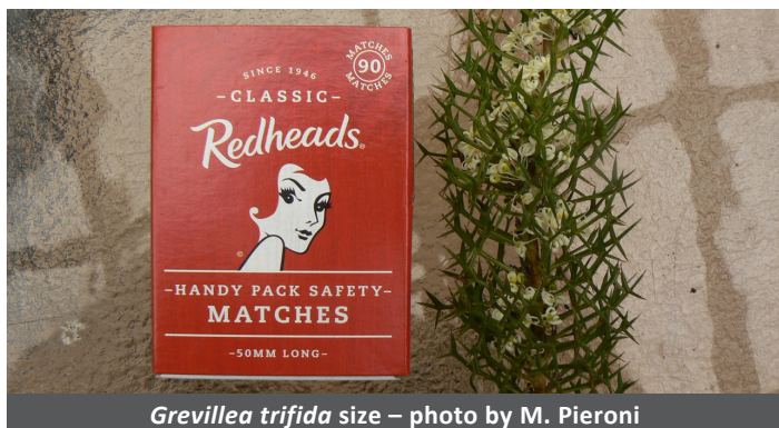
Grevillea trifida size

The Denmark form of G. trifida has very small, crowded leaves and the shrubs grow to less than one metre. The tiny flowers are produced in spring, on long branches. The plants do not appear to be suckering.