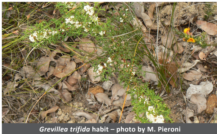
Grevillea trifida habit

There are more than 20 plants in the Pea (Fabaceae family) but few in Proteaceae despite the fact that the soil is laterite gravel and clay. There are two dryandras, two hakeas, one banksia, one petrophile, one synaphea and only one grevillea, Grevillea trifida . G. quercifolia grows less than a kilometre away, so I have propagated and planted that one in my 'garden' section. I planted a small area with other western Australian plants in order to paint them when they flowered.