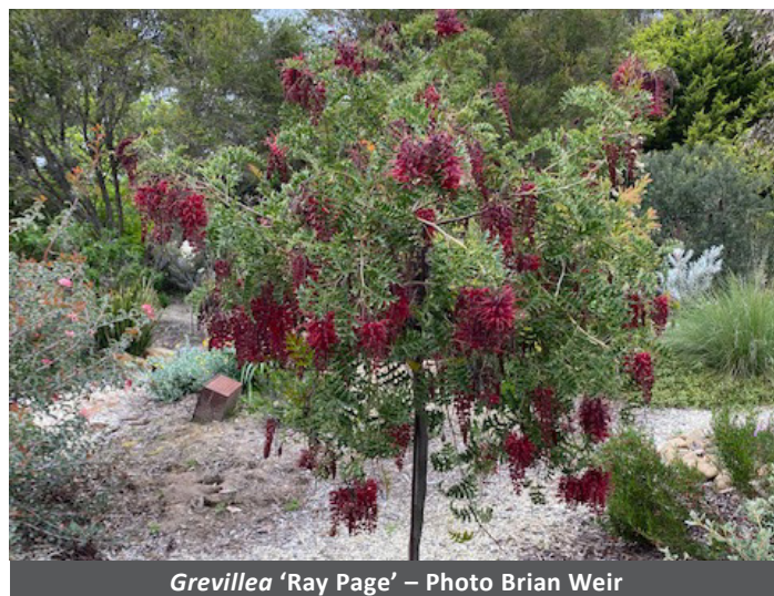
Grevillea 'Ray Page'

I have been having much better results with my grafting this year. I just wish I had a few more Silky Oaks, but I am managing OK. I have been growing on some Silky Oaks to make standards up to 1.2m tall for Grevillea bipinnatifida and G. thelemanniana type varieties. I was thinking of making a 'Ray Page' standard for you and could do the grafts shortly as the stocks are coming along well. Would you know if the dark red G. bipinnatifida to the left front of your house is 'Ray Page'? I always found this one striking.