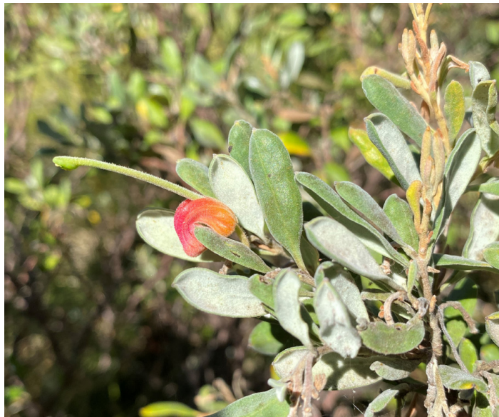
Grevillea arenaria ssp canescens