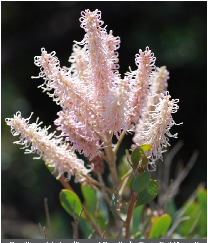
Grevillea polybotrya (Caramel Grevillea)

Normally flowering during the months of summer, Grevillea polybotrya will often flower beautifully right into the autumn months, particularly when summers are cooler and mild. The massed flowers are typically cream, however rarely plants can be found in the wild that have beautiful pale to deep pink buds, opening to soft pink flowers. Peter and I found several lovely pink forms with attractive ashgrey foliage, on a trip to the West and sent material back to members in the East -the struck plants are the original forebears of nearly all plants now in cultivation. These have the most amazing caramel perfume that fills the garden on warm sunny days with truly delicious caramel perfume. Plants can be propagated by seed or cuttings that strike quite easily, or by grafting on a suitable rootstock. It is not compatible with G robusta.