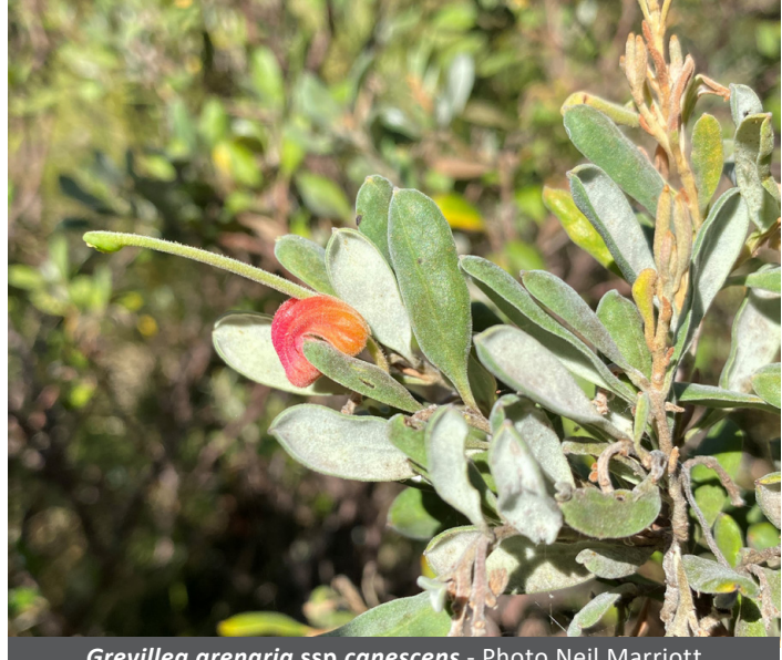
Grevillea arenaria ssp canescens

None of these populations were from planted sources, they have just gone feral, one from nearby garden, the other who knows, but I am a member of the Landcare group for that area and they definitely haven't been planted.