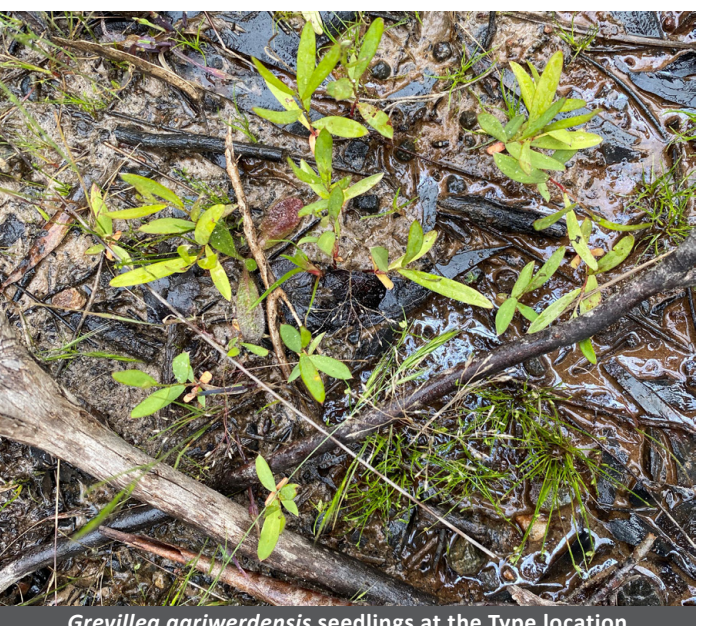
Grevillea gariwerdensis seedlings at the Type location

Cranbourne will also now contact Parks Victoria in an attempt to ensure this site is not burnt again for many years, thus allowing this rare and beautiful Grevillea to recover, flower and set copious seed to secure it against any future wildfires.