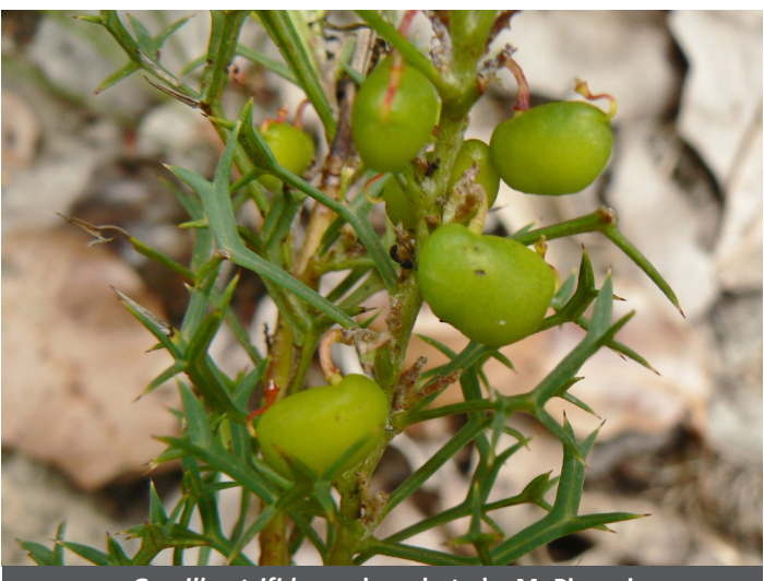
Grevillea trifida seeds

In June, this year, I sowed some seeds of G. trifida but they failed to germinate. I'm hoping they might be one of the species with seeds that take 12 months to germinate so I am leaving the seed tray alone. Meanwhile, I recently put in some cuttings of new growth after the flowering and I will collect some more seeds when they ripen. After I have sown hem, I will burn some dry eucalypt leaves over the seed tray which is what I often did for as long as I have been growing Australian plants from seed.