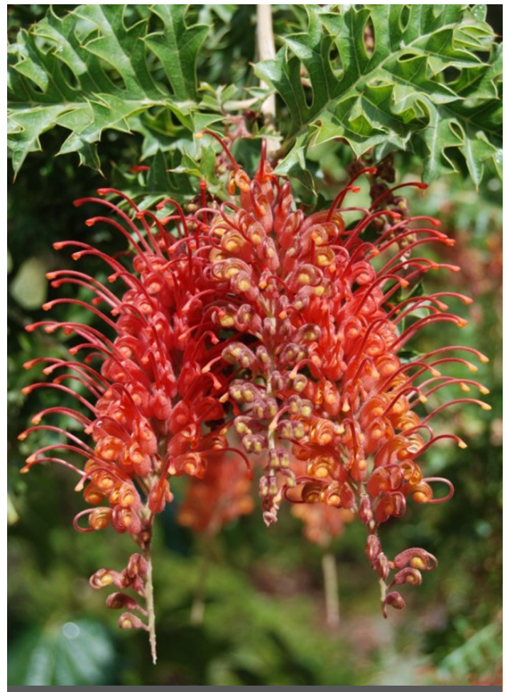
Grevillea bipinnatifida – Chittering Valley form