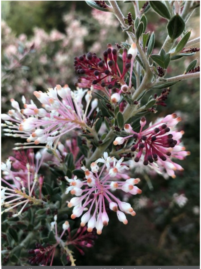
Grevillea vestita 'Mulberry Midnight'

An absolutely spectacular Grevillea that normally flowers in early summer, but can also flower during autumn in good years. Grevillea vestita normally has white flowers, however this selection has the most amazing deep mulberry-black flower buds opening to soft pink flowers. It was discovered by a nursery friend Nancy Scade in a coastal suburb of Perth, and thank goodness, she took some cuttings and struck it, as it was then totally wiped out by property developers! It grows to around 1-1.5m x 1.5m with lovely ash-grey simple to toothed leaves. Cuttings strike well, as long as they are not allowed to get too wet. At present it is not readily available at nurseries, but deserves to be far more widely grown.