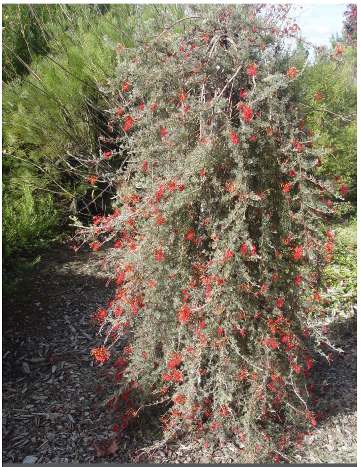
Grevillea humifusa Standard

Your trials with G. triloba as a rootstock should prove most interesting.