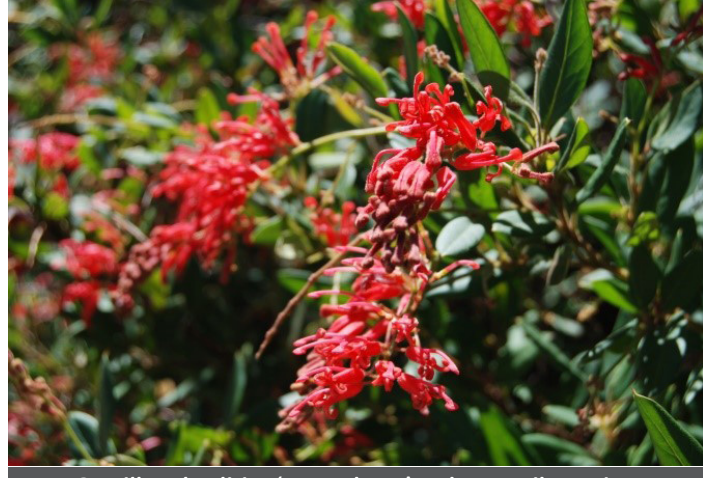
Grevillea rhyolitica 'Deua Flame'