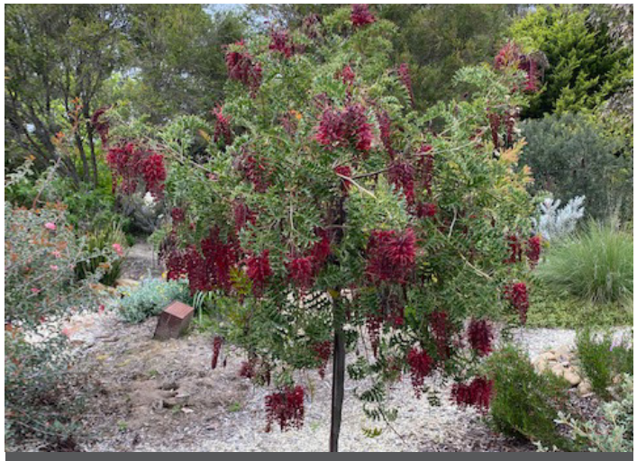
Grevillea 'Ray Page'

I have been having much better results with my grafting this year. I just wish I had a few more Silky Oaks, but I am managing OK. I have been growing on some Silky Oaks to make standards up to 1.2m tall for Grevillea bipinnatifida and G. thelemanniana type varieties. I was thinking of making a 'Ray Page' standard for you and could do the grafts shortly as the stocks are coming along well. Would you know if the dark red G. bipinnatifida to the left front of your house is 'Ray Page'? I always found this one striking.