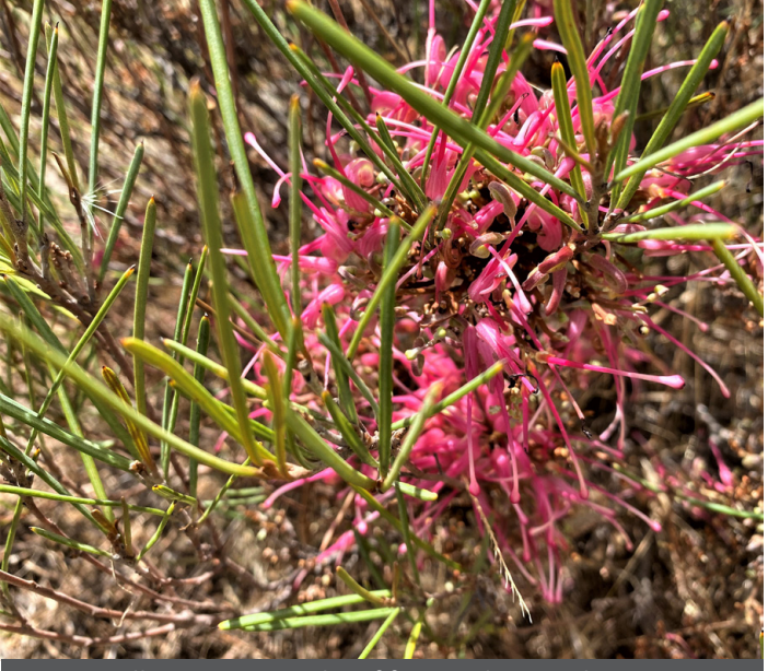
Grevillea oncogyne - dwarf form - Photo Neil Marriott

Following the wettest year ever recorded for the region, our Grevilleas have mostly thrived with the soaking rains. Now at the height of summer, numerous species are flowering superbly due to the good subsoil moisture levels. Our huge stand of self-seeding Grevillea magnifica have been flowering heavily right through winter, spring and still continue into summer. Other notable species in flower now are Grevillea oncogyne –a distinct dwarf race that Wendy and I discovered in 2003 on Nindilbillup Rd, NE of Ravensthorpe, WA. Peter and I suspect that this warrants recognition as a new species. It appears to be root suckering.