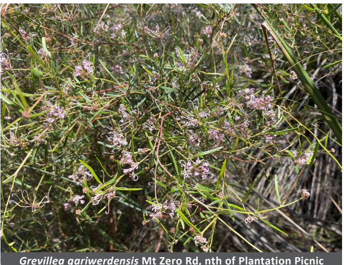
Grevillea gariwerdensis Mt Zero Rd, nth of Plantation Picnic Ground - pale pink form

The largest population of Grevillea gariwerdensis occurs along the Mt Zero Rd, just north of Plantation Picnic Ground, but sadly two thirds of this population was burnt out several years ago during an out of control "control burn"!! The great surprise for us was the abundant evidence of seedling recruitment over the several hectares of this population, which is very important because this population contains plants that range in flower colour from pure white, through beautiful shades of pink, to a deep pinky-mauve. Material from all perimeters of the population was collected to ensure as wide a genetic diversity as possible.