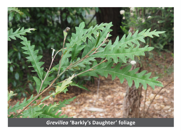
Here are some of the differences which together distinguish the species from the hybrid.