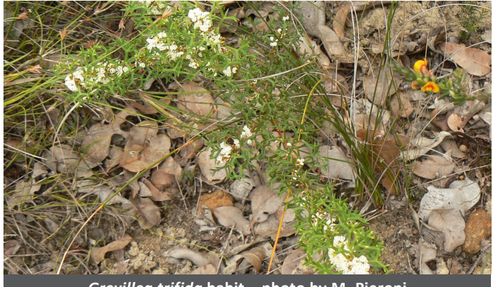
Grevillea trifida habit

There are more than 20 plants in the Pea (Fabaceae family) but few in Proteaceae despite the fact that the soil is laterite gravel and clay. There are two dryandras, two hakeas, one banksia, one petrophile, one synaphea and only one grevillea, Grevillea trifida. G. quercifolia grows less than a kilometre away, so I have propagated and planted that one in my 'garden' section. I planted a small area with other western Australian plants in order to paint them when they flowered.