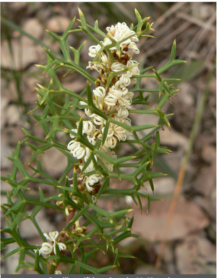
Grevillea trifida