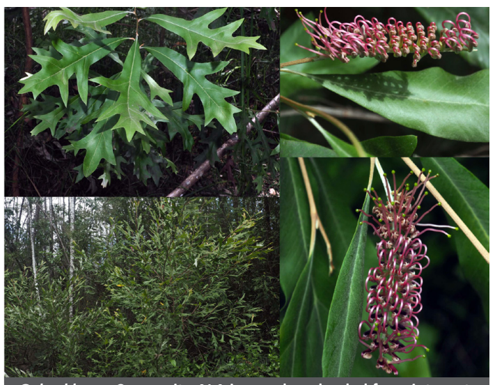
G. barklyana Composite