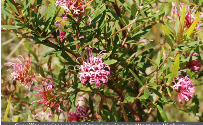
Grevillea sericea ssp sericea growing on Western Highway, Stawell, Vic.

Late last year I stopped on the Western Highway near the caravan park at our turnoff and discovered a fairly large population of Grevillea sericea ssp sericea. This site had been scalped of its original native vegetation, which includes lovely low plants of the local Grevillea alpina . I was amazed to find, in the stony clay subsoil a mass of established plants and many seedlings of both G. sericea and G. alpina, not root suckers. It is probable that the G. sericea arose from garden plants growing in the adjoining caravan park. The G. alpina seedlings from adjoining indigenous plants There are also numerous plants of Gastrolobium celsianum Swan River Pea, a WA species also planted in the caravan park. This clearly shows the colonising ability of many of our Grevillea species.