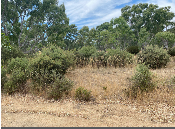
Grevillea arenaria ssp canescens population on Moyston Rd