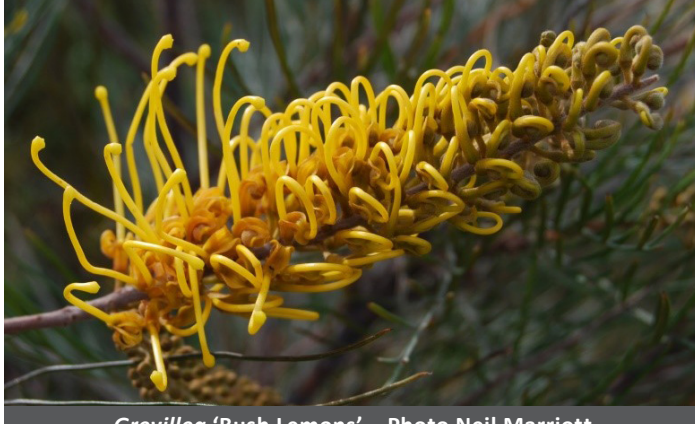
Grevillea 'Bush Lemons'