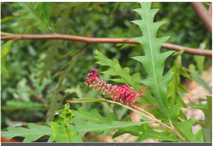
Grevillea 'Barkly's Daughter'

The earliest reference to Grevillea barklyana in horticultural catalogues is a Boddy's Eastern Park Nursery list dated 1960–61. On P.25 they list for sale G. Barklyana 'Large-leaf Grevillea' and it must be presumed that this was the true species. The hybrid, for which I here suggest the name 'Barkly's Daughter', has largely replaced the species in catalogues from c. 1990. Norwood catalogue list from 1981 suggests a label for the true species was still in demand, though no reference specimen is available. What then the origin of G. barklyana hybrid which has persisted in horticulture to the present. Where did it come from and who introduced it. Unfortunately, I have not been able to trace its source.