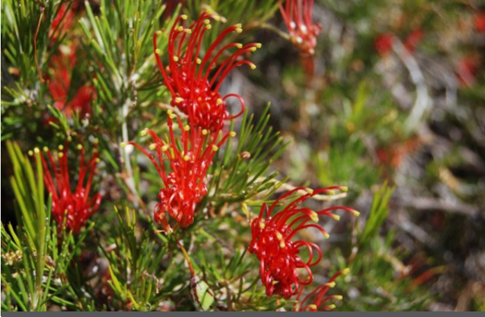
Grevillea beardiana – Peak Charles form Neil Marriott

This beautiful small shrub comes from the southern wheatbelt region of Western Australia. In cultivation it grows to around 1m tall and 1.5m wide, with fine soft green leaves and masses of very showy toothbrush flowers from autumn right through to spring. Flowers can be bright scarlet or showy orange in colour and are very popular with our honeyeating birds. Sadly it is not very common in cultivation at present, but can be occasionally available, usually as grafted plants at specialist native nurseries.