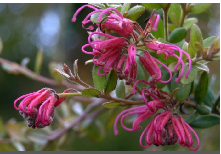
Grevillea 'Collaroy Plateau'

Grevillea 'Collaroy Plateau' grows best in a dappled shade location, and coming from Sydney, it prefers an occasional drink over our long hot summers. This also ensures a continual show of its lovely flowers while there is still some moisture in the soil. It propagates readily by cuttings, and is often available at both specialist and general nurseries, or you can easily strike some cuttings yourself!