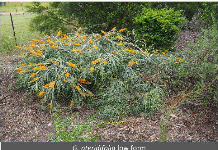
G. pteridifolia low form