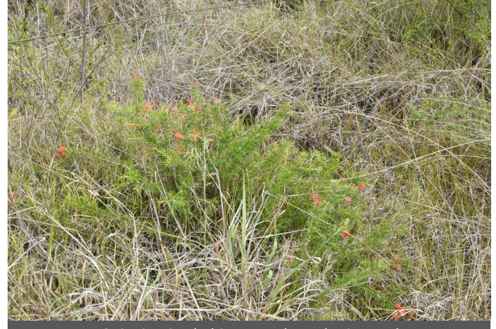
G. juniperina habit at Bandon Rd, Vineyard

From these I will select the best representatives of each number and use them as stock plants from which I can produce more plants. These will then be planted in gardens and revegetation sites and be available for future conservation, research and distribution to those who may be interested in acquiring this species."