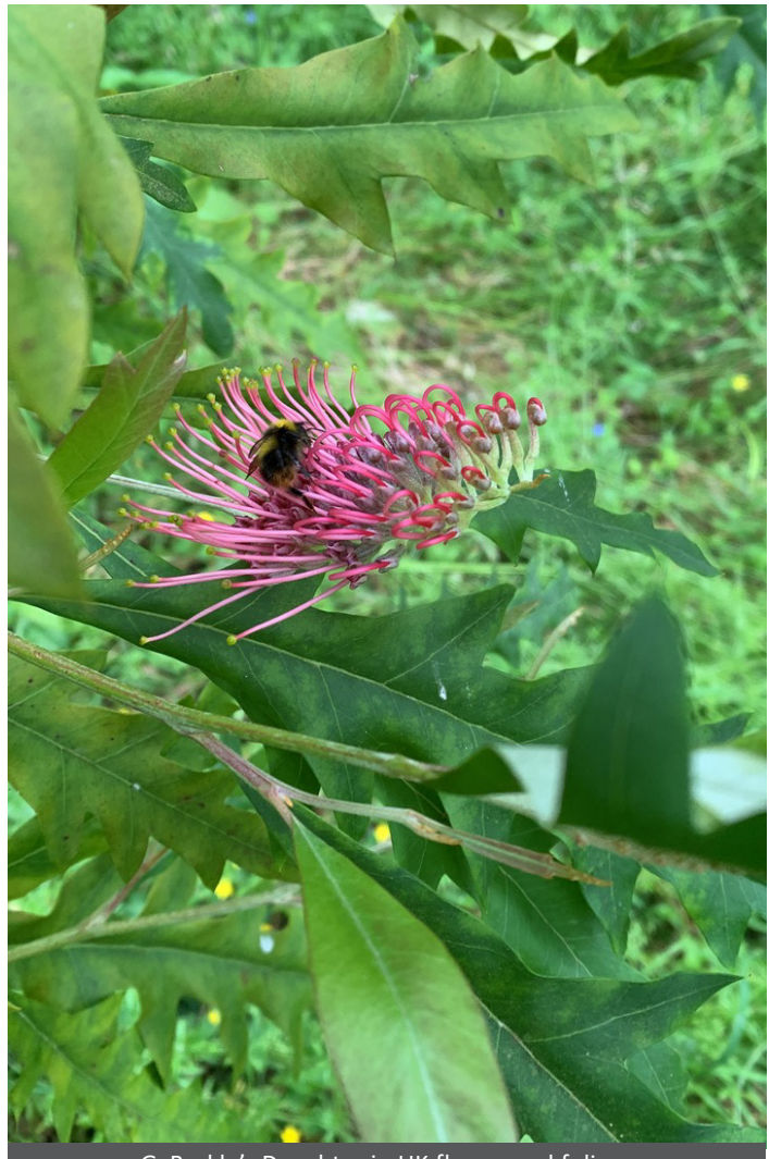
G. Barkly's Daughter in UK flower and foliage

So, I think my plant, and probably one I photographed in Cornwall (Tregrehen Garden) last year, are likely to be G . 'Barkly's Daughter'. I'd be grateful for an expert opinion as when I tried to compare flower colours I got in a tangle. I know photos can be misleading when it comes to colour. The styles of the inflorescence on my young plant look a richer pink in photos than they do in reality. I shall be really pleased when the book on hybrids is published!