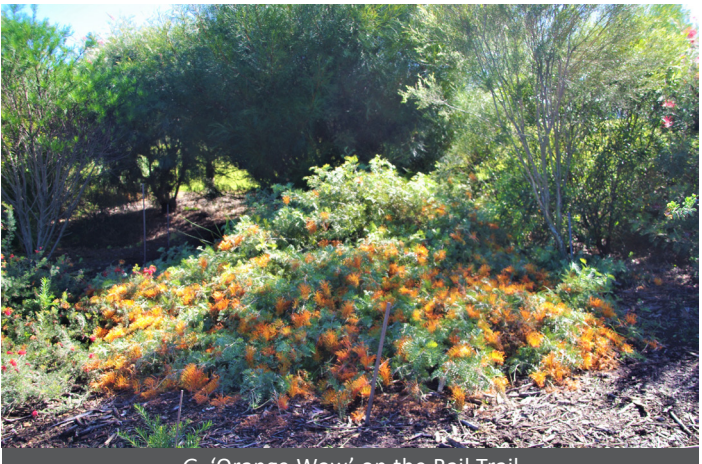
'Orange Wow' on the Rail Trail