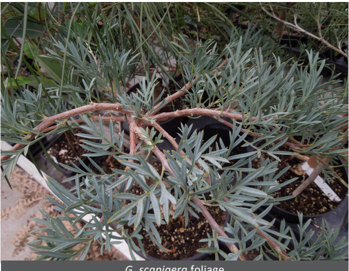
G. scapigera foliage