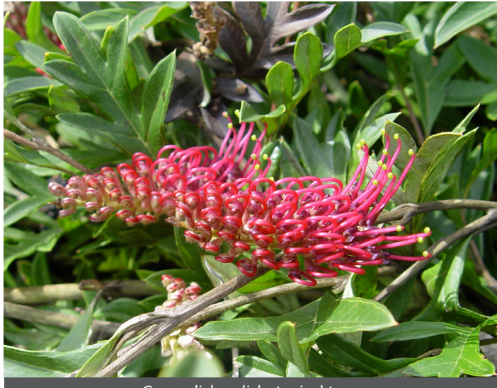
G. gaudichaudi, botanical type

The cultivated plants usually take their form from a single plant which has been propagated over and over. This is the plant that can be regarded as the horticultural type of G .'Gaudiichaudii'. It is not the same as the botanical type, a picture of which is included here, and which is very different. In recent years, after the wild location was revealed, some nurserymen thought it might be a good idea to go recollect specimens from the different plants in the wild population.