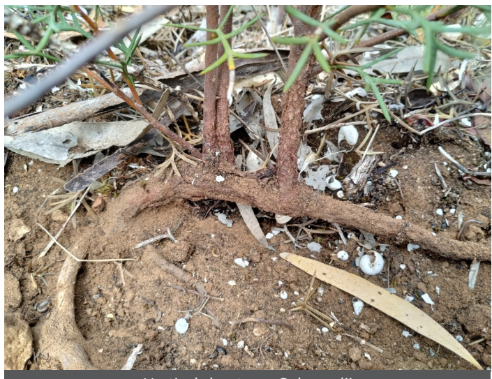
Vertical shoots on G. huegeli

I have spent a week in April at my property and on one of my morning walks, I noticed that one of my Grevillea huegelii plants appeared to be suckering. Careful (and at times painful!) scraping away of the soil around the base of the plant has revealed a horizontal root with a couple of vertical shoots on it.