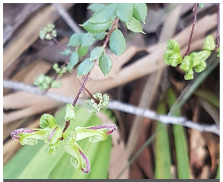
Green Spider Flower growing at the base of the Yellow Bloodwood

be thriving and has also produced a couple of flower heads! I'm really looking forward to seeing all the plants in flower as it will be very special in such a lovely bush setting.