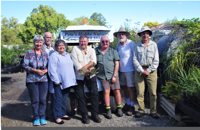
GSG members on the Rail Trail

This photo, taken on the Rail Trail, appeared in the local Lowood newspaper with an article by West Morton Landcare.