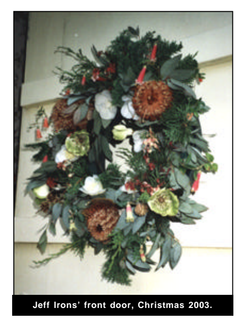
Grevillea lanigera x rosmarinifolia Correa pulchella Correa pulchella York Peninsula form Correa pulchella Marge's Marvel Banksia ssp Eucalyptus leaves

Grevillea alpina, A. Goldfields, Olympic Flame, aquifolium, arenaria, arenaria ssp. canescens, aspleniifolia, Robyn Gordon, Austraflora Copper Crest, australis var. brevifolia, banksii, banksii var. forsteri, Canberra Hybrid, banyabba, barklyana, baueri, beadleana, bedggoodiana, bipinnatifida, Bonnie prince Charlie, Bronze Rambler, Canberra Gem, Clearview david, confertifolia, Copper Crest, Cranbrook Yellow, crithmifolia, confertiloba, difusa ssp. evansiana, drummondii ssp. pimeleoides, endlicheriana, Evelyn's Coronet, Fanfare, fulgens x gaudichaudii, Honey Eater Heaven, Honey Gem, involucrata, johnsonii, juniperina ssp. amphitricha, f. sulphurea, Molonglo, lanigera, lanigera Lutea, Mount Tamboritha, lanigera prostrate, laspicalla (I have told the plantfinder that this is probably a mis-spelling of iaspicula), levis, longistyla, Majestic, mason's Hybrid, monticola, Moonlight, nudiflora, obtusifolia Gingin Gem, olivacea Apricot Glow, Orange Marmalade, paniculata, Pink Lady, Pink Surprise, Poorinda Elegance, Poorinda Peter, quercifolia, repens, rhyolitica, robusta, Robyn Gordon, (?Poorinda) Rondeau, rosmarinifolia, ros. Desert Flame, ros. Jenkinsii, Sandra Gordon, ScarletSprite, x semperflorens, sericea, shiresii, Sid Reynolds, Spider Man, Splendour, thelemanniana thel. Spriggs Form, thyrsoides, tridentifera(???), Grevillea victoriae, williamsonii.