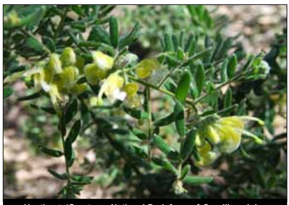
Heathcote/Graytown National Park form of Grevillea alpina

From here Wendy and I had to head off home, this time via Heathcote/Graytown National Park. After driving for many kilometres through the Park finding nothing but thousands of seedlings of Grevillea alpina , we finally came upon a small flowering population of what appeared to be an unusual form of the 'Goldfields form' of Grevillea alpina . The plants were still only young, but were strongly arching with broad grey-green leaves and hairy green and cream or yellow-green and cream flowers in small loose pendant heads. Flower buds were particularly hairy, with long white hairs.