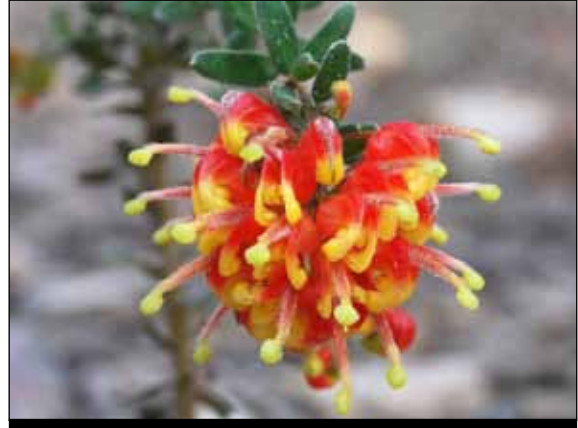
Grevillea alpina Mt Ida