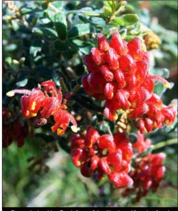
Transmission Line Track form of the 'Northern Victorian form' of Grevillea alpina

We then drove to Carboor East where on Transmission Line Track we found dense rounded shrubs to 0.5m of the 'Northern Victorian form'. These were also reproducing by suckers as well as seed, and the plants located in the cleared site under the transmission lines were most attractive, with broadly ovate grey-green leaves and bright but dusky red flowers with a small yellow limb in long tight racemes.