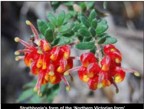
Strathbogie's form of the 'Northern Victorian form' of Grevillea alpina

Continuing on NE along the Hume Highway we next turned off at Euroa along the Strathbogie Rd. Just below Kelvin's View there is a lovely area of bushland with a good population of the typical Strathbogies form of the 'Northern Victorian form' of Grevillea alpina . These very showy plants were erect open shrubs to 1.5m with orange to bright red flowers with a yellow limb.