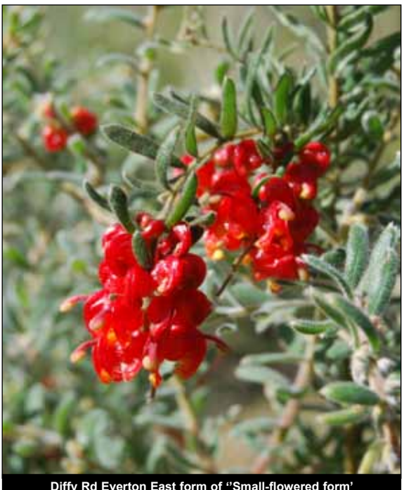
Diffy Rd Everton East form of "Small-flowered form" of Grevillea alpina

From here we continued heading north-east, and met up with Martin Rigg at Diffy Rd Everton East where we found extensive populations of the wonderful 'Small-flowered form' of Grevillea alpina . This form is so distinct and with so many unique characters that it may become a new species under our revision. The plants were upright open and weeping, growing 0.5-1.2m with massed bright red to orange flowers in prominent long clusters. There were many seedlings but no evidence of suckering with this population.