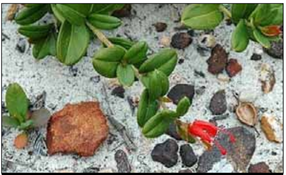
Grevillea nudiflora subsp nov x G infundibularis Mid Mount Barren

In our living Grevillea collection at Panrock Ridge I have over 7 distinct clones of Grevillea nudiflora from a range of sites along the south coast of WA. Examination of these has confirmed at least 8 clear characters that readily separate Grevillea nudiflora 'subsp nudiflora ' from Grevillea nudiflora subsp nov . This includes a dense appressed white indumentum on the lower leaf surface of subsp nudiflora compared with subsp nov –Mid Mt Barren that is glabrous on the lower surface. I will confirm these characters with specimens in the Perth Herbarium later this year and will be publishing this as a new subspecies for Western Australia in a revision of this species.