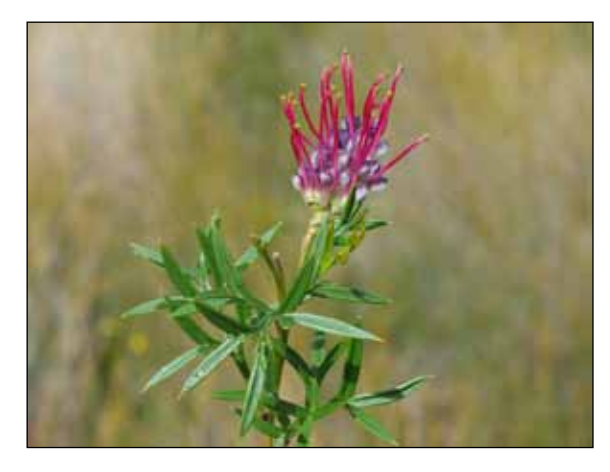
The GSG SEQ excursion in November is expected to visit this site and either confirm or amend this identification.