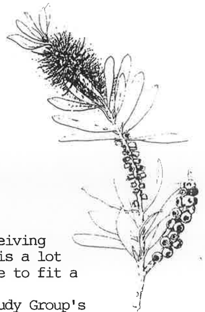
Wallum bottlebrush Callistemon pachyphyllus