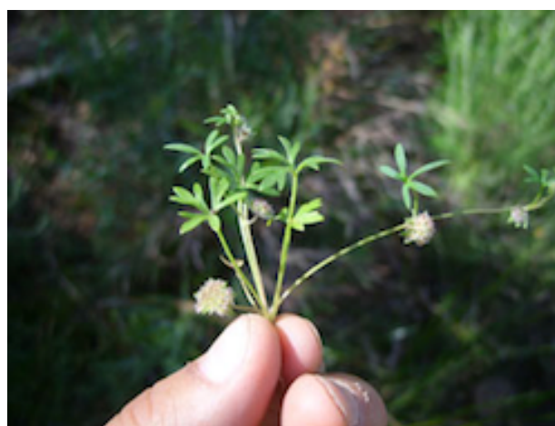
Leaves and flower heads of A. gibbonsii