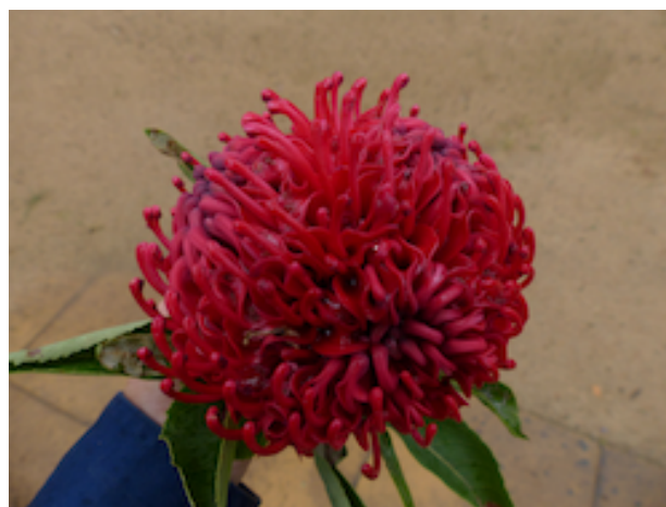
Telopea flower with three crowns

This is an old T. mongaensis x speciosissima hybrid. We are growing it at Gloucester in full sun, and it has been very successful. The flower is somewhat smaller than T. speciosissima but a very good deep crimson/red. Our biggest bush is way over 2m when in flower, and has been covered in flowers for 2 years now. We didn't count but it would have been 30-40 flowers this year. The flowers were a little smaller than last year, possibly because of the drought, we thought. We prune it heavily after flowering. We also sell flannel flowers. They are cutting-grown, with stock plants from a few different sources.