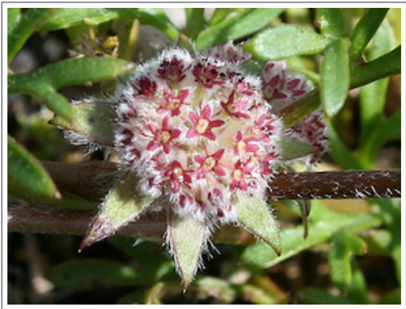
Actinotus gibbonsii

Attached with this newsletter is a pdf. Effect of slow release fertiliser on the growth of containerised flannel flower.