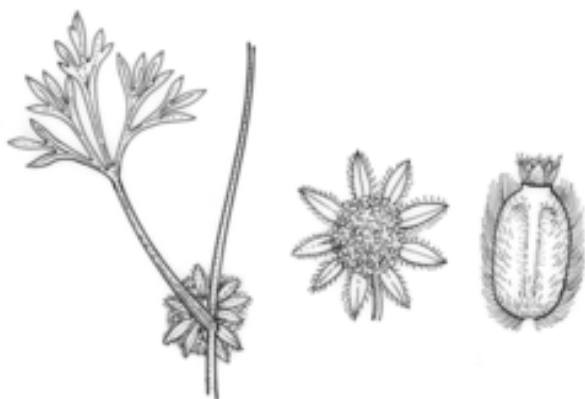
Actinotus gibbonsii plant parts

The dwarf Flannel Flower is a small annual with flowering stems reaching 30cm in height. The dissected 2-3 lobed leaves are divided twice and can grow up to 15mm long on stems ranging from 4.5mm - 22mm in length. The pinkish flowering heads range from 3mm - 8mm in diameter with 7 - 9 short narrow lanceolate almost inconspicuous green hairy bracts that are joined at the base. The tiny black hairy seeds are about 2mm in length.