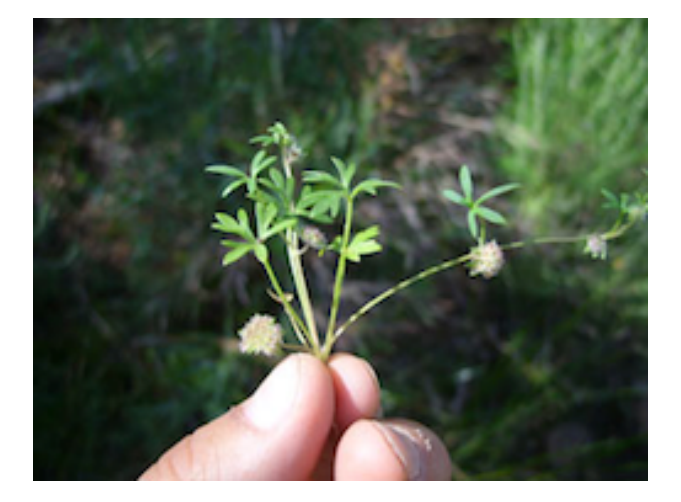
Leaves and flower heads of A. gibbonsii

The University of Sydney's EBOT Plant sciences Collection has it listed as not cultivated. Their specimen came from the Boyd River in Kanangra-Boyd National Park where it was found growing in low open heath on a granite rocky outcrop among Kunzea, Baeckea and Leptospermum species. Occurrence was rare.