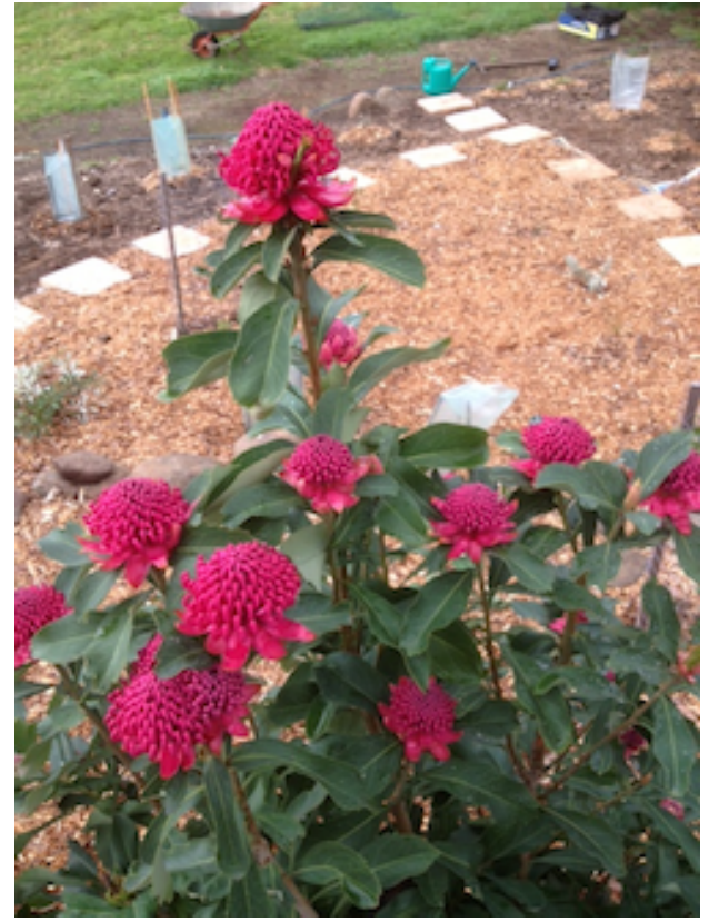
Here is a photo of our Telopea speciosissima x oreades in full bloom right now. What a feature plant. It has around 30 blooms this year, its second year of flowering. Our T. mongaensis is about to flower as is our T. 'Braidwood Brilliant'. Conditions here seem to suit the waratahs.