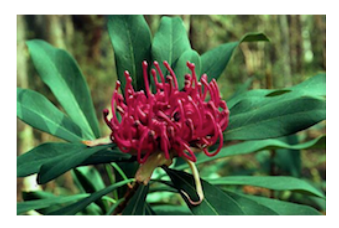
Telopea oreades

Natural hybridisation combining characters of both species have been observed in this area.