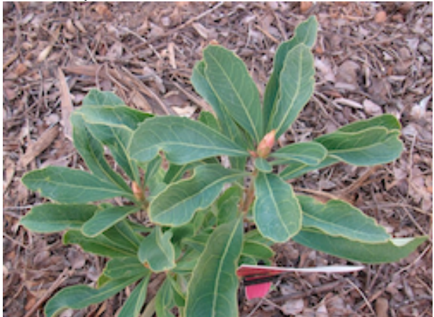
Ed: Aren't you nice! If these are flower buds and not leaf buds then you will have autumn flowers. However, don't hold your breath. Waratah flower buds usually start in autumn for a spring flowering. Sorry to be a little pessimistic but I suspect these to be leaf buds. However you should know in a short time. If they haven't opened up within a few weeks then Hooray! you will have some autumn flowers.

We are all excited as it looks like we do have buds on our Waratah Flowers. They all have these little buds on them but some are larger and pinkish looking. These two are both Shady Lady Reds. The second is definitely bigger than the first and actually has another tiny bud next to the largest one. We are very happy here because our grass trees have developed flower spikes. We are looking forward to seeing the flowers as I have never actually seen the flowers before. If we are successful with our Waratahs it will be because of your excellent advice.