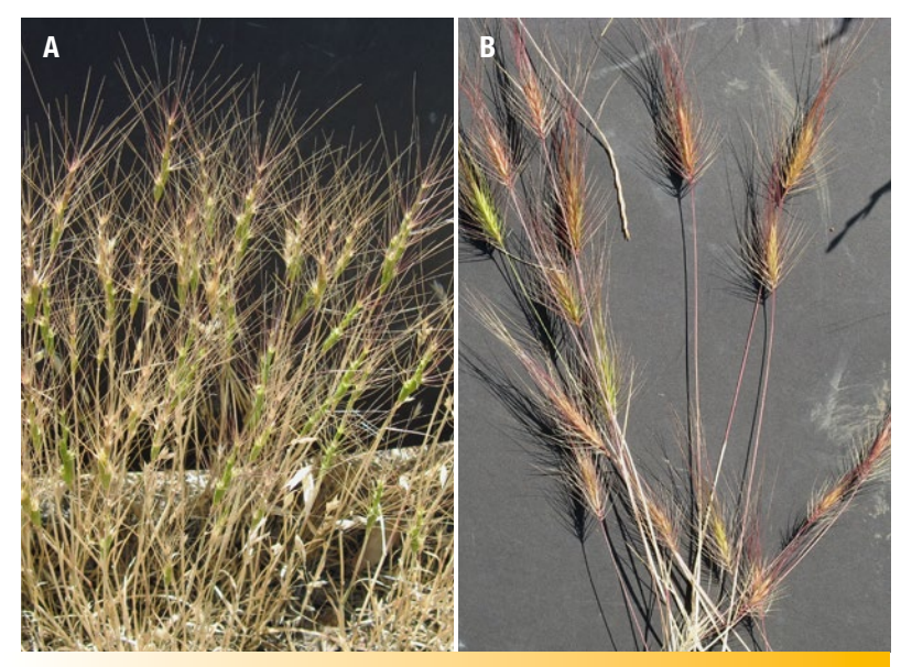
Figure 5. Barb goatgrass (A) and medusahead (B) after the period at which they are susceptible to mowing or grazing treatments.

To better understand the timing of phenology of these two grasses in California, UC researchers measured the proportion of barb goatgrass and medusahead at various times through the growing season. Included were 18 locations in 11 counties from Shasta to Monterey at elevations from 80 to 990 feet above sea level during the growing season from 2006 to 2010. Whereas medusahead was present at all sites, barb goatgrass was present in samples taken from Tehama County to Yolo County. The limited range of sample locations for barb goatgrass reflected the more restricted range of this species compared with medusahead (see Brownsey et al. 2016 for more details on the methods of this study).