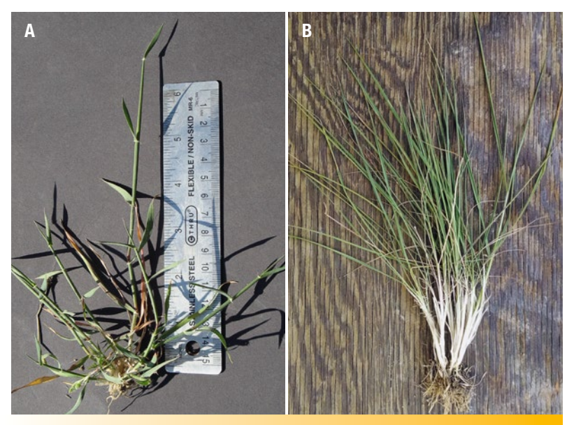
Figure 2. Barb goatgrass (A) and medusahead (B) in the boot stage (V3), when grazing treatments should be started.

The stages in table 1 provide a framework to describe how both of these species progress and change in their physical characteristics over the course of the growing season. The 12 stages are broken into vegetative stages V1 to V3, reproductive stages R4 to R9, a mature stage M10, a summer dry stage D11, and dead residual in the subsequent growing season at stage L12. Defining these stages helps to optimize the timing of grazing and mowing control treatments by defining the windows of susceptibility.