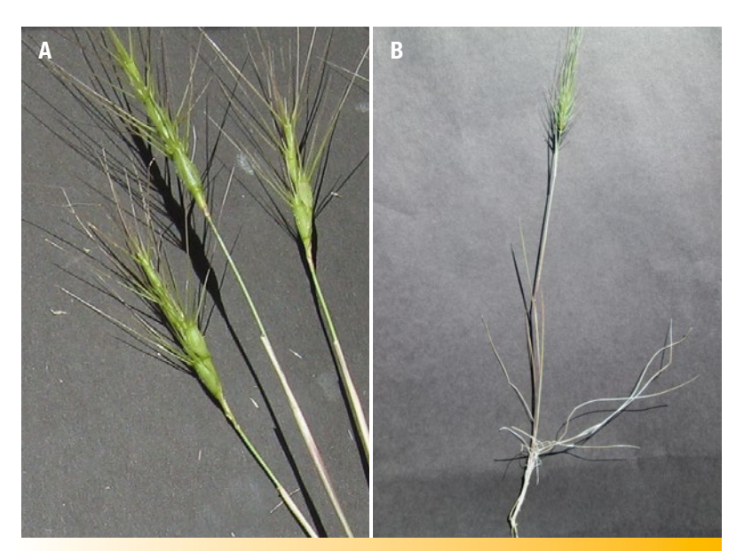
Figure 4. Barb goatgrass (A) and medusahead (B) with browning stems while the spike (seedhead) is still green, indicating the end of the period appropriate for mowing.

After the onset of the R4 stage, the ability of these species to recover from defoliation is greatly reduced, which makes mowing a very successful treatment tool for both barb goatgrass and medusahead in the reproductive stages. Mowing prior to the R4 stage is largely a wasted effort as the plants will likely recover unless mowed again. The emergence of anthers can be a good visual indicator that the best timing for mowing has been reached. While not yet fully mature, once the seed has reached its full length (not obvious, but the kernel occupies the full length of the palea) in the R8 stage (fig. 4), the seed is able to continue to develop and become viable if spikes detach from the plant. This can be visually