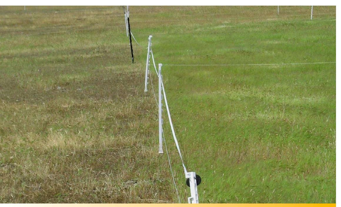
Figure 6. Timed grazing of medusahead (left side of photo), showing appropriate targeted grazing leaving residual forage of about 500 pounds per acre; ungrazed medusahead (right).

V3 to R4. To overcome this aversion, heavy stocking rates that far exceed rates considered normal for annual rangelands are required to encourage enough consumption to impact seed production. For grazing to be successful, plants must be impacted enough to prevent the onset of seed set. This is possible because these two species tend to mature so late in the season that soil moisture is not present in adequate amounts for plant recovery (DiTomaso et al. 2008), although this is not the case every year. The rate is determined by the forage biomass present, but it often exceeds 1 to 2 animal units (mature cow) per acre during the critical V3 and early R4 stages. This high rate is necessary because of the short window and amount of forage that needs to be removed. The objective is to consume