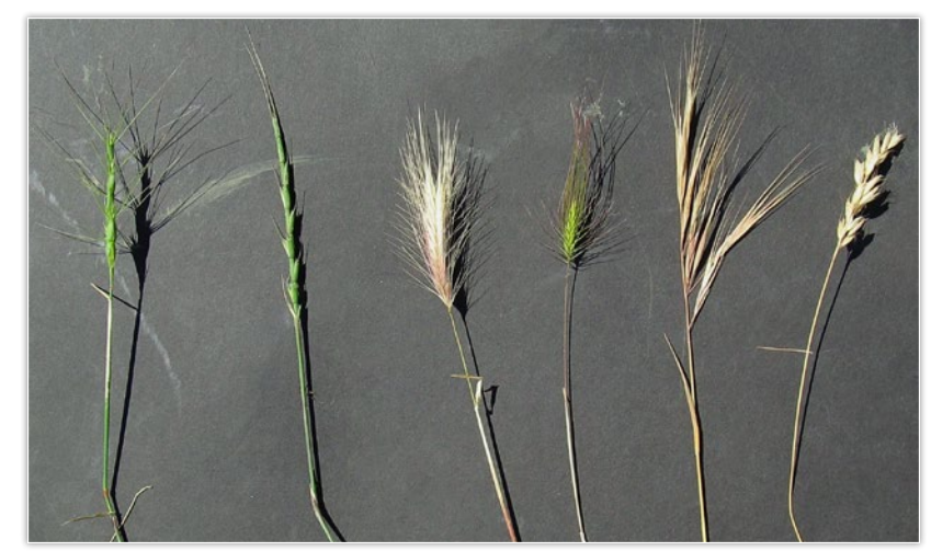
Figure 1. Barb goatgrass and medusahead compared with other common annual grasses, showing a later phenology. Left to right: Barb goatgrass, jointed goatgrass, hare barley, medusahead, ripgut brome, soft brome.

Barb goatgrass primarily occurs in California, although there are records from Washington, Oregon, and Nevada, as well as from some mid-Atlantic states (Meimberg et al. 2006). Medusahead is widespread in California and the Intermountain West, occupying roughly 2.4 million acres across the western United States (Duncan et al. 2004). Estimates for the extent of barb goatgrass infestation are not currently available, though it is much less widespread than medusahead. Barb goatgrass is a B-rated noxious weed and medusahead is a C-rated noxious weed in the State of California, meaning that they both cause economic or environmental detriment. Barb goatgrass has a higher rating due to its more limited distribution and, therefore, greater opportunity for containment than