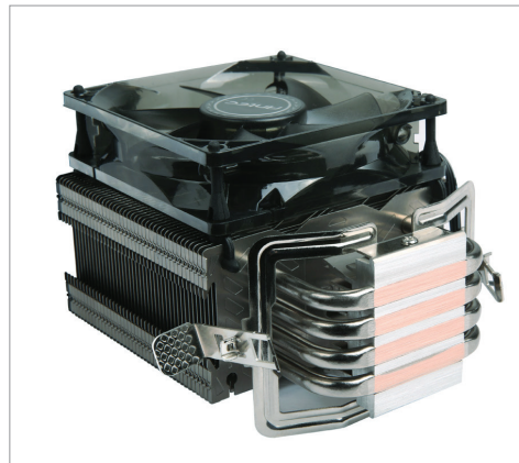
Straight Touch copper coated heatpipes provide full contact to the CPU, for more efficient heat transference