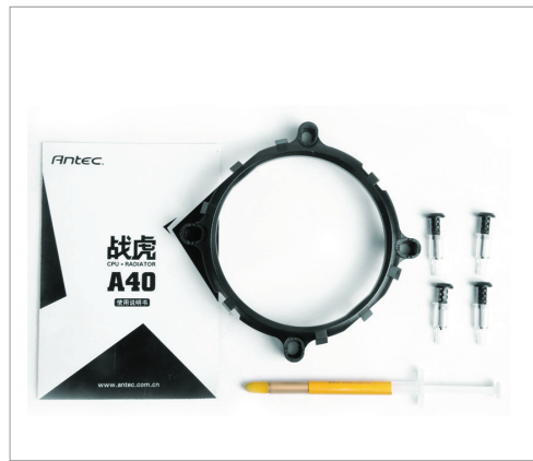
Compatibility with Intel and AMD platforms, and the push-pin mounting system and included thermal paste make for a fast, simple installation