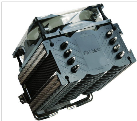
Aluminum oxide coating on the top fin boosts the efficiency of heat transfer and prevents oxidation