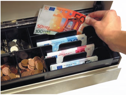
Stage 1: Place the notes in the rear compartment during a transaction.