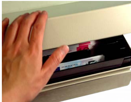
Stage 2: Close the cash drawer.