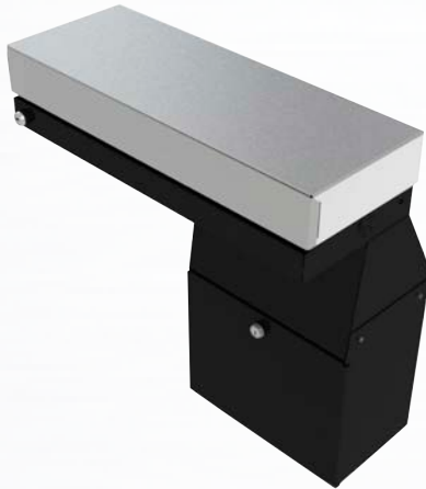
Stage 4: Notes skim into the secure Cash Box beneath the cash drawer. (This image shows a high capacity self-locking Drop Box.)