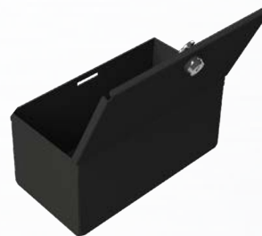
Stage 5: Remove the Cash Box from the Drop Box to access or remove notes.