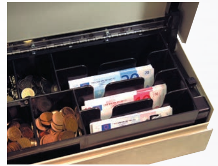
Stage 3: Notes have gone.