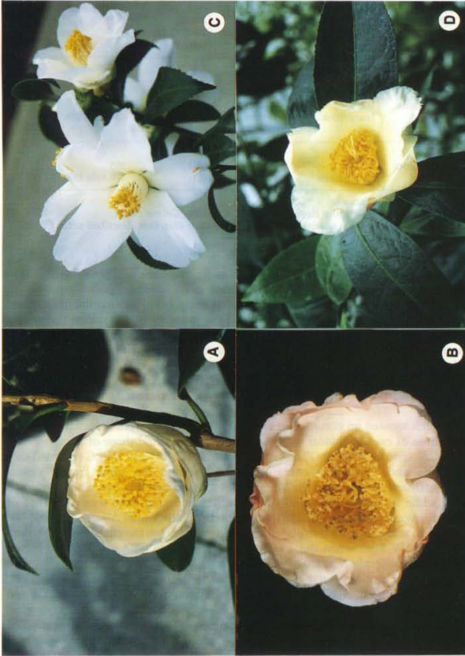
Fig. 1. Flowers of C. japonica cv. Shiratama (A), C. japonica cv. Chochidori (C), F 1 hybrid of C. japonica cv. Shiratama × C. chrysantha (B), and F 1 hybrid of C. japonica cv. Chochidori × C. chrysantha (D).