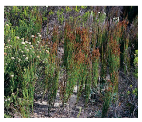
Elegia microcarpa in coastal dune vegetation at De Hoop. Coastal sand restios typically spread by underground rhizomes that form mats