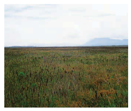
Seasonally inundated flats at Cape Point, with Elegia cuspidata and Elegia filacea forming extensive monospecific stands