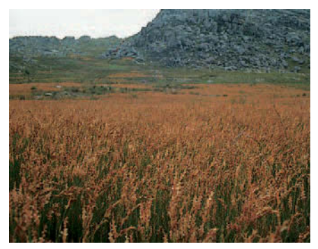
Sandy plains in the Slanghoek mountains with large stands of Elegia spathacea