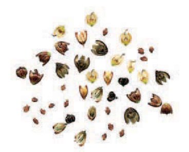
A variety of restio flowers

Restionaceae are dioecious, i.e. male and female flowers are borne on separate plants. This may function primarily in preventing the plants from fertilizing themselves, but at the same time has led to morphological specialization of the different roles of male and female flowers.