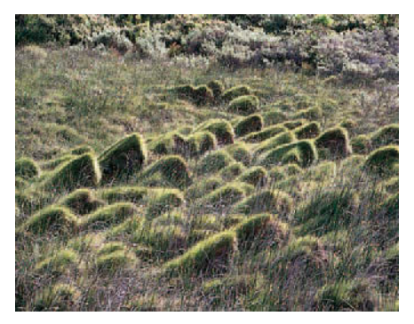
Seepage vegetation on Table Mountain, with hummocks of Anthochortus crinalis