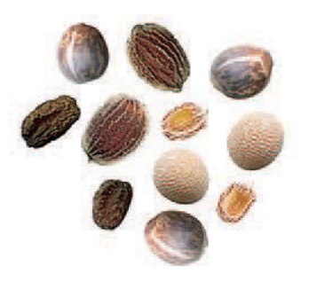
Seeds x 5

This ornamentation can best be seen under a magnification of \times 10 or more. The purpose of the ornamentation is obscure, but a clue may be found when looking for the seed on the sand around the base of the plant: it is almost invisible. The seed is the same size as grains of sand, and the texture and shape mimics such grains. So this is possibly a means of camouflage. How the seeds are dispersed from the parent plant is not quite clear, as there are no obvious dispersal agents.