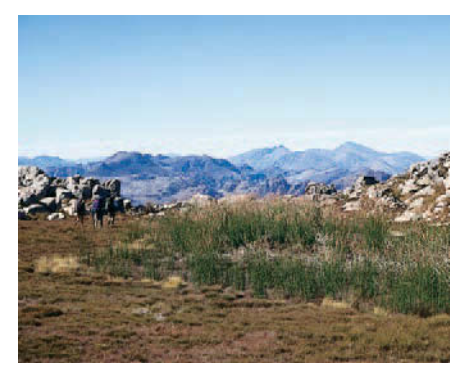
A seepage on the Hexberg, Bokkeveld mountains, with Elegia grandispicata fringing the wet centre of the seepage