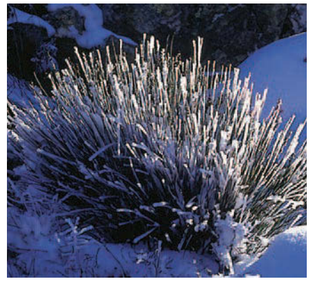
An ice-encased restio on Groot Winterhoek near Tulbagh