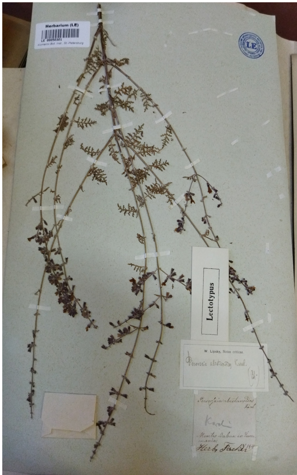
FIGURE 6. Lectotype of Perovskia abrotanoides Kar. (LE00050301!).

4. Salvia ariana Hedge, Notes Roy. Bot. Gard. Edinburgh 26: 417. (1966)