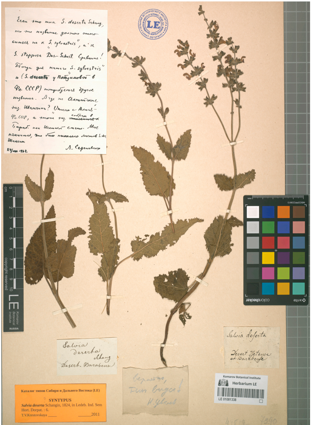
FIGURE 5. Neotype of Salvia deserti (LE01081338).