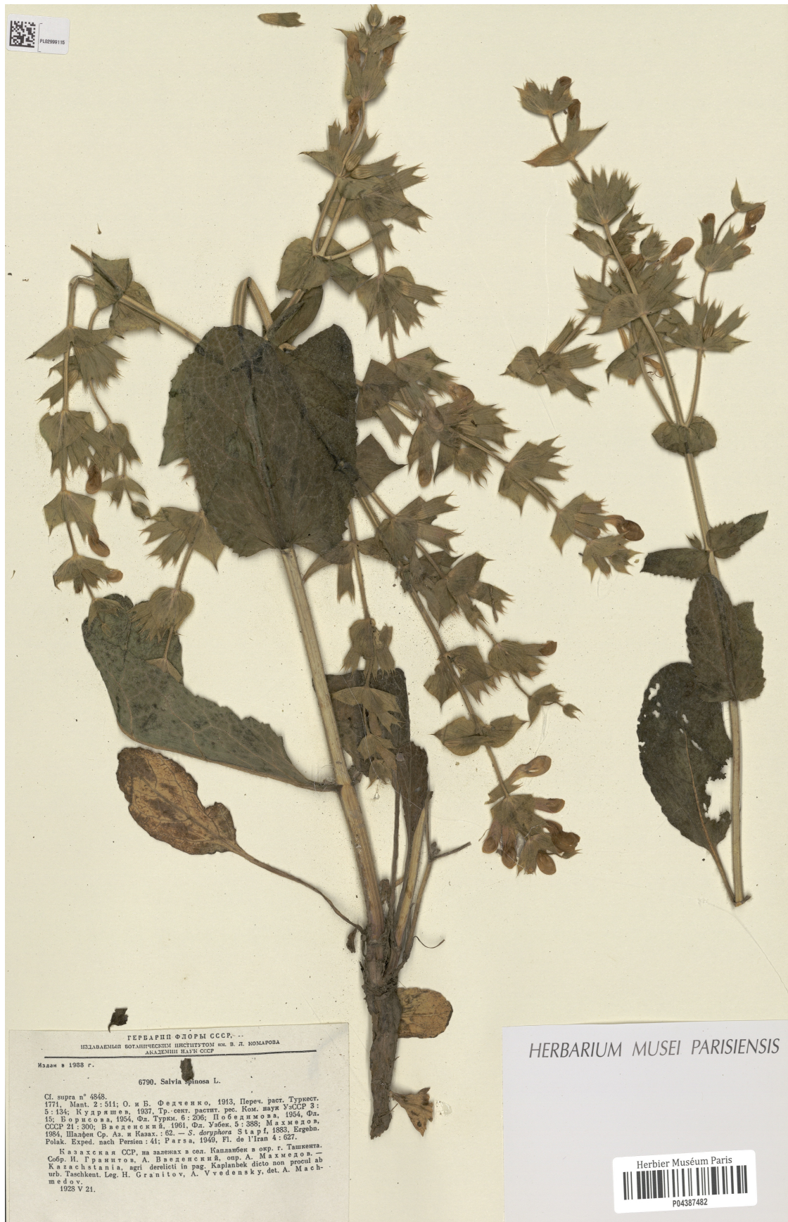
FIGURE 2. Salvia spinosa L. (P04387482) http://coldb.mnhn.fr/catalognumber/mnhn/p/p04387482

studies. Therefore, we did not attempt to apply infrageneric classifications in this study. To better understand Salvia evolution and to make correct infrageneric classifications, we should include as many species, especially endemics, as possible from Central Asia in future molecular phylogenetic studies.