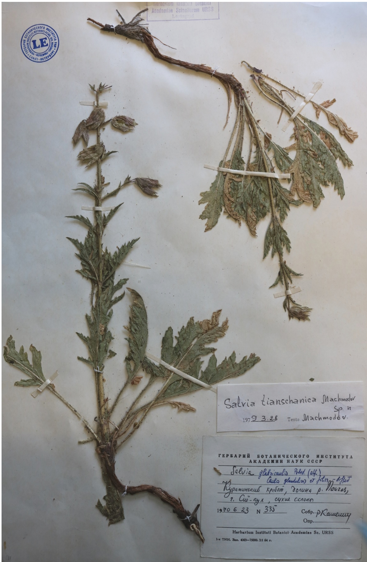
FIGURE 3. Salvia tianschanica Makhm. Paratype (LE0052465).