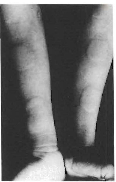
Fig. 1 The forearms where the ice cube test was performed.