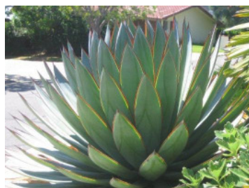
photo: Agave x 'Blue Glow' , Village Nurseries , www.villagenurseries.com

John Black Verdance Landscape Design Palo Alto, CA verdancedesign.com