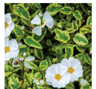
photo: Cistus 'Little Miss Sunshine' , Sunset Western Garden Collection , sunsetwesterngardencollection.com

4. Cistus 'Little Miss Sunshine' , LITTLE MISS SUNSHINE ROCKROSE : An excellent size for smaller gardens or for repeating in the landscape, with beautiful yellow/chartreuse foliage and a nice, neutral white flower.