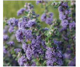
photo: Ceanothus 'Valley Violet' , Devil Mountain Wholesale Nursery , www.devilmountainnursery.com