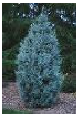
photo: Cupressus arizonica var. glare 'Blue Ice'

Cynthia Tanyan Mozaic Landscapes Sunol, CA mozaiclandscapes.com