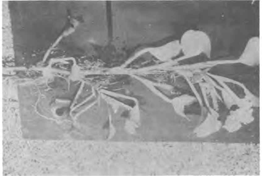
Eichhornia azurea , a native to South America, is another threat to the waters of the Southeastern United States.