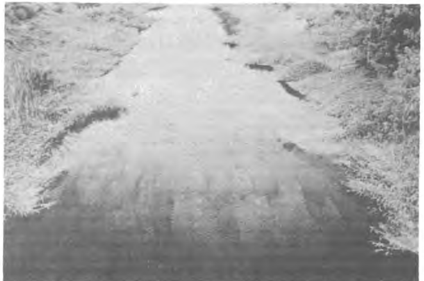
Hygrophila polysperma grows to the surface in eight feet deep water in the Felsmere Canal Near Melbourne, Fl. Vegetation breaks loose during high flow and clogs water control structures.