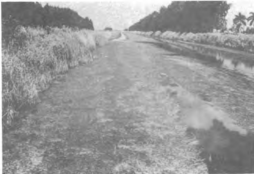
Hydrilla verticillata in North New River Canal, Ft. Lauderdale, Fl. Dense growth such as this are serious flood hazards.

Weed Act (FNWA) stipulates that Federal Noxious Weeds cannot be moved Interstate in the U.S. without a permit from APHIS. However, the legislative history of the Act interprets the restrictions on the interstate movement as applying only to movements of FNWs from areas quarantined under Section 5 of the Act. To date, no FNWs have been quarantined under the Federal Noxious Weed Act. Witchweed [ Striga asiatica (L.) O. Kuntze] in the eastern Carolinas is a Federal Noxious Weed but was quarantined under the Federal Plant Pest Act. Thus, APHIS has not restricted the interstate sale of FNW including aquatic species listed above.