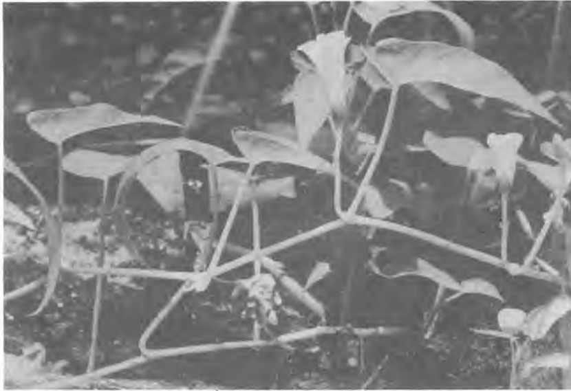
Ipomoea aquatica is already widespread in cultivation in Florida and will likely escape to cause problems in the future.