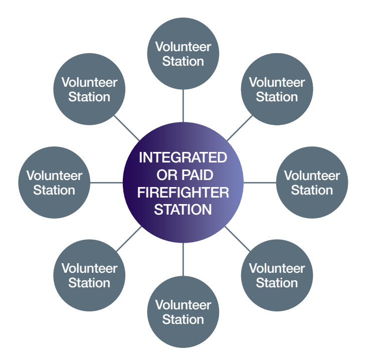
Figure 2: Hub and spoke model

The hub and spoke model provides greater flexibility to the fire services, as it avoids the need to invest heavily in fixed long-term locations that may not be ideal for future needs. The model allows the strategic allocation of resources to maximum advantage. It allows paid and volunteer firefighters to play a more active role at their respective stations, increasing experience and boosting morale. It also eliminates many of the tensions and personnel issues that have plagued some integrated brigades by focusing attention and resources on integration on the fireground rather than at the station.