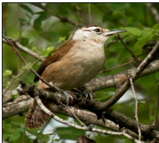
Superciliaried Wren

We played a pygmy-owl tape and several species came in quickly, including: Yellow-olive Flatbill; Golden Grosbeak (Southern Yellow); Tropical Gnatcatcher; Fasciated Wren; Southern Beardless Tyrannulet; Red-eyed Vireo; Saffron Finch; Pacific Hornero, and several Ecuadorian Thrushes. An actual Pacific Pygmy-owl also responded to our tape and was soon followed by another, which was really nice. A Sooty-crowned Flycatcher was also clearly spotted by some participants. We took a trail going up the reserve, looking for a viewpoint to wait and see a flyby of Amazona parrots. The local subspecies lilacina , of the Red-lore Amazon, were migrating, from