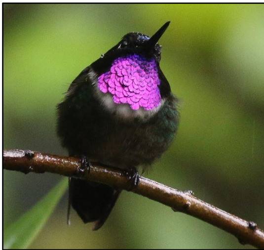
Amethyst-throated Sunangel