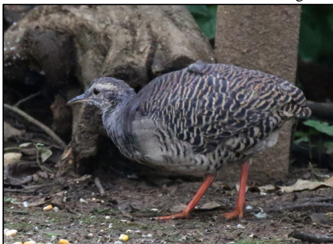
Pale-browed Tinamou by John Hopkins

Guayaquil Squirrels and an unidentified rodent (a small native rat) came to feed as well. It took a little while before the Pale-browed Tinamou showed up but when it did it, we were able to see it from a wonderful perspective. Two or possibly even three Pale-browed Tinamous were present at one point. After this fortunate experience, we successfully targeted a male Slaty Becard along the entrance track. Speckle-breasted Wren and Blackish-headed Spinetail were seen even better than the day before. A cute flock of Grey-cheeked Parakeets were perched on a bare limb and were easily scoped. An adult Bicolored Hawk perched for a split second and flew by us at close range. Other raptors that we saw included Swallow-tailed and Hook-billed Kite, and Harris's Hawk. Amy spotted a nice Black-capped Sparrow that showed itself well. Ecuadorian Piculets were a nice catch-up for Lisl.