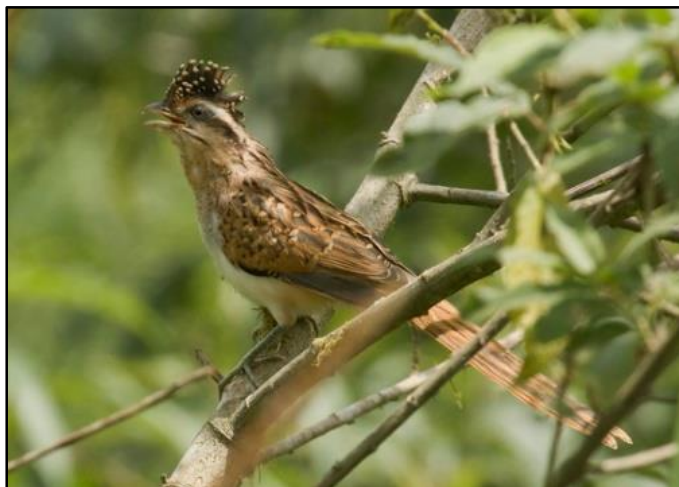
Striped Cuckoo by Dušan Brinkhuizen