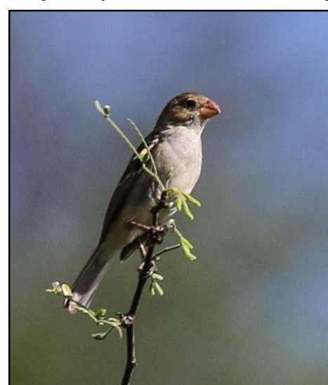
Drab Seedeater