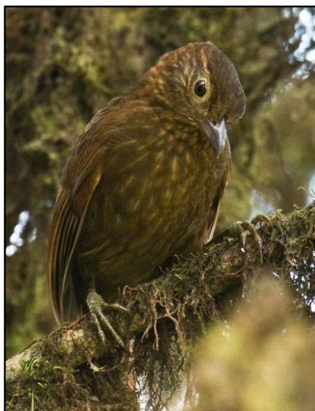
Uniform Treehunter