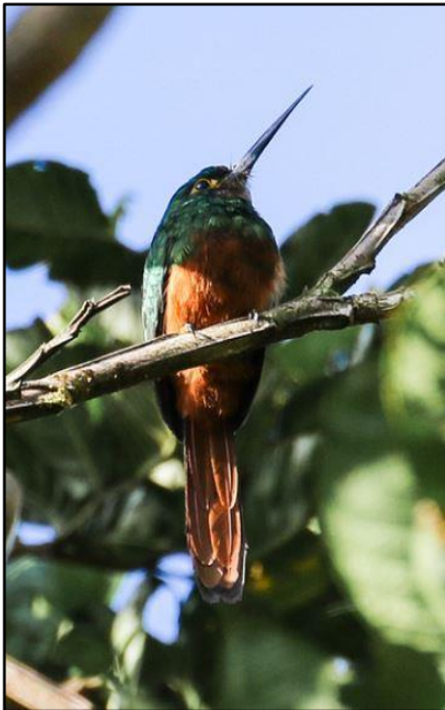
Coppery-chested Jacamar

14 March 2016: Copalinga, Paquisha & Yankuam. The early morning was spent on the Copalinga grounds looking for some of our targets. Some people stayed at the feeders in the hope the Black-throated Brilliant would show up, while others went birding nearby. A female Red Pileated Finch and a Short-crested Flycatcher were seen from the parking lot. A few of us attempted to find the Sharp-tailed Streamcreeper that had been heard two mornings in a row. Our first attempt was unsuccessful, but the second time we went down to the small stream we got stunning views of this attractively spotted furnarid. Just before starting our journey to Yankuam a Coppery-chested Jacamar was located near the cabins. The group was called together and after some minutes of hide-and-see, the jacamar presented itself nicely for all of us to get a look. A great sighting of a fantastic near-endemic species! On our way to Yankuam we made an important birding stop at the cordillera located behind Paquisha. The road conditions were good, allowing us to make it to the end of the track. About half way through, we ran into a small flock of White-breasted Parakeets. This rare and near-endemic species was seemingly difficult to spot (or maybe even absent) at Rio Bombuscaro this time of year, so finding them here was a great bonus. The parakeets were perched for a while and scope views were just