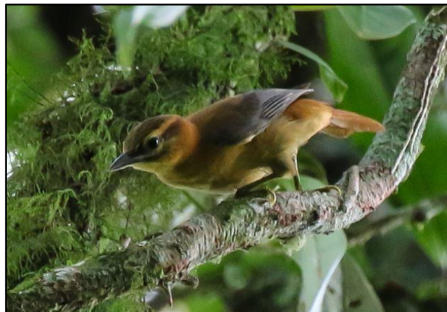
Slaty-winged Foliage-gleaner by John Hopkins

El Oro Parakeet was our next target so Leovigildo brought us to a single occupied nest box which significantly increased our chances of seeing the parakeets. On the way we saw our first Grey-backed Hawk in flight and a Striped Cuckoo showed itself nicely in a bush along the track. We waited for quite a while at the nest boxes but only got a flyby of Red-masked Parakeets. A male Black-and-white Seedeater was a new addition to the list. Nestor had possibly heard the parakeets so we walked up to the forest edge. There was still no sign of the parakeets but a mixed-species flock yielded some tanagers including Fawn-breasted Tanager and Common Bush Tanager (which possibly involves an undescribed west-slope race). A cooperative Uniform Treehunter was a welcomed surprise and showed itself exceptionally well for a treehunter.