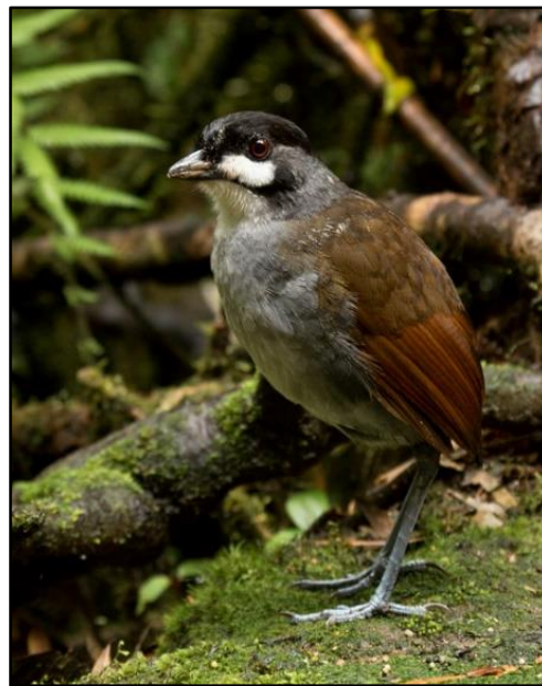
Jocotoco Antpitta