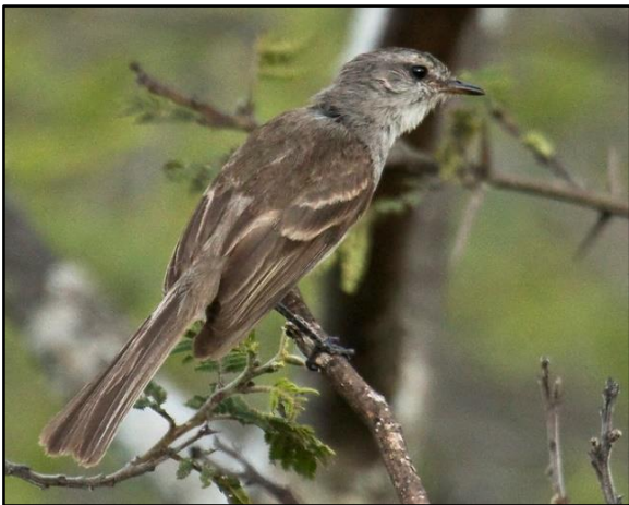
Tumbesian Tyrannulet