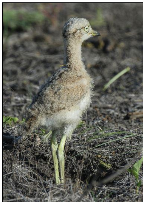
Peruvian Thicknee chick