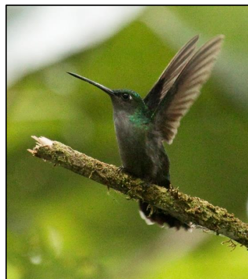
Napo Sabrewing