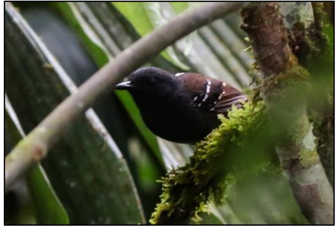
Northern Chestnut-tailed Antbird by John Hopkins

A pair of Fiery-throated Fruiteater was spotted near a fruiting tree. Bird activity here was relatively good. Others species that we picked out included a gorgeous Masked Crimson-tanager and Slate-colored Grosbeak. On a perfect snag at eye-level we got great looks at both Gilded Barbet and Lemon-throated Barbet through our binoculars. A singing Grey-tailed Piha, unfortunately remained only heard. Further along the road we got looks at both Golden-winged Tody-flycatcher and Spot-winged Antbird. A pair of Purplish Jacamars were perched and showed themselves very nicely. Here we also spotted a Black-eared Fairy fluttering along the forest edge. A male White-browed Antbird showed itself briefly after playback. In the secondary habitat around Miazi we saw several birds of interest including: the fancy Black-capped Donacobius; Little Woodpecker; Lettered Aracari, and Chestnut-eared Aracari. In a mixed-flock, in more forested habitat, we had notable sightings like Rufous-winged Antwren, Bamboo Foliage-gleaner, Red-stained Woodpecker and Duida Woodcreeper (a split of Lineated Woodcreeper). Plain-winged Antshrike and White-shouldered Antshrike were seen by only a few of us. Our lunch spot was lovely, we were able to add several new species to our list including Double-toothed Kite and Black Caracara.