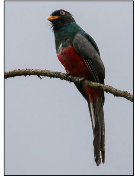
Ecuadorian Trogon

A stunning Henna-hooded Foliage-gleaner crossed the path at a close range. In the late afternoon we attempted to find Watkin's Antpitta at a nearby track named El Corral. We heard the antpitta but it never revealed itself. Several Pale-browed Tinamou were calling too, which was typical for the late afternoon. Our first Tumbes Pewee was seen at a close range while it perched on a bare twig. A vocal Red-billed Scythebill came in nicely thanks to the playback of the tape. We also saw a responsive Rufous-necked Foliage-gleaner that flew overhead several times. At dusk we listened along the main road for owls and other night birds. A Rufous-necked Wood-rail was calling in the distance but not much else made its presence known. We played the song of a Buff-fronted Owl, a very rare species that had been seen in the area more than a year ago. To our warranted surprise, we heard something that sounded just like it from fairly close by. We crossed the road and walked in the direction of where we thought the sound had come from. We positioned ourselves and softly played another bout of the song. We got an instant response from nearby and adrenaline surged through us all. It was a species the tour leader had never seen before! There was no doubt we were a couple of feet away from a Buff-fronted Owl and seeing it was the next step. We continued forward carefully with the tape. The owl started singing louder and louder. It was