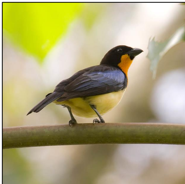
Orange-throated Tanager

15 March 2016: Yankuam, Maycu Reserve, Shaime road & Nuevo Paraiso. It had been raining almost the entire night and unfortunately it was still raining at dawn. Nevertheless, we made our way to the nearby Orange-throated Tanager reserve named Maycu. Here we walked the track with our raingear and umbrellas but our yield was minimal and the only bird that some of us saw was a soaked male Green-backed Trogon (sometimes named Amazonian White-tailed Trogon). We waited in the vehicle for the heavy rain to stop and eventually it did. Bird activity immediately picked up as it became drier. Fairly soon we chased what felt like promising flock activity. The Orange-throated Tanager was heard for a short while, but we couldn't manage to find it. It was still wet and misty, this caused our binoculars to fog up constantly. Many tanager-sized birds moved by but remained unidentified. We did identify a lovely White-throated Woodpecker. Suddenly, a lone Orange-throated