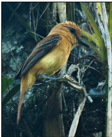
Ochraceous Attila

We patrolled a patch of forest outside Tapala where Straw-backed Tanager had been seen recently, unfortunately we failed to find this rare species. Birds that we did see here included: Golden-rumped Euphonia; Olivaceous Siskin; Pale-eyed Marañon; Swainson's Thrush; Brown-capped vireo; Golden-naped Tanager; Blue-winged Mountain Tanager, and a plethora of Silver-backed Tanagers. Lower down, at the Rio Nambala, the habitat looked amazing but the bird activity was uncommonly slow this time of day. New birds that we saw inside a beautiful gorge were White-tipped Swifts and a pair of Golden-collared Honeycreeper. Perched White-eyed Parakeets were clearly observable through our binoculars. A