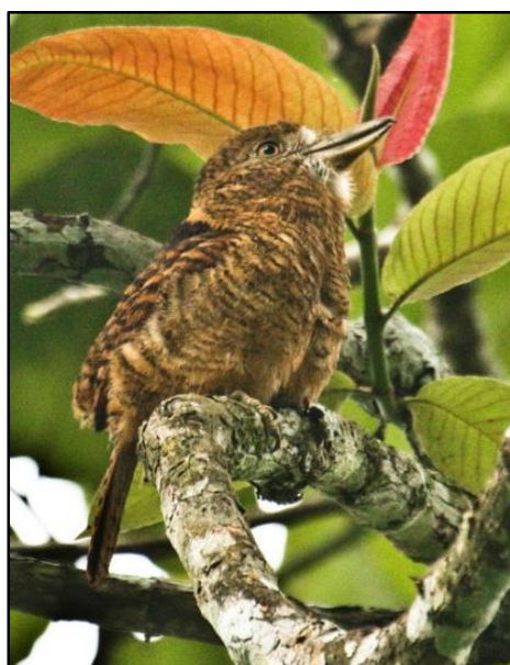
Barred Puffbird