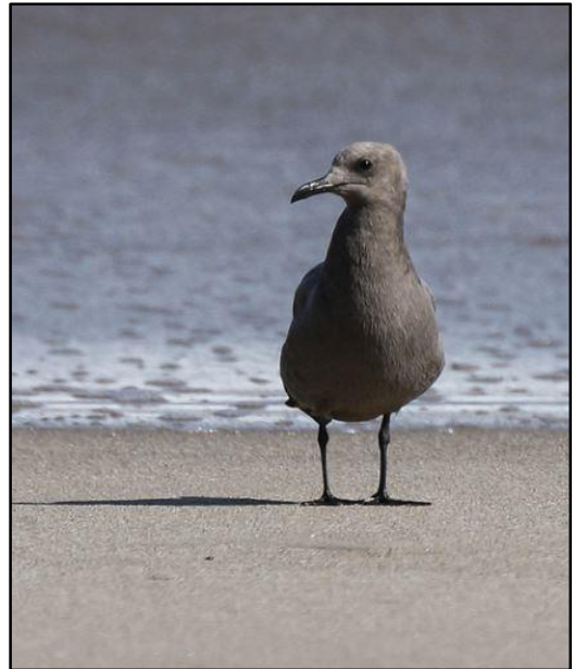
Grey Gull by John Hopkins

find the Sulphur-throated Finch we had hoped for – this is an erratic species which is generally difficult to target. Our next stop was at the salt pans of Ecuasal. Here we added a decent number of new species including: White-cheeked Pintail; Tricolored Heron; Peruvian Pelican; Grey Plover; Semipalmated Plover; Semipalmated Sandpiper; Ruddy Turnstone, and Greater Yellowlegs. We spotted a good-sized flock of gulls and terns that included: Gull-billed Tern; Royal Tern; Cabot's Tern (a split from Sandwich Tern); Grey-headed Gull, and Laughing Gull. At Punta Carnero we got a single adult-plumaged Kelp Gull. Along the beach of Mar Bravo several immature Grey Gulls were observed and a few Willets were foraging at the shoreline as well. Two adult Chilean Flamingos with a couple of juveniles (still with downy feathers) must have had arrived recently from the south. According to a local expert, there has not been any record of the species nesting at Ecuasal. A flock of hundreds of Wilson's Phalaropes was quite a spectacular sight. An adult Peregrine Falcon perched at the edge of a pond was probably a boreal migrant on its way back. Our last birding stop was at a scenic spot called La Chicolatera, which is the far western tip of the Santa Elena