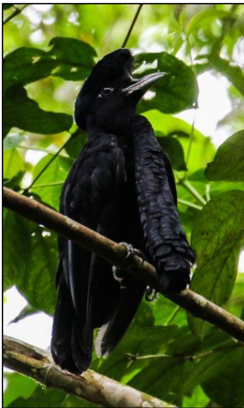
Long-wattled Umbrellabird

Some of us caught up with the Velvet-purple Coronet at the feeders. In the afternoon we drove back to the upper part of the reserve, straight to the parakeet nest boxes. We waited for quite a while and wondered if the chicks had possibly fledged. In the meantime we worked on a White-throated Crake that was moving through the pastureland but it never crossed the track. Then we heard a parrot-like squeak. Rose-faced Parrots with a fledgling were perched right in front of us at eye-level! It was an amazing sight of a rare species and we got great photographic opportunities. The juvenile was regularly begging for food while the adults were keeping an eye out. Suddenly the Rose-faced Parrots flew off as a Grey-backed Hawk dove in to catch them. The attempt on the parrots was unsuccessful and consequently, we got scope views of a perched Grey-backed Hawk. A little later we clearly heard El Oro Parakeets calling from around the corner. Within a short time we had a flock of El Oro Parakeets in our sights. They were perched at eye-level too and we watched them for quite some time. It was an awesome sighting! We still had a little time left to try for the tapaculo. Once we arrived at the site the El Oro Tapaculo sang back once and the bird sounded closer to us than the previous day. We patiently scanned the understory but it never appeared or called back again. While waiting for the tapaculo we did see a Bronze-olive Pygmy-tyrant and a Spotted Barbtail.