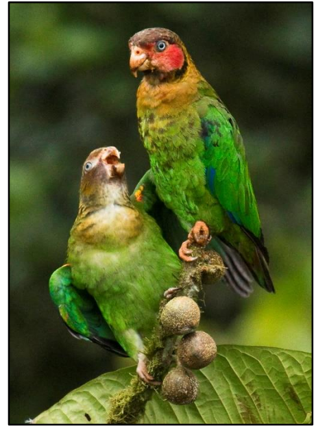
Rose-faced Parrot by Dušan Brinkhuizen

A recently deserted nest of a Pacific Royal Flycatcher was located in the curve but the only similar looking birds seen were Ochraceous Attilas. We decided to spread out along the track and wait for the Pacific Royal Flycatcher to show up. This tactic worked because soon someone down the road called it out. The next few minutes were like a cat-and-mouse game but eventually everybody got nice looks at this impressive flycatcher. With the royal flycatcher in the bag we went back to the start of the umbrellabird trail to look for new species. The Black-and-white Owl was located again in the same general area but on a different branch. The sighting of a Rufous Motmot that was digging its nest hole inside a huge armadillo cavity was an interesting experience. We gave the Heliconia flowers a second try for the sicklebill but saw a Purple-crowned Fairy and a Wedge-billed Hummingbird instead. Esmeraldas Antbirds were singing in a nearby gully but never showed themselves. A decent mixed-species flock held many nice birds including new ones like Silver-throated Tanager, Lesser Greenlet and Scarlet-rumped Cacique. Another pair of Song Wren was seen in the understory. During a short siesta after lunch we scoped a Plumbeous Kite and Chestnut-mandibled Toucan from the lodge deck.