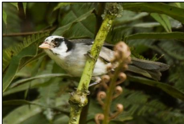
Paynter's Brush Finch by Dušan Brinkhuizen

In the same stretch of scrub we watched both Booted Racket-tail and Bronzy Inca foraging on flowers and a small flock of White-breasted Parakeets swiftly flew by. Further down the road we found a White-winged Brush Finch - of the distinct and poorly known race paynteri that possibly involves a future split as Paynter's Brush Finch. It seemed to be an immature bird because of the pale bill and the irregular facial pattern, a plumage that most probably had not been photographed before. Specialties that we got around the town of Valladolid were Marañon Thrush and Rufous-fronted Thornbird.