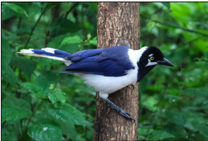
White-tailed Jay