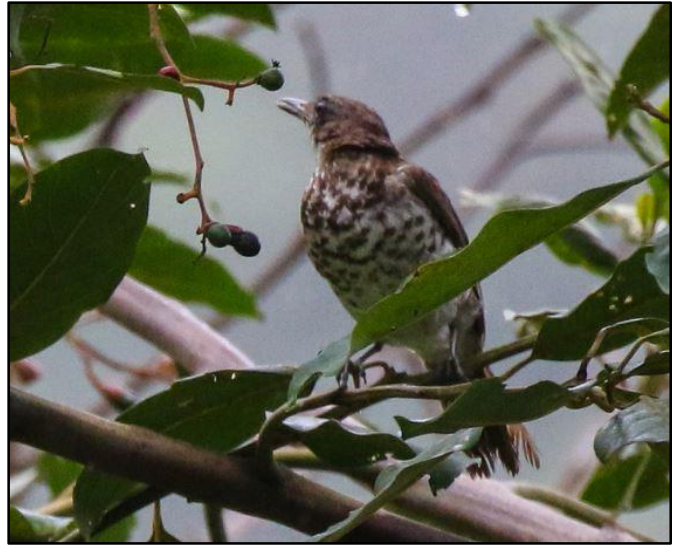
Marañon Thrush