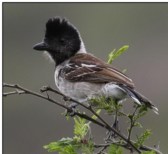
Collared Antshrike

the deciduous forest of Cerro Blanco to the coastal mangroves, in the late afternoon. This was the best chance we had at seeing this rare species, a prime target for any enthusiast. Especially since this migration usually involves a separate species endemic to Ecuador (already split by some authorities as the Lilacine Amazon). A pair of Pacific Parrotlet were seen at their nesting site on the way to our viewpoint. Shortly after we got to the viewpoint, a couple of Lilacine Amazons flew by at a fairly close range, affording us the opportunity to see some diagnostic plumage details in flight. A few Short-tailed Swifts (this subspecies ocypetes is sometimes split as Tumbes Swift) flew over as well. An Ecuadorian Piculet was spotted working its way through a dense bush. Later on, we spotted a male Collared Antshrike in the same bush. An Elegant Crescentchest came in to sight,