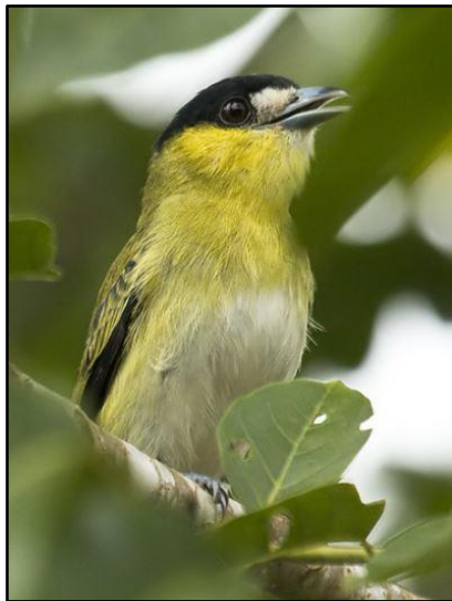
Yellow-cheeked Becard by Dušan Brinkhuizen

A male Yellow-cheeked Becard presented itself for a wonderful viewing. Weirdly enough a Red-billed Tyrannulet did not show up even though it continuously responded to our tape. A real bonus was the two Military Macaws that flew by. We were able to pick up their colours nicely through our binoculars. At Shaime road we added a few new tanagers to our list, including: Flame-crested; Masked, and Opal-crowned Tanager. A White-bellied Pygmy-tyrant was seen, perched on a bare twig. This species was only recently discovered in Ecuador, and the recent sightings provide a significant range extension for the species (Brinkhuizen et al. 2013). A crisp, male, Fiery-throated Fruiteater showed up at the same site and a male Black-and-white Tody-flycatcher was also observed. Northern Chestnut-tailed Antbirds (also named Zimmer's Antbird) were difficult to get in view because of the very dense vegetation along the road. In the late afternoon we arrived at a marshy site near Nuevo Paraiso where we watched a small flock of the bizarre creatures named Hoatzins. Other new species seen here included: a male Stripe-chested Antwren; Caquetta Seedeater, and Mottle-backed Elaenia. A Chestnut-crowned Becard was only heard.