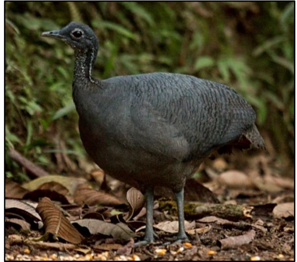
Grey Tinamou by Dušan Brinkhuizen

12 March 2016: Catamayo to Copalinga. After a short, early morning flight, we arrived in Catamayo for a delicious Ecuadorian breakfast. Lisl had been travelling all night (via Sao Paulo, Lima and Panama City!), and was lucky enough to make it to Guayaquil in time, completing our team. A few Chestnut-collared Swallows were flying around in the city centre of Catamayo which was a welcomed surprise. After breakfast, we went to a nearby site to look for special species like the Tumbes Sparrow. Once we arrived, Pacific Parrotlets were present in good numbers, and a few Golden-olive Woodpeckers presented themselves nicely along the river. A handsome Croaking Ground-dove was seen and fairly soon afterwards, John spotted a Tumbes Sparrow that was perched in the open for a prolonged amount of time. Other species that we picked up in the scrub were: Elegant Crescentchest (again a skulky bird); Tawny-crowned Pygmy-tyrant, and a very confident male Collared Antshrike.