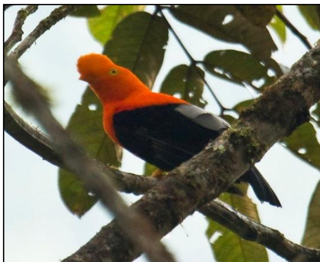
Andean Cock-of-the-Rock by Dušan Brinkhuizen

got to see it. A pair of Andean Motmot (sometimes named Highland Motmot) were spotted nicely in close range. Near the motmots, a noisy but skulking Black-billed Treehunter was seen by some participants. A few tanagers that we picked up along the way included: Green-and-gold; Golden-eared; Golden, and Swallow Tanager. At the ranger station we hit the jackpot. Nestor called out umbrellabird and there it was, a large black bird perched in the open! To our surprise multiple Amazonian Umbrellabirds flew in and at least three of them perched directly in front of us. Two males started to act in an exciting display. It was spectacular to watch them raise their weird crests and stretch their wattles. At one point we counted at least five individuals, an unusual sighting at Rio Bombuscaro. The party wasn't over as another cotinga species, a splendid male Andean Cock-of-the-Rock, flew into a nearby tree to steal the show! A little later a mixed-species flock moved through and we could clearly hear our target bird, the Foothill Elaenia, sing. Unfortunately, we never got clear views of the elaenia since it remained high up in the canopy.