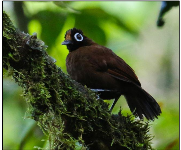
Hairy-crested Antbird by John Hopkins

The stunning Yellow-throated Tanager also showed itself. A neighbouring mixed-flock yielded stunning sightings of: Vermillion Tanager; Variegated Bristle-tyrant; Rufous-rumped Antwren, and Lemon-browed Flycatcher. Other tanagers included: Paradise; Beryl-spangled; Spotted; Golden; Flame-faced; Magpie, and Blue-necked Tanager. Bronze-green Euphonia, Blackburnian Warbler and Yellow-breasted Antwren were also moving along with the flock. A few Subtropical Caciques were loosely associated with the flock. When we arrived at Yankuam in the afternoon we immediately went to a nearby site to try for the Orange-throated Tanager, which was our principal target for the area. Bird activity was relatively slow because of the rain, but we did pick up a few new sightings. The definite highlight of the afternoon, and possibly the day, was a single adult Hairy-crested Antbird in the roadside understory. The bird popped out on a branch fully in the open and sang its heart out. We all got superb views of this rare and attractive antbird - a species that is most often encountered when following army ants. The subspecies involved was most probably brunniceps (or a hybrid thereof) because of the brownish (and not creamy white) coronal stripe.