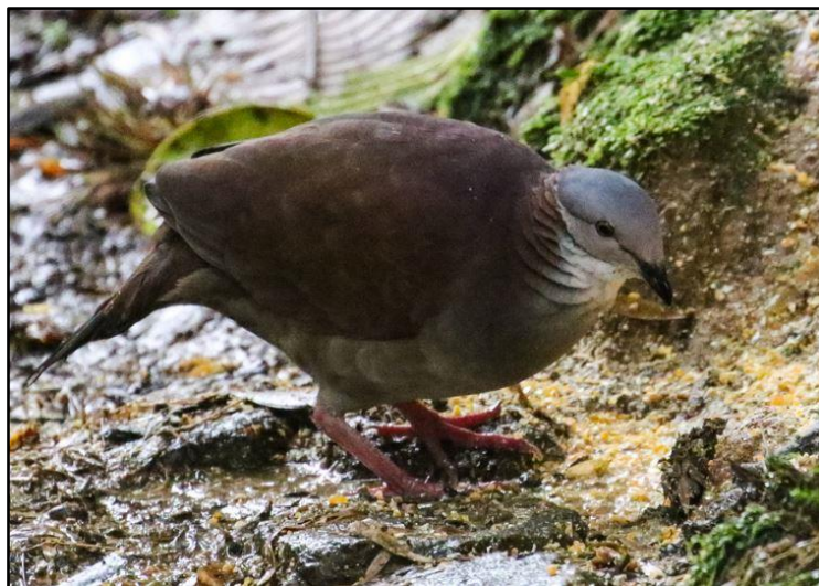
White-throated Quail-dove