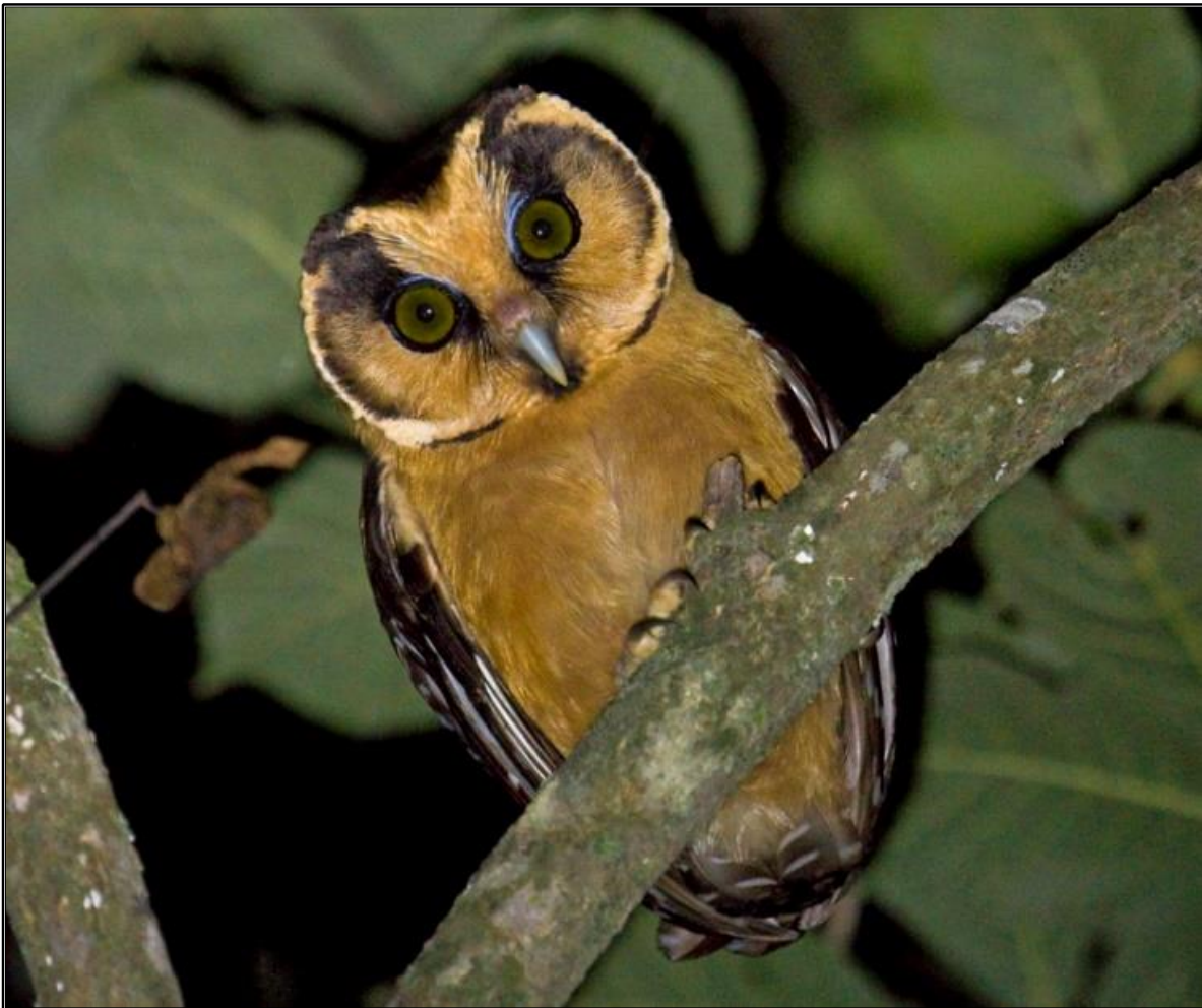
Buff-fronted Owl by Dušan Brinkhuizen