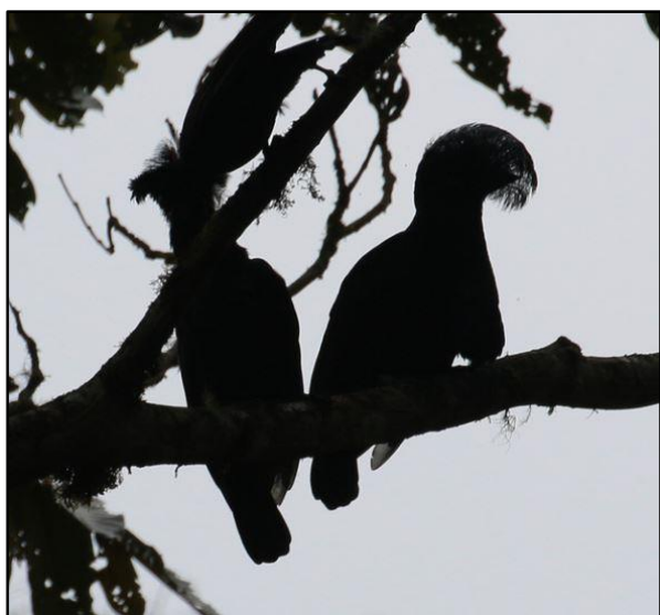
Amazonian Umbrellabirds

We also got to see a Yellow-olive Flatbill that showed up at the same moment. We tried for the elaenia for quite a while but the pair was not that responsive to our tape playback. The same happened with the Coppery-chested Jacamar; it was vocalizing nearby but it never came into view. At the river we watched a Torrent Tyrannulet and looked at a few White-thighed Swallows that were perched on a wire. At lunch we birded from the porch and kept an eye on the hummingbird feeders. Violet-fronted Brilliant, Fork-tailed Woodnymph and Green Hermit were the regular species that attended the feeders, but we were also able to see a single Many-spotted Hummingbird. The scarce Black-throated Brilliant did not show up although it was high on our wanted list. A Wedge-billed Woodcreeper was building its nest in the orchid garden while we were enjoying our meals. After lunch we went into the town of Zamora to try for