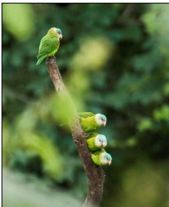
Grey-cheeked Parakeet by Dušan Brinkhuizen

in the metal bridge towers. A few Baird's Flycatchers were also seen as we took the track up to the local rubbish dump. A Woodstork soared overhead. Our first Black-and-white Tanager was heard fairly soon but getting the bird in our sights was a challenge. This species is an erratic rainy-season breeder and their movements are not well-known. For some reason, ideal numbers did not reach Jorupe this season but they were evidently present around Zapotillo. A female was swiftly seen and some people got lucky with glimpses of a male. Other species that we picked up along the track included: Snowy-throated Kingbird; Crimson-breasted Finch; Plumbeous-backed Thrush; Parrot-billed Seedeater, and Superciliated Wren. Late afternoon we located a cooperative male Black-and-white Tanager that everybody was able to see. A Grey-capped Cuckoo called back and we waited for this rare species to appear out of the dense scrub. It responded a few times to the tape but never came much closer. Lisl found a nice White-edged Oriole perched atop a bush. We tried for Tumbes Hummingbird at the cemetery but only got an Amazilia Hummingbird. A Burrowing Owl showed itself nicely here as well.