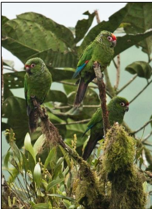
El Oro Parakeet by Dušan Brinkhuizen