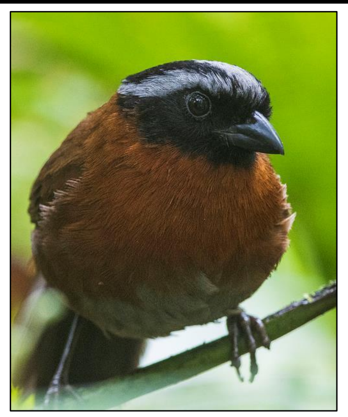
Tanager Finch by Dušan Brinkhuizen

fronted Capuchin! Another lucky find was a Tanager Finch that showed itself exceptionally well — what a cracker! After lunch, we successfully twitched the amazing Platebilled Mountain Toucan at its nest cavity. A fantastic pair of Crested Quetzals that we found up the road was a huge bonus!