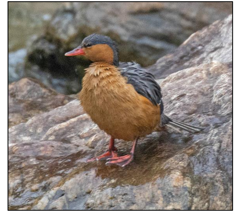
Torrent Duck by Herb Wilson

Back at Guango we enjoyed the hummingbird feeders that attracted various stunners, including the extra-ordinary Sword-billed Hummingbird. We then did a targeted search along the fast-flowing Papallacta river where we successfully encountered a pair of Torrent Ducks — it was difficult to pick our favourite duck, the male or the female?