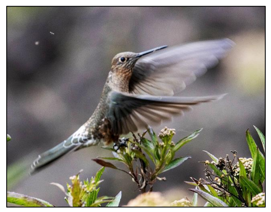
Giant Hummingbird by Herb Wilson

Our Eastern Andes tour started with a visit to one of the most famous and picturesque snow-capped stratovolcanoes of Ecuador: Antisana. The breath-taking landscape was filled with exciting birds and the majestic Andean Condor was among the first species that we saw! A Black-chested Buzzard-Eagle also flew overhead and the impressive Giant Hummingbird was surely another crowd-pleaser. At the viewing platform it was Pat that discovered a large black blob in the canyon. It turned out to be an adult male Spectacled Bear! Amazingly, after watching it in the scope, we discovered there was a second bear hidden in the bushes. We then observed some interaction between the bears and it looked like they were pair-bonding. The female was clearly smaller and we watched them fight and hear