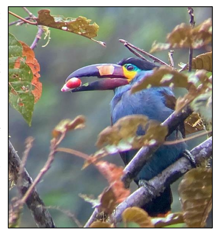
Plate-billed Mountain Toucan

Today some of us had a little sleep in, while others enjoyed some pre-breakfast birding on the grounds of Septimo Paraiso. Highlights of the early morning were Zeledon's Antbird, Scale-crested Pygmy Tyrant, Streakcapped Treehunter, Lineated Foliage-gleaner, Threestriped Warbler, and a stunning male Golden-winged Manakin! After breakfast, we explored the Mindo valley picking up goodies like the recently described Coopmans's Elaenia, Short-tailed and Barred Hawk, and White-browed Gnatcatcher, among others. Exciting was our little expedition to a new site where we watched the