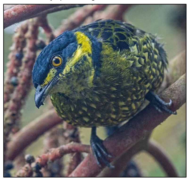
Scaled Fruiteater by Dušan Brinkhuizen

Today, we made an early start to the umbrellabird site. The hike was a bit steep but our efforts to reach the top were paid off big time. The weather was on our side and soon a fantastic male Long-wattled Umbrellabird flew in. It performed its display right in front of us — a truly mind-blowing wildlife sighting! Some bonus birds that we enjoyed in the area included Choco and Yellow-throated Toucans, and an obliging Laughing Falcon. Our continued search for Sunbittern was negative but we did find a fine Fasciated Tiger Heron at the Río Blanco. After a nice lunch at Kapari we travelled back to Quito to start the Eastern Andes tour!