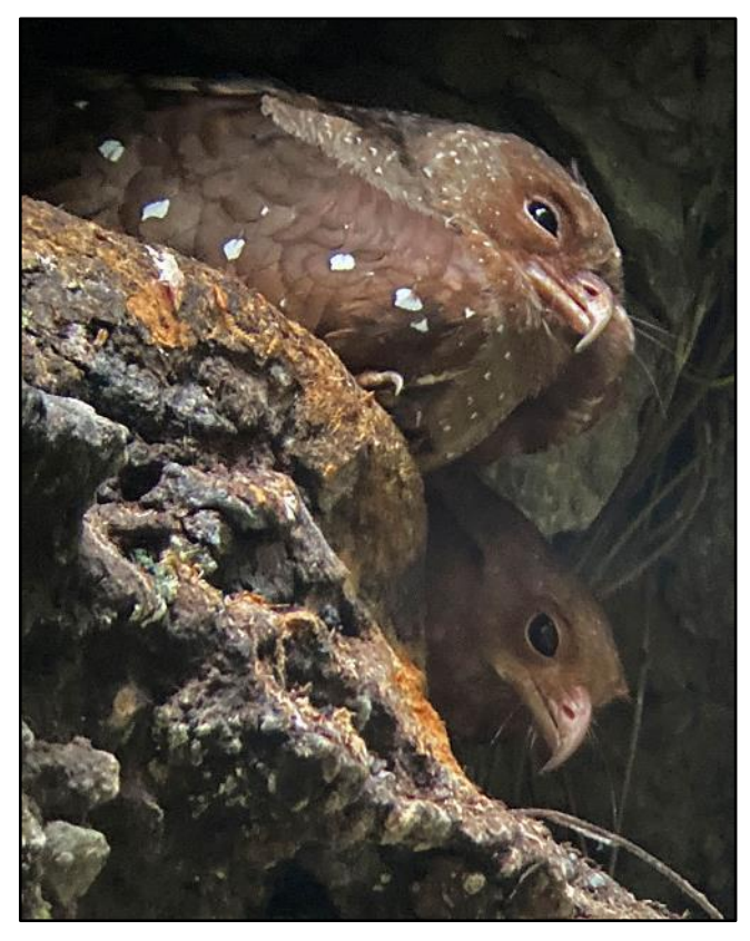
Oilbird

amazing Club-winged Manakin — what an incredible sound it makes with the wings! In the afternoon, we searched for the Sunbittern along the Río Mindo but this elusive species was nowhere to be found. Torrent Tyrannulet and Whitecapped Dipper were welcome consolations.