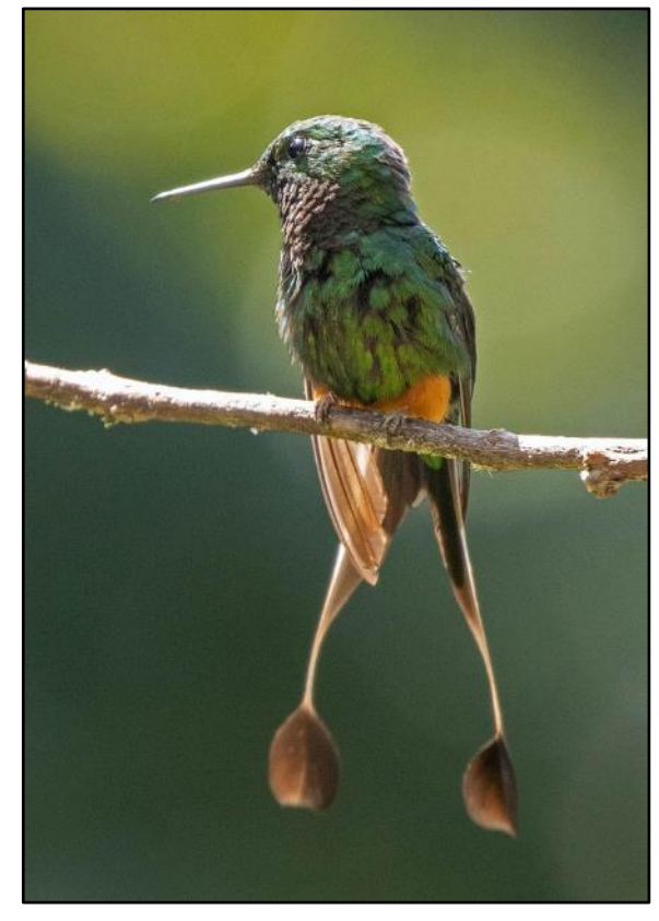
Peruvian Racket-tail

On our last morning we ventured down the east-slope to lower elevations in the hope to maximize our bird list. The goliath