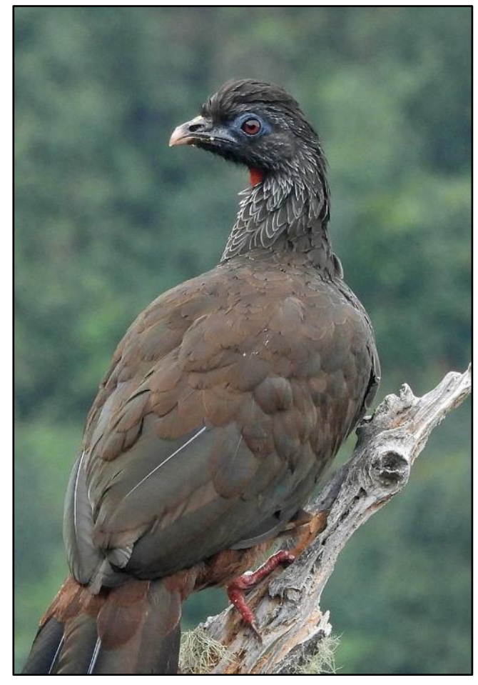
Andean Guan

Morning porch birding at Bellavista was exciting with lots of quality sightings, including stunners like Masked Trogon, Striped Treehunter, Russet-crowned Warbler, Blue-winged Mountain Tanager, Cinnamon Flycatcher, and many more. A giant earthworm on a forest trail was a nice surprise and a true rarity was our brief sighting of an Ecuadorian White-