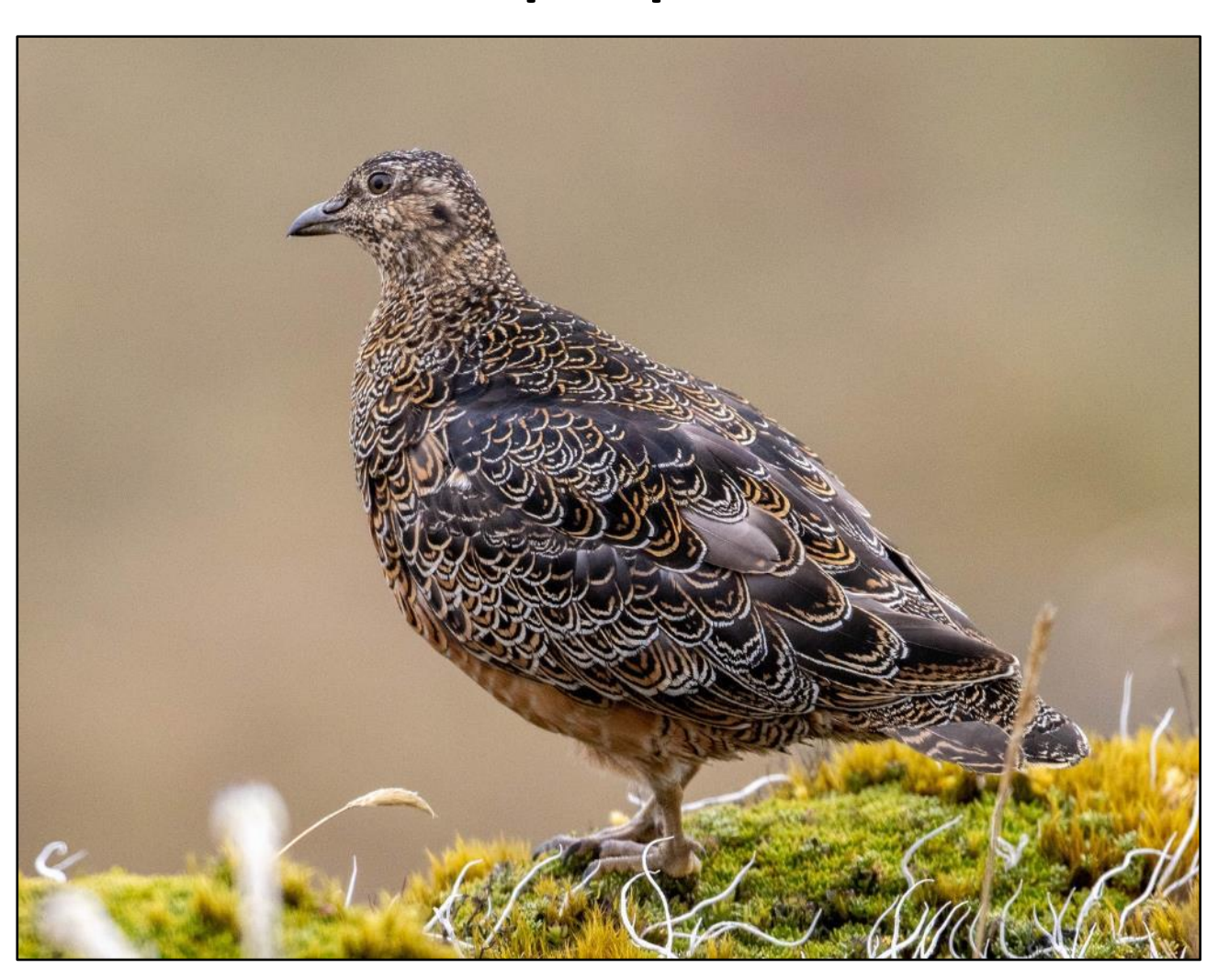
Rufous-bellied Seedsnipe