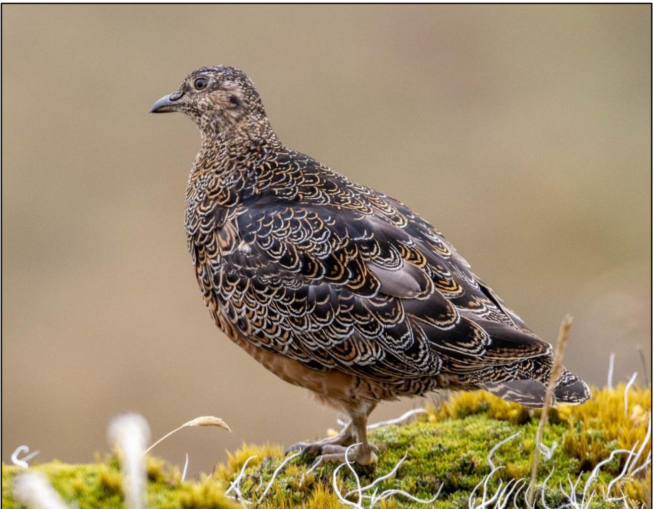
Rufous-bellied Seedsnipe