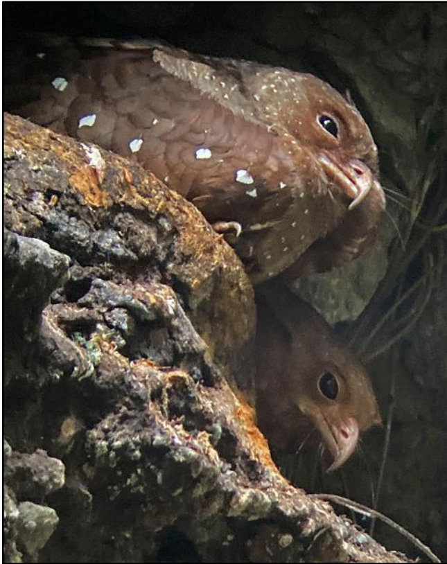
Oilbird

amazing Club-winged Manakin — what an incredible sound it makes with the wings! In the afternoon, we searched for the Sunbittern along the Río Mindo but this elusive species was nowhere to be found. Torrent Tyrannulet and White-capped Dipper were welcome consolations.