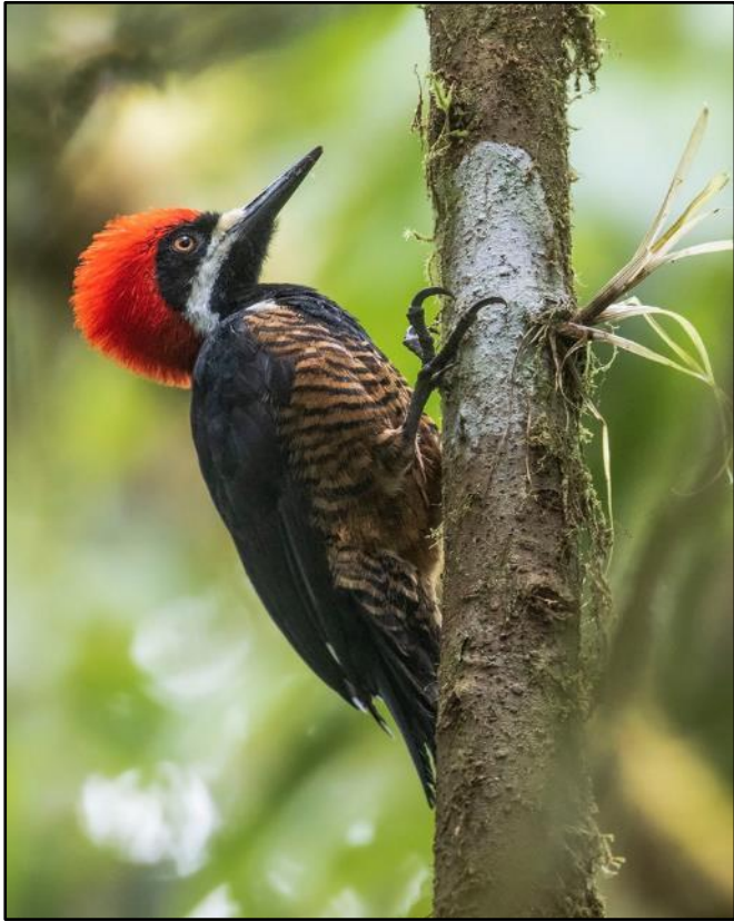
Powerful Woodpecker by Dušan Brinkhuizen

Pre-breakfast birding at Guango yielded goodies like Blue-and-black and Hooded Mountain Tanager. We then visited the treeline and paramo habitats of the Cayambe-Coca National Park. Viridian Metaltails were easy to find here but the hoped for mixed-species flocks were eluding us. We eventually connected with a flock that yielded stunners like Black-backed Bush, Golden-crowned and Black-chested Mountain Tanager. On our way back down, we discovered a black blob in a pasture. It turned out to be a sleeping Mountain Tapir — another incredible wildlife sighting! At Cabañas San Isidro we had to interrupt dinner for a special bird — the San Isidro Mystery Owl!