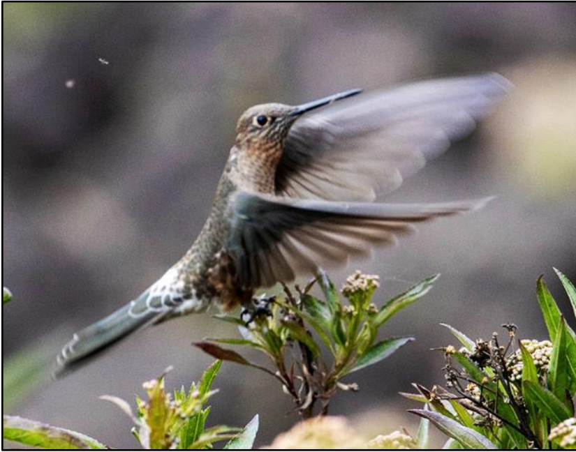
Giant Hummingbird by Herb Wilson

Our Eastern Andes tour started with a visit to one of the most famous and picturesque snow-capped stratovolcanoes of Ecuador: Antisana. The breath-taking Andean landscape was filled with exciting birds and the majestic Andean Condor was among the first species that we saw! A Black-chested Buzzard-Eagle also flew overhead and the impressive Giant Hummingbird was surely another crowd-pleaser. At the viewing platform it was Pat that discovered a large black blob in the canyon. It turned out to be an adult male Spectacled Bear! Amazingly, after watching it in the scope, we discovered there was a second bear hidden in the bushes. We then observed some interaction between the bears and it looked like they were pair-bonding. The female was clearly smaller and we watched them fight and hear