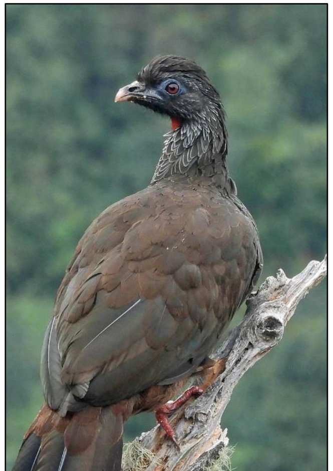
Andean Guan

Morning porch birding at Bellavista was exciting with lots of quality sightings, including stunners like Masked Trogon, Striped Treehunter, Russet-crowned Warbler, Blue-winged Mountain Tanager, Cinnamon Flycatcher, and many more. A giant earthworm on a forest trail was a nice surprise and a true rarity was our brief sighting of an Ecuadorian White-