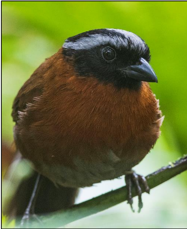
Tanager Finch by Dušan Brinkhuizen

fronted Capuchin! Another lucky find was a Tanager Finch that showed itself exceptionally well — what a cracker! After lunch, we successfully twitched the amazing Plate-billed Mountain Toucan at its nest cavity. A fantastic pair of Crested Quetzals that we found up the road was a huge bonus!