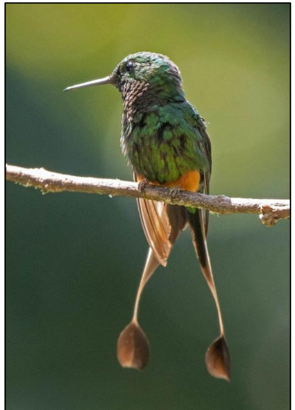
Peruvian Racket-tail by Herb Wilson

On our last morning we ventured down the east-slope to lower elevations in the hope to maximize our bird list. The goliath