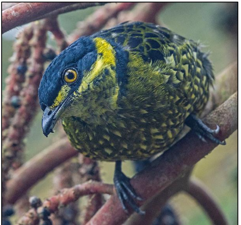
Scaled Fruiteater by Dušan Brinkhuizen

Today, we made an early start to the umbrellabird site. The hike was a bit steep but our efforts to reach the top were paid off big time. The weather was on our side and soon a fantastic male Long-wattled Umbrellabird flew in. It performed its display right in front of us — a truly mind-blowing wildlife sighting! Some bonus birds that we enjoyed in the area included Choco and Yellow-throated Toucans, and an obliging Laughing Falcon. Our continued search for Sunbittern was negative but we did find a fine Fasciated Tiger Heron at the Río Blanco. After a nice lunch at Kapari we travelled back to Quito to start the Eastern Andes tour!