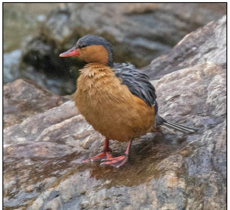
Torrent Duck by Herb Wilson

Back at Guango we enjoyed the hummingbird feeders that attracted various stunners, including the extra-ordinary Sword-billed Hummingbird. We then did a targeted search along the fast-flowing Papallacta river where we successfully encountered a pair of Torrent Ducks — it was difficult to pick our favourite duck, the male or the female?