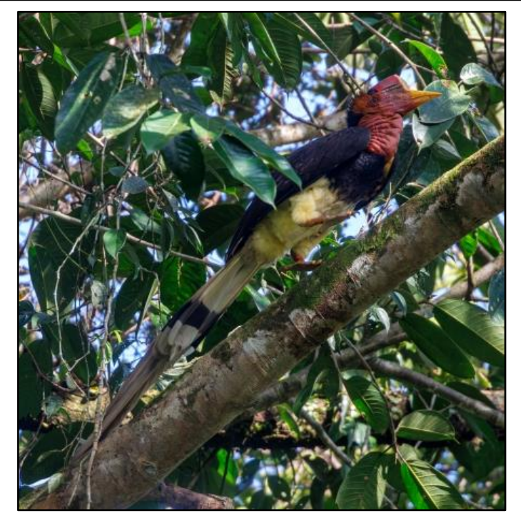
Helmeted Hornbill

screeched. We then saw its mate swoop in and land beside their white chick as she fed it a huge dragonfly and a large walking stick. But the highlight of the night was surely Large Frogmouth of which we found not one, not two, but three of these phenomenal birds!