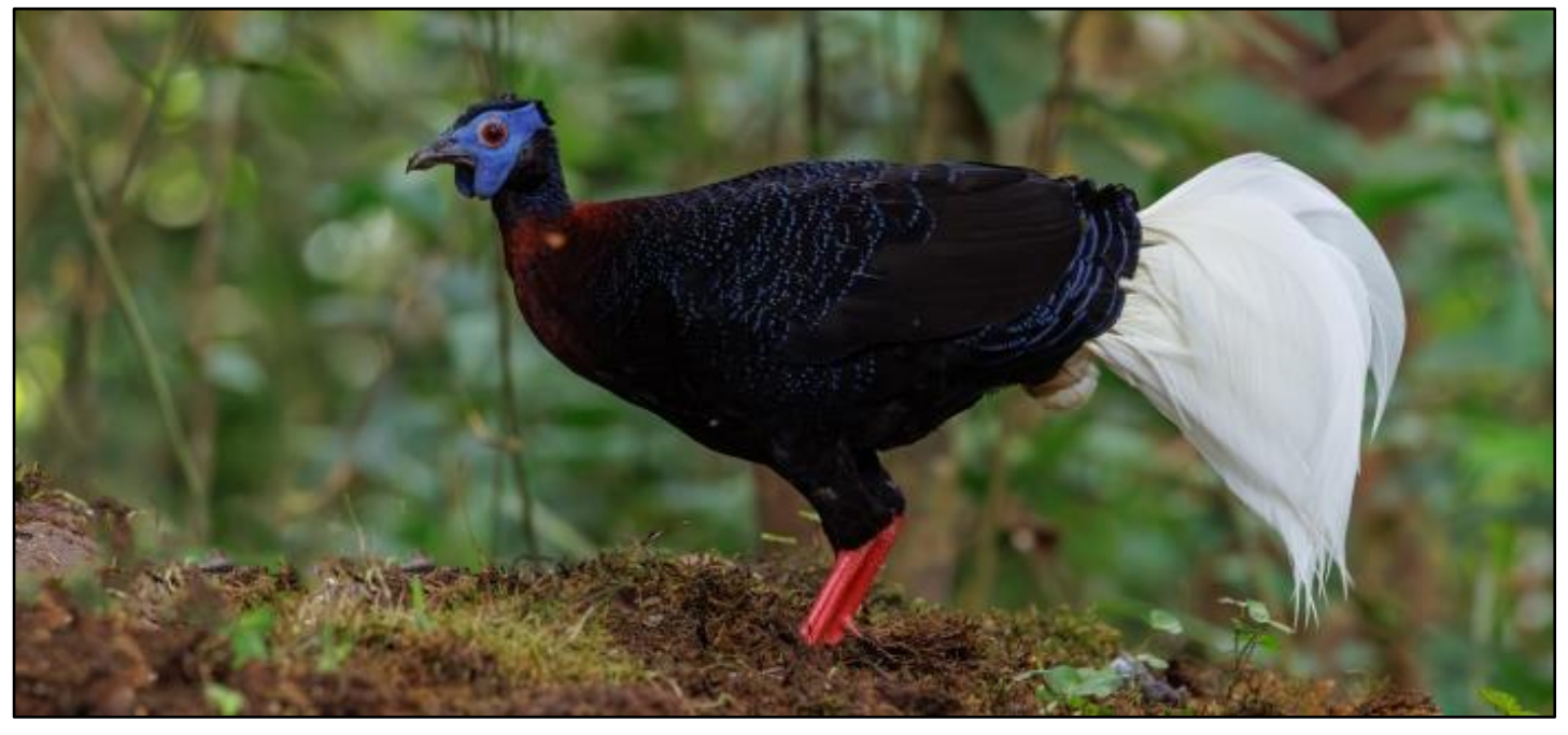
Bulwer's Pheasant

over our heads for an amazing start. Next up was a Buffy Fish Owl and then we made further stops for more Red and Thomas' Giant Flying Squirrel and Bornean Small-toothed Palm Civets. Later in the night terrestrial mammals started to get more active and we saw Malay Civet, Bornean Palm Civet, and a fantastic Sunda Leopard Cat sighting. We were also exceptionally fortunate to have a brief sighting of an Otter Civet, one of the most poorly known and most wanted mammals of southeast Asia. It was walking in the ditch and then headed off into the undergrowth not to be seen again. Rounding out the night drive we had a couple of excellent sightings of Bornean Slow Loris, one of which was running!