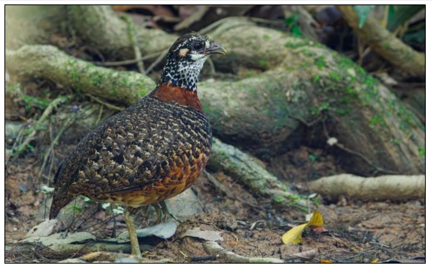
Sabah Partridge by Liew Weng Keong

a Bornean Blue Flycatcher. We also worked our way through many of the more common babbler species seeing about 8 species this morning: Bold-striped Tit, Fluffy-backed Tit, Gray-hooded, Rufous-fronted, Chestnutrumped, Rufous-crowned, Ferruginous and Horsfields; not to mention about 10 species of bulbuls on this very speciose morning. For the afternoon we headed into a forest interior trail and along a small stream found the scarce and beautiful Sunda Blue Flycatcher. Relatively little else was around but we got word of another Orangutan, this one a female, that we could watch to our heart's content. After dark we set out on a night drive. We didn't see much of note until we got out of the vehicle and found a Blyth's Frogmouth perched high up in a tree. Just after enjoying views of the frogmouth we could hear pounding rain fast approaching so we got up the canopy of the vehicle and proceeded back to the lodge managing to stay dry and having seen the frogmouth to boot!