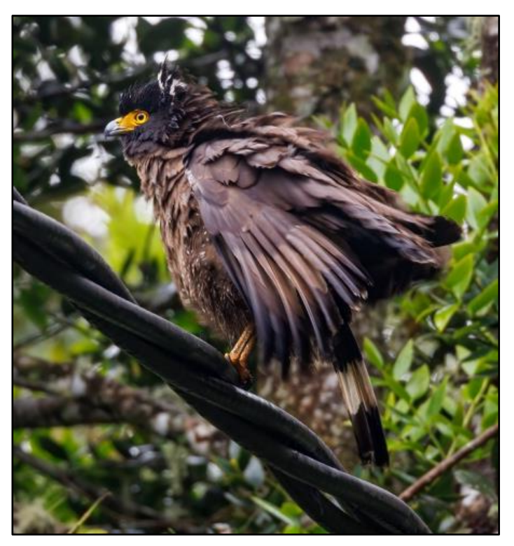
Mountain Serpent Eagle by Liew Weng Keong

After a leisurely breakfast we headed down to Poring Hot Springs where we birded the forest edge for a couple hours. Here we were able to appreciate a wide variety of the commoner sunbirds, flowerpeckers, bulbuls and barbets. Some top sights included Goldenwhiskered Barbet, Crimson, Ruby-cheeked and Brownthroated Sunbirds, a couple of Hume's White-eyes and a heard only Fulvous-chested Jungle Flycatchers. A