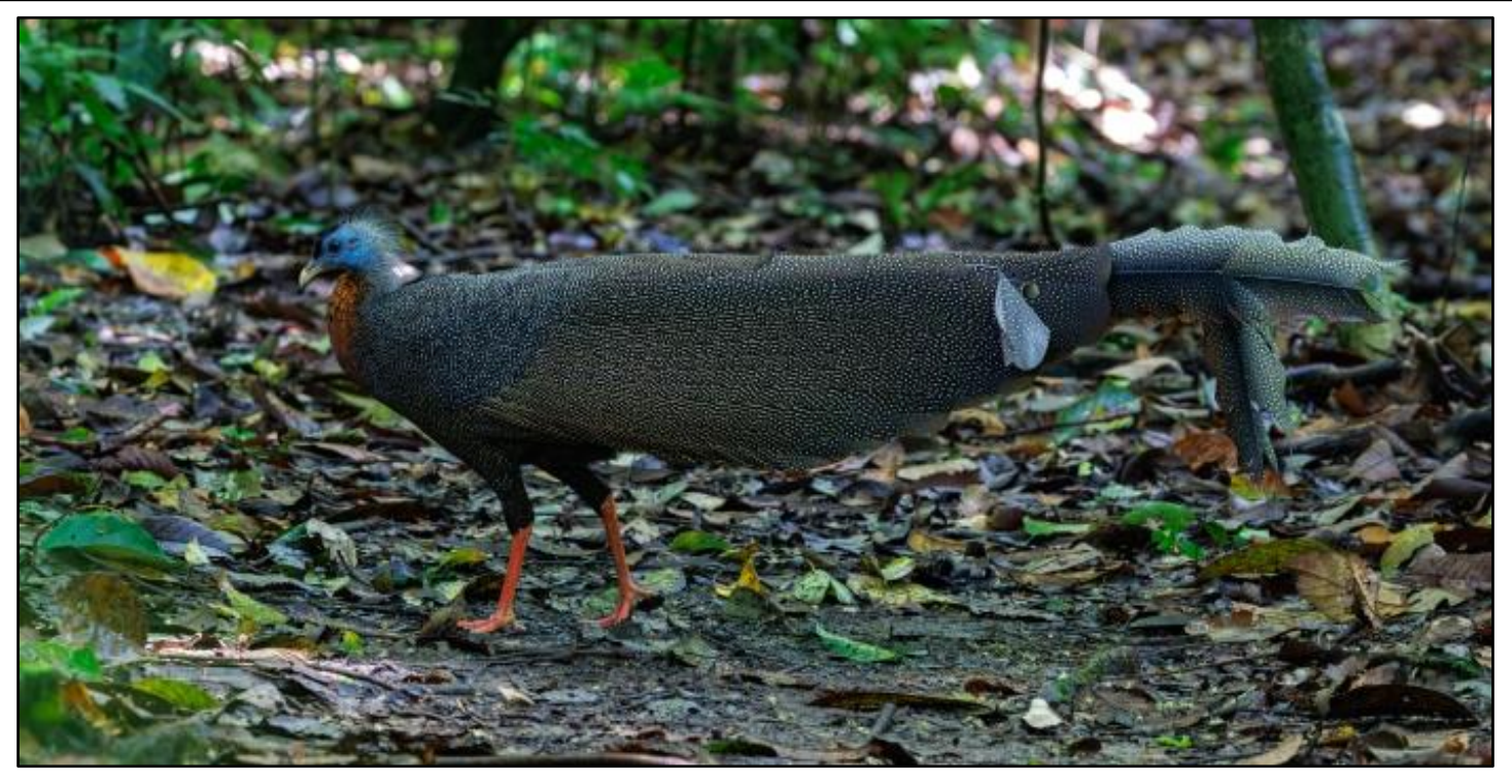
Great Argus