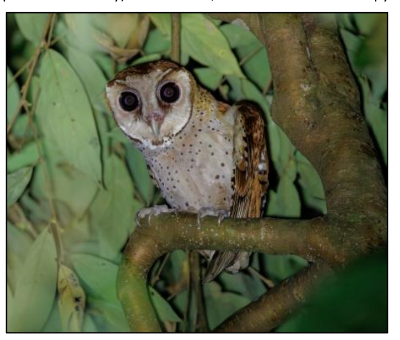
Oriental Bay Owl by Liew Weng Keong

We had one final morning at Sepilok and we started out with a couple of scarce Cinnamonheaded Green Pigeons perched amongst the Pinknecked's. Then we had a leisurely watch at the