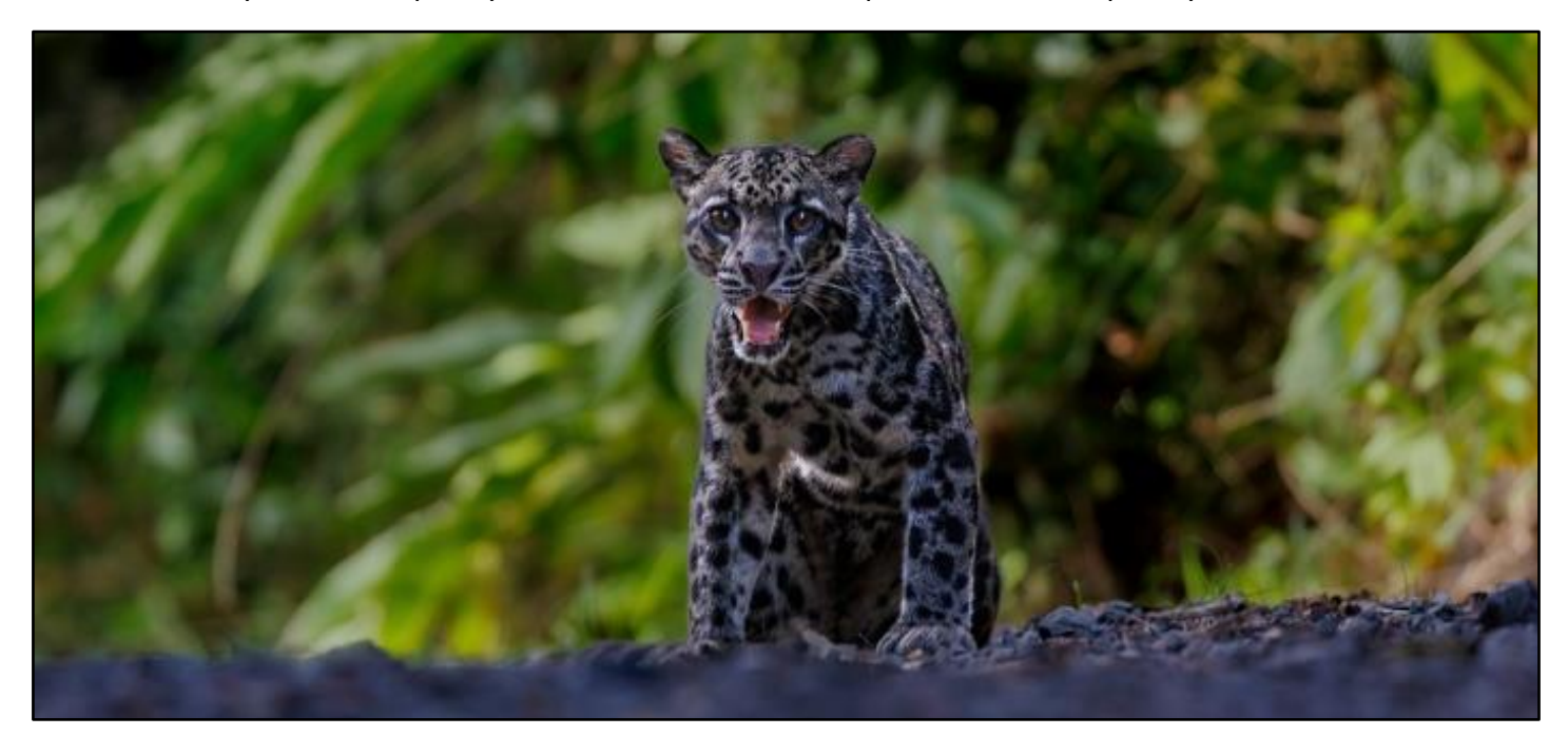
Sunda Clouded Leopard

The next morning, we tried predawn for the Bornean Frogmouth and did indeed hear it, but we could not find it. Time was running out to see this bird! Apart from the Black Orioles, morning birding was very slow despite decent weather and good forest and mid-morning we stopped back at the hut for a cup of coffee. Things improved greatly after that as we headed off track into some beautiful forest and soon had another major surprise, a White-tailed Flycatcher moving around us and calling. Another poorly known Borneo bird and a very likely future split as well. A bit further down the track we were getting some views of Gray-headed Babbler when we heard a Rail Babbler calling. A minute later this magnificent bird was walking fearlessly around us! In the afternoon it was raining heavy, but we took a chance during a lull in the rain to keep on birding and were rewarded with yet another poorly known Bornean bird and potential future split, Eye-browed Wren Babbler.