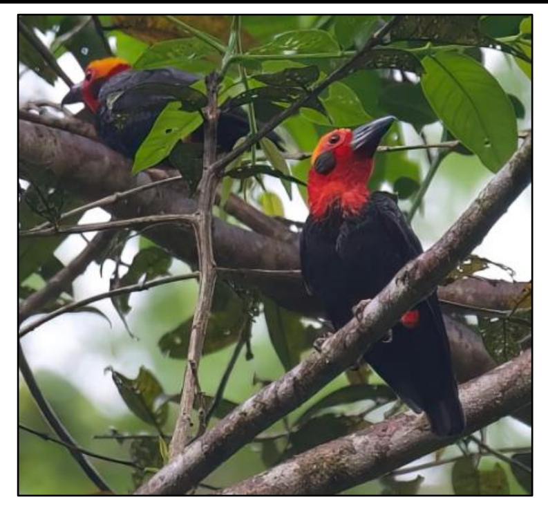
Bornean Bristlehead by Liew Weng Keong

canopy tower, seeing many of the same species as yesterday with more astonishing hanging parrot views, plus unparalleled views of a Van Hasselt's Sunbird and even a day active Red Giant Flying Squirrel. The highlight must have been watching a Wallace's Hawk Eagle devour a large Spiny Rat a few feet away from us! We then spent the remainder of the morning walking trails which was pretty quiet, but we eventually found out an excellent pair of Red-bearded Bee-eater. Just as we were about to leave, we noticed a Yellow-vented Flowerpecker in a fruiting tree and then Susanna noticed a coiled up Reticulated Python which slowly uncoiled itself and gave most impressive viewing and a great farewell to our time here. We then had a drive down to Sukau through endless palm oil plantation before being ferried over to our quaint lodge on the edge of the Kinabatangan River. Our introductory late afternoon boat cruise yielded Proboscis Monkey viewing along with Gray-headed Fish Eagle and