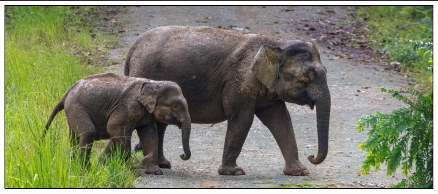
Bornean Pygmy Elephants by Liew Weng Keong

monkey ladder over the channel with a daring jump! We then had to farewell this wonderful locale and drive on to the Danum Valley. The drive in proved to be exceptional and ended up taking the whole afternoon. A random stop for a Blyth's Paradise Flycatcher yielded not just an immaculate male of that species but then 3 Bornean Bristleheads putting on a show! While watching them the rarely seen Short-tailed Mongoose sauntered across the road carrying a large prey item in its jaws. Just up the road a large herd of Elephants were feeding, and we spent memorable time with these huge "Pygmys". Eventually we were pretty much surrounded by them, so our drivers felt it best to move on! One final random stop netted us great views of the scarce Thickbilled Spiderhunter. Finally, we arrived at our luxurious accommodation near dusk and enjoyed our first meal here. After dinner we set about on a short night walk seeing Malay Civet, various invertebrates and some interesting frogs including Harlequin Tree Frog.