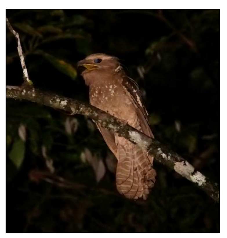
Large Frogmouth