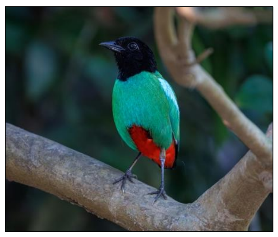
Hooded Pitta

Next morning, we headed out to bird the road through magnificent tall dipterocarp forest, some of the tallest trees anywhere in the world. We started off about as good as it gets watching the dominant flanged male Bornean Orangutan exit his nest and then spend the next half hour or so eating his breakfast of fruits above us. What a moment! Eventually we carried on and soon saw a couple of scarce Bornean Gibbons also feeding up in a fruit tree. We scoped an endangered Helmeted Hornbill and then had a procession of new birds as dissipated: Black-bellied the mists Malkoha, Indian Cuckoo, several Squaretailed Drongo Cuckoo, scarce Grey-bellied and Scaly-breasted Bulbuls, and then a productive area held a mixed flock with some showy Dusky Broadbills and Maroon-breasted Philentomas along with