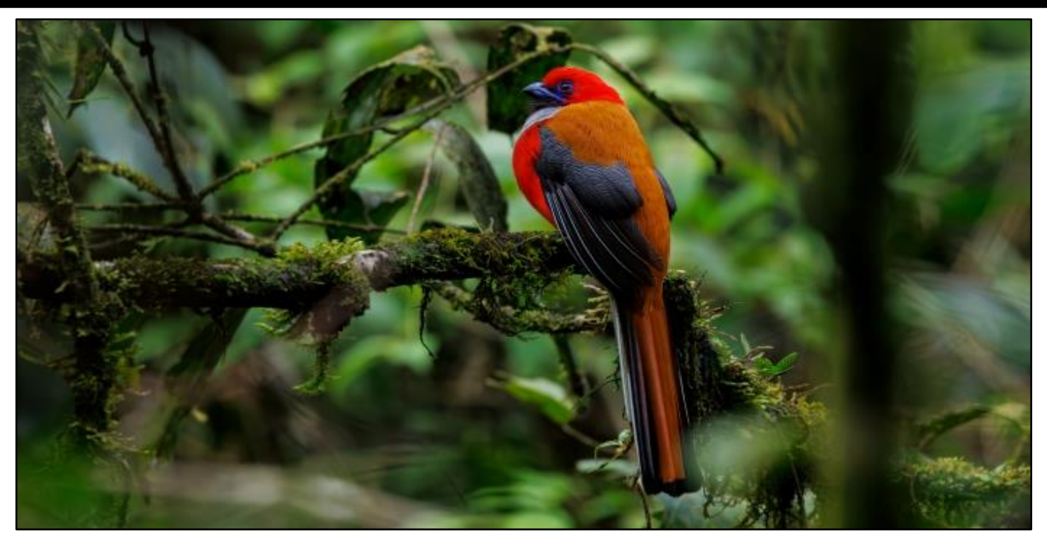
Whitehead's Trogon by Liew Weng Keong

road for the remainder of the day in rather gloomy conditions but were very fortunate in having excellent views of a trio of Bare-headed Laughingthrush along with a furtive Everett's Thrush. What a day!