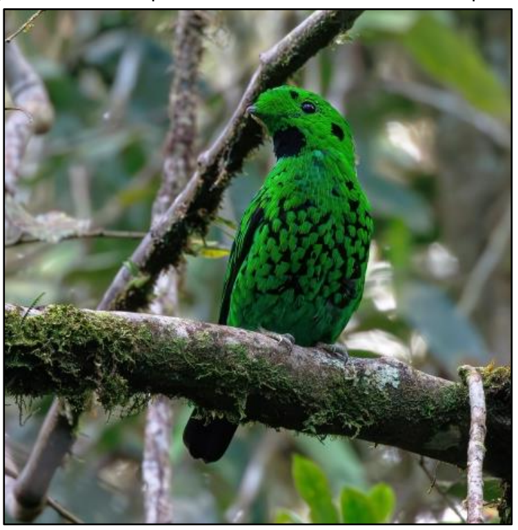
Whitehead's Broadbill

At our lunch stop we added some unusually good views of Pygmy White-eye along with yet more squirrels, including the rarely encountered Sculptor