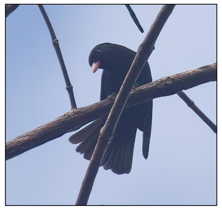
Black Oriole

After breakfast we drove the short distance to the Paya Maga trailhead and began the muddy walk up to the small forest clearing there. En route we heard a couple Bornean Banded Pitta, neither of which wanted to show. The walk up was reasonably uneventful but as we arrived to the clearing the Black Oriole was already singing its heart out. After a bit of scanning, we managed to spot the bird and then could enjoy views in the scope for a while of