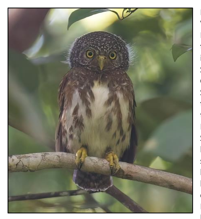
Sunda Owlet by Rand Rudland

It was another full day of birding the forests of Ba'Kelalan. We had several mammal sightings this morning: Short-tailed Mongoose on the road, Bornean Gibbons whooping in the trees, rare Hose's Langurs alarm calling from hidden perches inside the forest, along with the uncommon Kinabalu Squirrel and sadly only a glimpse of the spectacular Tufted Ground Squirrel. Mammal watching is very challenging in Sarawak due to hunting pressure. Of the birds, top species today included elusive Philippine Cuckoo Doves, Checkerthroated Woodpecker, Black-thighed Falconet, Green Broadbill, Dayak Blue Flycatcher and Whitehead's Spiderhunter. We were running out of new birds to look for, but it was still a very birdy day in a magnificent area. We spent some time hoping for a calling Blue-banded Pitta to hop onto his favourite log but had no such luck. A Dibamus legless lizard on the road in the late afternoon was an exciting find. And then we gathered at dusk to wait for Bornean Frogmouth to start calling. We finally had a beautiful rain-free evening to work with and just as the bird started to call got interrupted by a military patrol that told