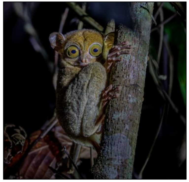
Western Tarsier by Liew Weng Keong

We had time for one more early morning boat cruise, and this was again very productive. We finally found Storm's Storks, 5 of them in fact! We also had a Hooded Pitta that nearly landed in the boat. Other new birds included Scarlet-rumped Trogon and Sooty-capped Babbler plus ridiculously good views of Brown-backed Needletail. The Proboscis Monkeys put on a fine show, especially when a female carrying her small baby crossed the