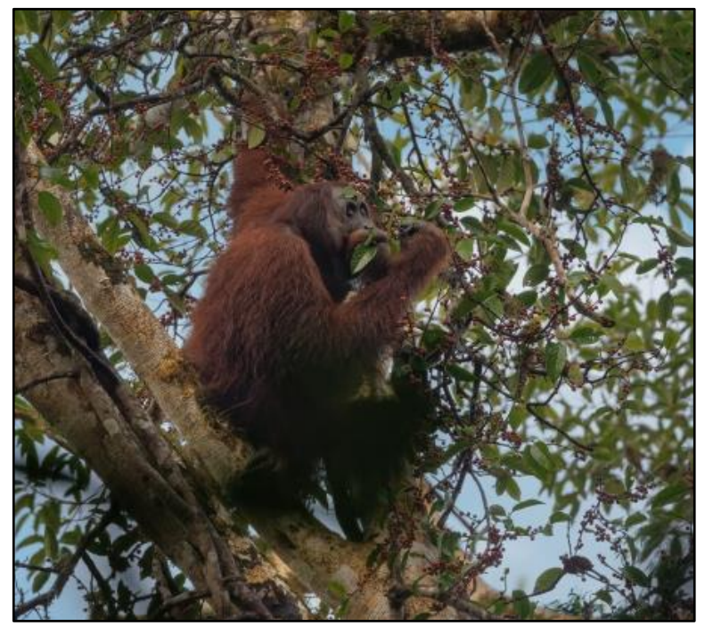
Bornean Orangutan by Liew Weng Keong

Frilled Flying Lizard, a Crested Green Lizard, a Bornean Skink, and numerous attractive Prevost's Squirrels were also all well appreciated before we continued our way with a longish drive to Sepilok broken up by a tasty lunch en route. After dropping off our bags at our resort we headed into the stunning dipterocarp rainforests of the Sepilok area for the remainder of the afternoon. Within minutes we were having unbeatable views of a glowing Black-crowned Pitta that was being accompanied by a Short-tailed Babbler. An exceptionally close Wallace's Hawk Eagle and a wide-eyed roosting pair of Brown Boobooks were other highlights with many other birds noted including Chestnut-breasted Malkoha, Crimsonwinged and Banded Woodpecker and Copperthroated Sunbird. At dusk an extraordinary sighting of a male White-crowned Hornbill capped off what had been an exceptional few hours of afternoon birding.