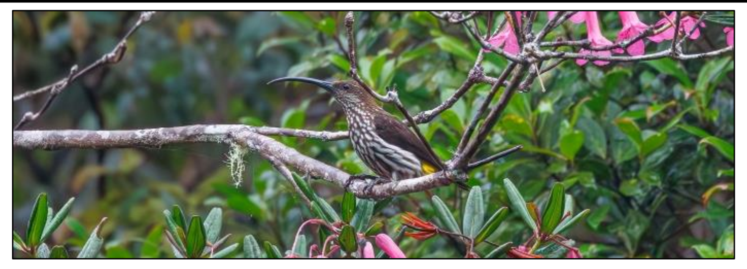
Whitehead's Spiderhunter by Liew Weng Keong

Squirrel – 6 species for the morning! After a siesta with clouds rolling back revealing majestic views of Kinabalu peak, we returned to the high elevation forests and struck it lucky when David found us a pair of the incomparable Whitehead's Trogon. Very fortunate indeed as the species had recently been proving difficult to see and they showed so well for us. We also saw a Yellow-breasted Warbler feeding a Sunda Cuckoo chick and a handful of other birds and after dusk stayed in the park where we were treated to a surprisingly cooperative Mountain Scops Owl that was randomly spot-lit, along with a host of interesting invertebrates topped by an incredible trilobite beetle. A very special day on the mountain!