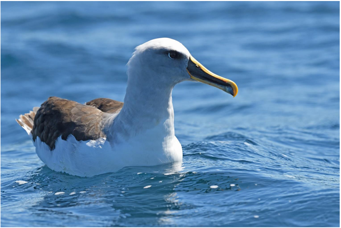
Buller's Albatross

This area is not typically visited on birding tours to the area, but since we had seen all our major targets for the area, we decided to take the opportunity to improve on our views of Chilean Seaside Cinclodes and Red-legged Cormorant, as well as to give us a chance to see Marine Otter. First, however, we had to don some new headgear and brave the near gale-force winds that were sweeping the coast that afternoon. We secured great views of the cinclodes and the otter, but we weren't there long, as the wind seemed to only get worse with time. A brief stop at a nearby beach hotel then gave us views of Surfbird and Willet, before a retreat to our own hotel would see in the remainder of our birding day.