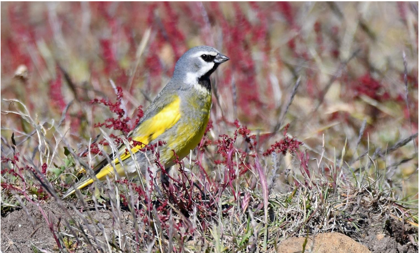
White-bridled Finch

Having done so well, so early, it mattered not, however, and soon we were on our way, way ahead of schedule, to Humedal de Cartagena for some more action-packed birding. Strolling the shoreline of this great little spot, we notched up one new species after another, including Coscoroba Swan, Black-necked Swan, Red Shoveler, Black-headed Duck, Lake Duck, White-tufted Grebe, White-winged Coot, Red-gartered Coot, Brown-hooded Gull and Austral Negrito. On the way out, a Black-crowned Night Heron despatching provided yet more photographic opportunities.