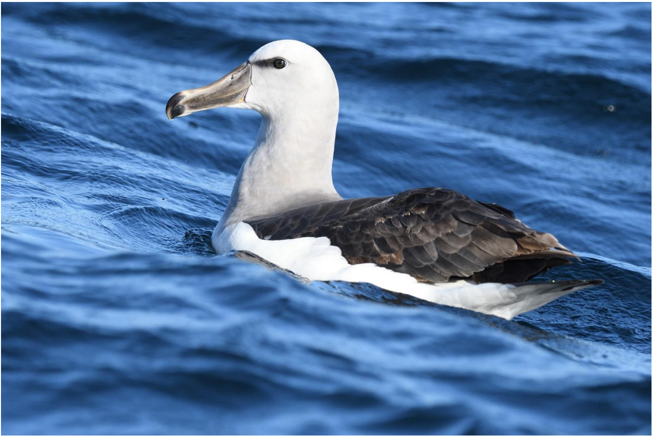
Salvin's Albatross

After finally seeing the canastero, we took a short drive to the end of the road, where we scanned the buildings of a ski resort but failed to find any perched Andean Condors – unsurprising in the foul weather, but we did have wonderful views of soaring birds on the way down. Much further down the hill, we then tried our luck with Chilean Tinamou, and more than made up for any failures with the condor. Hell, we made up for any failures that would come for the rest of the week! Indeed, we all stood in awe as we drew one of these supposedly shy tinamous out to within a few feet of our snapping cameras. At one point, I tried but failed to chase it away from the road and away from passing cars! A final stop on the mountain for photos of Chilean Mockingbird then saw in our time around Farellones.