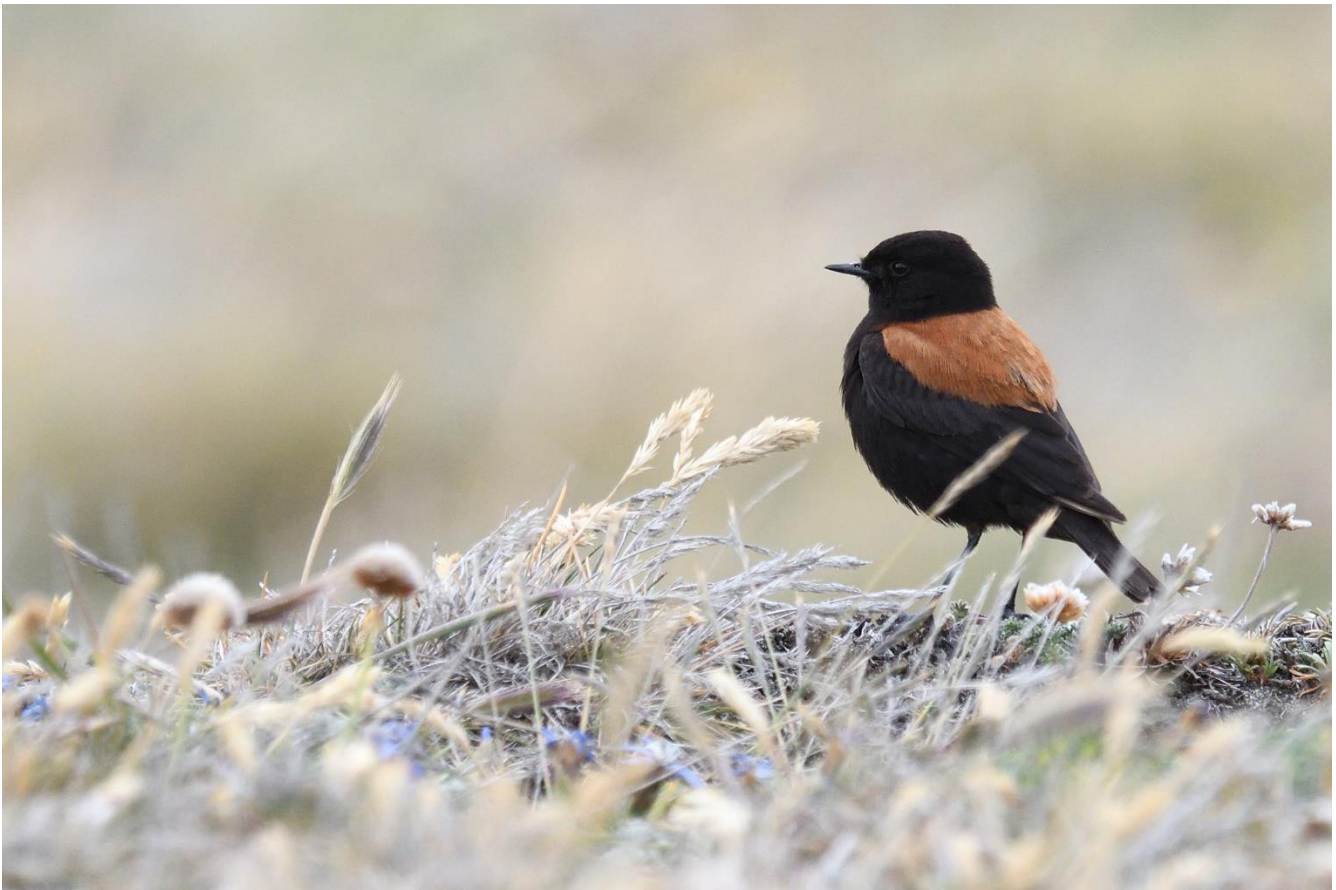
Austral Negrito by Rich Lindie

The woodpecker, mercifully, put in an appearance during our first attempt to see a huet-huet – drumming just loud enough for us to hear it above the recording of the huet-huet, and staying around long enough for us to find and photograph it. And then some! That was before breakfast, too, so things were looking up. Heading up above the treeline after breakfast, we quickly found our two main targets – Yellow-browed Finch and Dark-faced Ground Tyrant, before taking a little time to admire the truly spectacular scenery. Not only had the weather finally cleared up enough for us to go birding, but the skies had finally opened up to reveal the awe-inspiring setting we had been in all along! Osorno volcano was visible in all its glory, as were near and distant peaks – varying from forested knolls to barren mountaintops and scree-slopes. Much picture taking ensued. Before long, we were back on the trail of huet-huets, though. One after the other, they gave us the slip until, finally, one decided to perch in a visible spot. More importantly, for long enough to get everyone on it; nothing short of eleventh-hour magic! Or was it just pure relief? We drove back to Puerto Montt after that, not seeing a single Slender-billed Parakeet along the way, but pretty happy with our time in Puyuhue, regardless. From Puerto Montt, we took the short hop to Punta Arenas, where a late dinner saw in the remainder of the day's light.