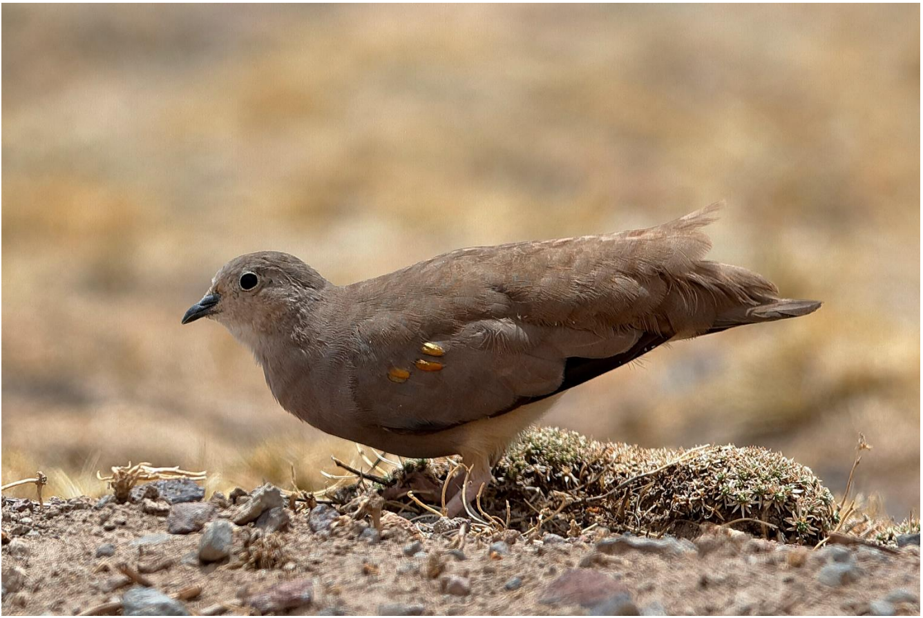
Golden-spotted Ground Dove

For a drastic change of scenery (and temperature!), we found ourselves in the Palmas de Ocoa sector of La Campana National Park the next morning. Our main targets there were White-throated Tapaculo and Dusky-tailed Canastero, the former of which we heard almost immediately after stepping off the bus. Before we could get to it, however, we were distracted by a Striped Woodpecker in a tree above us. Fortunately, more tapaculos were to be heard. If only it hadn't taken so long to see one! The canastero, mercifully, took almost no effort at all, and while we were on our numerous searches for a cooperative tapaculo, we also saw Chilean Flicker and a handful of other appreciated birds.