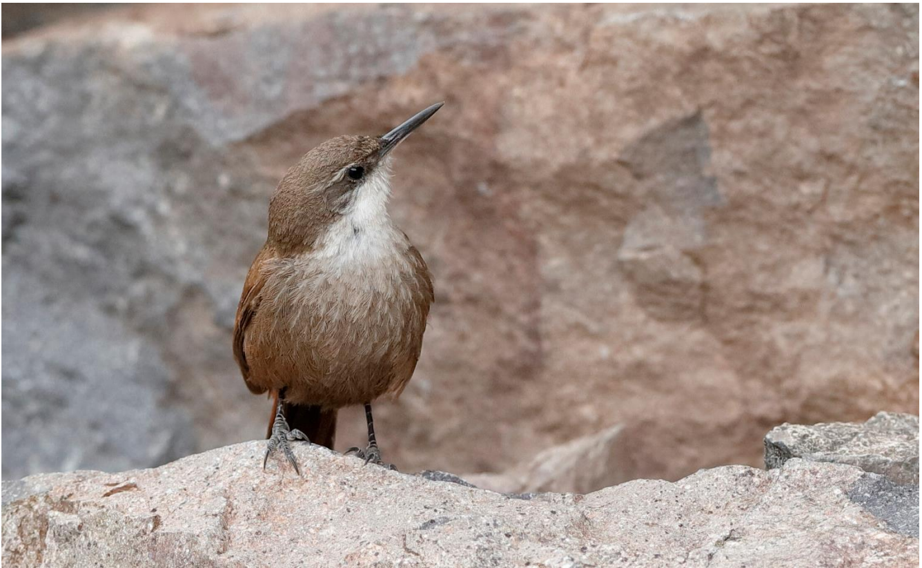
Crag Chilia

Yet higher up, we passed a scenic lake where several, apparently mostly Brazilian, tourists were beginning to gather, before being dropped off at the edge of a large bog, where two hours of productive birding would take us to lunchtime. Highlight sightings during those couple of hours included the much sought-after Diademed Sandpiper-Plover, Grey-flanked Cinclodes, Cinereous Ground Tyrant, Cordilleran Canastero, Straight-billed Earthcreeper, Grey-breasted Seedsnipe and Andean Goose. Eventually, lunch (warm empanadas) arrived, and we were soon on our way up to our final stop. The reason for climbing higher, of course, was to track down Creamy-rumped Miner, which we successfully did without much trouble, though the views alone would have made the drive worthwhile. Oh, and the sight of several more soaring condors above. The remainder of the day was spent making our way back to Santiago, where an earlier dinner was much-appreciated, as were more celebratory drinks at the end of yet another lovely day.