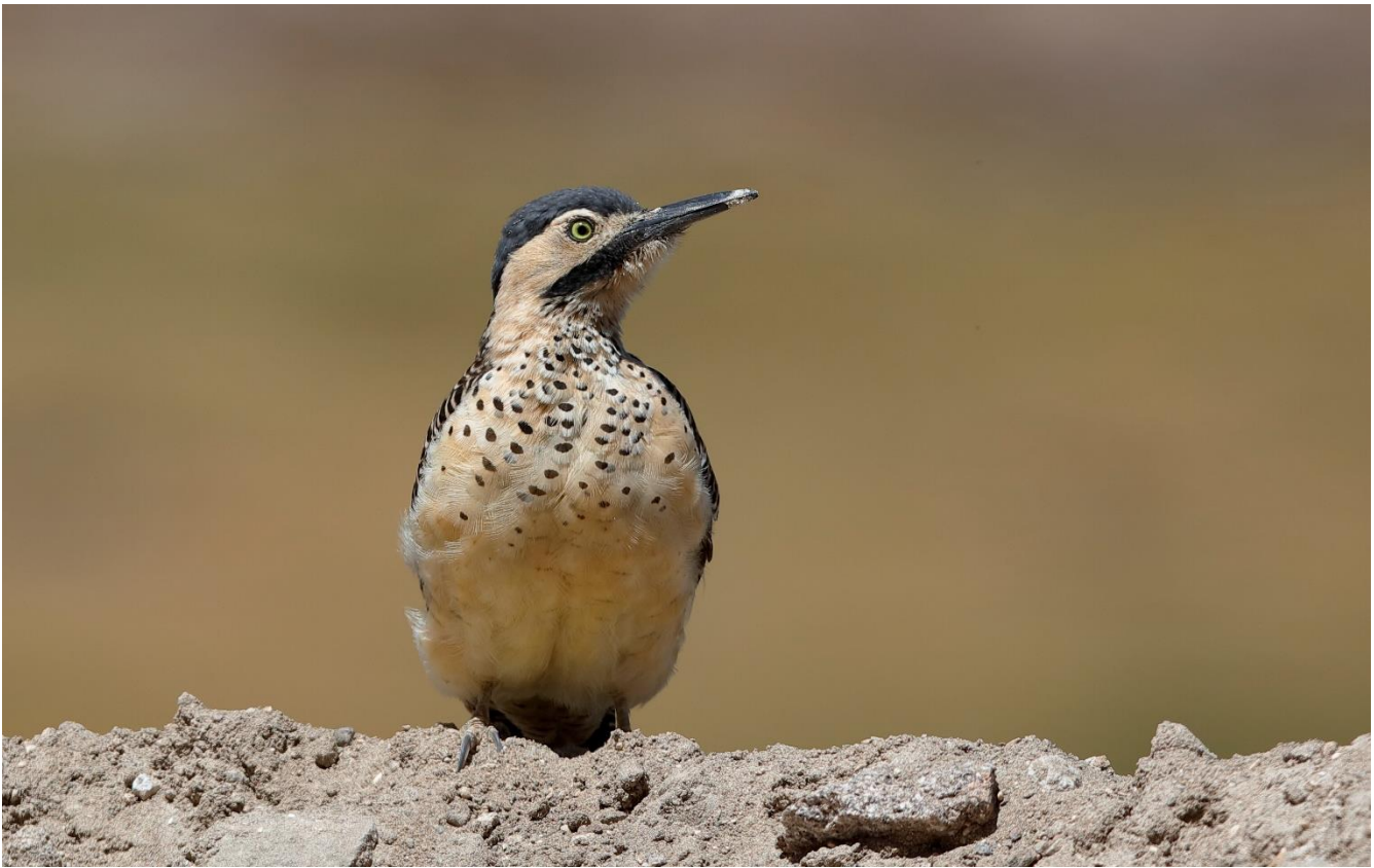
Andean Flicker

Deeper into the park, we focused our attention on finding James's Flamingo – finding a small group of them at our very first stop. Making our way, on foot, to and from the flamingos, we also bagged several other species, including Puna Miner, Andean Avocet, Puna Ibis and Buff-breasted Earthcreeper. We also managed to get great close-ups of the flamingo, side-by-side with the other two species found in the area – Chilean and Andean. Yet deeper into the park, we enjoyed wonderful views of Andean Swallow, before a wander around some bogs and roadside cuttings produced great views and photos of Giant Coot, Andean Flicker, the hulking White-fronted Ground Tyrant and herd-upon-herd of Vicuna. One of the key sightings of the morning, of course, was Lesser Rhea – represented in the area by a subspecies sometimes split as Puna Rhea. By seeing this bird early on in the day, we freed up time to explore new areas of the park, and so we decided to continue along the road to Visviri. Along the way, we finally found Andean Lapwing, whilst the edges of the town itself produced wonderful close-ups of Golden-spotted Dove and Bright-rumped Yellow Finch. Needless-to-say, we also enjoyed the wide-open plains and uninterrupted views of the nearby volcanoes of Pomerape and Parinacota – all the while being the only car and people on the main road!