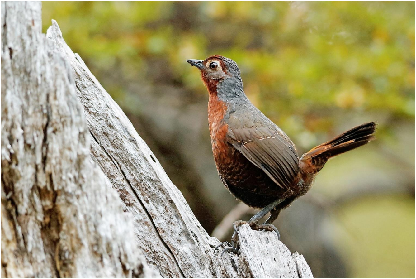
Chestnut-throated Huet-huet by Holger Teichmann

The dry slopes on the first part of our climb then gave us our first Straight-billed Earthcreeper of the trip, whilst the more-vegetated valleys around Socoroma provided us with several goodies, including Spot-winged Pigeon, Giant Hummingbird, Yellow-billed Tit-Tyrant, Ash-breasted Sierra Finch and Greenish-yellow Finch. We eventually reached Putre in the late afternoon, when some of us opted for a short walk while others took a brief rest, before a short drive to the old main road above town provided us with some final new birds for the day. Birds seen around our hotel on the afternoon walk included Aplomado Falcon and Cream-winged Cinclodes, whilst our walk above town produced Canyon Canastero, Streak-backed Tit-Spinetail and Black-hooded Sierra Finch, among others. Post dinner in town, a wonderfully obliging Band-winged Nightjar took the spot for final bird of the day.