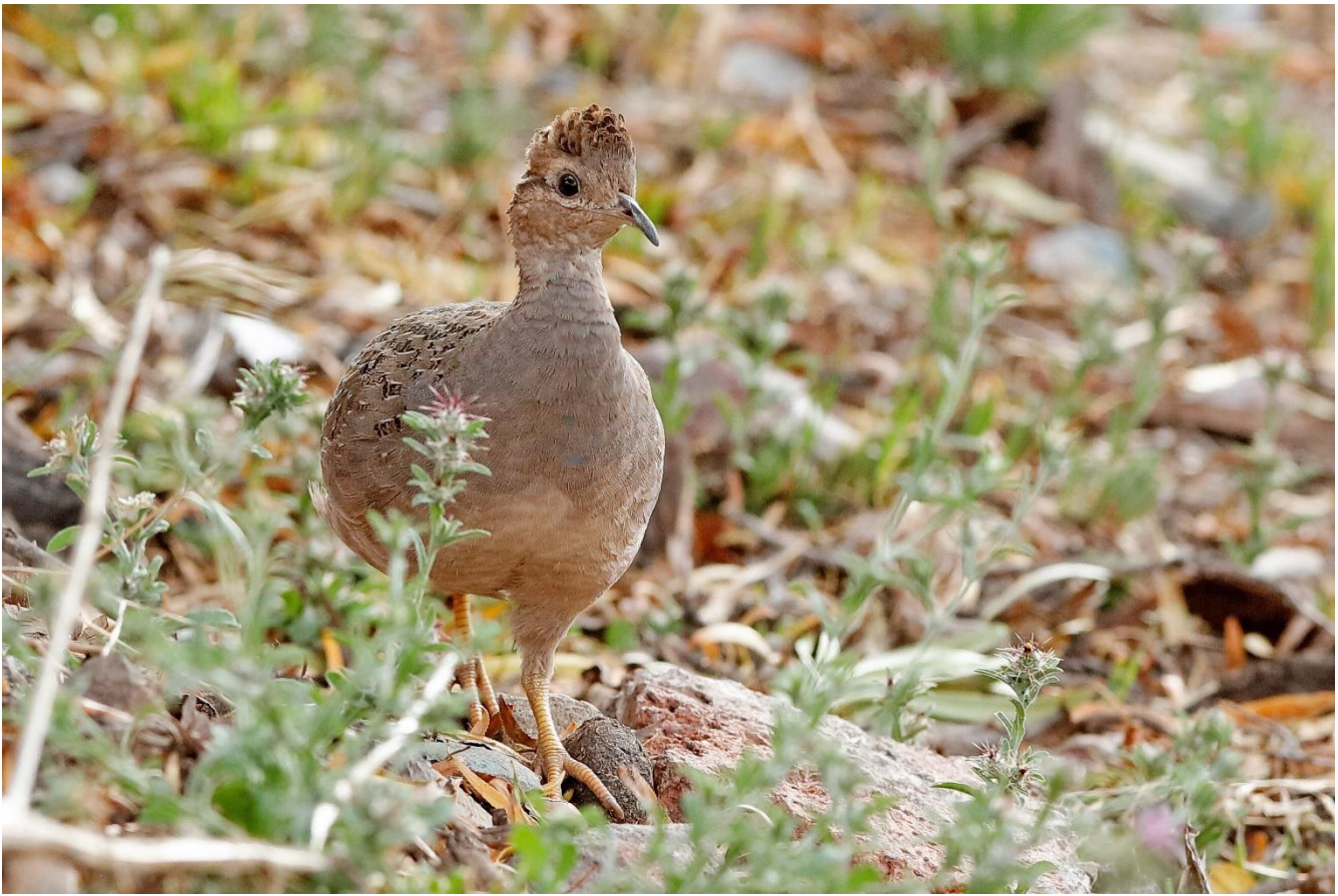
Chilean Tinamou

Day two in Lauca National Park was a bit of a clean-up affair – species like White-winged Sierra Finch, White-throated Sierra Finch, Andean Duck, Andean Coot, Rufous-naped Ground Tyrant and Black Siskin had yet to be seen by all or any of us. Clean-up on these we did, however, as stops at various sites in the park produced one after the other of desired species. A few escaped our grasp, of course, but our time in the park had been nothing if not very successful. We also enjoyed different views of Parinacota and Pomerape volcanoes, as a trip out to Chungará Lake provided us with yet more great vistas – en route and at the lake itself. Following all that, we made a brief stop near Socoroma once more, but turned up nothing new before it was time to make our way back down to Arica for the final night of the extension. The final new bird of our Arica extension was none other than Burrowing Owl – a pair of which we 'twitched' at the airport before checking in.