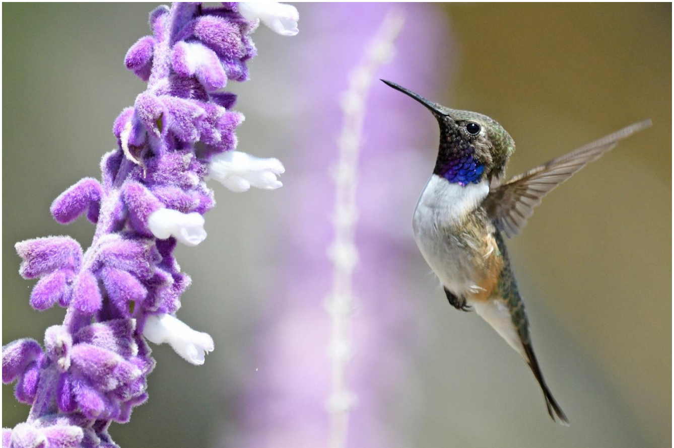
Chilean Woodstar

A quick lunch at the airport then followed, before we finally found ourselves in the field, this time on the shores south of town, where some roadside bamboo and scrub yielded our first and only views of the strange Des Murs's Wiretail and Ochre-flanked Tapaculo. Both, of course, took a little effort to see, so it was late in the day by the time we began our journey north, into the Lake District and Puyehue National Park. Along the way, we stopped for a young Buteo that initially had us thinking White-throated or Rufous-tailed Hawk, and our only Slender-billed Parakeet of the trip, before a race through the forest finally brought us to our accommodation at the Ski Resort in Antillanca.