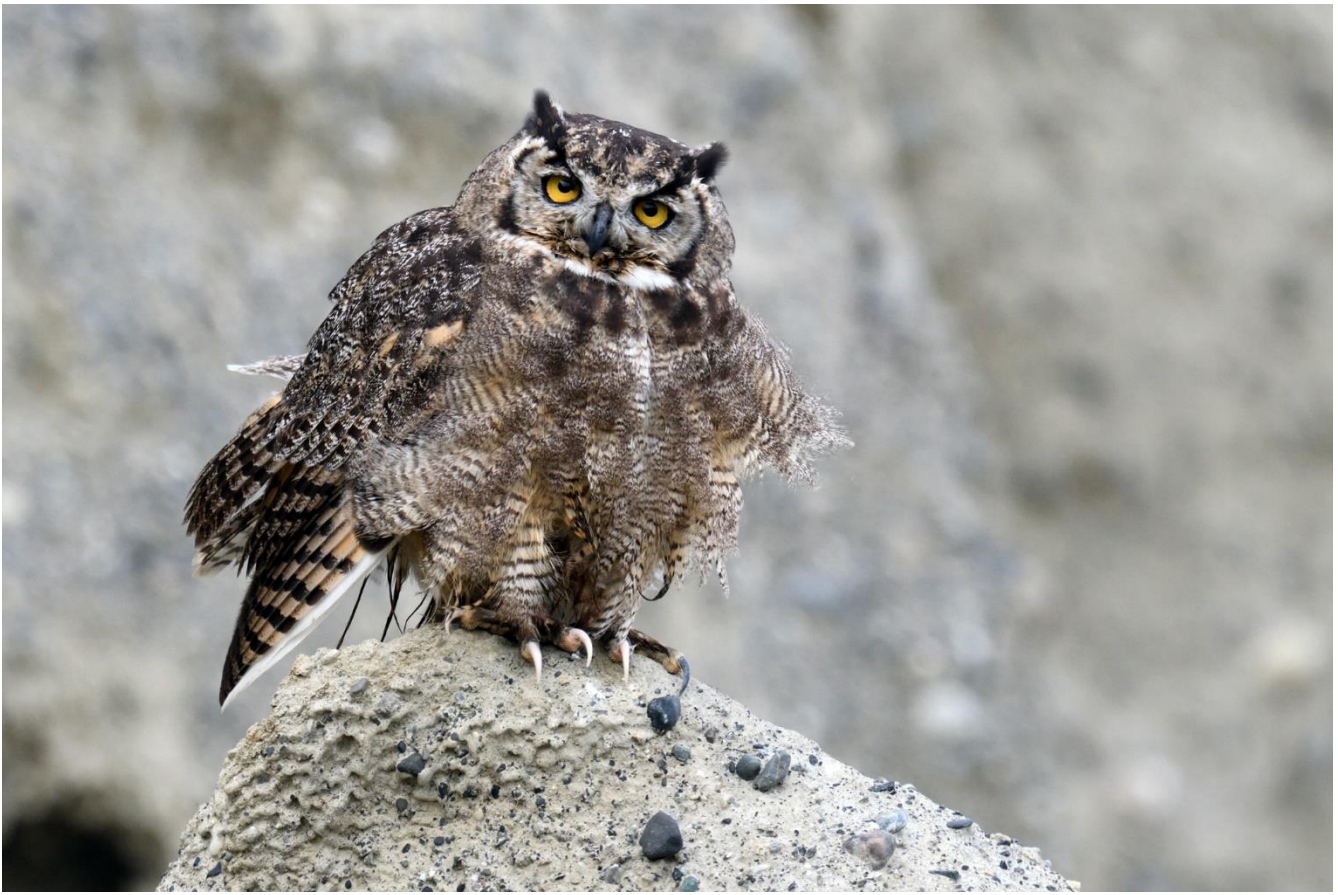
Magellanic Horned Owl by Rich Lindie

Around the corner, we checked into our lodgings along the road to Lomas de Lircay before heading out to the reserve for our first spot of birding in some real forest. Along the way, we had our first looks at Chilean Pigeon, whilst our arrival coincided with some great views of a pair of Common Diuca Finch in the track. Some managed their first views of Chucao Tapaculo, too, though bigger highlights included our only sighting of Austral Pygmy Owl and some great close-ups of White-throated Treerunner. That evening, back at our cabins, we heard our first Rufous-legged Owl, but we would have to wait until morning to see one.