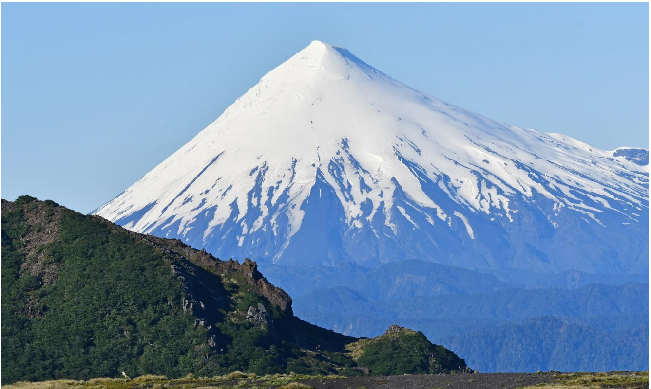
Osorno Volcano by Dan Bormann

Day two of the tour saw us heading south of town for a change, where our first stop was the Camarones Valley. Paying a brief visit to the rocky shoreline at the mouth of the valley, we picked up a few Red-legged Cormorants and our first Chilean Seaside Cinclodes, before heading to a patch of scrub and reeds a little way up the valley. Our main target there, Pied-crested Tit-Tyrant, took no time at all to find and photograph, whilst other birds attracted to our activities included our first White-crested Elaenias, Vermillion Flycatchers and Cinereous Conebills. Moving further up the valley, a roadside stop eventually turned up a Tamarugo Conebill – and just in time, as rising temperatures were soon to send us scuttling back to the van.