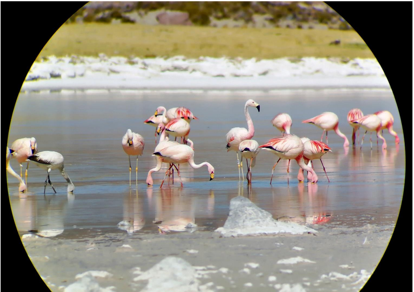
Andean and James's Flamingoes