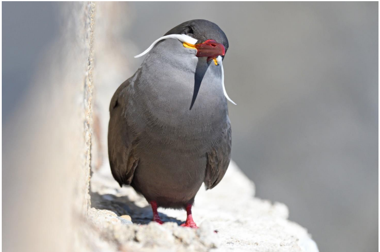
Inca Tern