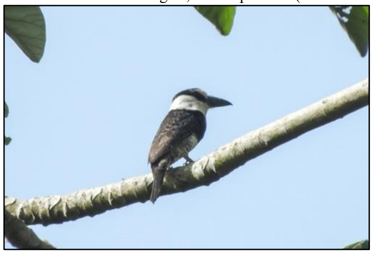
White-necked Puffbird by Roger Rodríguez

Bronze-brown Cowbird. After some obliging Chestnut Piculets, we chanced to see a female Goldengreen Woodpecker (the conspicuously golden-headed race xanthochlorus ) flying through the mangroves. Our last bird was a Pied Puffbird. At Km 4 on the road out of Palermo, we began with Stripe-backed Wrens and Caribbean Horneros. Some saw Chestnut-winged Chachalacas, and shortly afterwards we all got on to a Dwarf Cuckoo. The highlight for some was very close views of Yellow-breasted Crake in marsh that was sadly being treated with herbicide. From here, we transferred to three 4WD Toyotas for the muddy road from Minca to El Dorado. At a series of stops along the way, we had over 50 Swallow Tanagers, a Coopman's (Golden-faced) Tyrannulet, a couple of Golden-winged