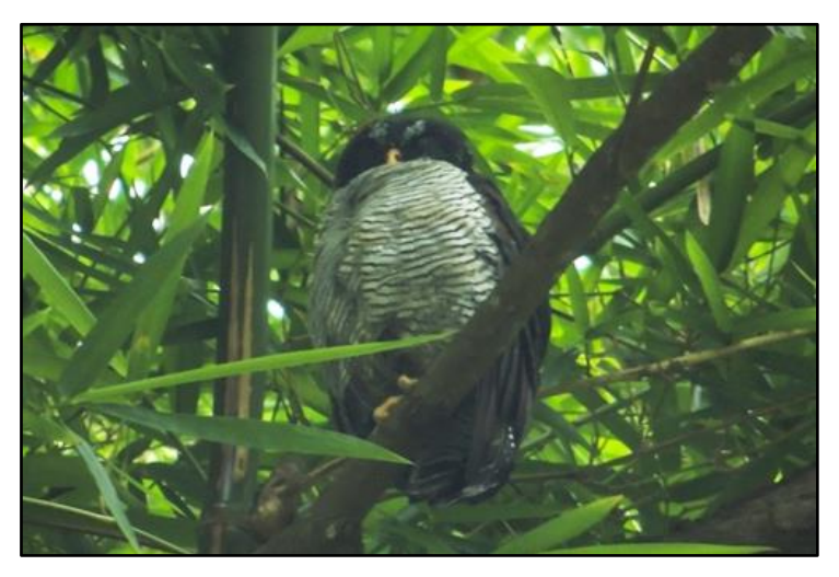
Black-and-white Owl by Roger Rodríguez

Wednesday, 27 June: A 45-minute drive had us at our first birding destination, Isla de Salamanca National Park, at 5.45 a.m.. As we ate our picnic breakfast, we obtained fleeting but diagnostic views of our principal targets, Sapphire-throated and Sapphire-bellied Hummingbirds, restricted to a relatively small area of mangroves on the Colombian coast. Soon after, we enjoyed the first of many looks at the confiding Russet-throated Puffbird. As we walked into the mangroves, a Lesser Nighthawk roosted on a branch by the side of the trail. An unremarkable black bird perched nearby turned out to be our first