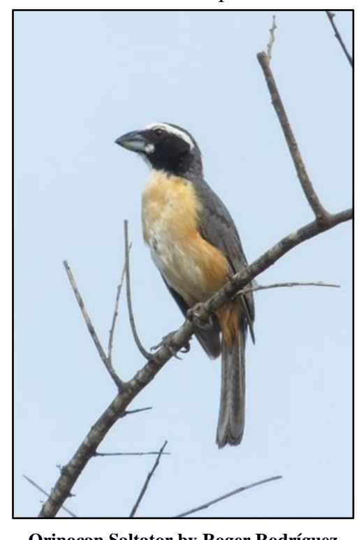
Orinocan Saltator