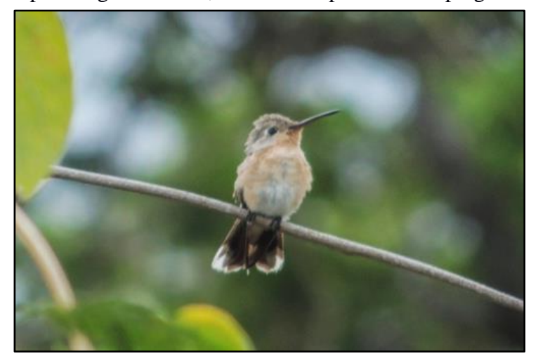
Buffy Hummingbird

Friday, 29 June: We used the hour of light before breakfast to search for Black-throated Wood Quail, in the event only hearing them. We did have nice farewell looks at Sierra Nevada and Santa Marta Brushfinches, as well as Hermit Wood Wren. Our first stop was a good one, with Santa Marta Blossomcrown, (Bangs's) Grey-breasted Wood Wren, Golden-breasted Fruiteater and extremely close looks at three Santa Marta Tapaculos. Palo Alto gave us views of (Yellow-billed) Groove-billed Toucanet. Further down, our drivers found us Santa Marta Woodstar, and we had nice looks at a Rusty-breasted Antpitta; while a coffee stop gave us three more Santa Marta Woodstars. Lower still, we had flight views of Santa Marta Foliage-gleaner. A stop at the curve where we had found Golden-winged Sparrow on our way up to the lodge gave us improved views of two birds which ascended almost to the top of huge bamboos; while a couple of Whooping Motmots were a bonus. A stroll lower down was