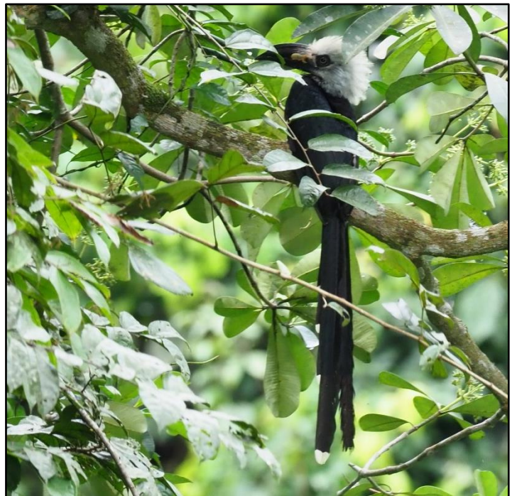
White-crested Hornbill by Stephan Lorenz

and Forest Woodhoopoes, brief White-crested Hornbill, Bristle-nosed Barbet, Melancholy and Firebellied Woodpeckers, Violet-backed Hylia, Green Crombec, good views of Sharpe's Apalis, a regional endemic, confiding Ussher's Flycatcher, Little Green, Grey-chinned, Olive, Tiny, Johanna's and Superb Sunbirds, Red-headed Malimbe, Yellow-mantled and Maxwell's Black Weavers, and Grey-headed and White-breasted Nigritas. The canopy was also busy with greenbuls and we located Slender-billed, Golden, and Spotted. After descending from the canopy walkway, we bumped into a busy feeding flock along the trail which included Brown-throated and West African Wattle-eyes, Grey-headed Bristlebill, and White-throated Greenbul. Near the park's visitor center, we found a Tit Hylia at an active nest and enjoyed superb views of one of Africa's smallest songbirds. Back at the lodge, we found an active Magpie Mannikin nest, another local species. After lunch and a bit of rest, we returned to the canopy walkway for the late afternoon. It was much quieter, but two star birds made the effort worthwhile. First, we spotted a Long-tailed Hawk that showed well in the scope and minutes later, the same tree