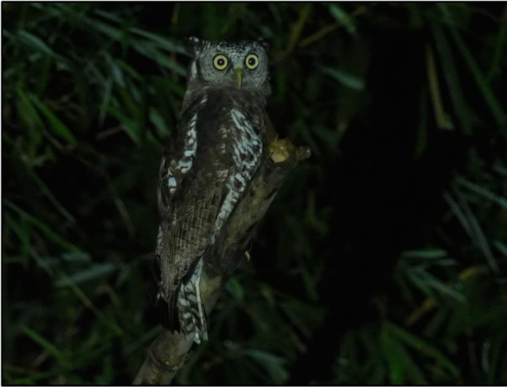
Akun Eagle-Owl

journey north. The habitat changed from green farm bush and forest to more open savanna. Along the way, we kept a careful watch for raptors and were rewarded with excellent views of Beaudouin's Snake Eagle, Dark Chanting Goshawk, Grasshopper Buzzard, and Western Marsh Harrier. The sought-after snake eagle showed well in particular with an adult bird perched on a pylon in perfect light, offering great scope studies. We reached the turnoff towards Mole National Park in the late afternoon and made a quick stop at Busunu Pond. We quickly added several species to the list, enjoying great views of White-faced Whistling Duck, Speckled Pigeon, Bruce's Green Pigeon, the only Green Sandpipers of the tour, Black-headed Heron, Malachite Kingfisher, Piapiac, and an unexpected Gosling's Bunting. A great introduction to the birding we had ahead of us for the next two days. We tackled the rest of the distance and arrived at the lodge in Mole National Park in time for dinner.