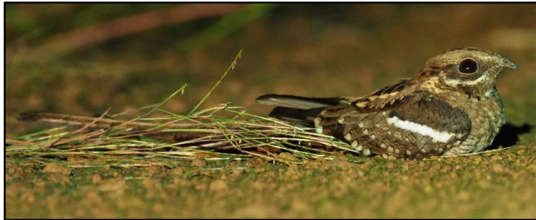
Long-tailed Nightjar

headed Lapwing, uncommon Eurasian Wryneck, hoped-for Chestnut-bellied Starling, and localized Speckle-fronted Weaver. Here, we also found a Cut-throat Finch that was tending a nest, a rare species in Ghana and usually not a breeding bird. A roadside Gabar Goshawk chasing a Dark-chanting Goshawk was also new.