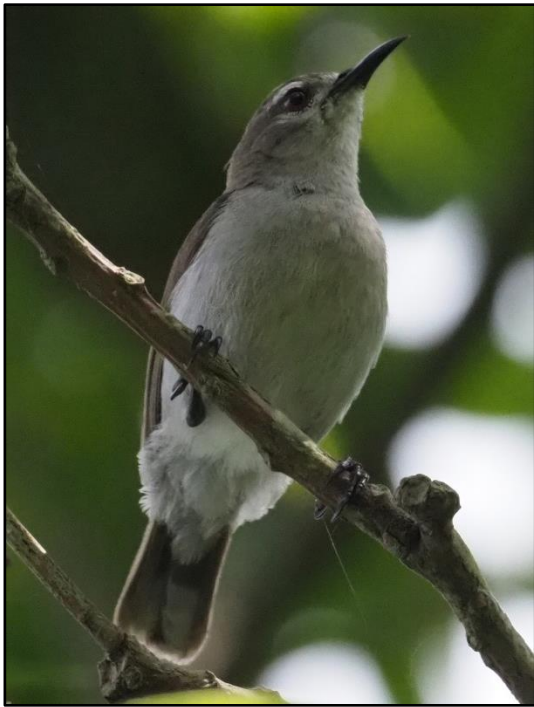
Mangrove Sunbird by Stephan Lorenz

of cisticolas found in Ghana with Singing, Croaking, and Short-winged all seen well. We also noted a few Palearctic migrants with Spotted and European Pied Flycatchers and Whinchat all seen well. One of