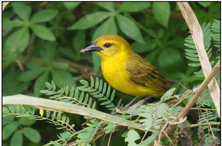
Slender-billed Weaver

for nearly thirty minutes as new birds dropped in all around us. Some of the best finds included African Green Pigeons, Diederik, Klaas's and African Emerald Cuckoos, all offering perched views with the former two showing on the same branch! Circling above us, we found two Mottled Spinetails among the scores of Common and Little Swifts. We could barely keep up with the many new additions and while we only covered a few hundred metres along the dirt road, we added African Harrier-Hawk, African Pied and Piping Hornbills, Black Bee-eater, Naked-faced Barbet, Speckled and Yellow-throated Tinkerbirds, Yellow-spotted Barbet, Black-winged Oriole, Fanti Drongo, Red-bellied Paradise Flycatcher, Grey-backed and Yellow-browed Camaropteras, Tawny-flanked Prinia, Red-faced Cisticola, Lesser Striped and Mosque Swallows, Fanti Saw-wing, Common Bulbul, Northern Yellow White-eye, Splendid Starling, Collared, Blue-throated Brown, Buff-throated, Olive-bellied and Superb Sunbirds, Black-necked and Vieillot's Black Weavers,