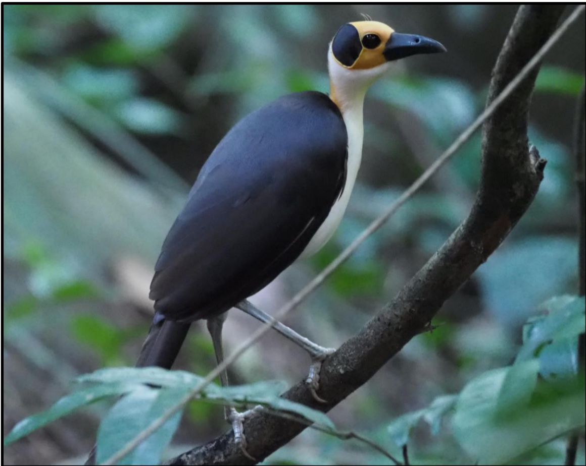
White-necked Rockfowl