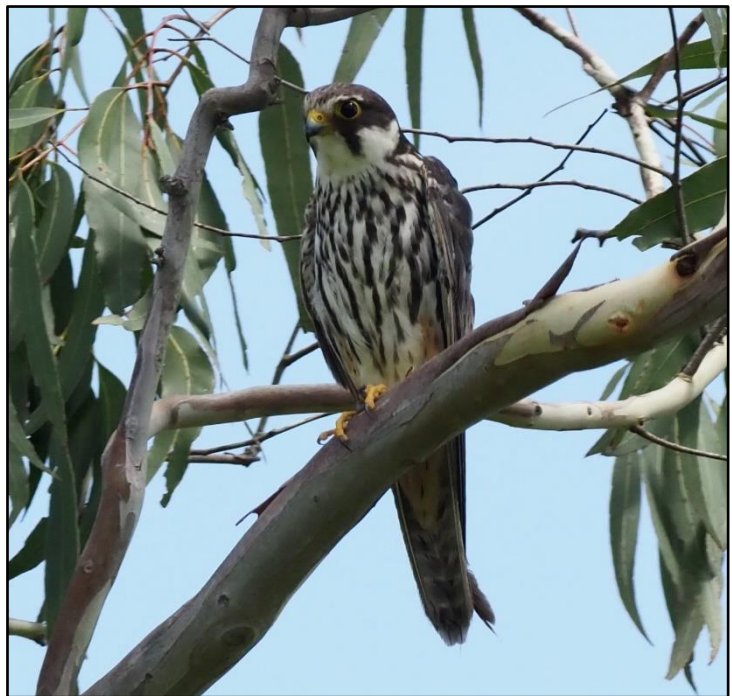
Eurasian Hobby