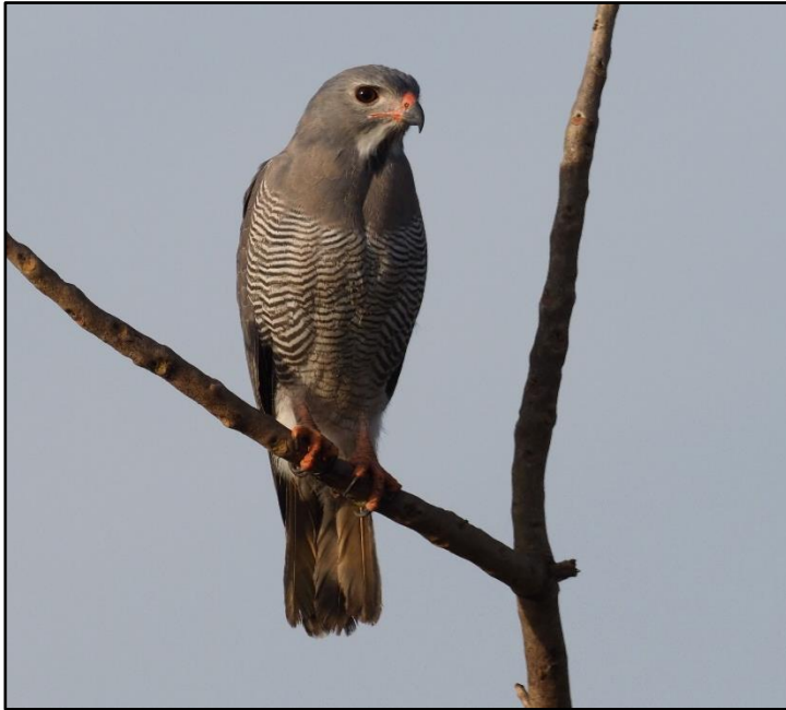
Lizard Buzzard by Stephan Lorenz

Hairy-breasted Barbet, scope studies of a pair of stunning Blue Cuckooshrikes, Western Oriole, a flock of comical Red-billed Helmetshrikes, a group of Chestnut-capped Flycatchers in the canopy, noisy Fraser's Forest Flycatchers, Red-vented Malimbos finally offered perched views, and everyone caught up with a Yellow-mantled Weaver. The rare