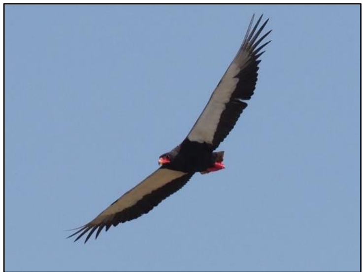
Bateleur by Stephan Lorenz

Our second full day in Mole National Park also resulted in a day list well above 100 species and we did focus on a different area of the park. We again spent some time scanning the wetland below the lodge right after breakfast and then continued to the savanna around the airstrip where an early highlight included a White-throated Francolin that crossed the road right in front of us twice! We then set out along a loop road skirting wetlands and passing through riparian forest. Some of the highlights of the morning's outing included Violet Turaco, Sulphur-breasted and Grey-headed Bushshrikes, Glossy-backed Drongo, African Paradise-Flycatcher, African Blue Flycatcher, Yellow-breasted Apalis, West African Swallow, great views of the skulky Blackcap Babbler, and had excellent comparisons between Village and Wilson's Indigobirds. Back at the lodge, we kept an eye to the sky and found a locally rare Alpine Swift while new additions to the raptor tally included locally rare Rüppell's Vulture, Martial