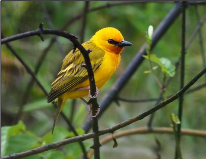
Orange Weaver

Grey-headed Nigrita, African Firefinch, Bronze Mannikin, and Pin-tailed Whydah. With our heads spinning from such a diversity of birds, we returned to the hotel for a well-earned dinner.