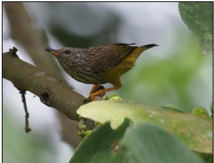
Tit Hylia by Stephan Lorenz

For the final full day in Kakum National Park, we returned to the Abrafo Forest area with several excellent targets in mind and we did very well. Some of the highlights included a vocal Olive Long-tailed Cuckoo seen by most of us, Buff-spotted Woodpecker, a displaying Rufous-sided Broadbill, Red-cheeked Wattle-eye, Lemon-bellied Crombec, Grey Longbill, Green Hylia, Olive-green Camaroptera, Red-tailed Greenbul, skulky Puvel's Illadopsis, Green-headed Sunbird, and an incredible trio of malimbos Red-vented, Blue-billed and Crested Malimbos, and secretive Western Bluebill for some. We then walked further into the farm scrub and found an immense flock of beautiful Rosy Bee-eaters, this species is a non-breeding