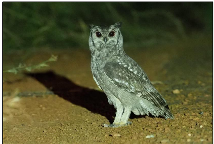
Greyish Eagle-Owl

Driving towards the river, we stopped in various sections of farmland with scattered trees, adding a few species, including Yellow-billed Oxpecker and White-billed Buffalo Weavers at a colony. We reached the river in the late morning and it took only a few moments of scanning before we had a pair of Egyptian Plovers in the scope and then found at least four more further downstream. We walked along a small path paralleling the river and added Mourning Collared and Namaqua Doves, and fast flying Red-necked Falcon to the list. On the edge of a small wetland, we found Zitting Cisticola, Quailfinch in flight, and a flock of African Silverbills. We drove back to town and our accommodations for lunch and some rest. In the afternoon, we drove in the opposite direction towards Tono Dam. The birding in the afternoon was quieter, but we still managed to add a pair of roosting Spotted Thick-knees, good views of Little Bee-eaters, glimpses of the localized Black-backed Cisticola, and a locally rare Variable Sunbird. Despite our best efforts, we could not find Quailfinches on the ground, but had many close flight views. We then enjoyed a proper sundowner overlooking the lake from the dam before returning to the hotel for dinner and some well-earned rest.