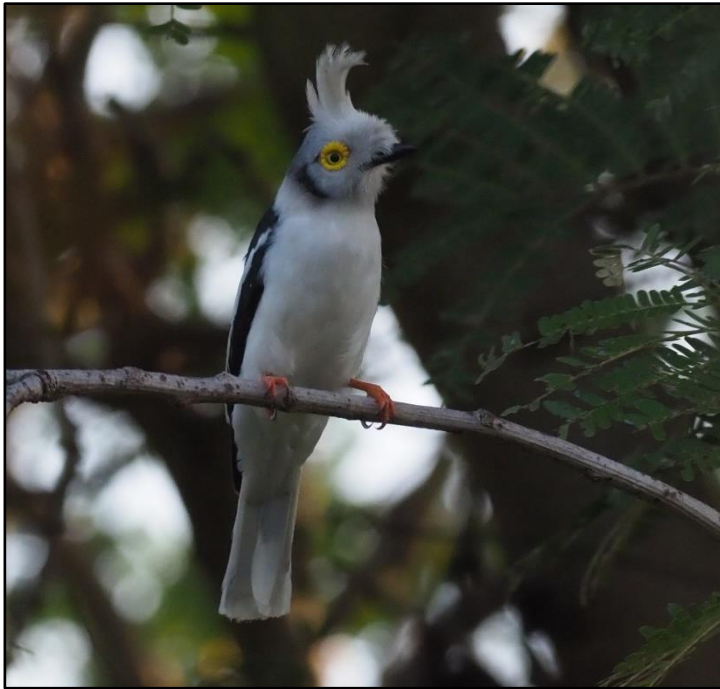
White-crested Helmetshrike

Swamp Flycatcher, and a stunning trio of sunbirds with good views of Pygmy, Scarlet-chested and Beautiful Sunbirds. In the afternoon, we returned to the same stretch of road and systematically looked