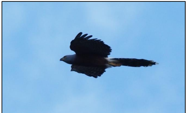
Long-tailed Hawk

add Red-necked Buzzard, African Grey Woodpecker, Northern Puffback, and seldom recorded Red-headed Quelea. We also spent considerable time tracking down a few skulky species, most notably Snowy-crowned Robin-Chat and the neat Forest Robin, both of which showed well, while the very rare Forest Scrub-Robin was mainly seen in flight. We returned to the main road and carried on with the