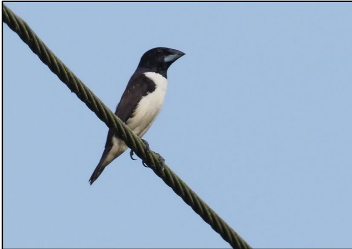
Magpie Mannikin

With plans to continue towards Kumasi in the center of the country and a stop at the famous Bonkro village along the way, we only had limited time to bird in the morning. We decided to return to the Stingless Bee Center Road in order to improve on some of the species we had only glimpsed the previous