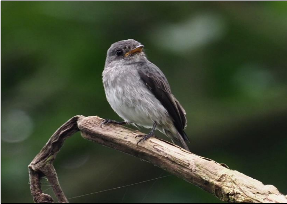
Little Grey Flycatcher

birds we had heard only during previous days. While our legs were a bit weary, we continued birding steadily throughout the morning, finding several new species, including Narina Trogon, Fernando Po Batis at the last chance, Brown and Blackcap Illadopsis for some, Finsch's Rufous Thrush, and White-tailed Alethe. We also enjoyed better views of Forest Woodhoopoe, Black Bee-eater, Western Oriole, Black-capped Apalis, and Yellow-mantled Weaver. The final new bird seen by all for the tour was a calling Crowned Eagle, what a fitting finish to a very enjoyable and successful Ghana birding adventure. We returned to the vehicle by midday, drove back to the hotel to pack up and started the return journey to Accra. Back at the familiar Erata Hotel in Accra, we had a celebratory farewell dinner, completed the final checklist, talked about the amazing sightings we shared, and wished everyone a safe homeward journey.