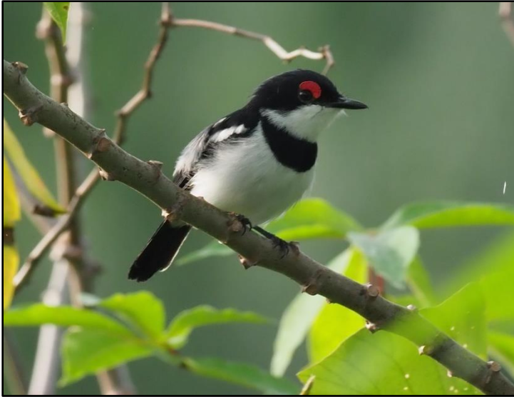
Brown-throated Wattle-eye by Stephan Lorenz

This morning, we drove towards the northern sector of Kakum National Park, where we spent time exploring forest patches and farm scrub alongside roads and sandy tracks. We made a few stops along the way towards the main birding site and found Tambourine Dove, Black-throated Coucal, and a cooperative White-spotted Flufftail. Once we reached the Antwikwaa area, we added a perched Red-chested Goshawk, Yellow-billed Barbet at a nest cavity, Grey Kestrel, Black-and-white Shrike-flycatchers, a reluctant Kemp's Longbill, excellent views of Rufous-crowned Eremomela, Swamp Palm Bulbul, and many Black-and-white Mannikins. Once the morning warmed up, we headed back to the vehicle and drove to the Pra River. Here, we carefully scanned the banks and bridge pylons and although the water levels were very high, we spotted several Rock Pratincoles, White-bibbed Swallows, and a