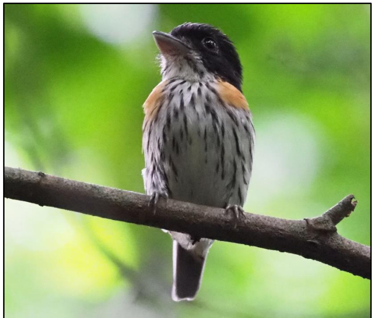
Rufous-sided Broadbill by Stephan Lorenz

Our first outing in Ghana took us to the Shai Hills Resource Reserve and we left very early, reaching the entrance road just after sunrise. The Shai Hills offer a great mix of habitats, including rocky outcrops, dense riparian forest, woodland, and grassland. We spent a full and productive morning here, seeing several specialties. Some of the highlights included Stone Partridge, Double-spurred Francolin, Red-eyed, Vinaceous and Blue-spotted Wood Doves, Guinea Turaco, Western Plantain-eater, Senegal Coucal,