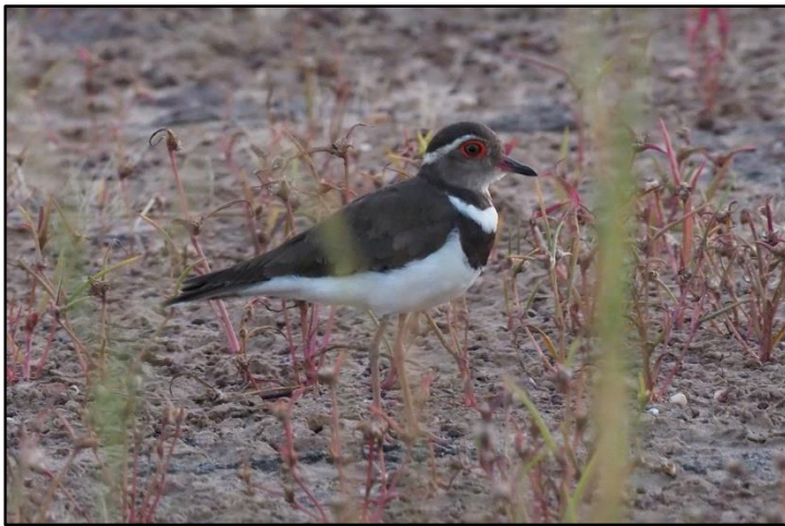
Forbes's Plover by Stephan Lorenz

Eagle, and a pair of African Hawk-Eagles right above the lodge. During the afternoon, we checked some of the same spots from the previous day and were able to add Eurasian Hoopoe, Melodious Warbler, and had excellent studies of several Black-rumped Waxbills near a waterhole.