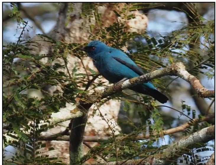
Blue Cuckooshrike by Stephan Lorenz

The final full day of birding was devoted to a longer hike into the pristine forest atop the Atewa Ridge. We had exceptional luck with cloudy conditions keeping the temperatures down and bird activity high. Although, at one point it looked like dense fog was going to cancel birding early, we persevered and were well rewarded. It was a long day with some difficult forest birding, but lots of highlights. Some of the best finds included Blue-headed Wood-Dove perched for scope views, several Yellow-billed Turacos seen, a pair of showy Black Cuckoos, Sabine's Spinetails above, a cooperative Chocolate-backed Kingfisher, Purple-throated Cuckooshrikes, African Shrike-flycatcher, Sabine's Puffback, Many-colored Bushshrike, Shining Drongo, Western Nicator, Black-capped Apalis, Western Bearded and Icterine Greenbuls, the regional endemic Copper-tailed Starling, Little Grey Flycatcher, and, near the end of the day, a beautiful Preuss's Weaver that sat still for scope views. This was a truly impressive haul of new species. The star bird of the day, Blue-moustached Bee-eater, took some time to locate, but we all ended up with good views. By the end of the day, we had put in a few miles of walking, but it was well worth the effort.