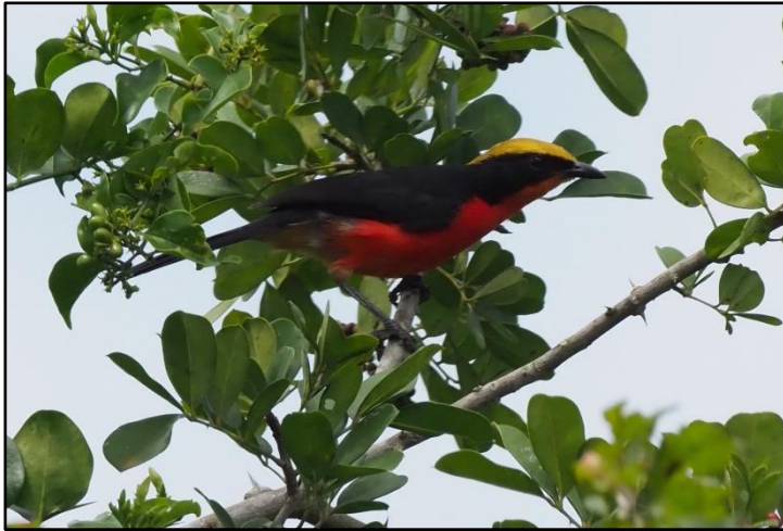
Yellow-crowned Gonolek by Stephan Lorenz

We began early, eating a quick breakfast at the hotel, and then loaded the vehicle for the drive to Kakum National Park. Of course, we had several stops in mind. At first, we beat the traffic, but as we neared our first birding location at Winneba, the road narrowed, and progress was at a snail's pace. Fortunately, we