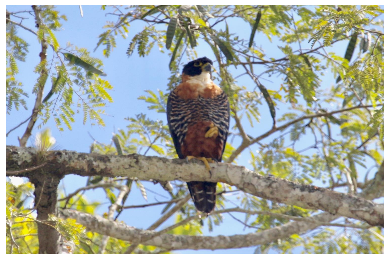
Orange-breasted Falcon by Gil Ewing

We had most of the morning for one final bit of birding, and made the most of it with a very pleasant and productive walk around the expansive grounds of our hotel. Top sightings included shy Scaled Pigeons, a wonderful American Pygmy Kingfisher, Stripe-throated Hermit (our 24<sup>th</sup> and final hummer of the trip!), Rufous-tailed Jacamar, White-fronted Amazon perched out in great light, a vocal pair of Couch's Kingbirds and, just as we finished up the walk, a lovely male Blue Ground Dove sitting up on a perch.