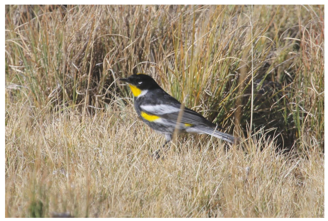
Goldman's Warbler by Gil Ewing

Already very pleased with our results, we decided to push our luck and search for the notoriously elusive Ocellated Quail. We did, in fact, hear one calling upslope and decided to pursue it – slow going in the thin air. Much closer than we had thought the bird was calling, a male and female suddenly burst up at our feet. Amazing! Over the next several minutes, we ended up flushing about 6 birds and everyone got good flight views, a couple of lucky folks also got to see them running on the ground. What an exciting result! After that, we took some more time to enjoy walking and birding in this very scenic area, and a nice highlight was a good sighting of a Long-tailed Weasel. This Central American race has a strikingly patterned face. From here, it was time to start the long drive back to Guatemala City.