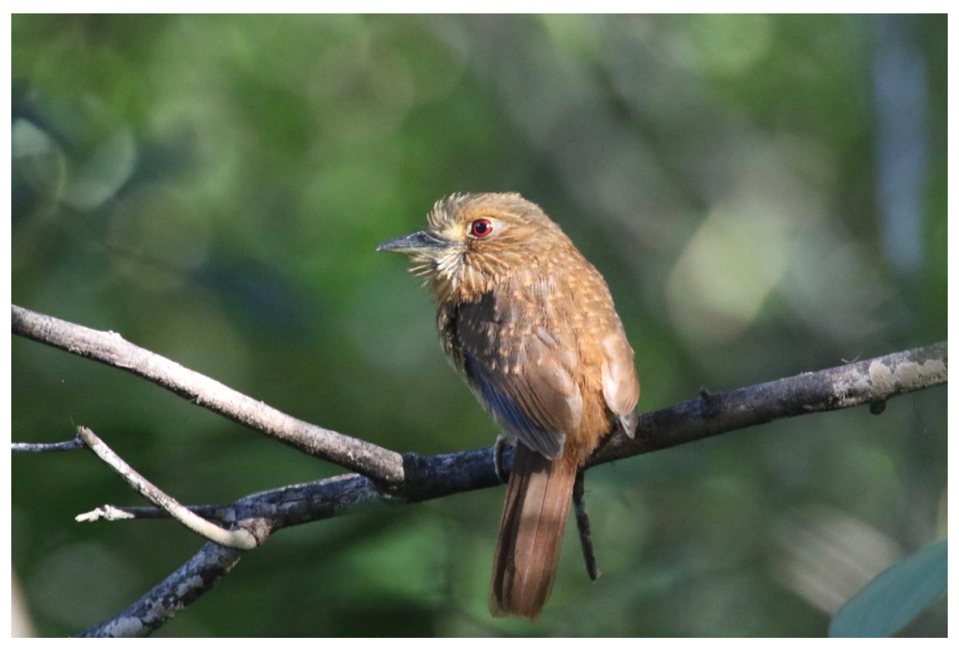
White-whiskered Puffbird

On our walk out, we were waylaid but a monster flock that included the classic sentinel species Black-throated Shrike-Tanager, along with so many more, including Chestnut-colored Woodpecker, Plain Xenops, Greenish Elaenia, Sepia-capped Flycatcher, many Lesser Greenlets, Spot-breasted Wren, Golden-winged Warbler, Tropical Parula and an unexpected pair of Golden-hooded Tanagers. We eventually had to pull ourselves away to go and find some lunch. Over lunch break, Trevor and Anne were fortunate to spot a Great Curassow, and then we all had 3 King Vultures fly low overhead.