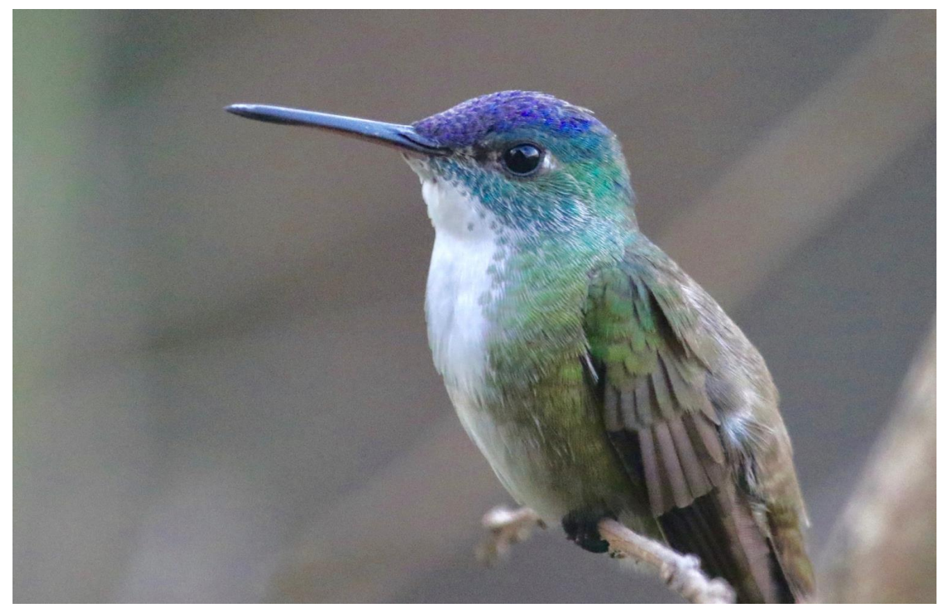
Azure-crowned Hummingird by Gil Ewing

With some political protests being scheduled for the next day, we had to leave the lake early in the morning and arrived at Antigua much earlier than had originally been scheduled. After a relaxed breakfast and an early check in to our hotel, we had the remainder of the morning to explore this fascinating and historic city. In the afternoon, we headed up to nearby Finca El Pilar. The excellent hummingbird feeders there were buzzing with no less than 7 species coming and going, most species giving us their best looks of the trip: Rufous and Violet Sabrewings, Green-throated Mountaingem, and Azure-crowned, Berylline, Rivoli's and White-eared Hummingbirds. We then headed up into the oak forests and birded a large clearing, where we saw Greater Pewee, Bushy-crested Jay, Grey Silky Flycatcher, Black-headed Siskin and an all too brief White-breasted Hawk, seen only by the leaders. We went higher still into the oak forests and the late afternoon was quiet bird-wise, not to mention decidedly chilly. We waited until dusk, and in the fading light we were serenaded by a pair of Fulvous Owls that in no time at all were beautifully perched up in the spotlight for an exciting finish to the day. We then had a lovely dinner back at the hotel in Antigua.