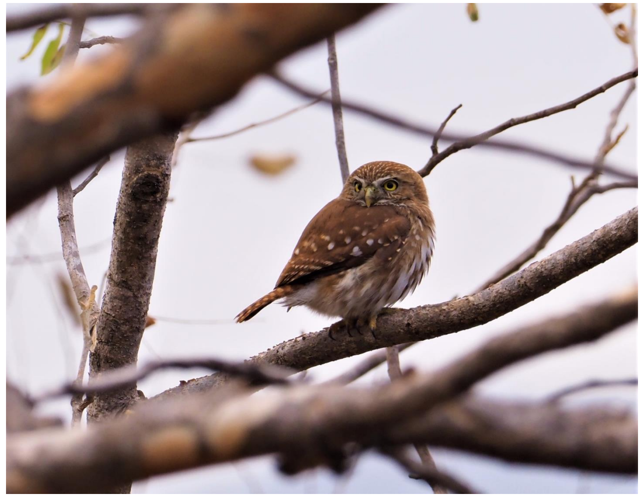
Ferruginous Pygmy Owl