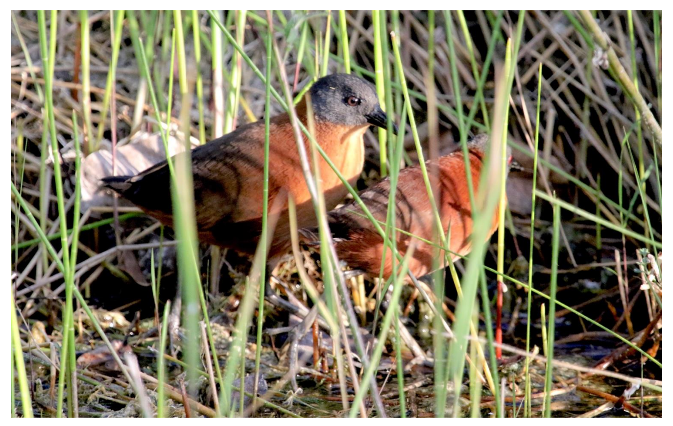
Ruddy Crakes by Gil Ewing

We had a return visit to the temple area for the morning, and birding was once again exceptional. However, the birds seen today were completely different to what we had seen the previous day, even though we were birding the same area. We had excellent views of a cute little Stub-tailed Spadebill, a species which had been doing a good job of eluding us until now!