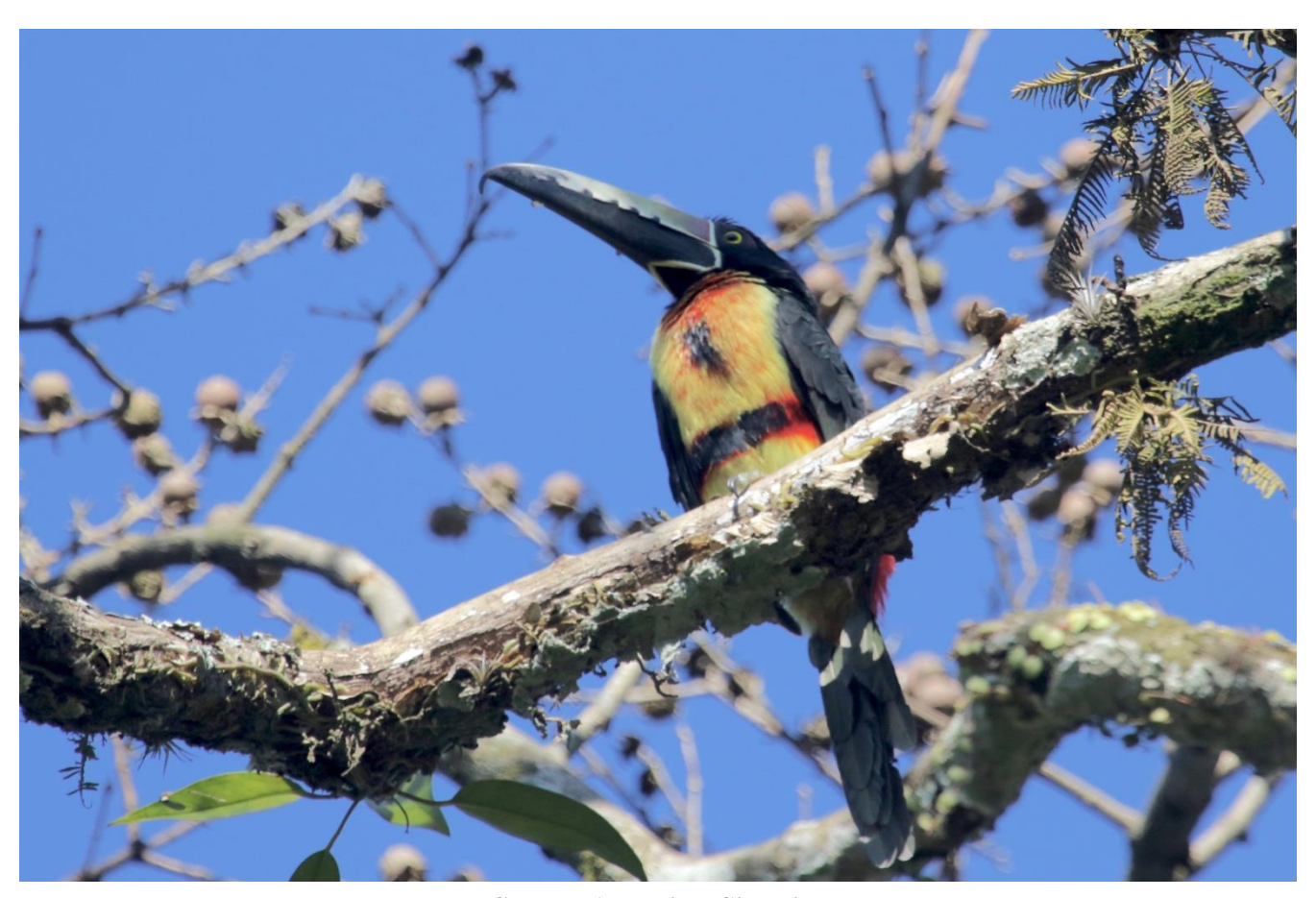
Collared Aracari

Beyond these highlights the forest was quiet, although on the walk out we did locate a lek of Emerald-chinned Hummingbird, and the forest itself was absolutely magnificent with many massive oak trees that were hundreds of years old. We had a great lunch at the Finca and enjoyed plenty of bird activity in the gardens. Blue-tailed Hummingbird and Violet Sabrewing were constantly coming in and out of the hummingbird feeders; while a Black Hawk-Eagle soaring overhead was another highlight. We returned to our base at Los Tarrales in the afternoon and arrived in time to watch more than 20 Yellow-naped Amazons heading off to roost. Great to see the conservation efforts on this endangered parrot yielding results.