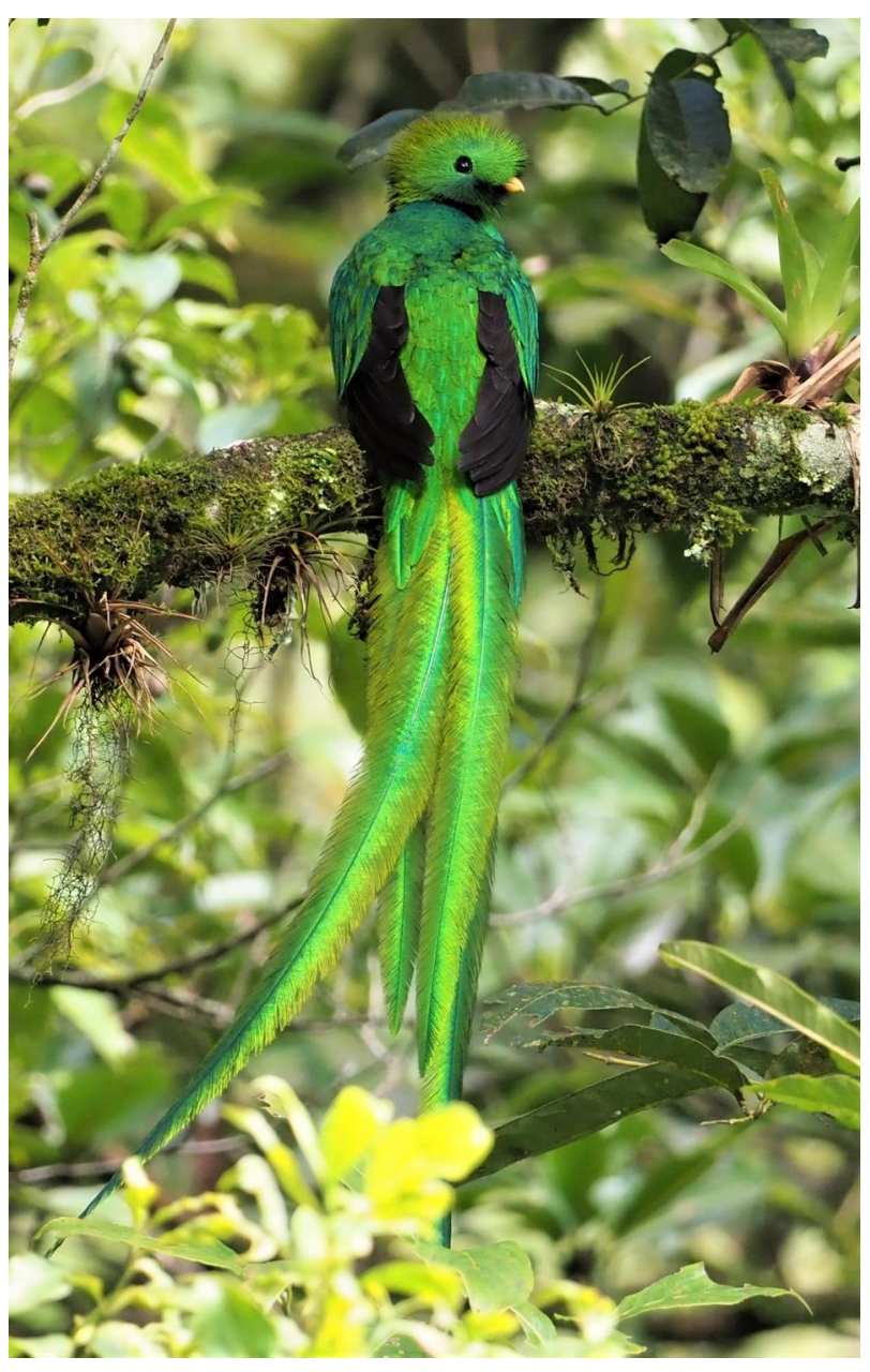
Resplendent Quetzal by Daniel Aldana Schumann

We spent another morning in the cloud forest, this time at Ranchito Quetzal. Early morning around a street light produced a number of confiding birds feeding on moths: Golden-browed Warbler, Eye-ringed Flatbill, many Common Bush Tanagers and a stunning male Black-throated Blue Warbler, a rare bird in Guatemala. In the parking area, a female Resplendent Quetzal made a brief appearance, but disappeared, leaving us hoping for more! A big flock moving through had Scaly-throated Foliage-gleaner, Spotted Woodcreeper and a couple of excellent birds that showed all too briefly: Hooded Grosbeak and Golden-cheeked Warbler. We then headed onto a narrow forest trail through the stunning forest with its huge, bromeliad adorned trees and lush streams and waterfalls. We did well to have excellent looks at both Tawny-throated Leaftosser and Black-capped Nightingale Thrush. Just as we arrived back to the parking lot, a jaw-dropping male quetzal appeared, and we spent the next hour watching this bird at leisure from every angle one could hope for. Absolutely fantastic stuff!