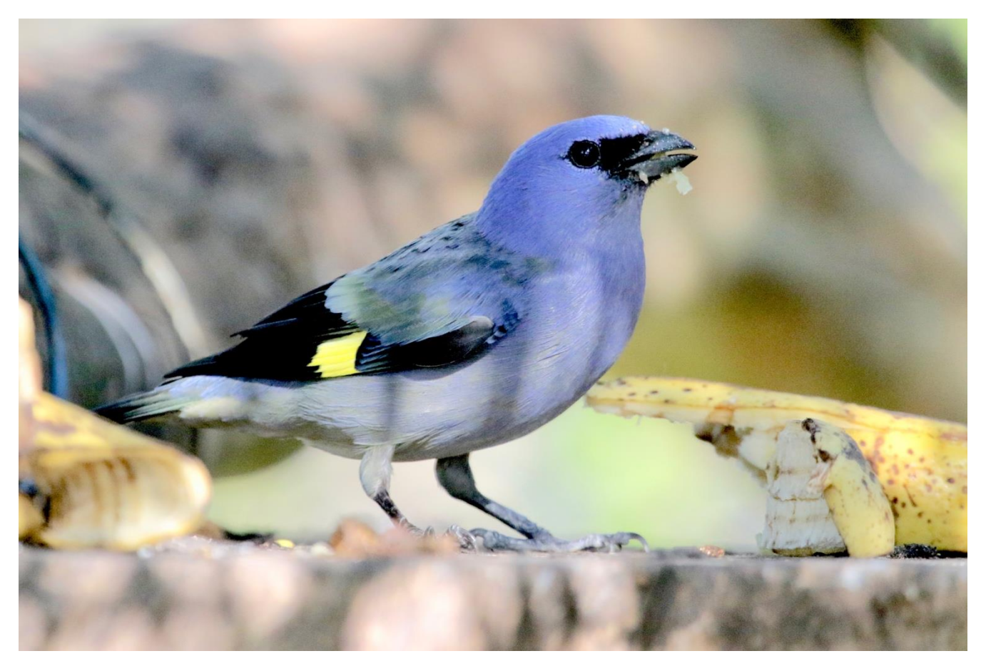
Yellow-winged Tanager by Gil Ewing

A full day at Los Tarrales was a great experience, as this is one of the birdiest sites in the country. We encountered a huge diversity of birds on the trails and in the lodge gardens, including many specialities. Some standouts from our morning walk were White-bellied Chachalaca, distant Highland Guan, very close Crested Guan, a soaring King Vulture, a pair of Mottled Owls roosting in the bamboo, Cinnamon Hummingbirds, lekking Blue-throated Sapphires, a Long-billed Starthroat building a nest, stunning Gartered Trogons, a Ruddy Woodcreeper attending an ant swarm, a cooperative Paltry Tyrannulet, fantastic male Long-tailed Manakin in a fruiting tree, a shy Orange-billed Nightingale-Thrush, several White-throated Thrushes feasting in a fruiting tree and Spot-breasted Oriole. Quite the morning! In the afternoon, we drove up a bumpy track to gain a bit more elevation, where we found a flowering Inga tree that was full of interesting hummingbirds, and here we saw the tricky Emerald-chinned Hummingbird quite well, in addition to the localised Rufous Sabrewing and Blue-tailed Hummingbird.