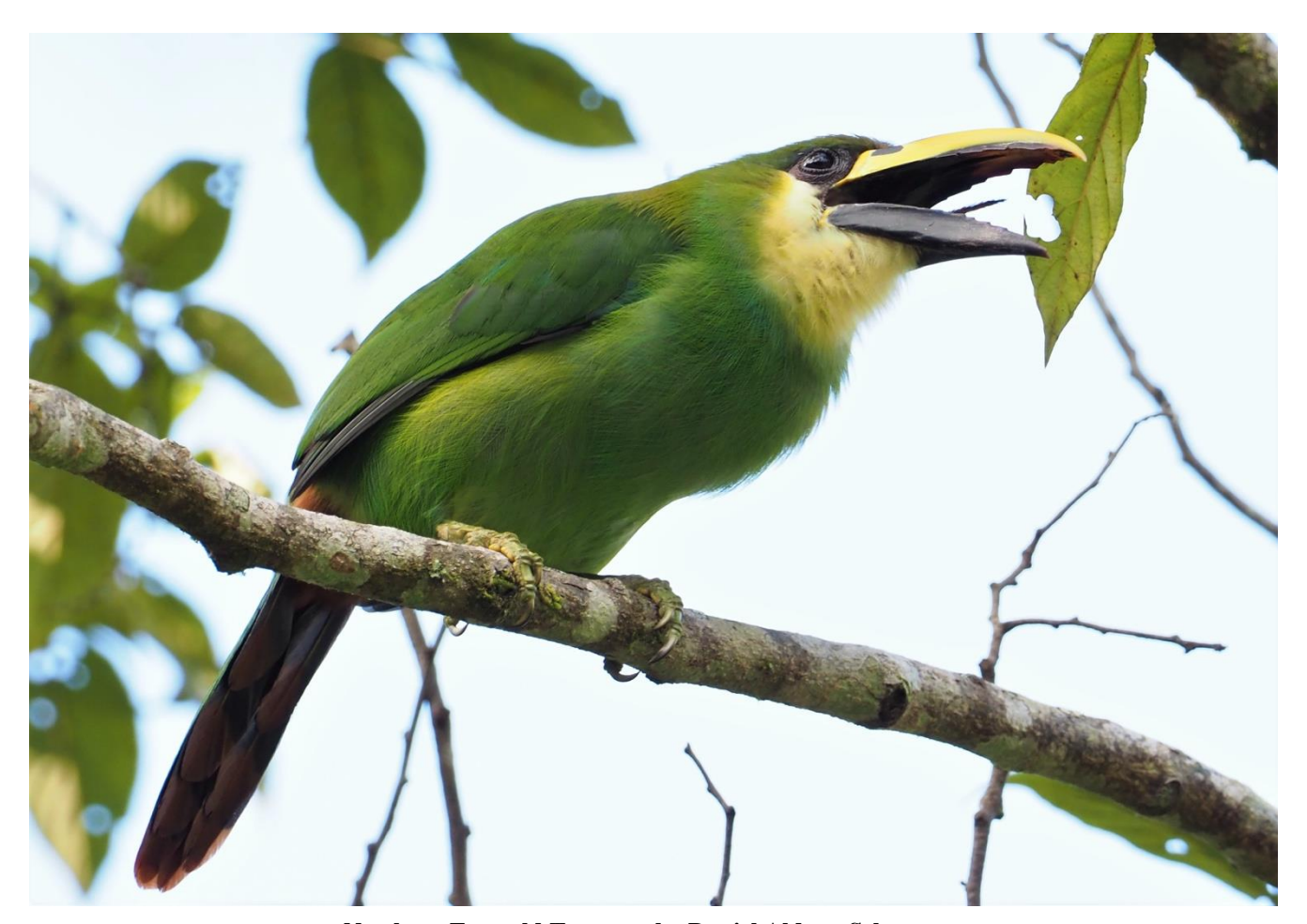
Northern Emerald Toucanet

The next morning, we were birding the well-preserved hill forests of Finca Las Nubes. A long walk this morning netted us another great selection of new birds, including Short-tailed Hawk (landing right above us!), Wedge-tailed Sabrewing, Rufous-tailed Hummingbird, White-bellied Emerald, Lesson's Motmot, Smoky-brown Woodpecker, a Barred Forest Falcon that perched ever so briefly right in front of us, Rufous-breasted Spinetail, Ivory-billed Woodcreeper, a cute Northern Bentbill, Slaty-headed Tody-Flycatcher, White-collared Manakin, Green Shrike-Vireo, Tawny-crowned Greenlet, Olive-backed Euphonia, Golden-crowned Warbler, Morelet's Seedeater, Black-faced Grosbeak and both Passerinin's and Crimson-collared Tanagers. A long list of good birds in another really beautiful forest! The afternoon was spent driving back to Antigua, where we arrived for dinner.