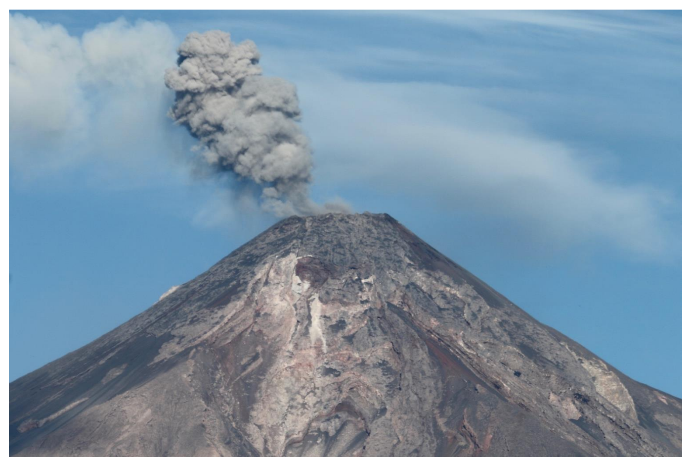
Volcan Fuego by Gil Ewing

The whole morning was non-stop bird activity, with very impressive numbers of North American migrants, supplemented by some interesting resident species. A partial list of highlights would include Broad-winged Hawk, Berylline Hummingbird, astounding numbers of Ruby-throated Hummingbird, Northern Beardless Tyrannulet, Yellow-olive Flatbill, Hammond's Flycatcher, Rose-throated Becard, Philadelphia Vireo, Spot-breasted and Cabanis's Wren, Northern Parula, Rufous-capped Warbler, Yellow-breasted Chat, 5 species of oriole, White-winged Tanager, Blue Grosbeak, and bright male Painted Bunting; while White-eared Ground Sparrow and Blue-crowned Chlorophonia were both only glimpsed. To round off our visit, we had a wonderful picnic lunch with our local guide, Dani's, family as we learned of the conservation efforts in this area. We then departed for Los Tarrales Reserve in time for some late afternoon birding around the lodge, getting us primed up for the day to come while a Grey Short-tailed Bat trapped inside the reception building was a nice find, and we caught and released it.