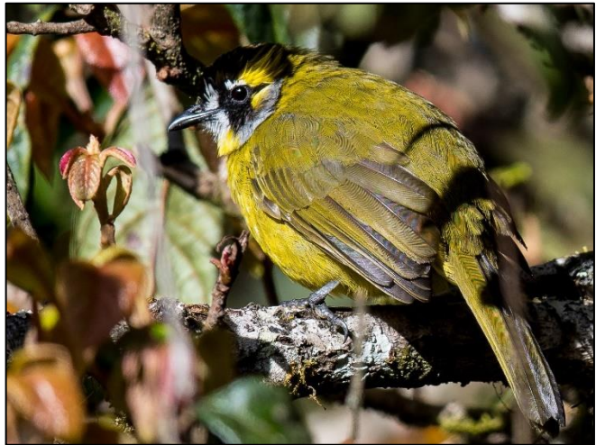
Yellow-eared Bulbul by Dennis Braddy

The following day, we left the steamy lowlands of Kitulgala behind and ascended to the coolness of Nuwara Eliya. Our first stop after checking into our hotel was the shoreline of Lake Gregory, a popular tourist attraction and the focal point of the town. We were surprised to see two soaring White-bellied Sea Eagles; while the water's edge held Common Sandpiper, Hill Swallow, Western Yellow, Grey and White Wagtails, and Paddyfield Pipit. We then moved on to the nearby Victoria Park where, despite the manicured lawns and constant flow of people, we found White-breasted Waterhen, Yellow-eared Bulbul, Asian Brown Flycatcher, Indian Blue Robin, very accommodating Scaly-breasted Munias and our fourth wagtail species of the day – Forest Wagtail. Best of all was a stunning Indian Pitta that we observed at the overgrown edges of the park. What a beauty! Our intentions of visiting Hakgala Botanical Gardens that afternoon were scuppered by a bank of thick fog that moved up the escarpment and totally blanketed our destination. We birded a patch of woodland near our hotel instead. It was very quiet but we did find Grey-headed Canary-Flycatcher and a handsome Grizzled Giant Squirrel.