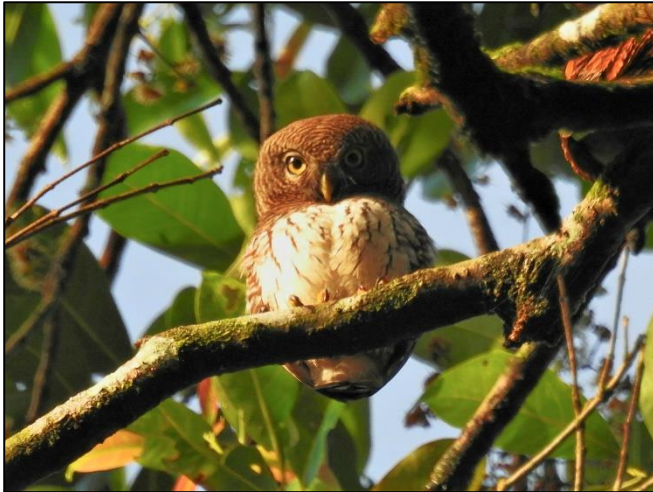
Chestnut-backed Owlet

Travelling through Sri Lanka, one is struck by how much habitat remains intact and untouched. Steep valleys and mountainsides are covered in bright green forest which teem with birds, many of which are endemics. Birding on this island is very satisfying as even the heavily altered habitats, like crop fields, abound with birdlife, and good mammal viewing can be had in the numerous game parks. On this tour, we recorded a respectable 226 bird species, 17 mammals and a variety of remarkable reptiles, thanks to our local guide's enthusiasm for herps.