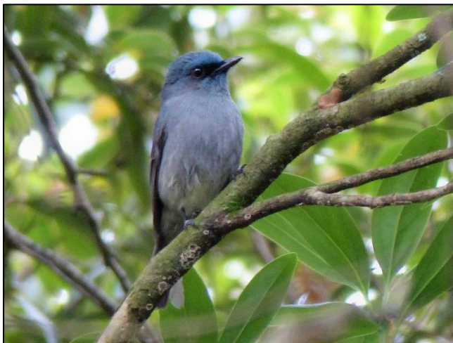
Dull-blue Flycatcher

Early the next morning, we bundled into two minibuses and drove through the darkness to Horton Plains National Park. When we arrived at the park entrance, and with the sun just rising, there was already a queue of vehicles outside the locked gates! Thankfully, most of the park's visitors were headed to the lookout point so we could bird the open grassland and forest mosaic in peace. We saw a number of endemics, including Yellow-eared Bulbul, a pair of skulking Sri Lanka Bush Warblers, Sri Lanka Scimitar Babbler, Sri Lanka White-eye and Dull-blue Flycatcher. Also showing well were Black-winged Kite, Crested Honey Buzzard, Blue-tailed Bee-eater, Orange Minivet, Green Warbler, Zitting Cisticola, Dark-fronted Babbler, Velvet-fronted Nuthatch, Pied Bush Chat and Tricolored Munia. The park is well-known for its population of Sambar, some of which are habituated and