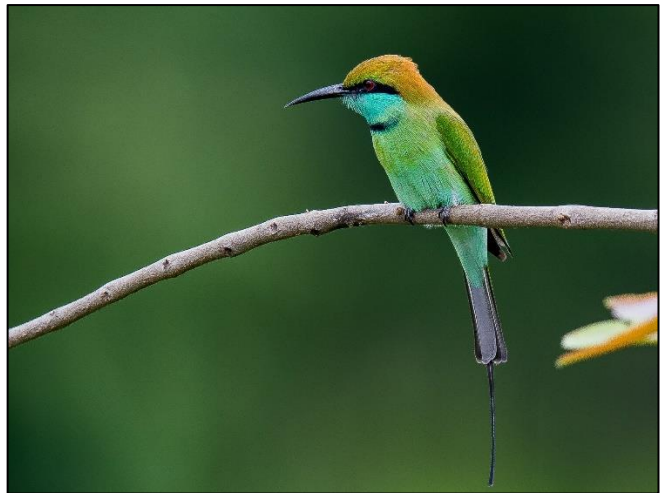
Green Bee-eater

The park's wonderful mix of low acacia woodland, gallery forest, open grassland and large, shallow pans were also host to Asian Elephant, Toque Macaque, Tufted Gray Langur, Indian Hare, at least a dozen Ruddy Mongooses, Wild Boar, Chital, Sambar, five Golden Jackals and Water Buffalo. The latter shared the water with Mugger Crocodiles, and we also spotted a few impressively large Bengal Monitors. We headed home with the sun already starting to set. It had been a fabulous day of wildlife viewing.