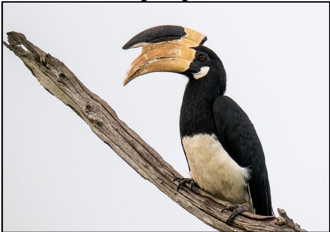
Malabar Pied Hornbill