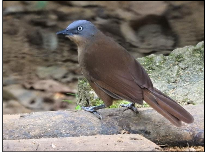
Ashy-headed Laughingthrush by Jim Watt

A lengthy session sitting in someone's house on the watch for Sri Lanka Spurfowl ( which most people had not seen ) proved fruitless in that pursuit, but our dedication was at least rewarded with excellent views of Indian Pitta, Sri Lanka Junglefowl, Ashy-headed Laughingthrush, a female Indian Blue Robin, and some were lucky enough to spy a Blue-throated Blue Flycatcher. And thanks to the park ranger, we also got to see Sri Lanka Frogmouth and a pair of lovely Serendib Scops Owls, the latter tucked away in a bamboo thicket up a steep slope. We're still not sure how the park ranger ever managed to find them in the first place, but we were thrilled he did!