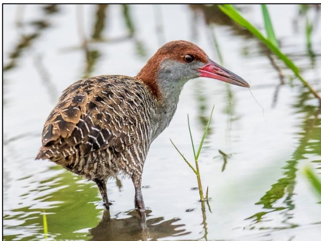
Slaty-breasted Rail

views of three Brown-headed Barbets, along with Rose-ringed and Layard's Parakeets.