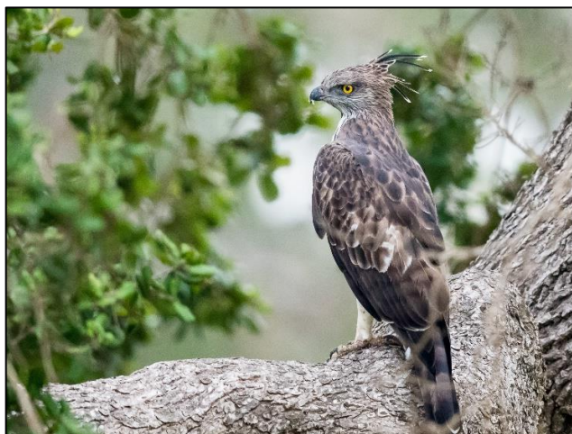
Changeable Hawk-Eagle by Dennis Braddy

We spent the whole of the next day in nearby Yala National Park, renowned for its Leopard population. Unfortunately, we didn't see any of these fine felines – a major traffic jam at a sighting of one rendered the task all but impossible – but there was lots else to see. Sri Lanka Junglefowl, 40+ Indian Peafowl, Black-necked Stork, Eurasian Spoonbill, Purple Heron, Crested Serpent Eagle, Changeable Hawk-Eagle, Grey-headed Fish Eagle, Barred Buttonquail, Great Stone-curlew, Yellow-wattled Lapwing, Pacific Golden Plover, Kentish and Greater Sand Plovers, gorgeous Sri Lanka and Orange-breasted Green Pigeons, Jacobin and Grey-bellied Cuckoos, Crested Treeswift, Little Swift, Indian Roller, Eurasian Hoopoe, Malabar Pied Hornbill, cartoon-like Alexandrine Parakeet, Sri Lanka Woodshrike, Common Iora, Small Minivet, Brown Shrike, Black-hooded Oriole, Indian Paradise Flycatcher, Jerdon's Bush Lark, Jungle and Plain Prinias, Oriental White-eye, Brahminy and Rosy Starlings, Indian Robin, Purple Sunbird, Baya Weaver, White-rumped, Scaly-breasted and Tricolored Munias, Richard's and Blyth's Pipits and a very unexpected Isabelline Wheatear – a first for a Rockjumper tour to Sri Lanka . A White-rumped Shama at one of the picnic spots certainly made