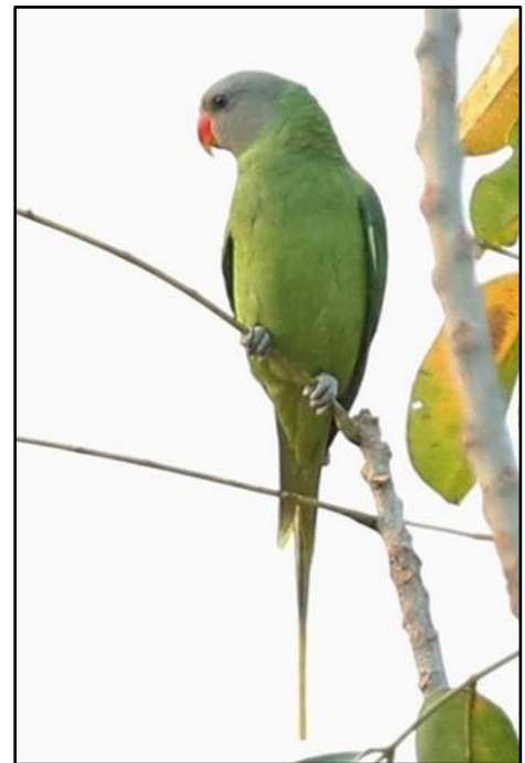
Grey-headed Parakeet by Alasdair Hunter

We also decided to stay out into the early part of the evening in search of owls and nightjars, which sadly produced rather little, other than brief views for some of Indian Nightjar. The remainder of our time was spent birding the various elevations of this incredible reserve in search of species we had yet to find. We spent the best part of the morning in the dry deciduous woodland, as this area tends to heat up faster than the higher, cooler mountain forests. For the most part, this woodland is rather quiet; however, our patience and dedication was eventually rewarded in fine style as we had knockout views of Black-headed Woodpecker. Other species also seen in this zone included the tiny Collared Falconet, Black Baza, Red-billed Blue Magpie and