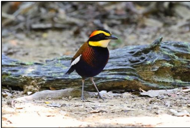
Malayan Banded Pitta