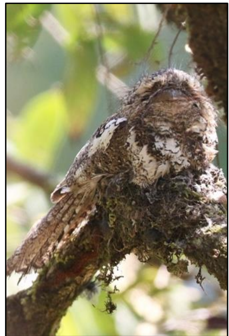
Hodgson's Frogmouth by Alasdair Hunter

Doi Lang was the northern-most point on our route and is situated right on the border with neighbouring Myanmar. Here we would base ourselves at the nearby town of Fang, which would give easy access to the birding sites that we were set to visit over the next few days. Our first morning on Doi Lang immediately got the juices flowing as we picked up a covey of Mountain Bamboo Partridge feeding in the road for several minutes. After this initial burst of excitement, the floodgates literally exploded as quality bird after quality bird revealed themselves to our delighted eyes! Rufous-gorgeted and Slaty-blue Flycatchers, White-bellied Redstart, Rusty-cheeked Scimitar Babbler, White-browed Laughingthrush, Siberian Rubythroat, Spot-breasted Parrotbill, Giant Nuthatch, Slender-billed and Maroon Orioles, Hodgson's Frogmouth on a nest, Crested Finchbill, Black-throated Bushtit, Brown-breasted Bulbul, Scarlet Finch, Stripe-breasted Woodpecker, Ultramarine and the delicate White-gorgeted Flycatcher, Rufous-bellied Niltava and Crested Bunting all put in fabulous appearances. In the afternoon, we staked out an area where Mrs Hume's Pheasant sometimes comes to feed and after a fairly lengthy wait, we were treated to some of the most extraordinary views imaginable. This is without a doubt one of