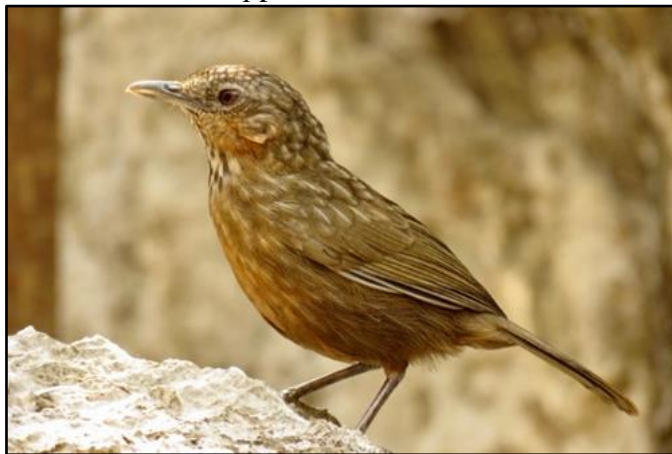
Limestone Wren-Babbler

The next morning entailed an early start, so we could be at Huai Hong Krai (King's Project) by daybreak to search of one of the most spectacular pheasants in the world: the rare Green Peafowl. As it turned out, we were treated to fantastic views of at least 9 birds during our time here! We also enjoyed good looks at a pair of Golden-fronted Leafbirds before making our