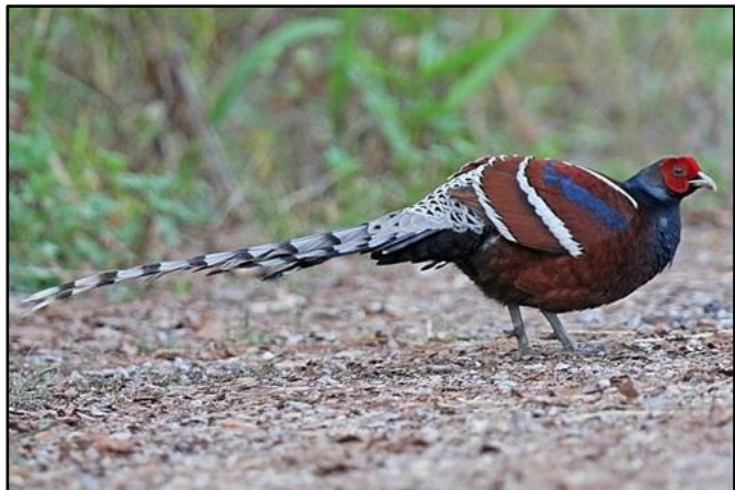
Mrs. Hume's Pheasant

We spent another two mornings birding on Doi Lang and during this time, we saw many of our “old friends” again, plus a host of new species. Some of the highlights included Crimson-breasted Woodpecker, Lesser Yellownape, Long-tailed Broadbill, incredible Rusty-naped Pitta, Burmese Shrike,