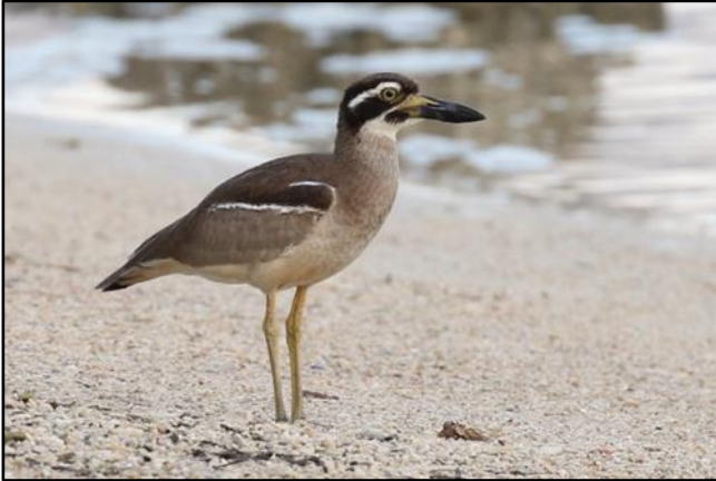
Beach Thick-knee

All in all, we enjoyed a remarkably successful tour that will probably always be remembered as ‘The Owl and Pitta’ tour, with an incredible ten species of owl and five species of pitta being seen well. Thank you to every single one of you for making it so special!