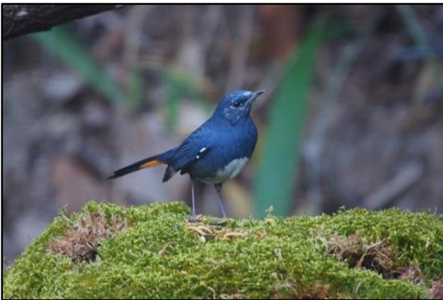
White-bellied Redstart