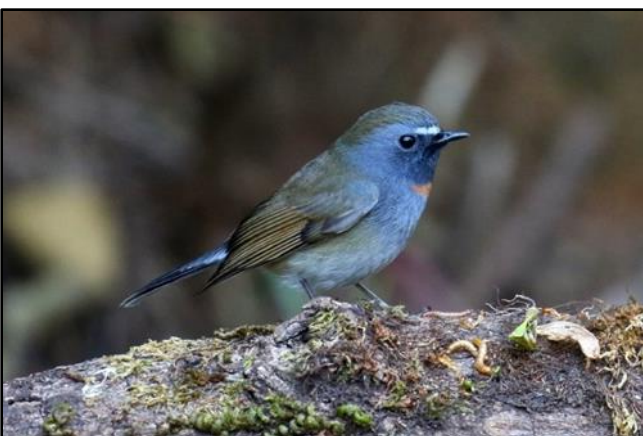
Rufous-gorgeted Flycatcher