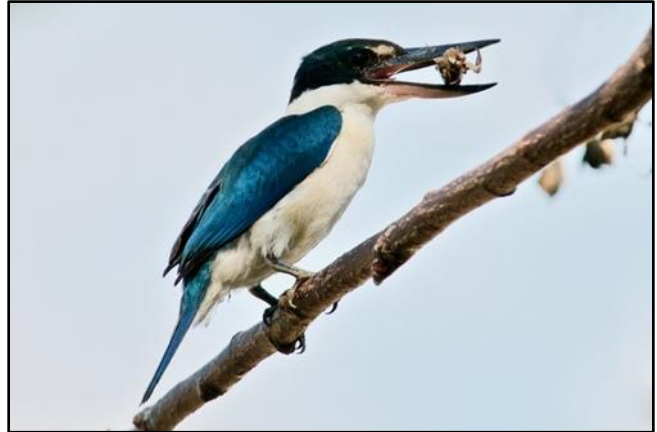
Collared Kingfisher