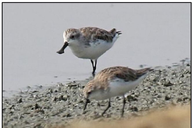
Spoon-billed Sandpiper

Our trip total of 548 species in 24 days proved, once again, that Thailand offers an incredible diversity of species on the Asian continent. Participants were treated to an amazing variety of star birds, including Mountain Bamboo Partridge, spectacular Silver Pheasant, Siamese Fireback, incredible Mrs Hume's Pheasant, Green Peafowl, Milky Stork, Black Bittern, Chinese Egret, Pied Harrier, Asian Dowitcher, Nordmann's Greenshank, Beach Thick-knee, Small Pratincole, Nicobar Pigeon, Spoon-billed Sandpiper, all 6 species of malkoha, Asian Emerald and Violet Cuckoos, 10 species of owl – including Mountains and Oriental Scops, Barred