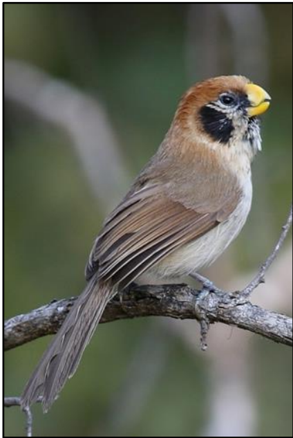
Spot-breasted Parrotbill by Alasdair Hunter

Black-backed Forktail. We then made our way back into the forests, where we enjoyed some close views of a female Silver Pheasant, Clicking and Black-eared Shrike-babblers, Mountain Tailorbird, Hill Prinia, Blue-winged Minla, Japanese White-eye, Small Niltava, Chestnut-crowned Warbler and the secretive Slaty-bellied Tesia. Later that evening, we ducked out for another try at Oriental Scops Owl.