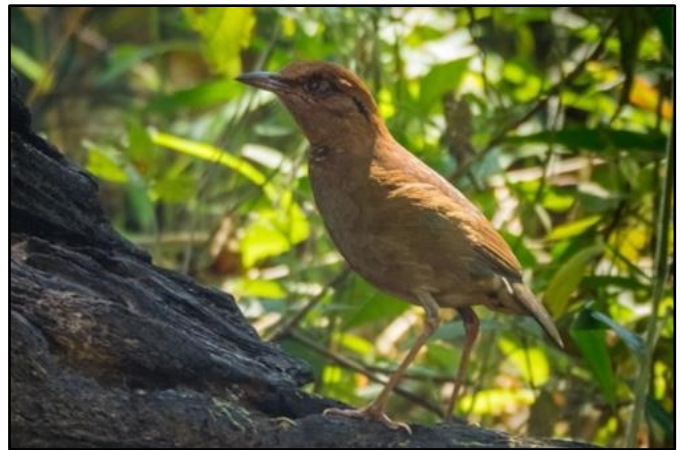
Rusty-naped Pitta

Our final morning was especially productive, as we finally managed to track down the increasingly rare Red-crowned Barbet while also getting superb views of Green Broadbill, which had also successfully given us the ‘run around’ for the past 2 days! Others, such as Ferruginous, Moustached, Chestnut-winged and Short-tailed Babblers, Grey-cheeked and Yellow-bellied Bulbuls, male Chinese Blue Flycatcher and the gorgeous Banded Kingfisher, were also enjoyed. In the afternoon, we made our way across to Phang Nga, where we were going to be based for two nights. On the way, we stopped in at an area of mangroves that has wonderful access via a boardwalk. It took us