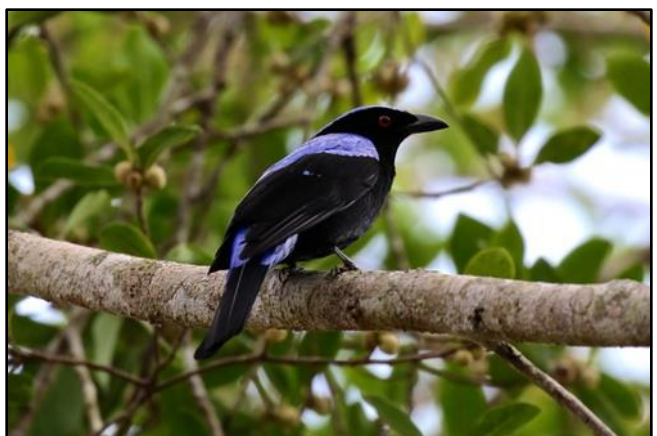
Asian Fairy-bluebird