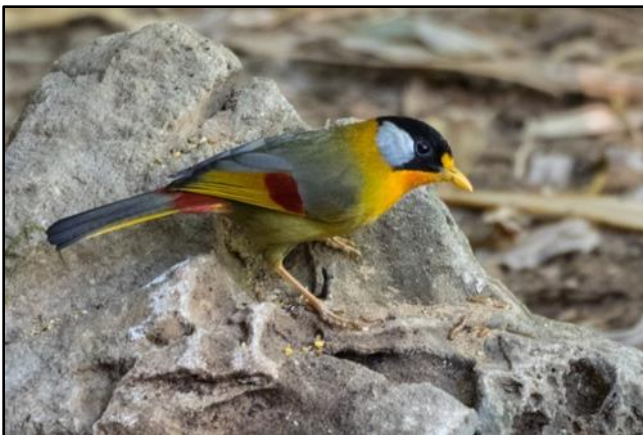
Silver-eared Mesia