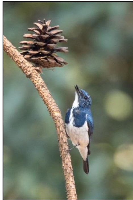
Ultramarine Flycatcher

Our time on Doi Angkhang was filled with a wonderful variety of specials. Species that we particularly enjoyed seeing included Bay Woodpecker, White-necked Laughingthrush, Scarlet-faced Liocichla, Bianchi's and Buff-throated Warblers, Golden, Spot-throated and Grey-throated Babblers, Black-breasted Thrush, Hill Blue Flycatcher, White-tailed Robin, White-rumped Munia, Spot-winged Grosbeak and Common Rosefinch. The nearby Kings Project always seems to produce some interesting species and this trip was to be no different: with our time here yielding