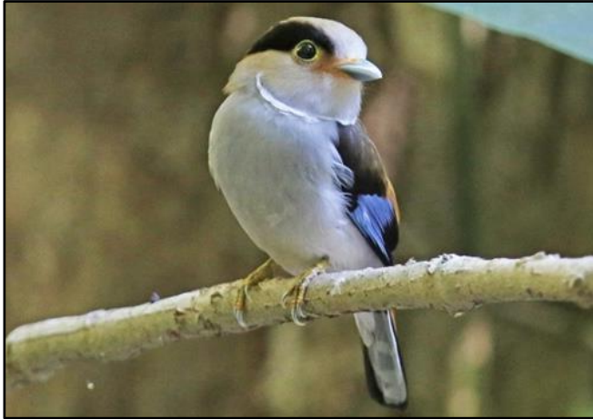
Silver-breasted Broadbill by Alasdair Hunter

visited a number of different sites in search of the many specialities that can be found in this area. With careful scanning, our targets soon began to reveal themselves and we enjoyed superb views of the highly sought-after Spoon-billed Sandpiper, Red-necked and Long-toed Stints, Great Knot, Broad-billed Sandpiper, Eurasian Curlew, Bar-tailed and Black-tailed Godwit, Spotted Redshank and Little Tern. At another nearby site, some dedicated scoping eventually revealed a single Asian Dowitcher while Javan Pond Heron, Ruff and Temminck's Stint were also seen. A short boat trip out to a beautiful sandbar then produced the striking Malaysian Plover, "White-faced" Plover ( currently a distinctive race of Kentish Plover ), two Chinese Egrets and Black-naped Tern.