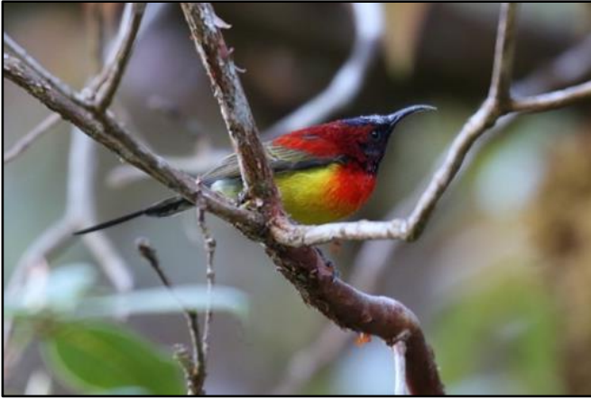
Mrs Gould's Sunbird

way to Doi Inthanon. A couple of stops along the way at some rice paddies produced a stunning male Pied Harrier, Pin-tailed Snipe, Black-collared Starling and Grey-faced Buzzard. We then had the remainder of the afternoon to start exploring the lower and mid elevation slopes of Doi Inthanon. This proved to be highly productive as we added some real specials to our list, including Yellow-cheeked