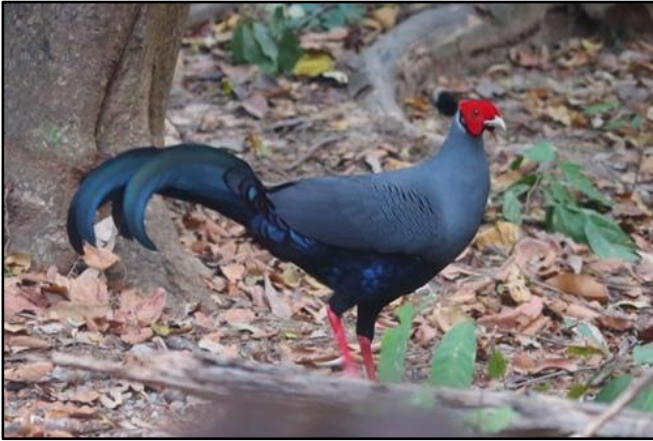
Siamese Fireback

birding point of view, and we were not to be disappointed as a few hours of birding here during our final morning gave us Indian Stone-curlew, Collared Scops Owl, Green-billed Malkoha, Lanceolated Warbler, Taiga Flycatcher and Vinous-breasted and Rosy Starlings.