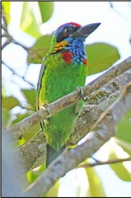
Red-crowned Barbet by Alasdair Hunter