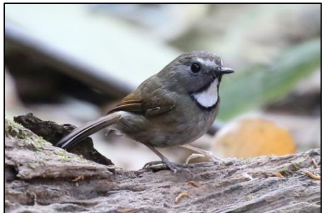
White-gorgeted Flycatcher