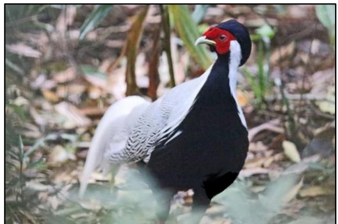
Silver Pheasant by Alasdair Hunter

In the afternoon, we made a brief stop at the Lam Phra Plerng Dam before we reached Khao Yai. Storms were brewing all around us but we still had time to pick up Cotton Pygmy Goose, Oriental Darter, Yellow Bittern, Western Osprey, Black-backed Swamphen, Bronze-winged Jacana, Plaintive Cuckoo, Lesser Coucal and the striking Crested Treeswift. The rain eventually did come down with some force, so we packed up shop and made our way through to Khao Yai, picking up Brown-backed Needletail at the edge of the storm clouds on the way.