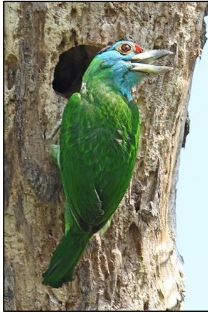
Blue-throated Barbet by Alasdair Hunter