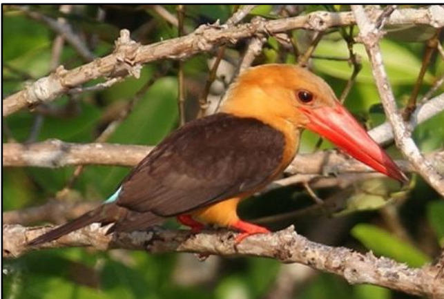
Brown-winged Kingfisher by Alasdair Hunter