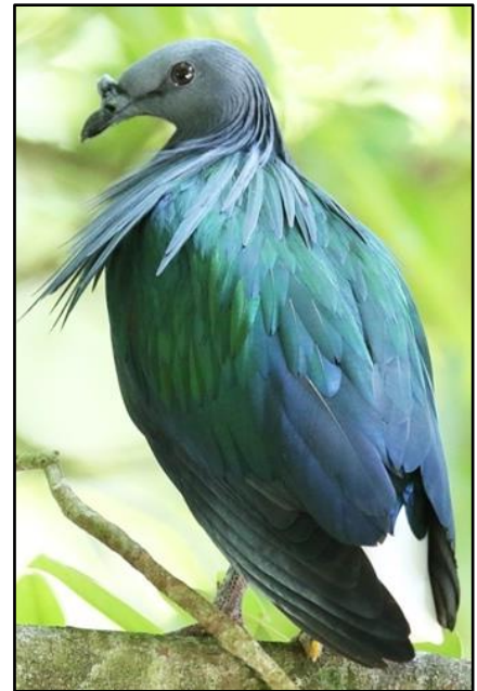
Nicobar Pigeon

The next site on the agenda was Sri Phang Nga National Park, a fairly recent addition to our Thailand birding route . Here we scoured the beautiful forests and cool forest streams for whatever specials we could find. The early morning produced wonderful views of Crimson-winged Woodpecker, Great Hornbill and Red-billed Malkoha before we heard a Red-bearded Bee-eater calling. We were all very keen on seeing this special; however, we were initially flummoxed as the bird in question had no red beard. The bird sat calling to us for an extended period of time and we enjoyed great views of what turned out to be a juvenile Red-bearded Bee-eater. We also enjoyed some fabulous views of Bushy-crested Hornbill, Blue-winged Leafbird and Green Iora. Heading into deeper forest, some of the group were fortunate enough to see the shy Chestnut-naped Forktail, but the star bird for this park, and indeed one of Thailand's finest, was still waiting for us. The species in question was the magnificent Malayan Banded Pitta and we had extraordinary views of this stunning bird for an extended period of time. Definitely one of the tour highlights! In this same zone, we also enjoyed great views of White-rumped Shama and Abbott's Babbler.