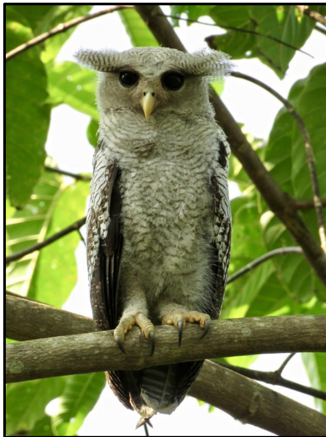
Barred Eagle-Owl