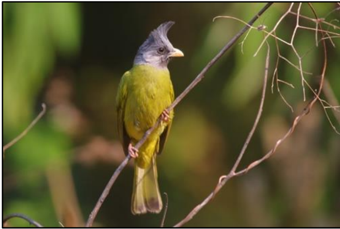
Crested Finchbill by Keith Valentine

fabulous views of White-tailed Robin, Black-breasted Thrush, Hill Blue Flycatcher, Fire-breasted Flowerpecker, Spot-winged Grosbeak and Mrs Gould’s Sunbird, to name just a few.