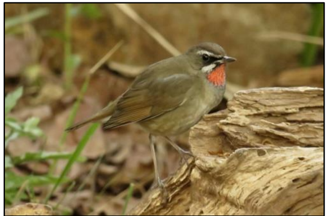
Siberian Rubythroat by Polly Neldner