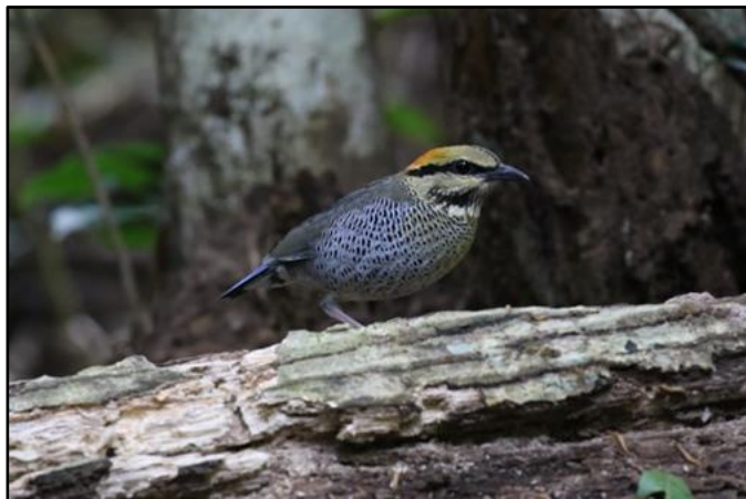
Blue Pitta

Khao Yai is one of Thailand's most well-renowned reserves, largely due to its fairly close proximity to Bangkok, and is a favourite amongst locals. It is also regarded as one of Thailand's premier birding sites and, once again, it produced a mouth-watering array of specials during our time here. The stunning Silver Pheasant is one of the park's most special birds, and we were treated to amazing views.