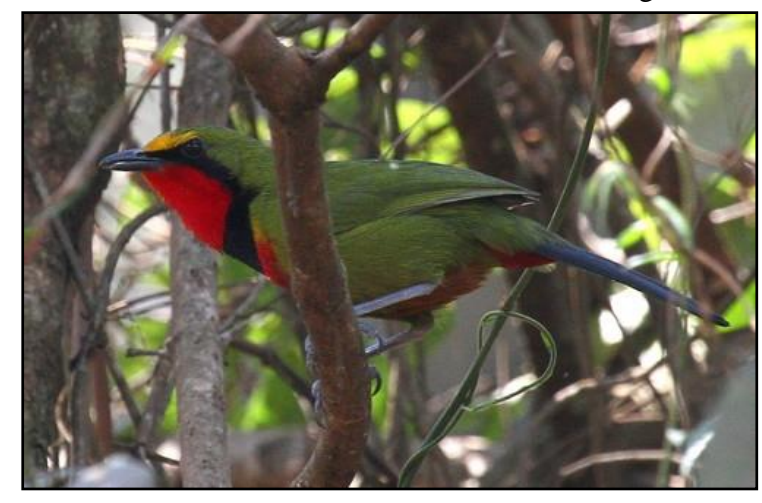
Gorgeous Bushshrike by Daniel Keith Danckwerts

The following day was the longest travel day of the trip, amounting to about 12 hours of straight driving. However, a quick break in the woodlands surrounding the town of