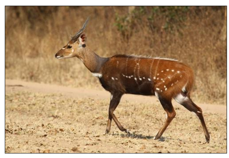
'Chobe' Bushbuck

Thereafter, content with our morning's birding thus far, we returned to Choma for a quick lunch break and an afternoon rest. En route we stopped for African Yellow Warbler in a damp hollow, which was fast seen well by all, as Lesser Striped and Redbreasted Swallows flew above our heads. Returning to the Nkanga River Conservancy in the afternoon, we visited a working farmyard where Wood Pipit, Yellow-fronted Canary, a wonderful pair of Cabanis's Bunting, and Miombo Blue-eared Starlings were found feeding on leftover cattle-fodder.