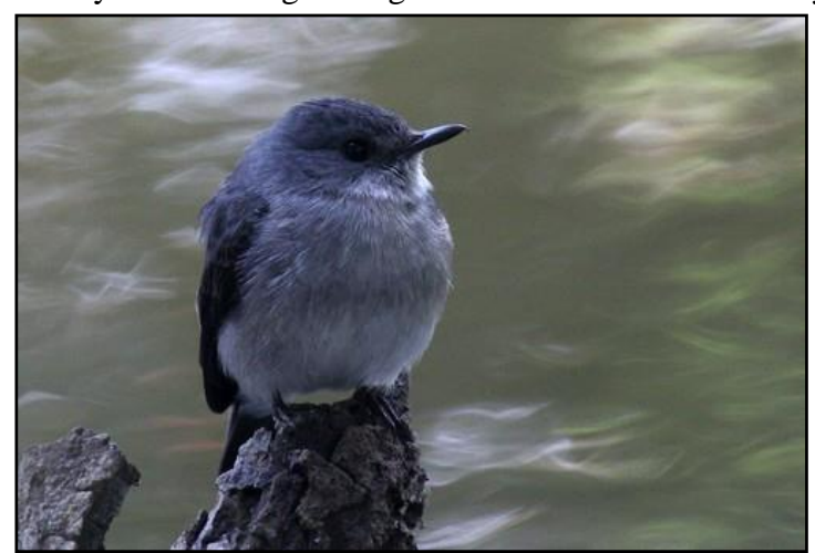
Cassin's Flycatcher by Daniel Keith Danckwerts

Greenshank, African Darter, Grey Heron, Saddle-billed Stork, Malachite and Pied Kingfishers, and African Jacana. A few Hippopotami were also lazing about on the shore, offering our best views yet; while a mixed kettle of vultures soared overhead. Several of these birds were landing nearby, but we can only speculate as to whether there was a predator kill site. A covey of Crested Guineafowl was spotted in the lakeside thickets together with a Bushbuck, and a heard of African Elephants moved near the water as they drank. Things then grew slow in the heat of the day, though several White-headed Vultures soared