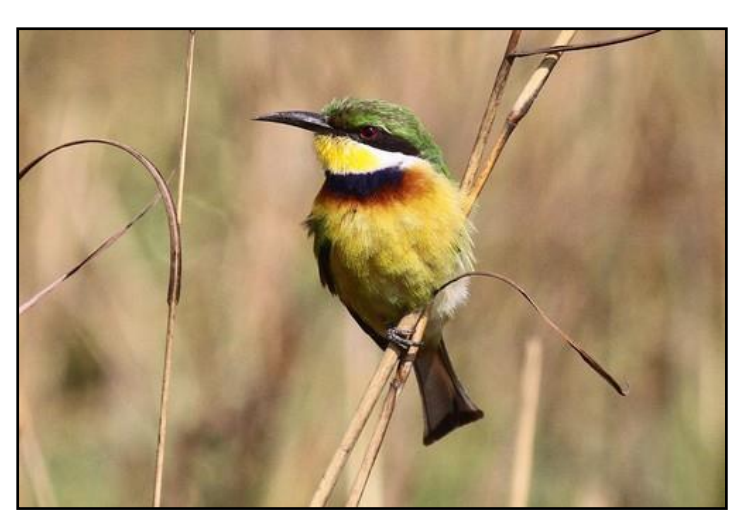
Blue-breasted Bee-eater

From Mwinilunga, we headed northeast towards the Kalwelwa Forest district, on the border of the Democratic Republic of Congo, where we spent the next two full days. The forests were absolutely alive with bird activity, and we easily found Blue Malkoha, Splendid Starling, Bannerman's and Variable Sunbirds, Blue-breasted and White-bellied Kingfishers, Narina Trogon, African Broadbill, three species of forest pigeon (Western Bronzenaped, African Olive, and Afep), Cabanis's Greenbuls, Brown-headed Apalis, noisy groups of Yellow-throated Leaflove, Least