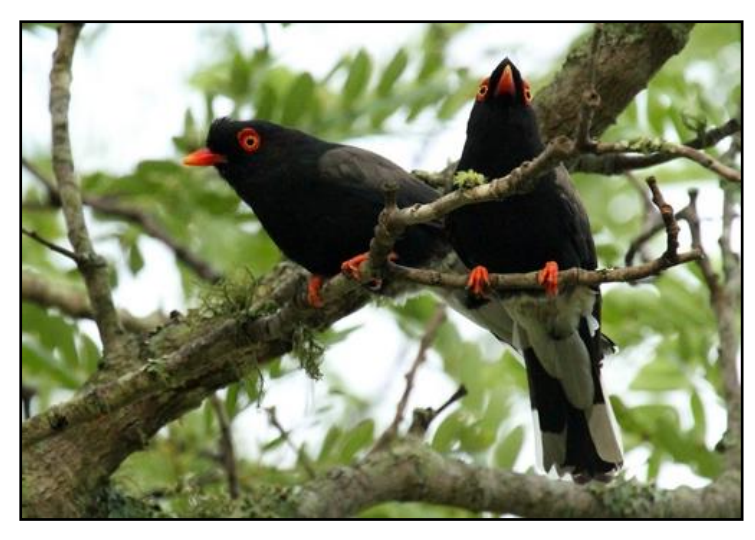
Retz's Helmetshrikes

The tour began on the outskirts of the town of Livingstone, near to where Dr David Livingstone first happened upon the Victoria Falls (known locally as the Mosi-O-Tunya or 'the cloud that thunders') in 1855. Fuelled by the excitement of all things to come, and in spite of the jetlag, we wasted little time and were soon wandering through the grounds of our tranquil lodge. This short walk delivered some fantastic sightings – a most wonderful introduction to Zambia's wildlife – including a party of noisy Retz's Helmetshrike, the tricky Brown-backed Honeybird, a pair of