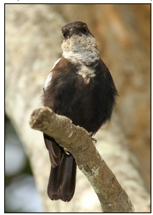
Arnott's Chat by Daniel Keith Danckwerts

and good numbers of the majestic 'Defassa' Waterbuck. Not forgetting the birds, the park also delivered several Copperytailed and Senegal Coucals, a pair of endangered Wattled Cranes, many Southern Red-billed Hornbills, loose colonies of White-browed Sparrow-Weavers, and some quick Crested Barbets. The top prize was a small flock of Black-cheeked Lovebird – Zambia's second endemic bird species – attending a drinking pool. We arrived at our incredible lodge at dusk, where we were treated to a rare Honey Badger sighting. Following a homely dinner we took a short walk around camp, adding African Scops Owl and African Barred Owlet in the parking area, followed by a quick night drive that produced Common Duiker, Springhare, a surprise Four-toed Sengi, and a handful more Fiery-necked Nightjars. Content with our day's success, we retired for the evening to a chorus of African night sounds.