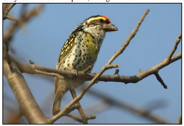
Miombo Pied Barbet by Daniel Keith Danckwerts

Here we also observed a number of Bushbuck (of the striking ornatus race, sometimes also referred to as 'Chobe' Bushbuck), some of which seemed almost tame! A block of mature miombo woodland then delivered the rare and unobtrusive Miombo Pied Barbet, which eventually gave unimaginable views as it called continuously from the mid-strata. A pair of Black-eared Seedeaters were also welcomed, a single Racket-tailed Roller showed briefly, and our first Arnott's Chats were scoped as they foraged through the open understorey. We then moved to a nearby thicket, where we located Bearded Scrub Robin and Grey-backed Camaroptera, though African Broadbill was heard displaying just outside of reach and was