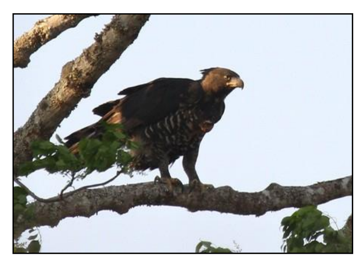
Crowned Eagle

Much to our excitement, a Leopard was spotted walking beside the river, and we enjoyed prolonged views as he marked territory and totally ignored the alarm calls of the abundant Puku. In terms of the birds, we found our first melodic Miombo Scrub Robin, a pair of confiding Familiar Chat, the jewel-like Collared Sunbird, a pair of Chinspot Batis, Golden-tailed Woodpecker, noisy flocks of Trumpeter Hornbills, Common Scimitarbill, and Swallow-tailed Bee-eater. A bit of spotlighting on the way back in from our drive also yielded Southern Lesser Galago, albeit at quite a distance. To end this absolutely incredible day, we enjoyed some spectacular South African-style hospitality and a truly scrumptious dinner.