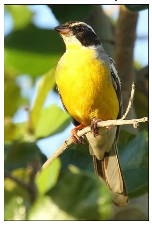
Cabanis's Bunting by Daniel Keith Danckwerts

The following day began with yet another walk through the mature miombo woodlands that surround Forest Inn. We once again located an active bird party, containing a single Southern Hyliota, several striking Yellow-breasted Apalises, an incandescent male Red-headed Weaver at his nest, several drab Yellow-throated Petronias, a confiding Stierling's Wren-Warbler ( finally !), Trilling Cisticola, Red-capped Crombec, a pair of wonderful White-breasted Cuckooshrikes, Golden-breasted Bunting, Brown-backed Honeybird, and a small flock of Crowned Hornbills. It was an awesome addition to also see a female Chinspot Batis on her little cup nest, positioned just below the canopy, as well as the unique nest of a small family group of Grey Penduline Tits. In a more open area of woodland, bordering some grassland, we then found an incredible pair of