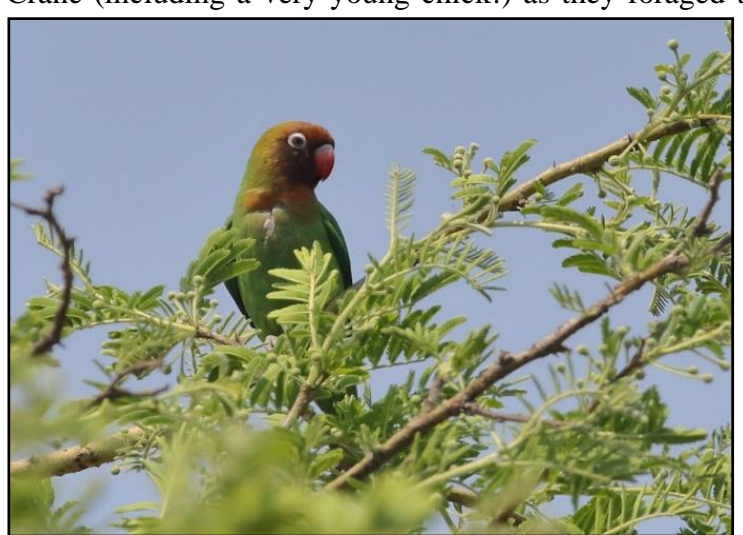
Black-cheeked Lovebird by David Hoddinott

Bushshrike, another calling African Barred Owlet, and a single Natal Spurfowl. The beautiful songs of White-browed Robin-Chats echoed all around us, as if to celebrate the new day and to share in the excitement that we all felt. We then loaded up and began the extended game drive towards the central regions of the Kafue National Park. Soon after leaving, we stopped to watch a family group of Wattled Crane (including a very young chick!) as they foraged through an extensive wetland. It was in these