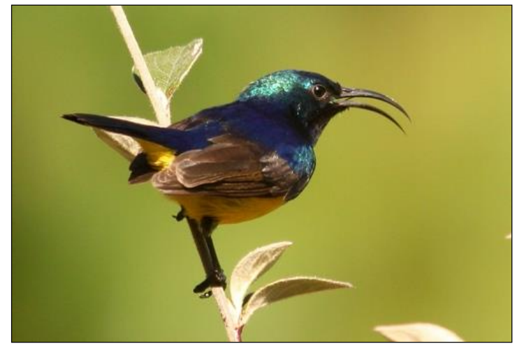
Variable Sunbird

throated Leafloves arrived to bid us farewell. The Chimfunshi Wildlife Sanctuary, one of the largest and oldest Chimpanzee rehabilitation centres in the world, was then a valuable and appreciated break from the driving, though we unfortunately never had the opportunity to visit the animals. From a birding perspective, this site is one of the best places in the world to see the scarce and much-desired Sharptailed Starling. A quick drive along the entrance road yielded a small group of these incredible birds, one