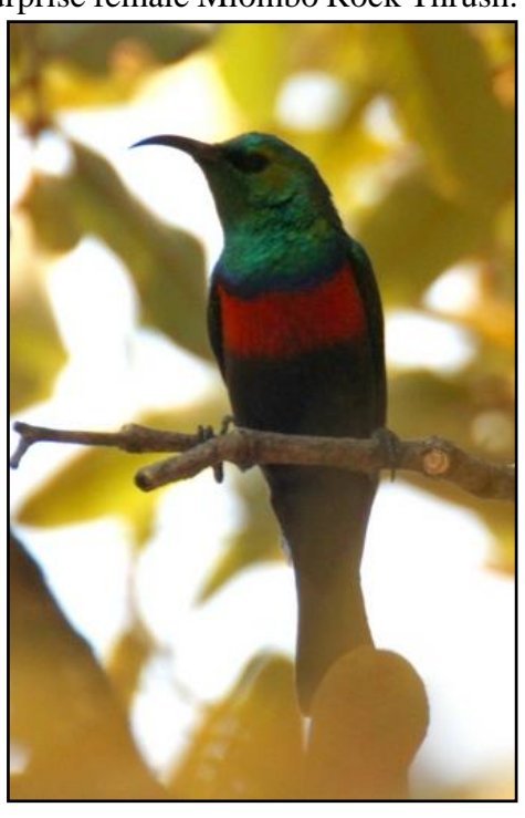
Shelley's Sunbird

Early the next morning, we set off towards the Nkanga River Conservancy, a small reserve comprising of at least four commercial farms. Much of the area is enclosed as a fenced game