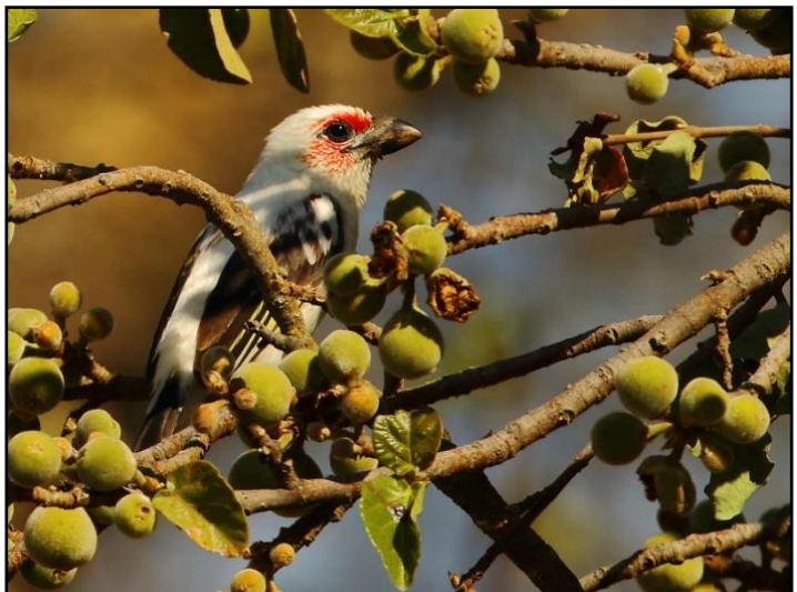
Chaplin's Barbet

farm, though a large portion is reserved for various crops (maize, soya, tobacco) and livestock (beef and dairy cattle, sheep). It was here that we found our first of Zambia's two endemic birds – the threatened Chaplin's Barbet. In the early morning light, three birds were seen sunning themselves atop a large