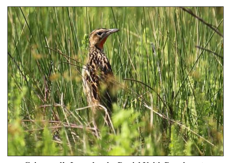
Grimwood's Longclaw

Kasempa delivered White-crested Helmetshrike, Pale-billed Hornbill, Miombo Wren-Warbler, Green-capped Eremomelas, Lanner Falcon, a single Bennett's Woodpecker, and Böhm's Spinetail. Our lunch break was then at the Mutanda Falls, which is little more than a small set of rapids, but the lush riverine vegetation here produced a noisy flock of Grey-olive Greenbuls, the drab Olive Sunbird, beautiful White-chinned Prinias, our first Blue-spotted Wood Dove of the trip, and a confiding Cassin's Flycatcher. Nearer the village of Lumwana, we stopped to observe a cloud of Red-throated Cliff Swallows at one of the few breeding sites in Zambia. We finally arrived in the town of Mwinilungu, exhausted but relieved to have caught up with our tight schedule following the unexpected vehicle malfunction.