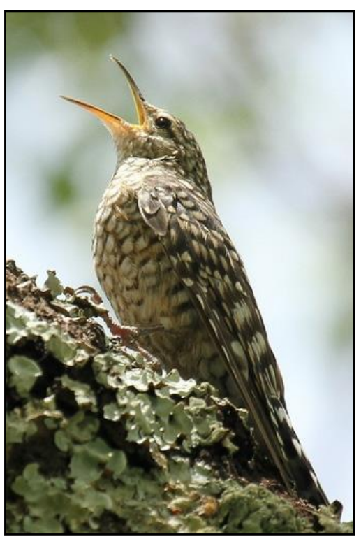
African Spotted Creeper by Daniel Keith Danckwerts

We left early the following morning, as we still had quite a distance to cover and there was an important birding stop along the way. As we loaded up, a party of three noisy Yellow-