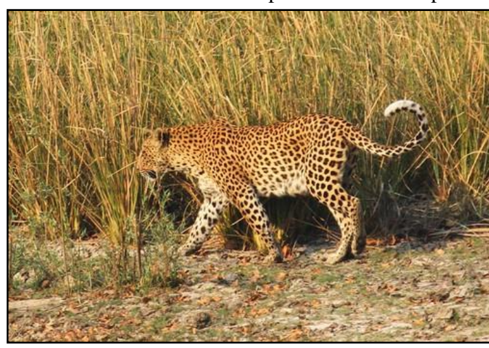
Leopard

Riverside vegetation around the pontoon over the Lubungu River delivered a small flock of Brown Firefinch, the emerald-green Klaas's Cuckoo, a Grey Tit-Flycatcher singing its almost inaudible song, White-browed Scrub Robin, Ashy Flycatcher, Brubru, and some flushed Water Thick-knees. We arrived at our lodge with enough time to spare for a late afternoon walk, followed by a quick drive.