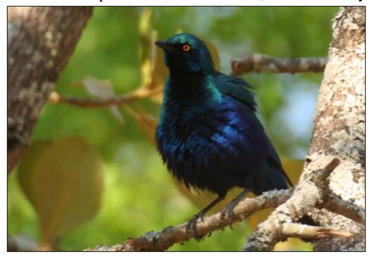
Miombo Blue-eared Starling

By noon, we had approached the extensive Lake Itezhi-tezhi, which feeds a hydroelectric plant further downstream. Here we found African Fish Eagle, Western Osprey, Common