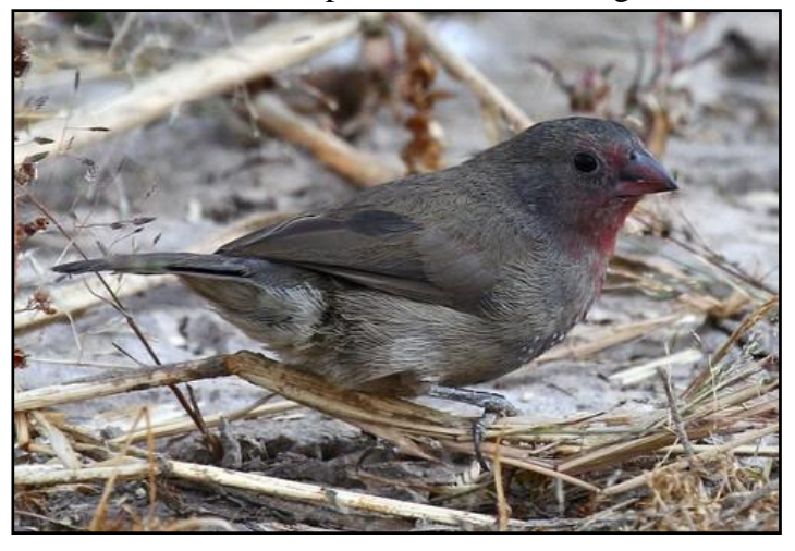
Brown Firefinch

one of the seven Natual Wonders of the World, and listed as a World Heritage Site, the views overlooking the falls were enough to leave us all breathless! We had the pleasure of watching the sunset through the 'Devil's Cataract,' a naturally cut line that marks the main channel of the Zambezi River as it plummets over 100m into the impressive Batoka Gorges below. Here we also saw some Red-winged Starlings, a