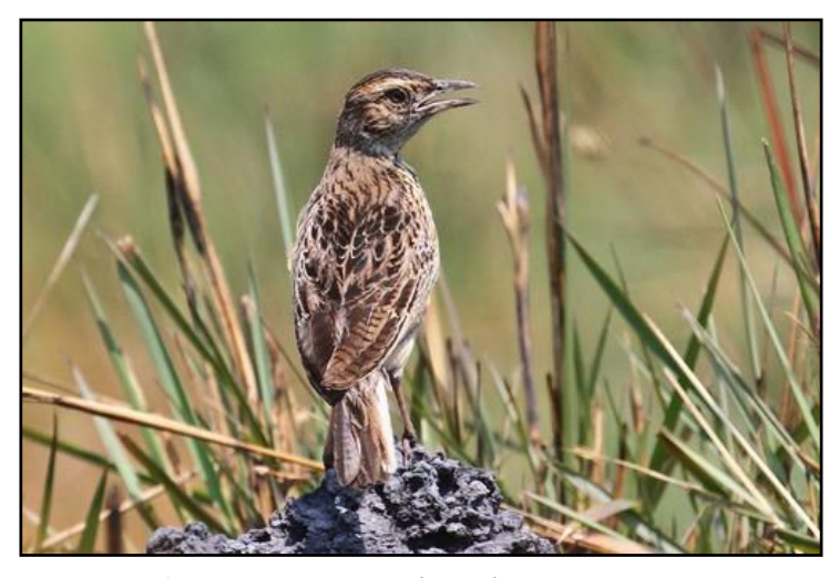
Angola Lark by Daniel Keith Danckwerts

Honeyguide, incomparable Ross's Turacos, White-chinned Prinia, Red-chested and Klaas's Cuckoos, Black Saw-wing, African Thrush, Yellow-rumped Tinkerbird, and nesting Dark-backed Weavers. As is the nature of forest birding, some species were only heard. These included Fraser's Rufous Thrush, the incredibly shy and secretive Spotted Thrush-Babbler, Shining-blue Kingfisher, a frustrating pair of White-spotted Flufftails, Olive Long-tailed Cuckoo, Tambourine Dove, Black-fronted Bushshrike, and Laura's Woodland Warbler.