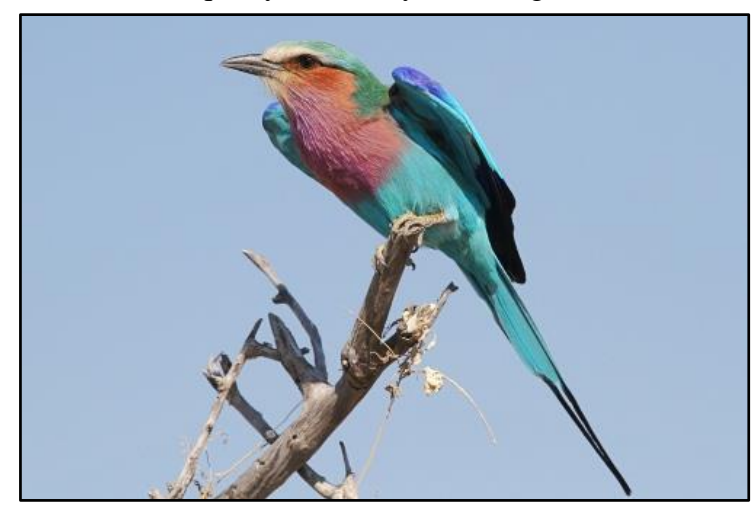
Lilac-breasted Roller by Daniel Keith Danckwerts

unfortunately nowhere to be found despite all our best efforts and perseverance through the heat of the day. The forests on the property delivered a quick pair of White-tailed Crested Flycatchers and Grey-olive Greenbuls, though calling Laura's Woodland Warblers and Bocage's Akalats proved totally unresponsive, and both species simply refused to come into view. The dambos produced calling Chestnut-headed Flufftails (one of Africa's most difficult birds to actually see), a melodic Moustached Grass Warbler, Marsh (Anchieta's) Tchagra, Croaking Cisticola, and Sooty Chat.