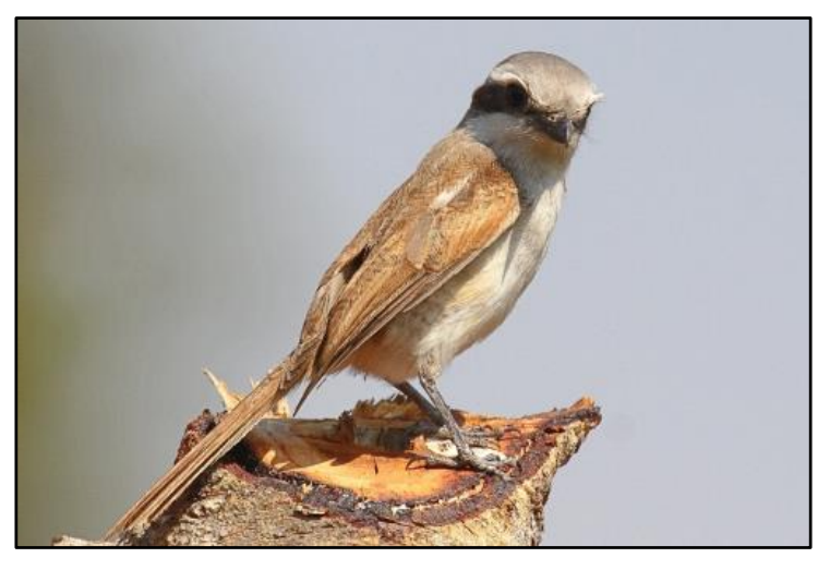
Souza's Shrike

Souza's Shrike, at least three Capped Wheatears, some quick Grey-rumped Swallows, and the much-desired Chestnut-backed Sparrow-Weaver near its nesting colony. We then left Forest Inn, continuing north towards the well-known Mutinondo Wilderness — our destination for the next two nights and the final site we'd visit on the tour. An Augur Buzzard on the drive was a welcomed addition to our list, as it was seen soaring low over the road.