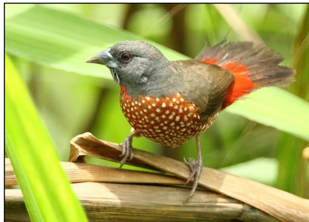
Brown Twinspot by David Hoddinott

magical sight! It took a bit longer to find the desired and stunning Grey Pratincole, but once we did we soon noticed dozens of them and they allowed good scope views. White-crowned Lapwing, Woolly-necked Stork, White-fronted Plover and a lone Spur-winged Goose were also in attendance. The surrounding area was productive and we quickly found a large flock of Preuss's Swallow, several Red-headed Quelea, a pair of Blue-headed Coucal, and then a magnificent Black-bellied Seedcracker which put on a great show. Leaving the river we found the splendid White-bibbed Swallow before making our way to the nearby forest. Although our visit was brief we picked up some great birds including Lizard Buzzard, Mottled Spinetail, the immaculate Chocolate-backed Kingfisher, Speckled Tinkerbird, obliging Western Nicator, Yellow-browed Camaroptera, and a Chestnut-breasted Nigrita drinking from a puddle in the road. The star sighting however was finding a calling Zenker's Honeyguide, a very rarely-seen species. Delighted with this, we set off to Kribi where we relished our lunch at the beach.