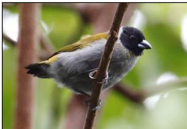
Shelley's Oliveback by Paul Ellis

Moving on to Campo Ma'an National Park, we enjoyed a fabulous two full day's birding in this superb lowland rainforest. After some recent rain the activity in the forest was good and we enjoyed many memorable sightings. Some of the star sightings included migrant European Honey Buzzard, Afep Pigeon, amazing scope views of Black-collared Lovebird, flocks of Grey Parrot, Great Blue Turacos (which put on a great show – at one time we had five individuals in a tree only thirty metres away!), Blue Malkoha, Sabine's and Cassin's Spinetail hunting overhead, Blue-throated Roller, Red-billed Dwarf, White-thighed and huge Black-casqued