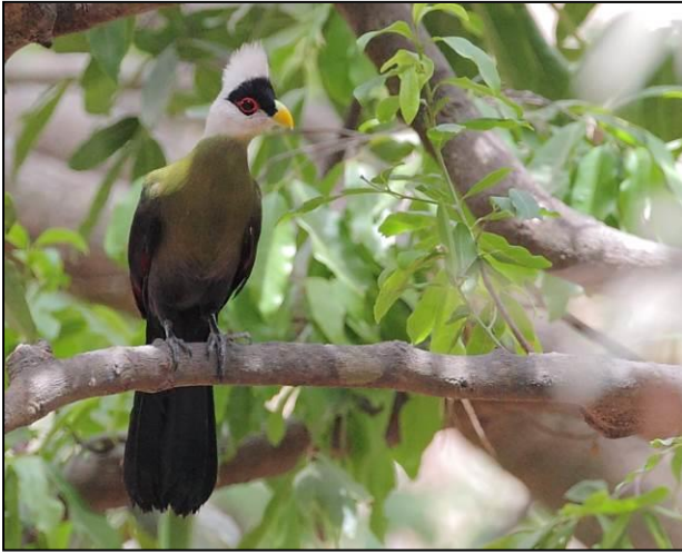
White-crested Turaco

Our next destination was Benoue National Park, where the major habitat consists mainly of Guinea Savannah that supports a wonderful diversity of species. A further feature of interest in the park is the