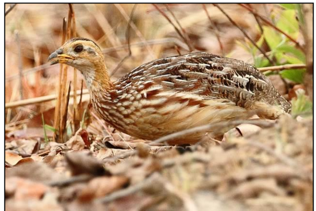
White-throated Francolin

Grey Woodpecker, beautiful and showy Brown-throated Wattle-eye, Yellow-throated Leaflove, Chattering Cisticola, Yellow-breasted Apalis, a host of sunbirds including Mangrove, Reichenbach's, Green-headed and Olive-bellied, Black-necked Weaver, Grey-headed Nigrita and dainty Black-crowned Waxbill. Thereafter we had time for a quick visit to a nearby wetland where we found African Pygmy Goose, African Darter and confiding Simple Greenbul. After a delicious lunch we stopped by a regular site for Rufous-vented Paradise Flycatcher, where we quickly found our