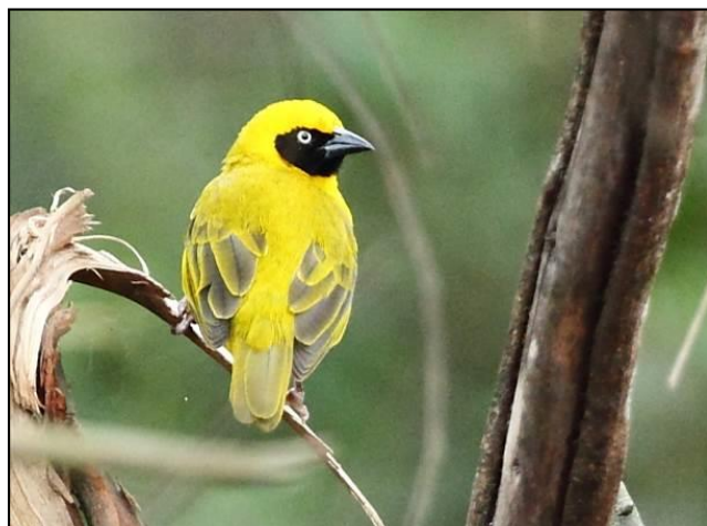
Bannerman's Weaver by David Hoddinott

Leaving the rainforest we next travelled to the Bamenda highlands, a lovely change from the hot and humid lowlands. En route we stopped at La Digue once more in search of the fabulous Carmelite Sunbird. It did not disappoint and we enjoyed superb views of a male, female and juvenile, as well as a fabulous pair of obliging Black Crake. Further along the journey a comfort stop yielded magnificent views of the often rather shy Brown Twinspot.