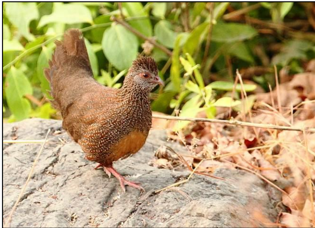
Stone Partridge

quarry. It was then time to head for the airport to catch our flight north to Garoua.