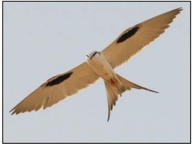
Scissor-tailed Kite

lazy Benoue River which, although very wide, supports just a trickle of water at this time of year. We enjoyed time exploring these areas and some of the highlights during our stay included family groups of Stone Partridge, a very cryptic White-throated Francolin, flocks of Abdim's and a lone Saddle-billed Stork, a fabulous White-backed Night Heron, Goliath Heron (rare in Cameroon), a pair of displaying African Hawk-Eagle, Senegal Thick-knee, smart White-crowned Lapwing, the highly sought-after Egyptian Plover, fantastic Four-banded Sandgrouse, rare Adamawa Turtle Dove, Senegal Parrot, stunning White-crested and Violet Turaco, a day-roosting African Scops Owl, Pearl-spotted Owlet, beautiful Abyssinian and Blue-bellied Rollers, Grey-headed