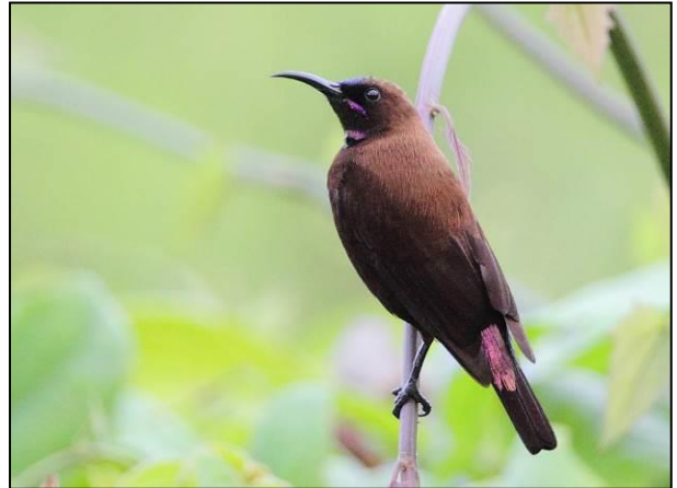
Carmelite Sunbird by David Hoddinott

Our tour started off with a morning visit to a small coastal patch of mangroves and gardens where we found a remarkable diversity of species. Some of the highlights included Blue-spotted Wood Dove, Blue-breasted and African Pygmy Kingfisher, a cute family of Little Bee-eaters, African Pied Hornbill, African