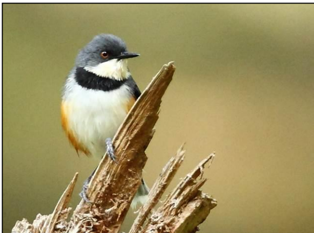
Black-collared Apalis

During our drives from Garoua to Benoue and back we recorded some great birds as well including