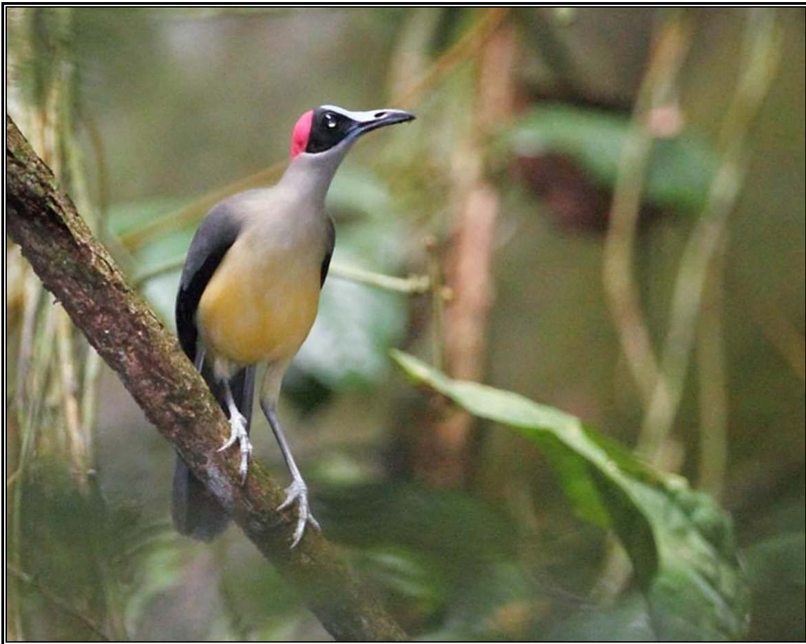
Grey-necked Rockfowl